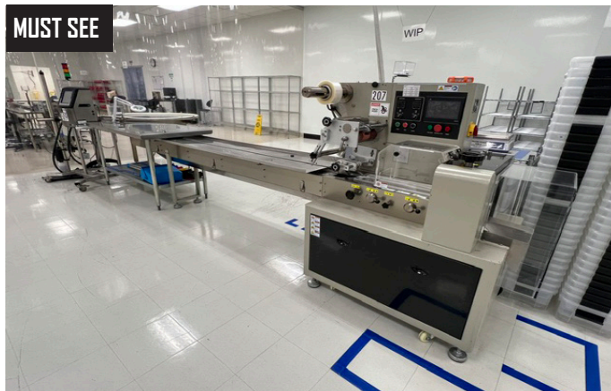
1 of 4) 2017 Excel Packaging Systems Inc. C-250 Flow Wrappers.