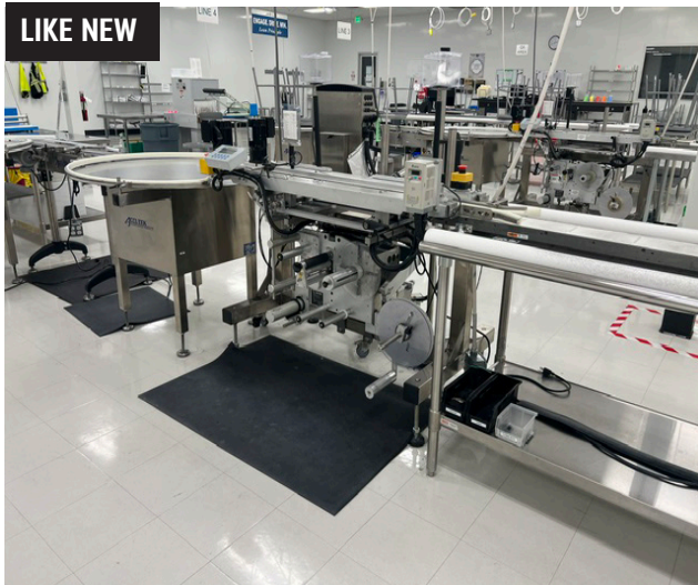
1 of 4) Label-Aire Inc. 3115NV-1500 7 12 RH 1.75PB SS Labeling Machines.