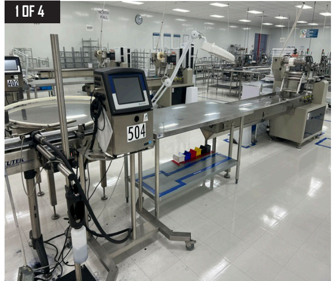
1 of 4) 2017 Excel Packaging Systems Inc. C-250 Flow Wrappers Systems.