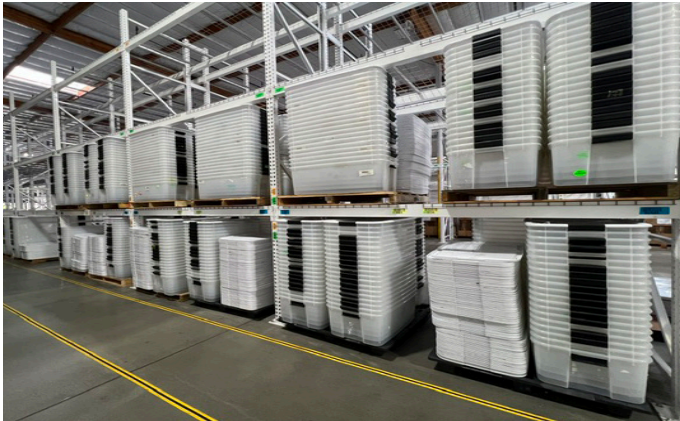
Very Large Quantity of Plastic Bins.