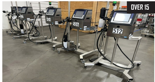
Over 15) VideJet 1560 Ink Jet Coding Machines.