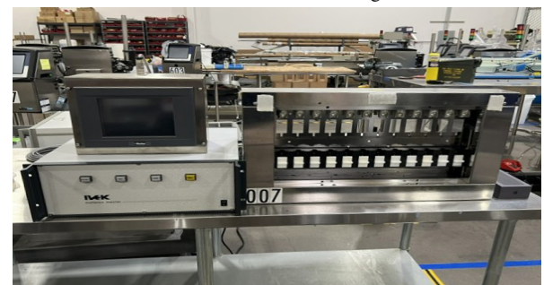
IVEK Multiplex Master Dispenser System.