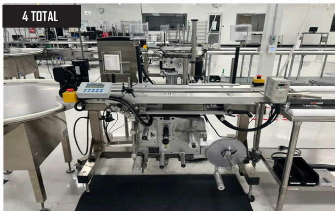
1 of 4) Label-Aire Inc. 3115NV-1500 7 12 RH 1.75PB SS Labeling Machines.