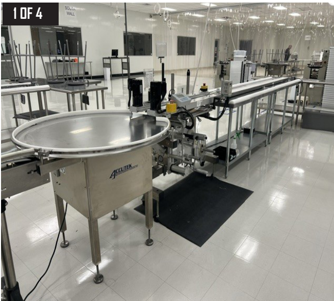
1 of 4) Label-Aire Inc. 3115NV-1500 7 12 RH 1.75PB SS Labeling Machines Systems.