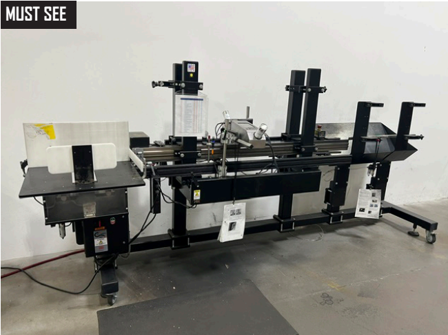
RL Craig Inc Conveyor and Material Handling System with QTY 2 VideJet 2351.