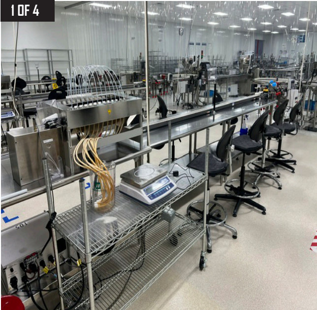
1 of 4) 2014 Multiplex Master Fluid Dispenser with Touch Screen Display, Model 520164-LF12BAAA.