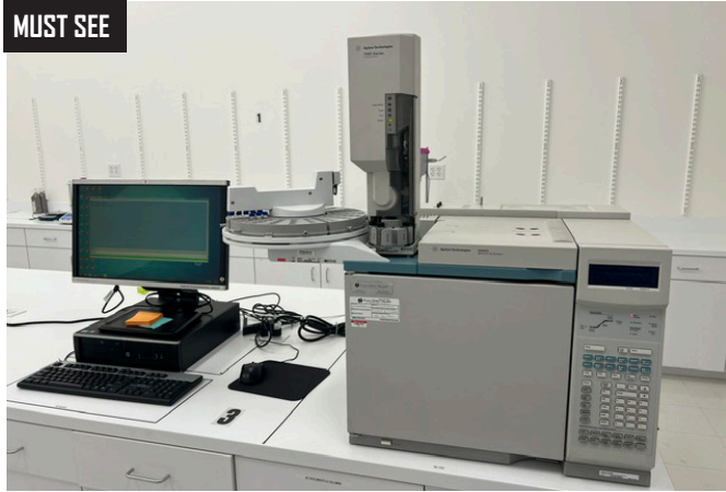
Agilent Technologies 6890 Network GC System SN CN10326022 w/ Agilent 7683 Series Injector SN US43021781 and Agilent 7683 Series Autosampler SN CN74446028 w/ Computer and Software.