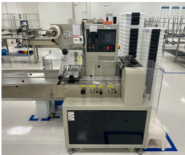
1 of 4) 2017 Excel Packaging Systems Inc. C-250 Flow Wrappers.