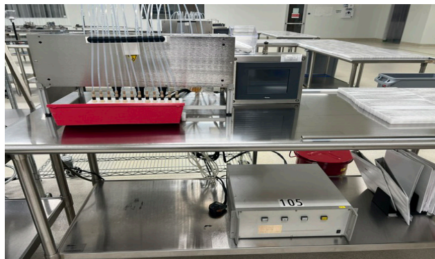
2014 Multiplex Master Fluid Dispenser with Touch Screen Display, Model 520164-LF12BAAA.