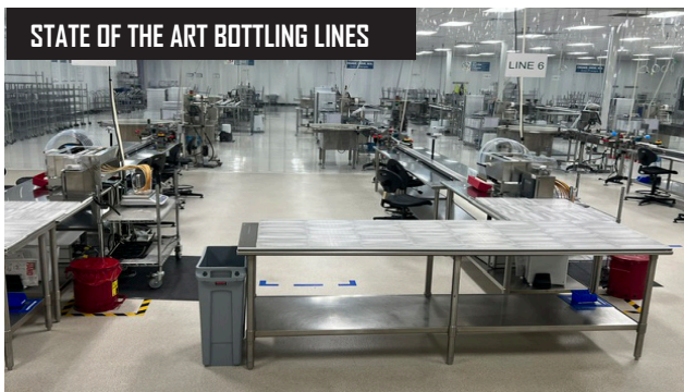
4 Total) E-Liquid Bottling Lines w/ Multiplex Master Fluid Dispenser Filling, Label Aire Labeling & Excel Packaging.