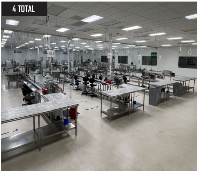
E-Liquid Bottling Lines w/ Multiplex Master Fluid Dispenser Filling, Label Aire Labeling & Excel Packaging.