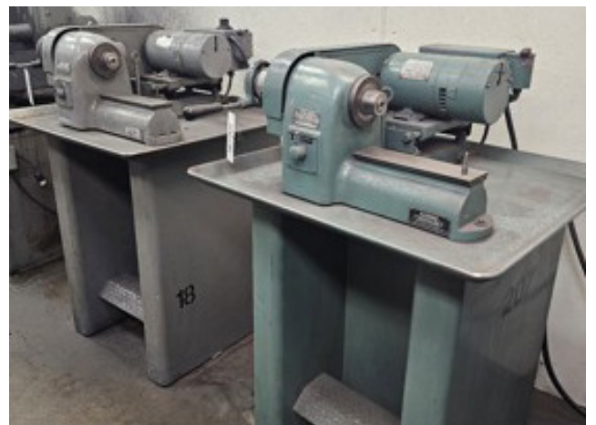
(2) Hardinge HSL Speed Lathes w/ 3-Speeds, 5C Collet Closer.