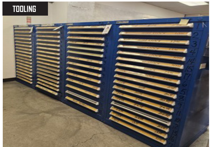
(4) 17-Drawer and (1) 14-Drawer Tooling Cabinets.