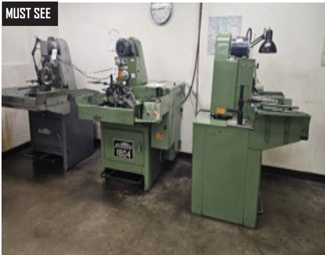
Sunnen Precision Honing Machines.