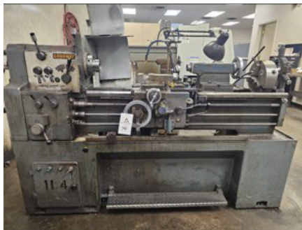
Goodway GW-1440 14" x 40" Geared Head - Gap Bed Lathe w/ 55-1800 RPM, Inch/mm Threading, Tailstock, Steady and Follow Rests, KDK Tool Post, Trava-Dial, 5C Collet Closer.