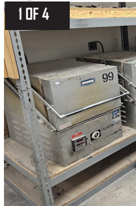
Cress C1228/942 25 Amp Electric Furnace.