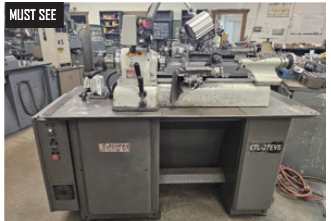
Cyclematic CTL-27 EVS Second OP Lathe w/ 0-4000 Dial RPM, Digital Speed Readout, Tailstock, Compound Cross Slide, 5C Collet Closer, Coolant. (4) Feeler FTL-27 Narrow Bed Second OP Lathes w/ 230-3500 RPM, Tailstock, Compound Cross Slide, 5C Collet Closer.