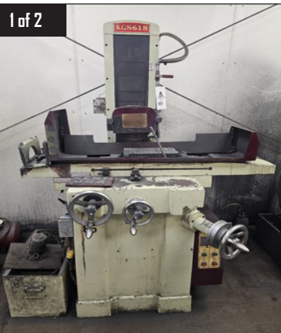
1 of 2 Kent KGS618 6" x 18" Surface Grinders w/ 2" x 12" Fine-Line Magnetic Chucks.