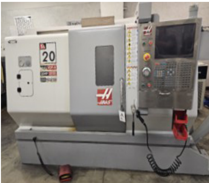
2007 Haas SL-20 CNC Turning Center s/n 3076924 w/ Haas Controls, Tool resetter, 10-Station Turret, Haas VOP-A, 20Hp Vector Dual Drive, Chip Auger, 8" 3-Jaw Power Chuck, Coolant