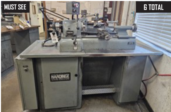
(6) Hardinge DV-59 / DSM-59 Narrow Bed Second OP Lathes w/ 230-3500 RPM, Tailstock, Compound Cross Slide, 5C Collet Closer.