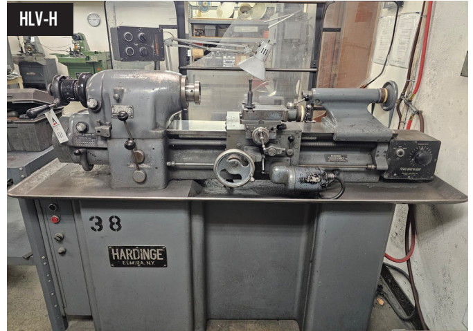
Hardinge HLV-H Wide Bed Tool Room Lathe w/ 125-3400 RPM, Tailstock, Power Feeds, Cross Slide, 5C Collet Closer, Coolant