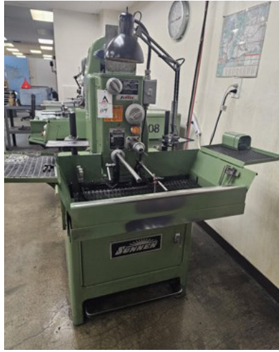
Sunnen MBB-1660 Precision Honing Machine s/n 89192 w/ Coolant.