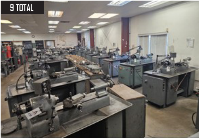
(9) Hardinge DV-59 Narrow Bed Second OP Lathes w/ 230-3500 RPM, Tailstock, Compound Cross Slide, 5C Collet Closer.