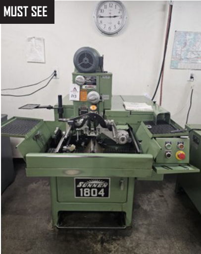
Sunnen MBC-1804 Precision Honing Machine s/n 89288 w/ Power Stroke, Coolant.