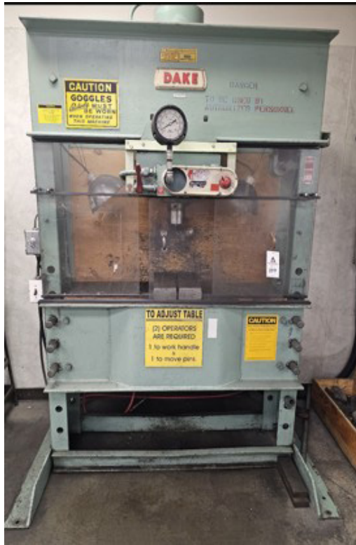
Dake mdl. 5-130 130 Ton Electric/Hydraulic H-Frame Press s/n 156973.