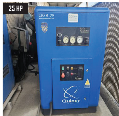
Quincy QGB-25 25Hp Rotary Screw Air Compressor