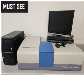
MUST SEE Horiba Jobin Yvon FluoroMax-4 Spectrofluorometer

INSPECTION : MORNING OF SALE FROM 8:00AM TO 11:00AM. "Live Webcast Online Only - No Onsite Bidding". "Bidding thru Bidspotter.com".