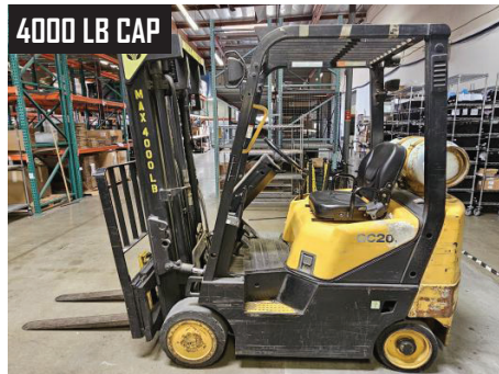
4000 LB CAP Daewoo GC20S-3 4000 Lb Cap LPG Forklift