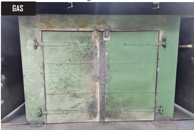
Calhoun & Poxon mdl. MC2-23030601 Gas Fired Drying Oven