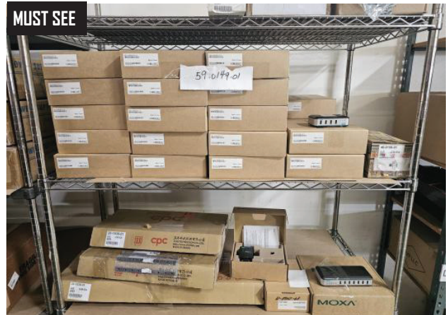
Large Quantity of MRO Products Including FLI Cameras, Motorized Lenses, Power Supplies, Lighting, Power Cords, Heating Elements, Switches, Fans, USP Ports and Switches