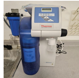
2016 Thermo Scientific Barnstead Smart2Pure 6UV/UF Water Purification System