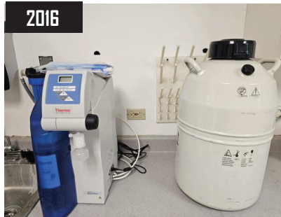
2016 Thermo Scientific Barnstead Smart2Pure Purification System and Millennium 2000 XC20 Liquid Nitrogen Dewer