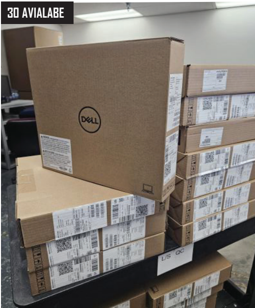
30 AVIALABE Dell Latitude 3140 Laptop Computers ***30 AVAILABLE NEW***