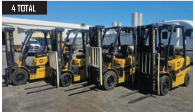
YALE 5000 LB. CUSHION AND PNEUMATIC TIRE LPG FORKLIFTS.