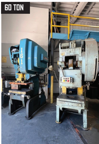
60 TON BLISS C60 60 TON OBI PUNCH PRESS AND MINSTER NO. 6 60 TON OBI PUNCH PRESS.