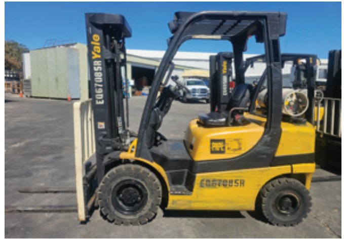
4) YALE GLC 50V 5000 LB. CUSHION AND PNEUMATIC TIRE FORKLIFTS, LPG, 3 STAGE, SIDE SHIFT.