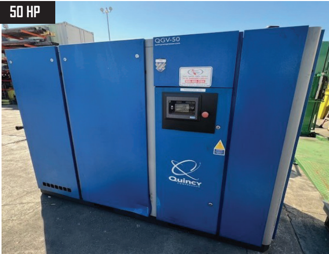
QUINCY QGV-50, 50 HP ROTARY AIR COMPRESSOR.

LARGE SELECTION OF BRIDGEPORT TYPE VERTICAL MILLS.