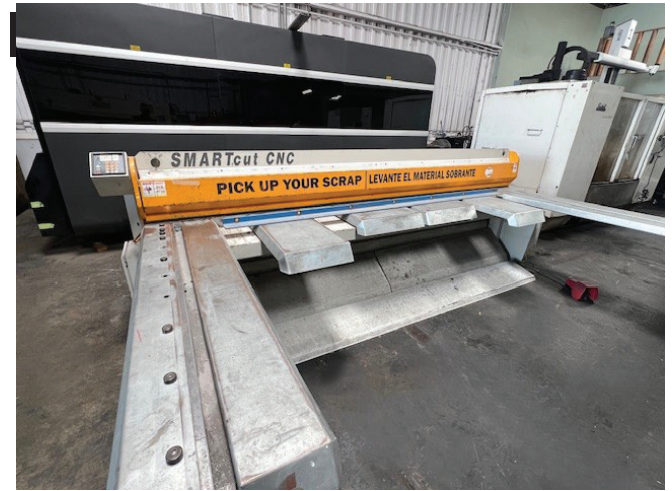
2006 MODEL RAS 52.30 SMART CUT CNC POWER SQUARING SHEAR, 10FT X 14 GA CAPACITY.