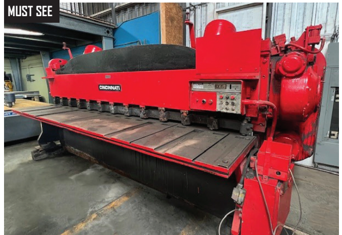
CINCINNATI 2CC12, 12 FT X 1/4" CAPACITY MECHANICAL POWER SHEAR W/ POWERED BACK GAGE, S/N 41389.