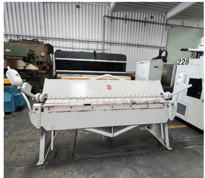
10FT BOX AND PIN BRAKE.