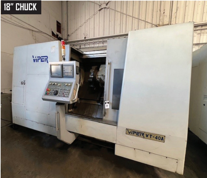
VIPER MODEL VT-40 CNC TURNING CENTER, 18" CHUCK, 12 STATION TURRET, TAIL STOCK,