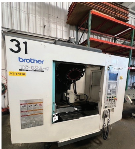
2001 BROTHER TC-S2A CNC DRILL AND MILL CENTER, W/ YUKIWA 5 AXIS INDEX TABLE.