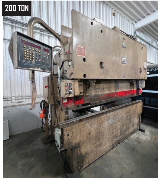
HTC MODEL 200-10, 10FT X 200 TON HYDRAULIC PRESS BRAKE, W/ AUTOGAGE CNC1000 BACK GAGE CONTROLS.