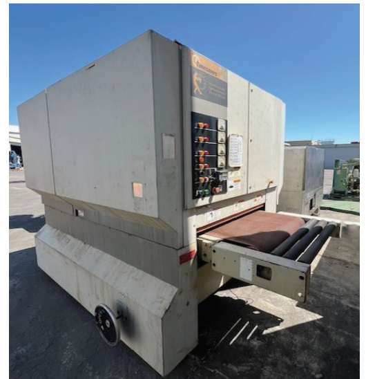
TIMESAVER 237-41C 4 HEAD WIDE BELT SANDER, 37" X 73" BELT SIZE, PNEUMATIC TRACKING, 30 HP FIRST HEAD, 25 HP SECOND HEAD, 20 HP THIRD HEAD, 20 HP FOURTH HEAD.