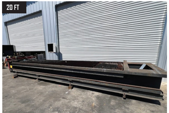
KOIKE ARONSON DM520 5FT X 20FT PLASMA CUTTING TABLE, W/ HYPERTHERM POWERMAX 65 PLASMA SYSTEM AND CONTROLS.