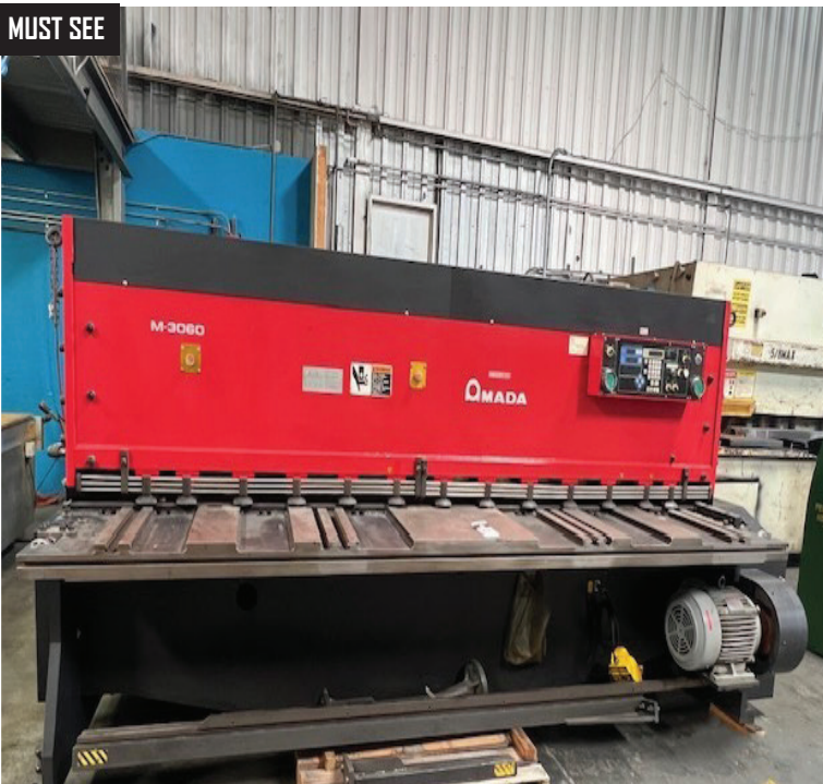
AMADA M-3060 10FT X 1/4" MECHANICAL POWER SHEAR W/ CNC BACK BACK GAGE, SQUARING ARM, FOOT OPERATED PEDAL.