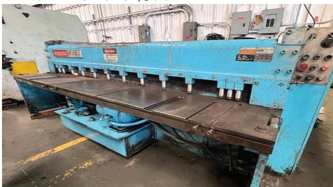
NIAGARA IF-10-14/ 10 FT X .25" HYDRAULIC POWER SHEAR, W/ POWER BACK GAGE.