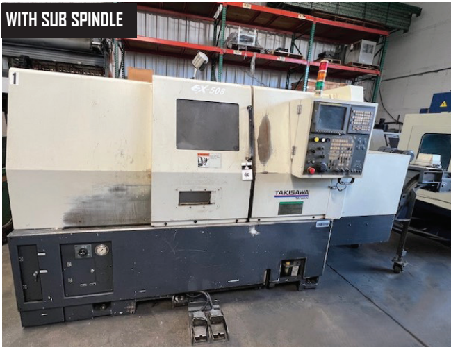
TAKISAWA EX-508 CNC LATHE W/ SUB SPINDLE, FANUC 181-TB CONTROL, 10 POSITION TURRET, 3 JAW POWER CHUCK, CHIP CONVEYOR.