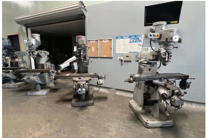
LARGE SELECTION OF BRIDGEPORT TYPE VERTICAL MILLS.