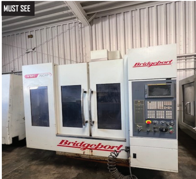
BRIDGEPORT XP3-760 CNC VMC, W/ 30 ATC, 40 TAPER, FANUC 181-MB CONTROLS, 30" X 24" X 24" (XYZ).

BRIDGEPORT XP3-760 CNC VMC, W/ 30 ATC, 40