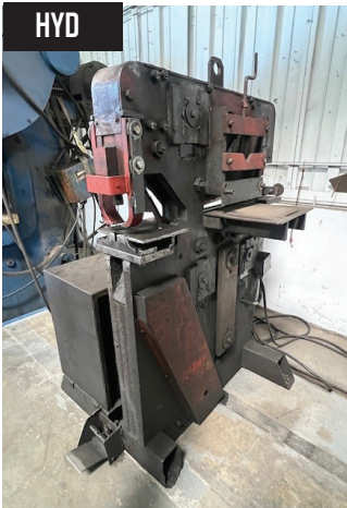
HYD EDWARDS 40 TON HYDRAULIC IRON WORKER.