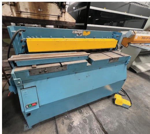
PEXTO 5212, 52" X 12 GA POWER SHEAR, W/ SQUARING ARM, FOOT PEDAL.