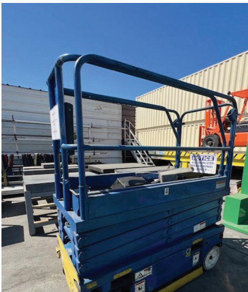
ELECTRIC SCISSOR LIFT.

TAKISAWA EX-508 CNC LATHE W/ SUB SPINDLE, FANUC 18I-TB CONTROL, 10 POSITION TURRET, 3 JAW POWER CHUCK, CHIP CONVEYOR.