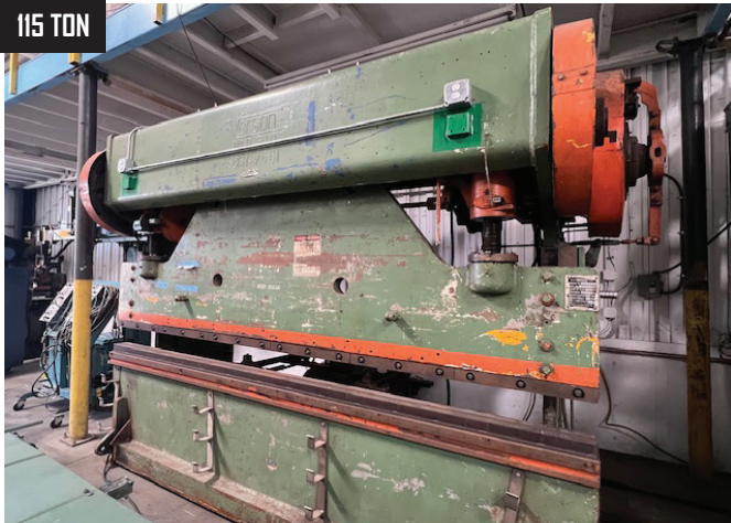
VERSON B510-120, 12 FT X 115 TON MECHANICAL PRESS BRAKE, MOTORIZED RAMADJUSTMENT, REAR MANUAL BACK GAGE, 30 SPM.