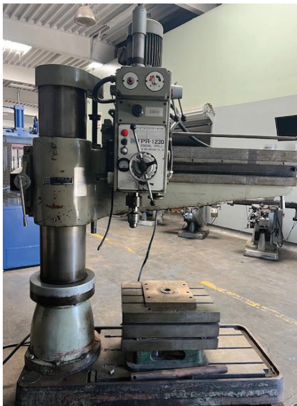
TAI PIN TRP 1230 RADIAL DRILL PRESS.