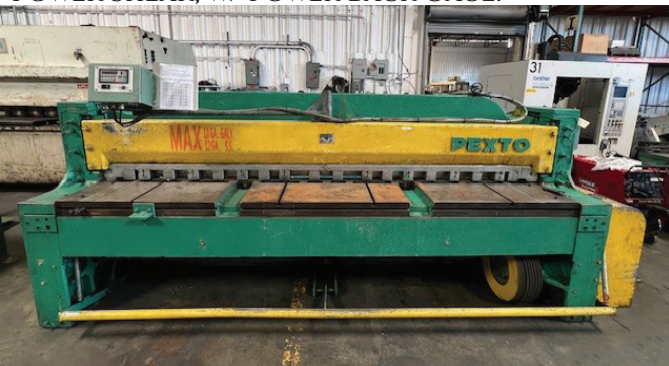
PEXTO MODEL 10-U-10B, 10FT X 10 GAGE POWER SHEAR, W/ SQUARING ARMS.