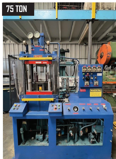
75 TON HULL 75 TON MODEL 359 HYDRAULIC COMPOSITE PRESS.