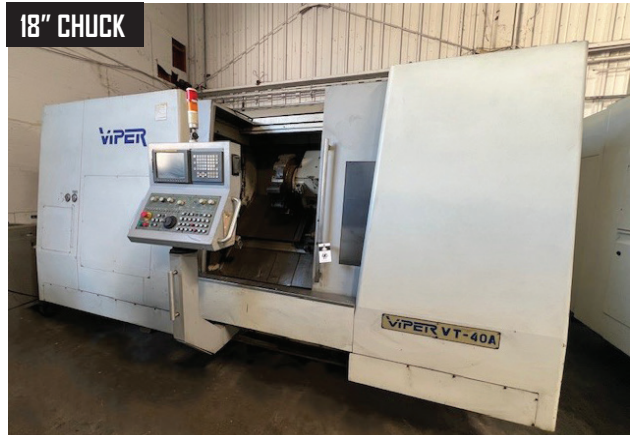
VIPER MODEL VT-40 CNC TURNING CENTER, 18" CHUCK, 12 STATION TURRET, TAIL STOCK, FANUC 21I-TB CONTROL, CHIP CONVEYOR.