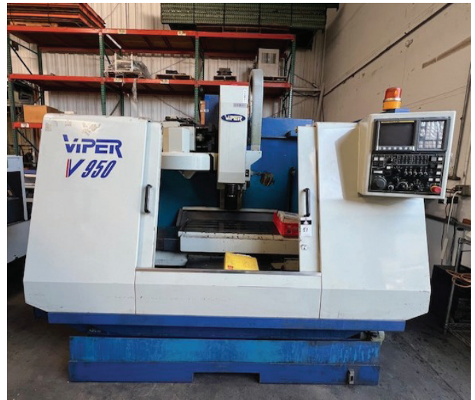
1999 VIPER VMC950P CNV VMC, W/ FANUC O-MD CONTROLS, 40 TAPER.