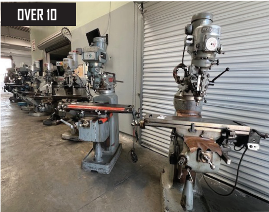
LARGE SELECTION OF BRIDGEPORT TYPE VERTICAL MILLS.

Inspection : Morning of Sale between 8:00 am to 11:00am. "Live Webcast Online Only - No Onsite Bidding". "Bidding thru Bidspotter.com".