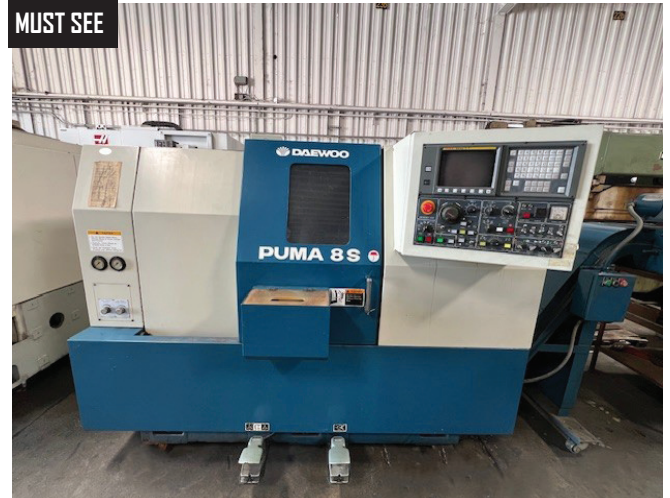
DOOSAN PUMA 8S CNC LATHE W/ TAIL STOCK, FANUC O-T CONTROLS, CHIP CONVEYOR, 12 POSITION TURRET.