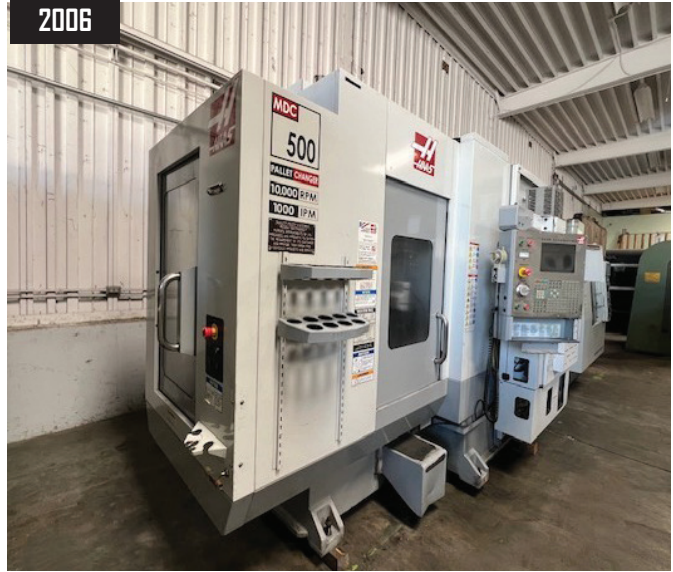
2006 HAAS MDC-500 MILL DRILL TAP VMC, 7500 RPM, CAT 40, 20 HP, 20" X 14" X 20" (XYZ), 24 ATC.