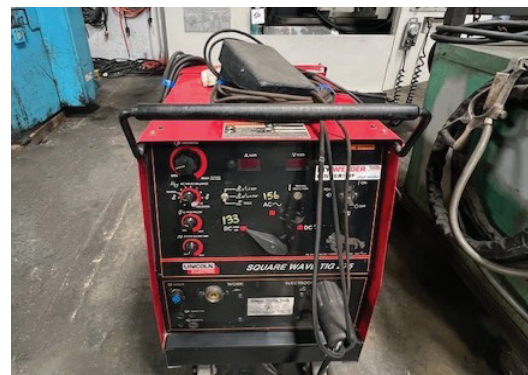
LINCOLN SQUARE WAVE 275 TIG WELDER.