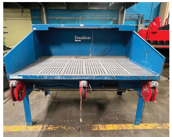
DONALDSON DOWNDRAFT BENCH MODEL RDB3000.