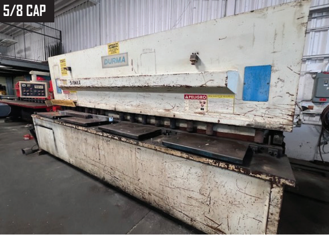
2001 DURMA AHGM 4016, 13FT X 5/8" CAPACITY HYDRAULIC SWING BEAM SHEAR, W/ POWERED BACK GAGE, S/N 622501042.