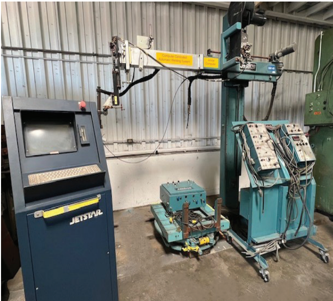
JETLINE WHL-3C-72 WELD HEAD LOCATOR AND TABLE, WIRE FEED, 36" X 36" TABLE, W/ JETSTAR CONTROL.