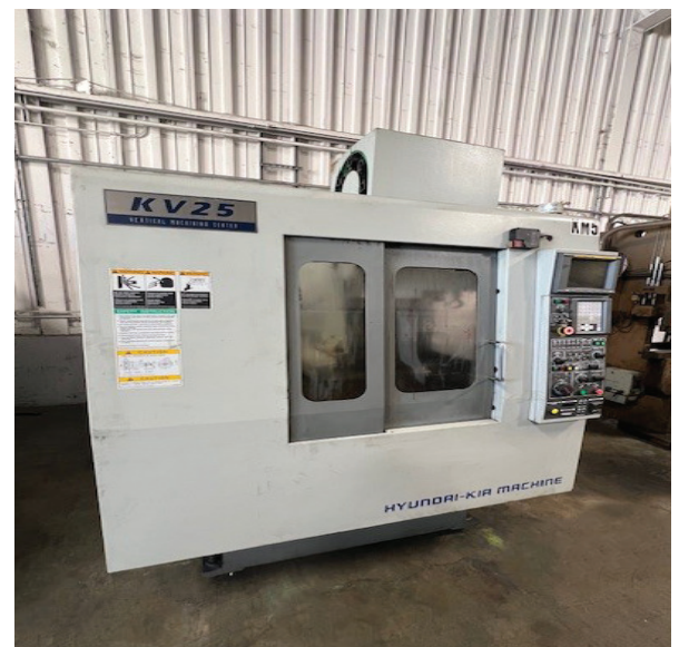
HYUNDAI KIA KV25 CNC VMC, W/ 16 ATC, BT-30, FANUC OI-MB CONTROLS, 12,000 RPM, 19.7" X 11" X 15" (XYZ)