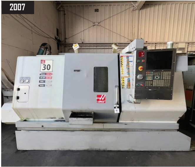
2007 HAAS SL-30 SL-30T CNC LATHE W/ TAIL STOCK, 12" 3 JAW CHUCK, 12 POSITION TURRET, 30 HP, TOOL PRE SETTER.