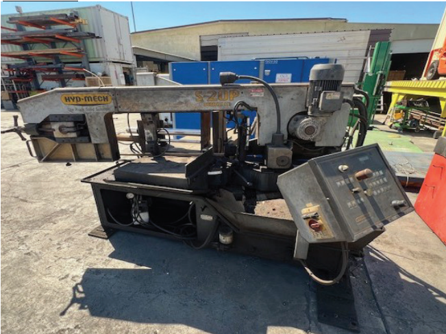
HYD MECH S-20P SERIES III HORIZONTAL BAND SAW WITH DIGITAL CONTROLS.