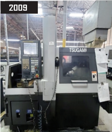
2009 2009 Tsugami SS20 CNC Swiss Screw Machine, 10,000 RPM, w/ Live Tooling, 20mm Capacity

Inspection : Wednesday April 8, 2026 between 9:00am to 3:00pm. “Live Webcast Online Only - No Onsite Bidding”. “Bidding thru Bidspotter.com”.