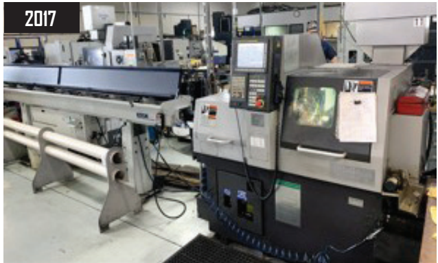
2017 2017 Tsugami BO126-III CNC Swiss Screw Machine, w/ Live Tooling, Milling, C Axis, Y Axis, 12,000 RPM, 25 Position Turret and 8 Live Tool Position, 6 Axis, Edge Scout Barfeeder.