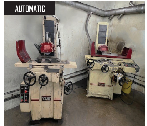
Large Selection of Kent Hydraulic and Automatic Surface Grinders.