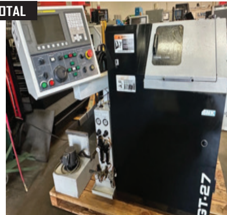
Prodigy GT-27 High Precision CNC Lathe w/ 6000 rpm and Fanuc Control