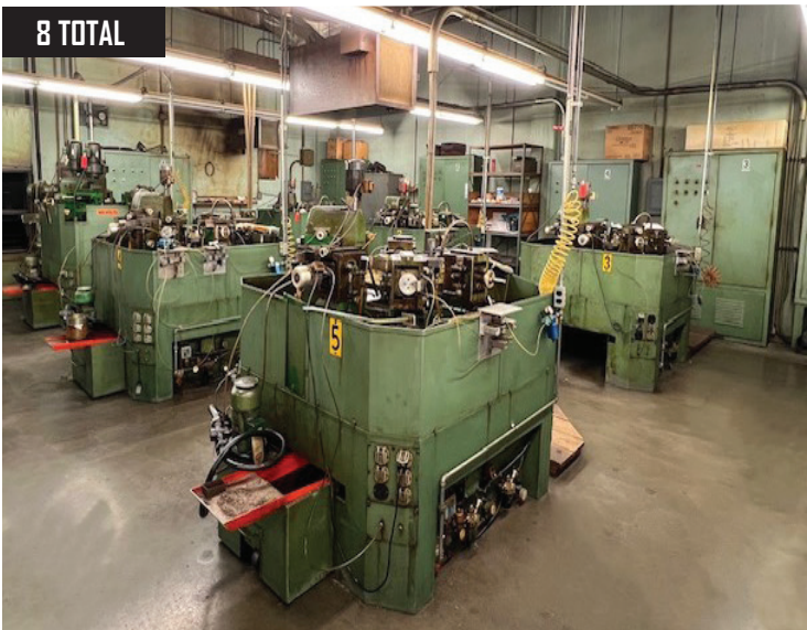
8 TOTAL (8) Mikron Haesler Model 50-8 and 59-8 Horizontal Table Transfer Machines, 8 Station Table, Vertical Units Including Cross Milling, Horizontal Milling, and Counter Boring. For Complex High Precision Simultaneous Drilling, Tapping, Reaming and Milling.