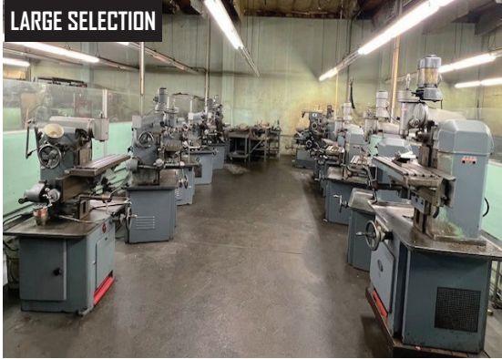
Aciera Vertical and Horizontal Universal Toolmaker's Milling Machine.