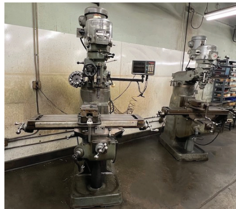
Partial View of Bridgeport Vertical Milling Machines..