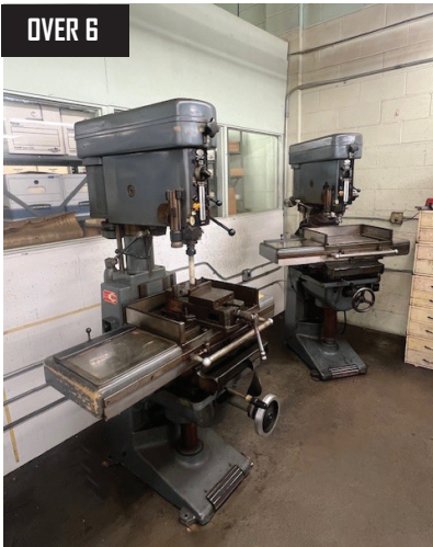
Over 6) Aciera 22 VA Swiss Vertical Milling Machines.