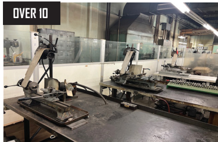
Over 10) Schaublin Model 70 Precision Lathes with Attachments.