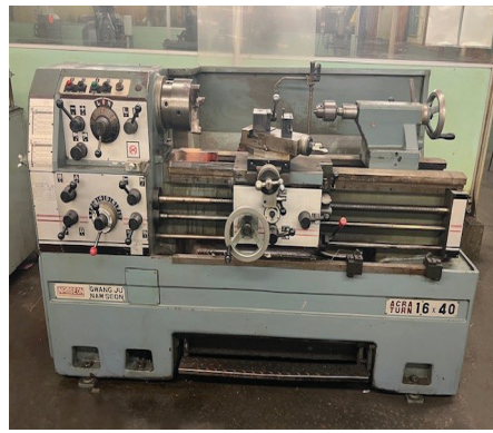
Acra 16" x 40" Engine Lathe, In/mm Threading, 3 Jaw Chuck.