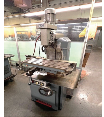
Aciera Swiss Model F3 Universal Toolmaker's Milling Machine, W20 Spindle Taper.