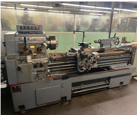
Hwacheon HL 18" x 59" Gap Engine Lathe, Threading, 3 Jaw Chuck, Steady Rest.