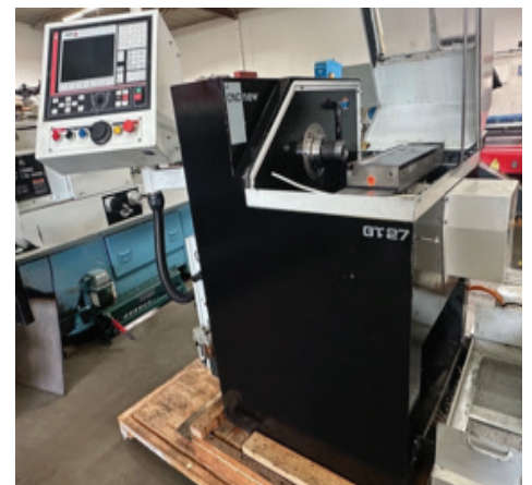
Prodigy GT-27 High Precision CNC Lathe w/ 6000 rpm and Fagor Control