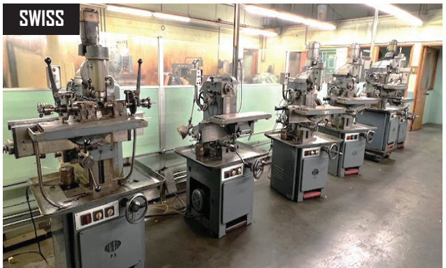
SWISS Aciera Swiss Model F3 Universal Toolmaker's Milling Machine, W20 Spindle Taper, 360 Degree Swiveling Head, Tilting Table, Horizontal & Vertical Heads.