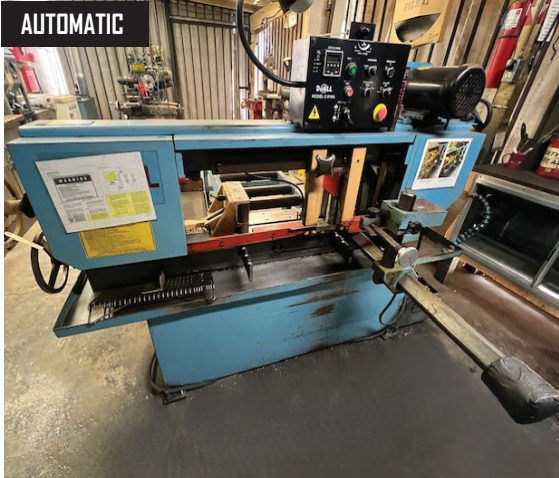
2000 Do All C-916A Automatic Horizontal Band Saw, 9" x 16" Capacity.