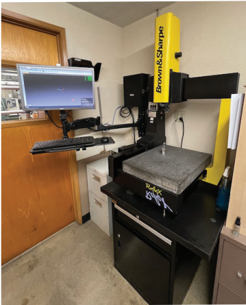
Brown & Sharpe Reflex Model 343 CMM, w/ CMM Manager Software and upgrades.

Inspection : Monday December1, 2025 from 9:00am to 3:00p.m. "Live Webcast Online Only - No Onsite Bidding" "Bidding thru Bidspotter.com".