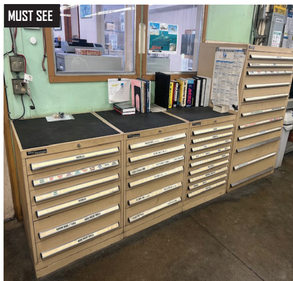
Large Selection of Lista Cabinets and Cutting Tools.