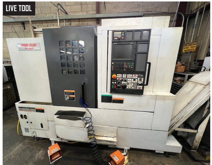
2007 Mori Seiki NL-1500SMC CNC Turning Center w/ Sub Spindle, Live Tool Milling, C Axis, Chip Conveyor, 8" Chuck, 6000 RPM, 2" Bar Capacity, 4 Axis, Fanuc MSX-850II Control.