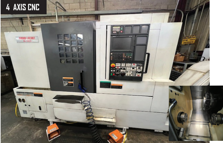
2007 Mori Seiki NL-1500SMC CNC Turning Center w/ Sub Spindle, Live Tool Milling, C Axis, Chip Conveyor, 8" Chuck, 6000 RPM, 2" Bar Capacity, 4 Axis, Fanuc MSX-850II Control.