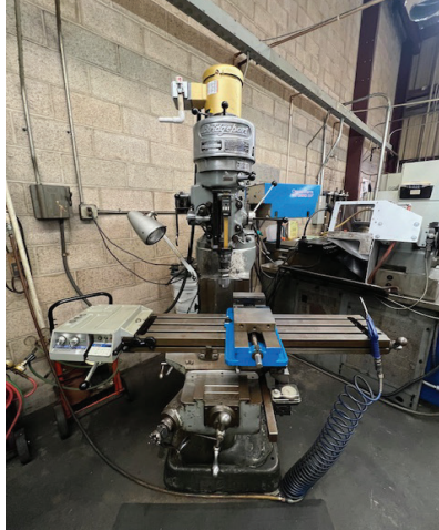
Bridgeport Vertical Milling Machine w/ Power Feed Table, Dials.