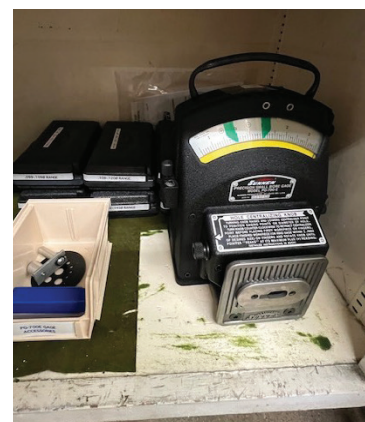
Sunnen PG-700-E Bore Gage and Support