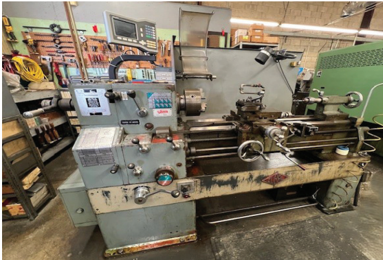
Zubal C2 Engine Lathe w/ 40" Centers, and Acu Rite DRO.