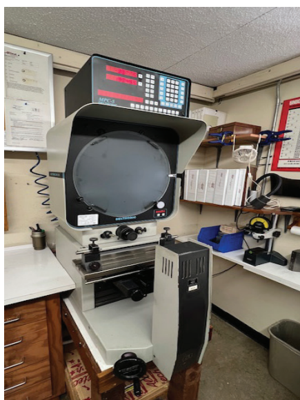
Deltronic Model 216, 16" Optical Comparator, w/ MPC-5 Digital DRO.