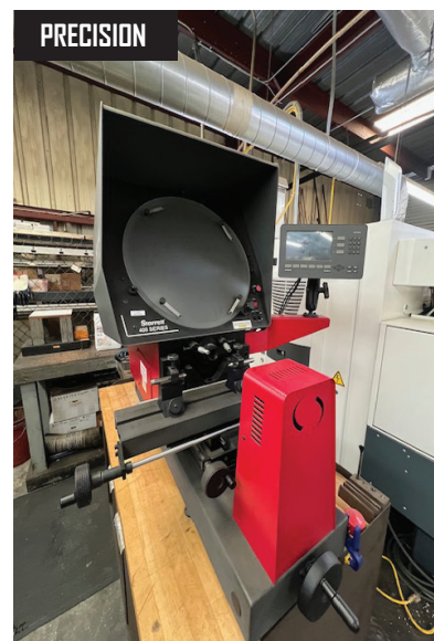
Starrett 400 Series 14" Optical Comparator w/MX Series Digital Controls.