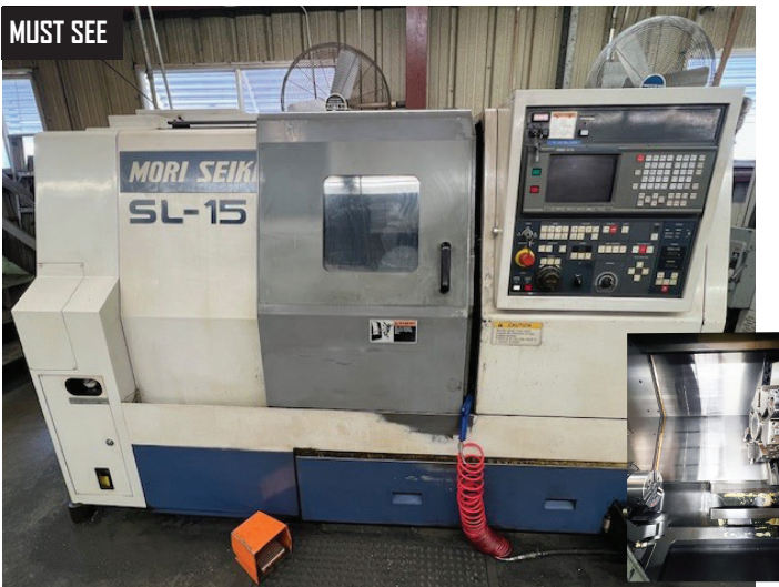
Mori Seiki SL-15 CNC Turning Center, Fanuc MSC-516 Control, Tailstock, 8" Chuck, 12 Position Turret, s/n 1899.