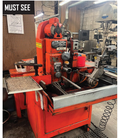
Sunnen Hone MBB-1680 C Honing Machine w/ Stroker.