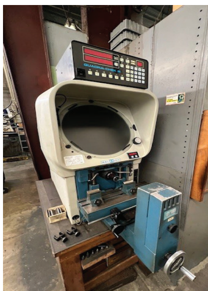
Deltronic 14" Optical Comparator w/ Quadra Chek III Controls.