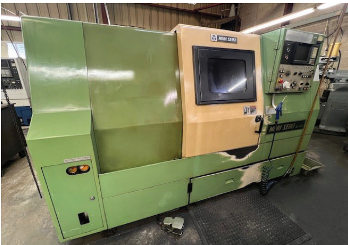
1989 Mori Seiki SL-25 B5/500 CNC Turning Center, Tailstock, 10" Chuck, Fanuc 10T Control, s/n 2510. 1985 Mori Seiki SL-1B CNC Turning Center, w/ Fanuc 6T Control, s/n 1851.