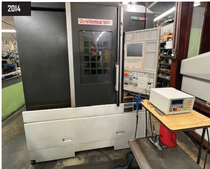
2014 Mori Seiki Dura Vertical 5060 CNC VMC, BT 40 Taper, 4 Axis Ready, 12,000 rpm, Fanuc OiMD Controls, 30 ATC, 23.6" x 20.9" x 201.1" (XYZ), Chip Auger, s/n DV005131205.