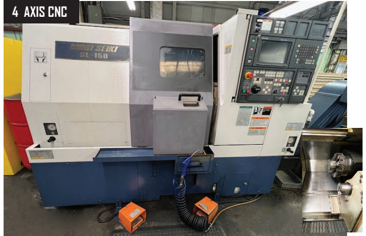
2000 Mori Seiki SL-150SMC CNC Turning Center, w/ Sub Spindle, Live Tooling, C Axis, Fanuc MSC-501 Controls, 12 Position Turret, Chip Conveyor, 8" Chuck, s/n 1352.