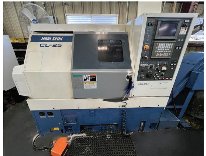
1995 Mori Seiki CL-25A CNC Turning Center, Tailstock, Fanuc MSC-518 Control, 10" Chuck, s/n 602.