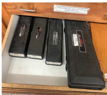
Partial View of Sunnen Gages.