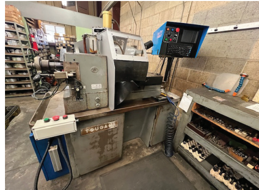
Tsugami CNC 2nd Op Lathe with Omniturn Control.