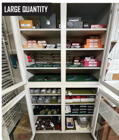
Large Selection of Thread Gages, Ring Gages and Support.