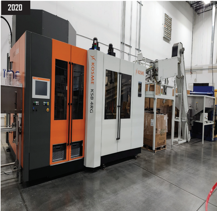
2020 Kosme Model KSB 4RG Synchro Stretch Blow Molding Machine for High Output PET Containers set with 1-gallon mold, designed for 4 cavities designed for beverage, food, and industrial liquids. Output 4700 units/hour, max container size 5 liters.