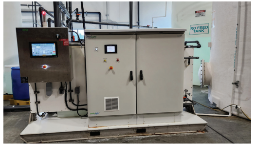
Omnilyte model Pro-4800 Alkalizer System with full RO System and Alkalizer, Dual Ozon System.