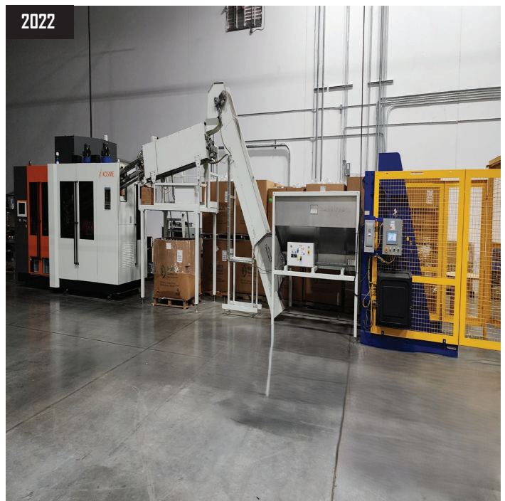
2022 Kosme Volufill Bottle Filler System, Fully Automated for Beverage and Industrial Liquids.