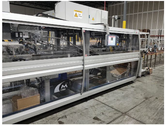
2022 SMI LWP 30 Ergon Automatic Wrap Around Case Carton Packer (Boxer) Machine, s/n PC2200461S8460.