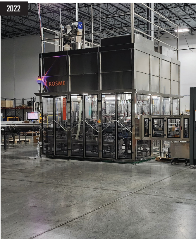
2022 Kosme Volufill Bottle Filler System, Fully Automated for Beverage and Industrial Liquids.