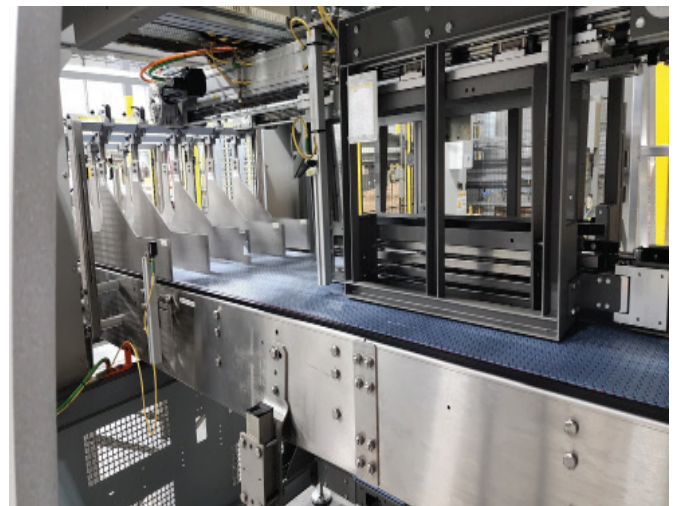
2022 SMI DV 500 S Ergon Separator Lane Divider for Bottle