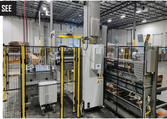
2022 Atlanta Model Revolution LS Automatic Stretch Wrapping Machine System.