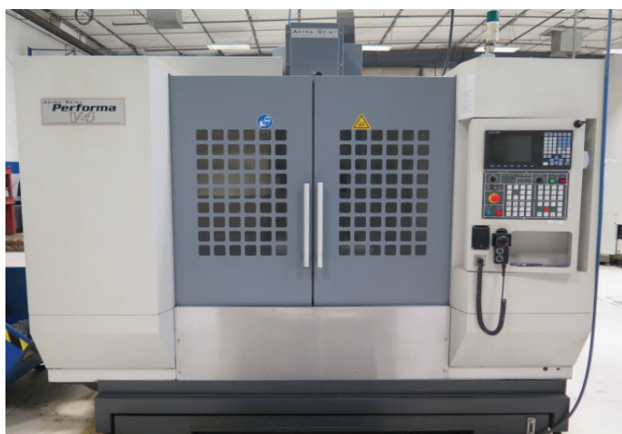
2008 Akira Seiki Performa V4 CNC VMC w/ Akira Seiki Mi645 Controls, 20-Station ATC, CAT-40 Spindle