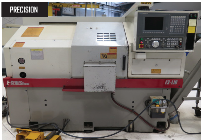
Okuma E-Series ES-L10 CNC Turning Center w/ OSP-U10L Controls, 12-Station Turret, Hydraulic Tailstock, 3000 RPM, Parts Catcher, 10" Power Chuck