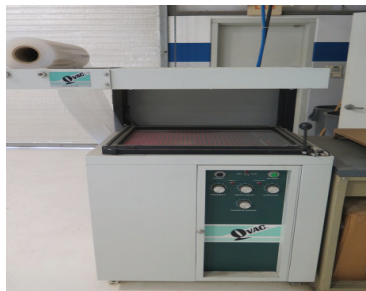
Neway Packaging Q-Vac PA-1824 18" x 24" Vacuum Packaging System