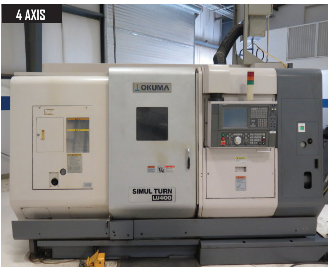
2005 Okuma Simul-Turn LU 400 Twin Turret CNC Turning Center w/ OSP-P100 Controls, 12-Station Upper Turret, 10-Station Lower Turret, 2500 RPM, Hydraulic Tailstock