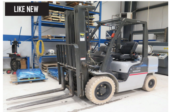
Nissan 60 mdl. MUGL02A30LV 5200 Lb Cap LPG Forklift w/ 3-Stage Mast, 187" Lift Height, Side Shift, Solid Yard Tires