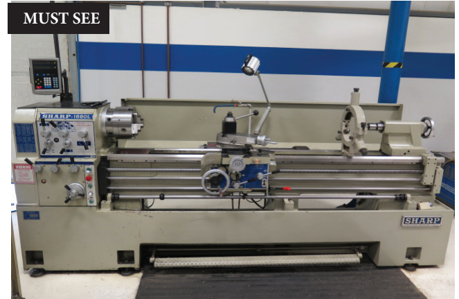
2009 Sharp 1880L 18" x 80" Geared Head – Gap Bed Lathe w/ Newall C80 DRO, 20-2000 RPM, Taper Attachment, Inch/mm Threading, Tailstock