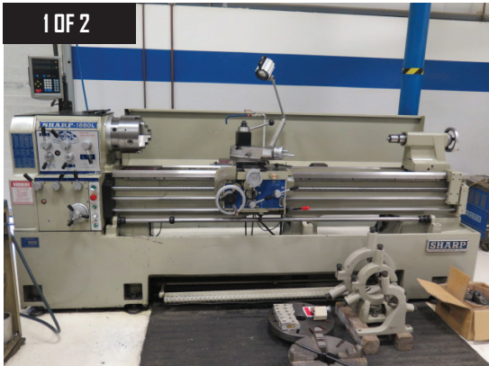
Sharp 1880L 18" x 80" Geared Head-Gap Bed Lathe

Pre Sorted STANDARD U.S. Postage PAID STA CLARITA, CA Permit No. 298