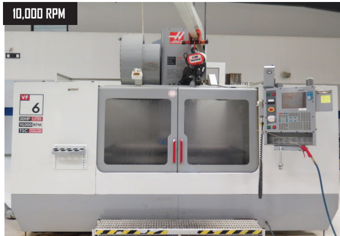
Haas VF-6B/40 4-Axis CNC VMC w/ 40-Station Side-ATC, CAT-40, 10,000 RPM, 30Hp 2-Speed Gear Drive, TSC, Rigid Tapping