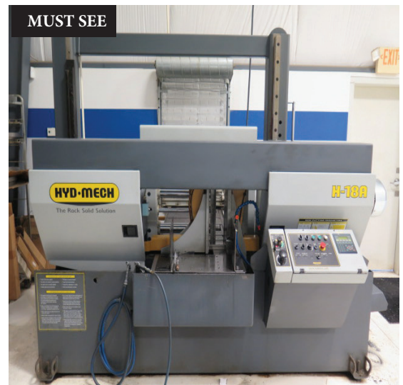
Hyd-Mech H-18A 18" Automatic Hydraulic Horizontal Band Saw w/ Digital Controls, Hydraulic Clamping and Feed