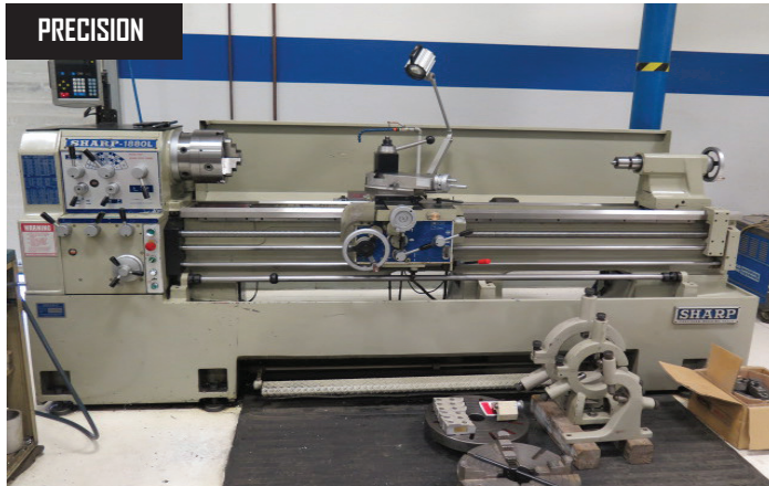
2009 Sharp 1880L 18" x 80" Geared Head – Gap Bed Lathe w/ Newall C80 DRO, 20-2000 RPM, Taper Attachment, Inch/mm Threading, Tailstock