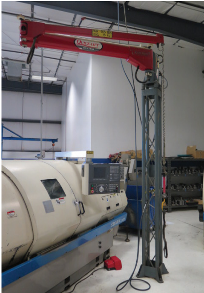
Kahlman "Quick-Lift" 165 Lb Cap Floor Mounted Jig Crane