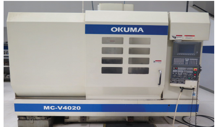
Okuma MC-V4020 4-Axis CNC VMC w/ OSP-U10M Controls, 20-ATC, CAT-40, 8000 RPM, Thru Spindle Coolant, Coolant Filtration System