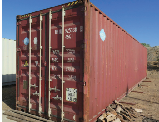
40" High Cube Shipping Container