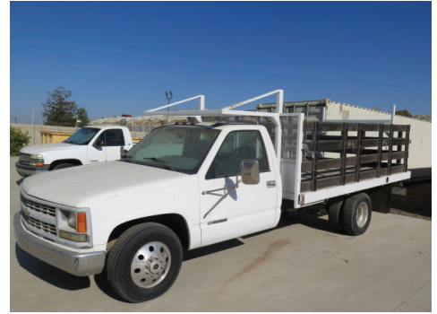
1995 Chevrolet 3500 12' Stake-Bed Truck w/ 5.7l Gas Engine, Automatic Trans, AC