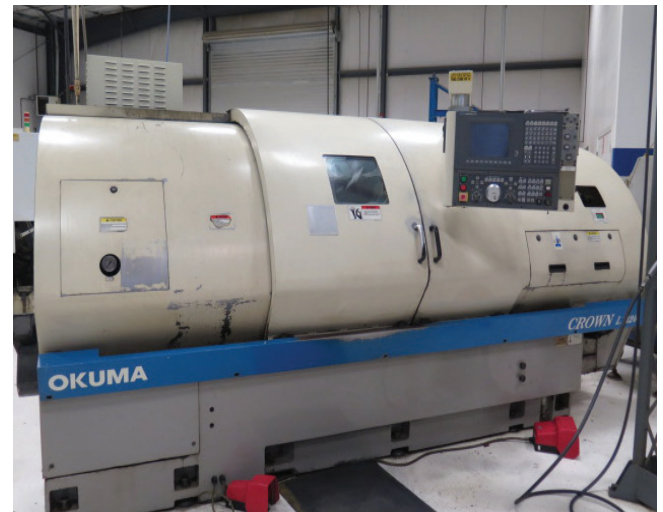
Okuma Crown L1420 type 769 CNC Turning Center w/ OSP-U10L Controls, 12-Station Turret, Hydraulic Tailstock, 3000 RPM, 12" Power Chuck