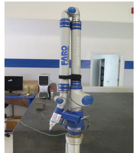
2009 Faro Platinum P08 Portable CMM Arm w/ 0.030mm Point, Verisoft X3 SP2 Software