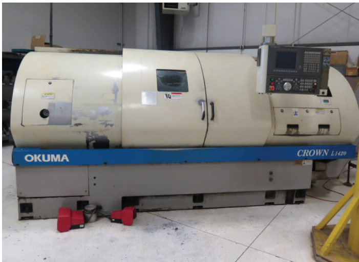
Okuma Crown L1420 type 769 CNC Turning Center w/ OSP-U10L Controls, 12-Station Turret, Hydraulic Tailstock, 3000 RPM, 12" Power Chuck