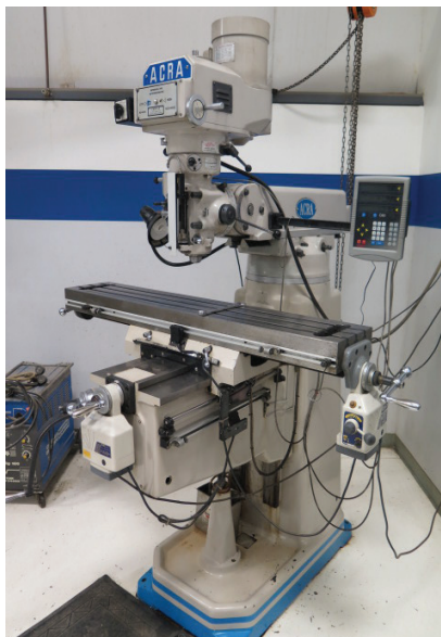
Acra AM-3V Vertical Mill w/ Newall C80 DRO, 3Hp Motor, 60-4200 Dial RPM, Chrome Box Ways, Power X & Y Feeds