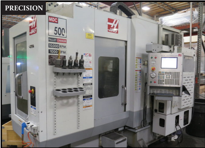
Haas MDC500 2-Pallet CNC VMC w/ 24-ATC, CAT-40, 10,000 RPM, Pallet Changer, Rigid Tapping