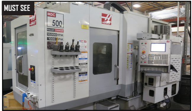
MUST SEE Haas MDC500 2-Pallet CNC VMC w/ 24-ATC, CAT-40, 10,000 RPM, Pallet Changer, Rigid Tapping