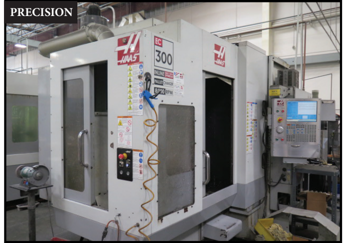
Haas EC300 2-Pallet CNC HMC w/ Haas Controls, 24-ATC, CAT-40, 8000 RPM