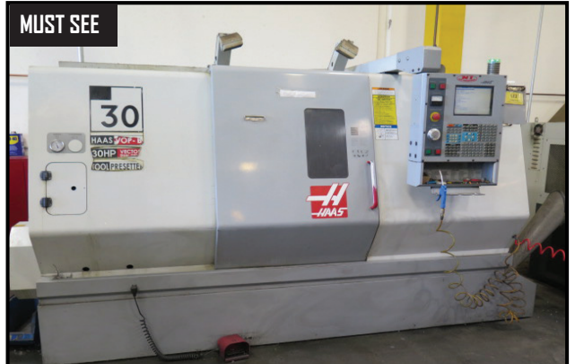
MUST SEE Haas SL-30 CNC Turning Center w/ Tool Presetter, 12-Station Turret, 3400 RPM, Rigid Tapping, 10" Chuck