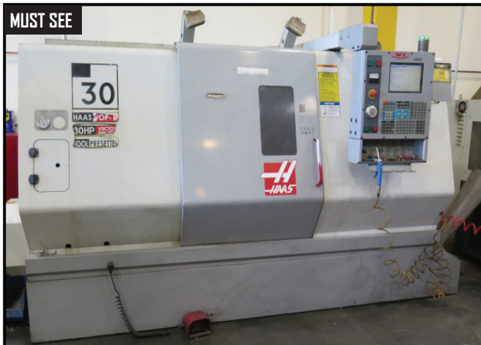
Haas SL-30 CNC Turning Center w/ Tool Presetter, 12-Station Turret, 3400 RPM, Rigid Tapping, 10" Chuck