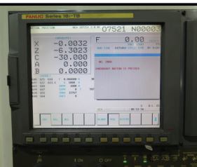
Takisawa EX-508 Twin Spindle CNC Turning Center w/ Fanuc 18i-TB Controls, 12-Station Turret, 8" Power Chucks (Main and Sub Spindles), New "X" Axis Ball Screw (1 Month)