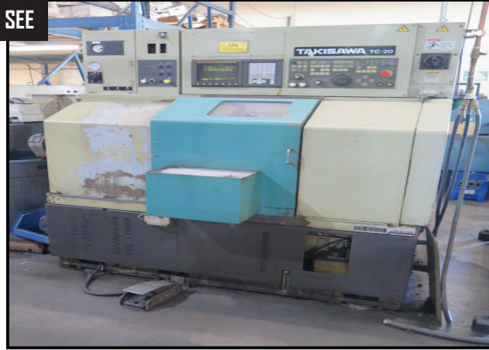
Takisawa TC-20 CNC Turning Center w/Takisawa-Fanuc Controls, 12-Station Turret, Hydraulic Tailstock, 8" Power Chuck