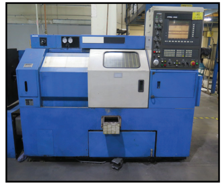
Hyundai HiT-15S CNC Turning Center w/Hyundai HiTROL-840C Controls, Tool Presetter, 12-Station Turret, New Hard Disc Drive