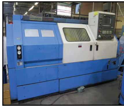
1996 Hyundai HiT-30S CNC Turning Center w/ Siemens Sinumerik Controls, Tool Presetter