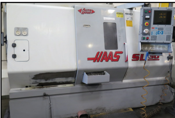
Haas SL-30T CNC Turning Center w/ Tool Presetter, 12-Station Turret, Tailstock, 3400 RPM, Gear Box, 10" Chuck.

2006 Takamatsu X-100 Robotic CNC Turning Center s/n 1110722 w/ Fanuc Series 0i-TC Controls, 8-Station Turret, Robotic Loader / Parts Turner, 6 1/2" 3-Jaw Power Chuck, Chip Conveyor, Coolant.