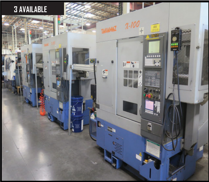
3 AVAILABLE Takamatsu X-100 Robotic CNC Turning Centers ***3-AVAILABLE***