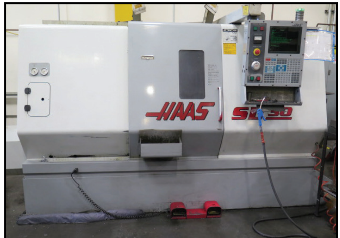
Haas SL-30T CNC Turning Center w/ Tool Presetter, 12-Station Turret, Tailstock, 3400 RPM, Rigid Tapping, 8" Chuck