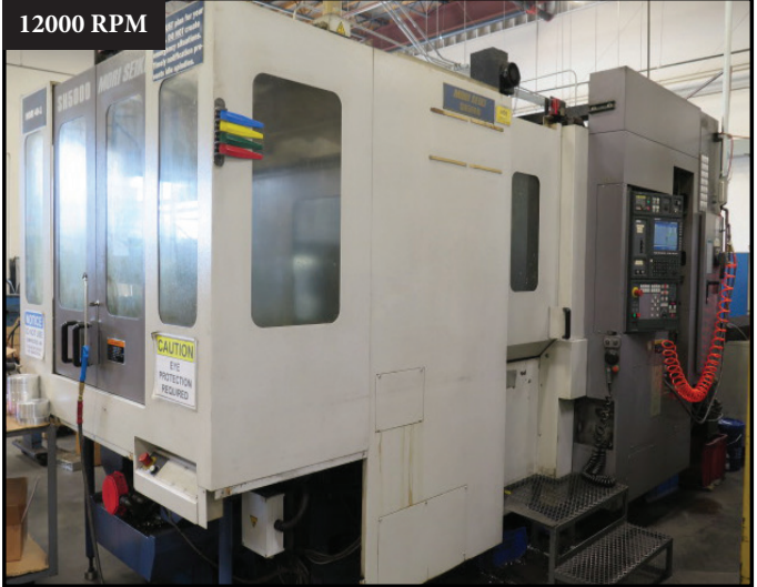
Takamatsu X-100 Robotic CNC Turning Centers ***3-AVAILABLE***