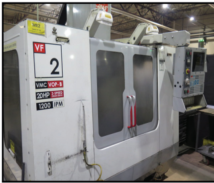
2002 Haas VF-2B CNC VMC w/ 20-ATC, CAT-40, 7500 RPM, Programmable Coolant, Rigid Tapping