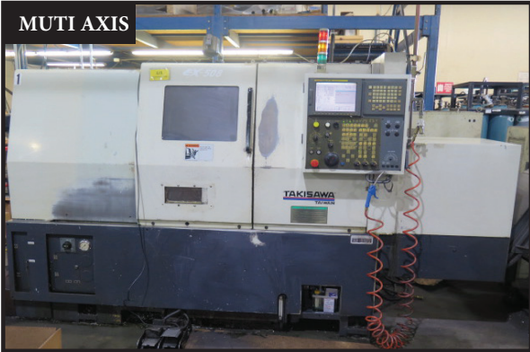
MUTI AXIS Takisawa EX-508 Twin Spindle CNC Turning Center w/ Fanuc 18i-TB Controls, 12-Station Turret, 8" Power Chucks (Main and Sub Spindles), New "X" Axis Ball Screw (1 Month)

Inspection : Morning of Sale from 8:00am to 11:00am. "Live Webcast Online Only - No Onsite Bidding". "Bidding thru Bidspotter.com".