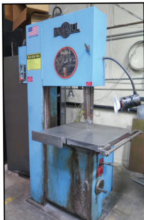
DoAll mdl. 2013-V 20" Vertical Band Saw