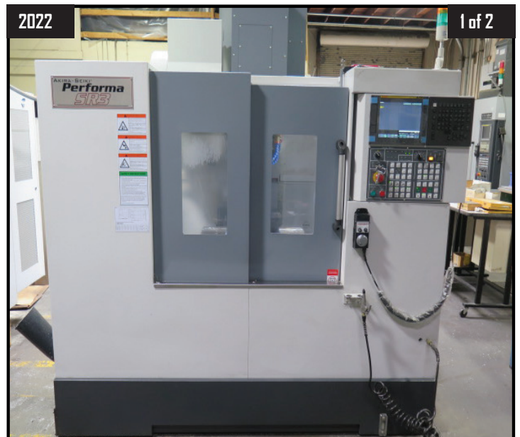
9/2022 Akira Seiki Performa SR3 CNC VMC w/ Fanuc 0i-MF Plus Controls, 20-ATC, CAT-40 Spindle, 11,000 RPM