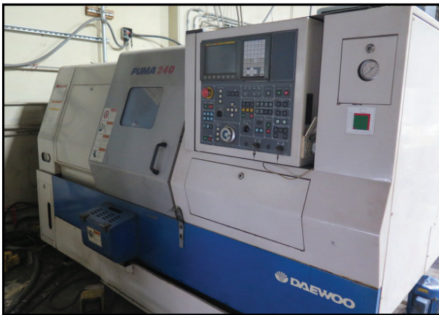
2004 Daewoo PUMA 240C CNC Turning Center w/ Fanuc I Series Controls, Tool Presetter, 12-Station Turret, Hydraulic Tailstock, Parts Catcher, 10" Power Chuck