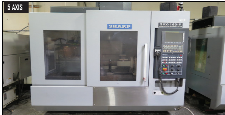
2018 Sharp SVX-160F 5-Axis CNC VMC w/ Fanuc 31i B5 Controls, 24-ATC, CAT-40, 12,000 RPM, 5-Axis Simultaneous Machining, Tool Presetter

Inspection : Monday May 19,2025 9:00am to 3:00pm. "Live Webcast Online Only – No Onsite Bidding". "Bidding thru Bidspotter.com".