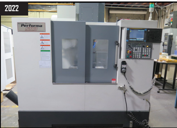
9/2022 Akira Seiki Performa SR3 CNC VMC w/ Fanuc 0i-MF Plus Controls, 20-ATC, CAT-40 Spindle, 11,000 RPM

24" x 36" x 4" Granite Surface Plate w/ Stand.