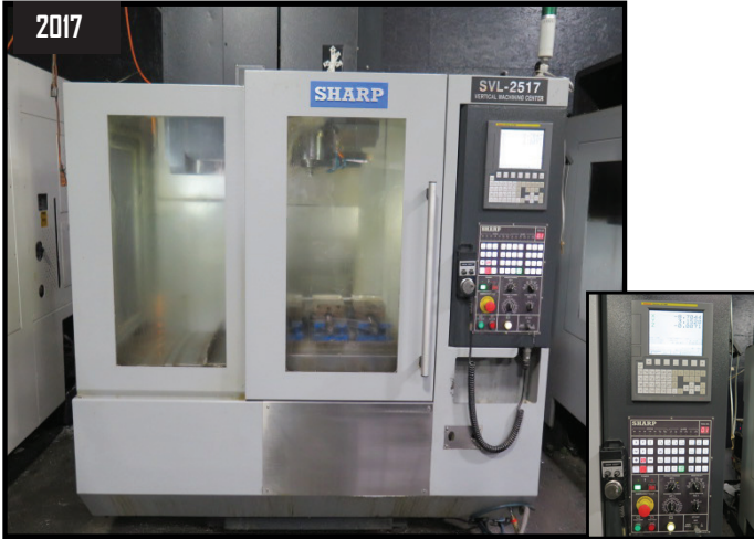
11/2017 Sharp SVL-2517 SZ-F CNC VMC w/ Fanuc 0i-MF Controls, 24-ATC, CAT-40, 12,000 RPM, Extended "Z" Axis, Rigid Tapping