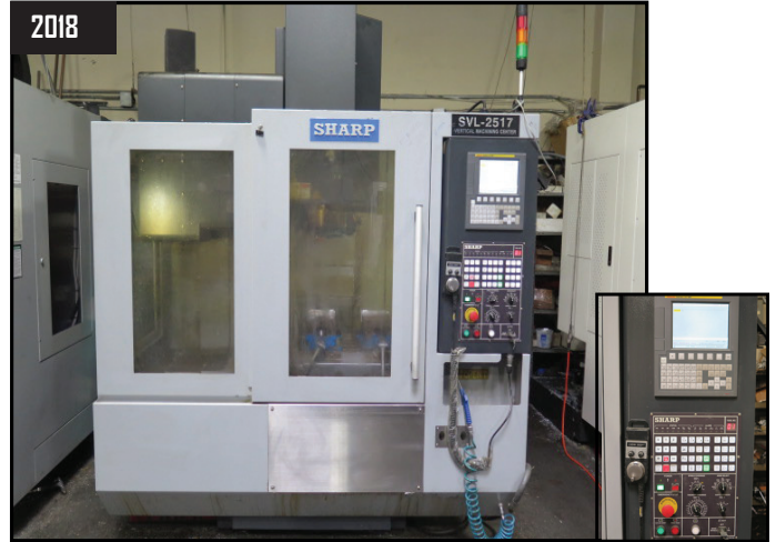
2018 Sharp SVL-2517 SX-F CNC VMC w/ Fanuc 0i-MF Controls, 24-ATC, CAT-40, 12,000 RPM, Rigid Tapping