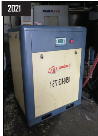
2021 Standard Industrial GSI-15 15Hp Rotary Air Compressor

2004 Daewoo PUMA 240C CNC Turning Center s/n PM240447 w/ Daewoo-Fanuc I Series Controls, Tool Presetter, 12-Station Turret, Hydraulic Tailstock, Parts Catcher, 10" 3-Jaw Power Chuck, Coolant.