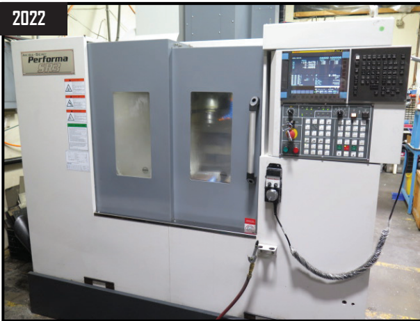
9/2022 Akira Seiki Performa SR3 CNC VMC w/ Fanuc 0i-MF Plus Controls, 20-ATC, CAT-40 Spindle, 11,000 RPM