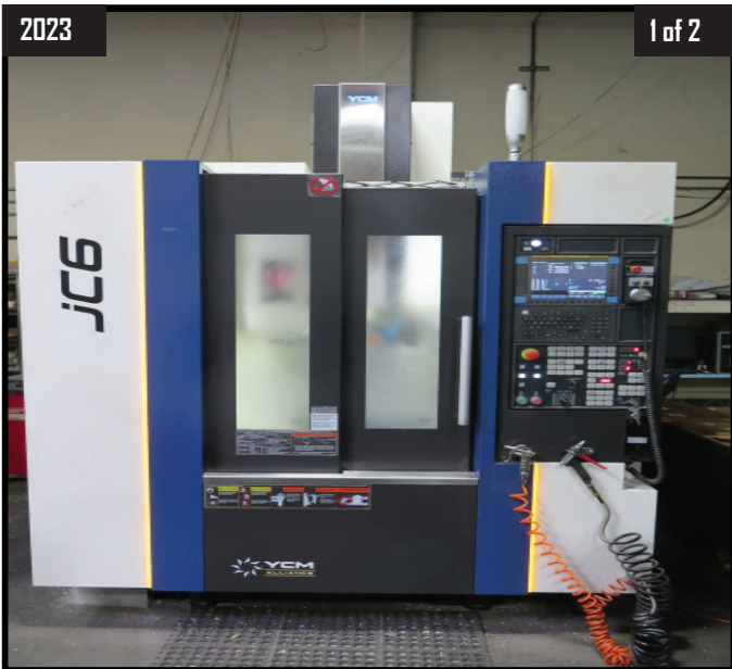
2023 YCM JC6 4-Axis CNC VMC w/ TCM-Fanuc MXP-200 FB Controls, 24-ATC, CAT-40, Marposs Wireless Probe System, Rigid Tapping