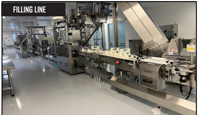
Pharmaceutical Filling and Capping Vile Line.