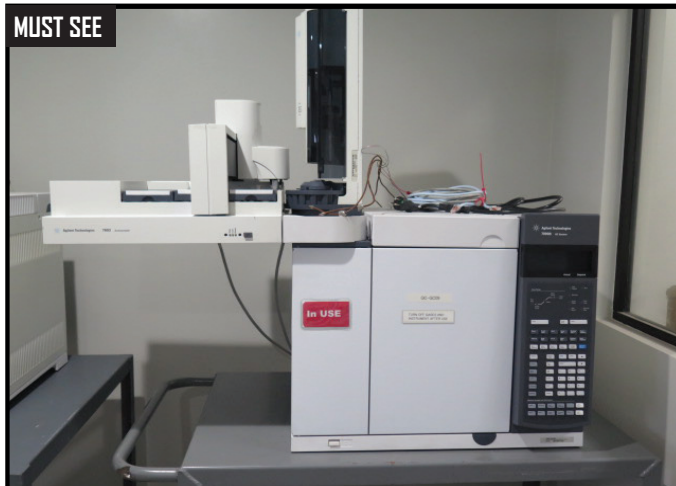
Agilent Technologies 7890A GC System s/n CN14313125 w/ 7693 Autosampler, G4513 Autoinjector.