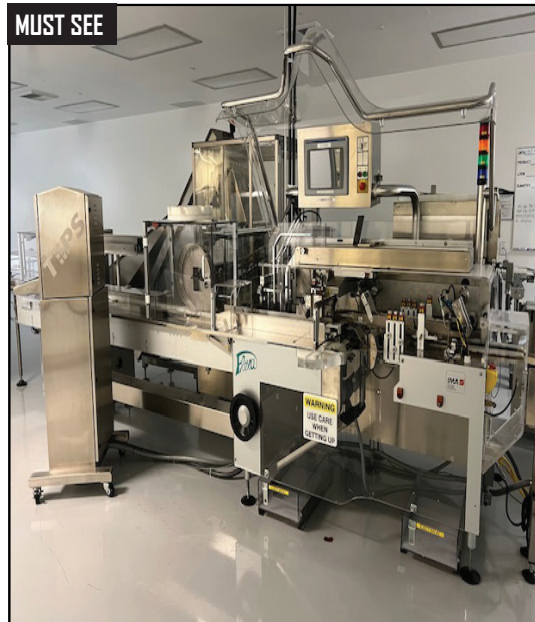
IMA "Flexa AL" 542 Cartoner w/ Allen Bradley PanelView Plus 1250 Controls, (2) ideojet S25 Laser Printers, Video Inspection System, Carton Feeder.