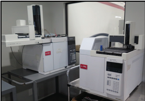
Agilent Technologies Autosamplers.