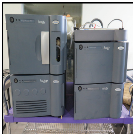
Waters Acquity UPLC System w/ (186015017) Sample Manager - FTN s/n L12SDI 429G, (186015017) UPLC Quaternary Solvent Manager, (186015043) UPLC Column Manager, (186015032) UPLC PDA Detector, Tray Top.