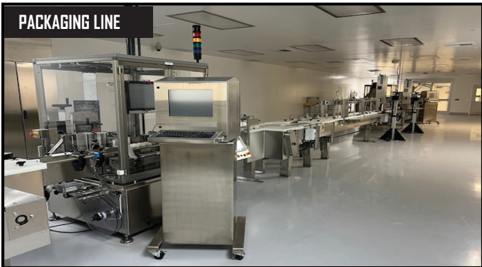
Complete Pharmaceutical Packaging Line.