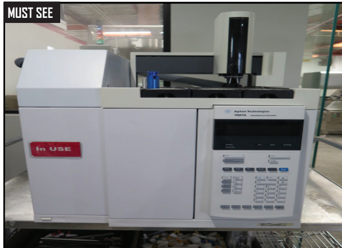
Agilent Technologies 7697A (G4557-64000) Headspace Sampler s/n CN14320027 w/ 7697A Tray.