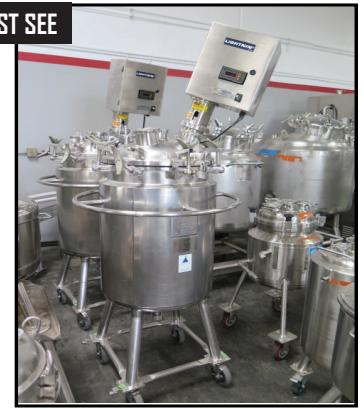
(2) Precision Stainless 100L Stainless Steel Jacketed Vessel w/ Lightnin P6S05E Mixer with Digital Controller.