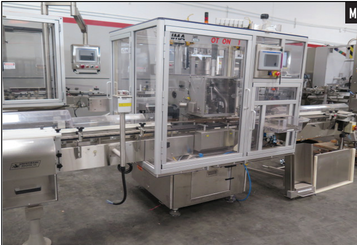
IMA "Safe Nova OT ON 1" mdl. 150 Capsule Machine s/n 254 w/ Allen Bradley PanelView Plus 700 Controls.