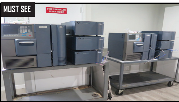
Waters Alliance e2695 HPLC / Sampler Managers. Waters Acquity UPLC System w/ (186015017) Sample Manager - FTN s/n L12SDI 462G, (186015017) UPLC Quaternary Solvent Manager, (186015043) UPLC Column Manager, (186015032) UPLC PDA Detector, Tray Top.