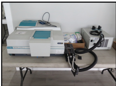
Cary 300 Bio UV Visible Spectrophotometer.