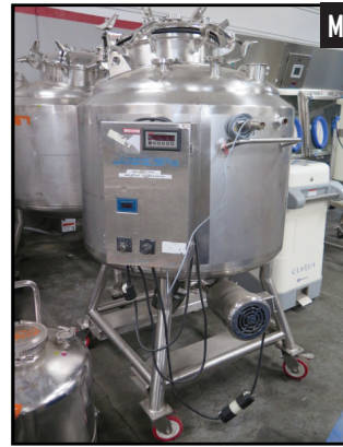
DCI 375L Stainless Steel Jacketed Vessel w/ Mixer.