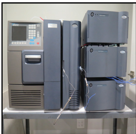
Waters Alliance e2695 HPLC System w/ (186269506) e2695 Separations Module s/n D14SM4113A, (186179100) Column Heater - Cooler, (186299800) 2988 PADetector, (186248900) 2489 UV / Vis Detector, (186241401) 2414 RI Detector.