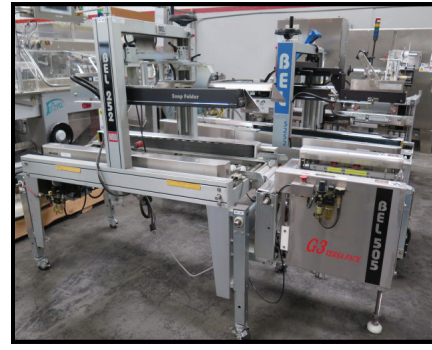
Belcor Carton Erector w/ GS Versa Pack 505 Carton Feeder, Bel 252 Erector, SE-22 Dekka Taping Head.