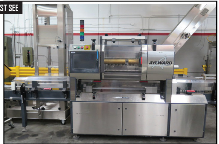
2005 Aylward Dry Tablet High Speed Bottle Lining Machine s/n 133631 w/ Xycon ProFace Touch Screen Controls, "On The Fly" Rejections.