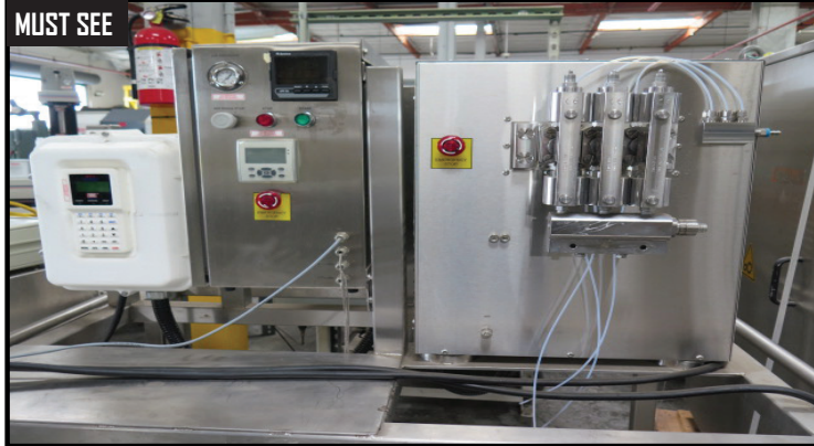
Avestin High Pressure Homogenizer s/n C5500416 2000bar/30000psi.