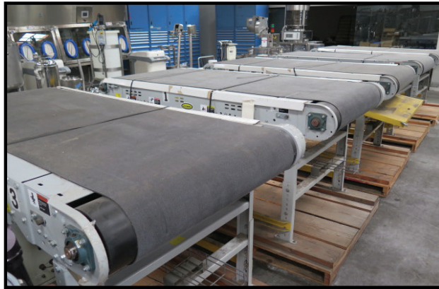
12" x 31' Motorized Conveyor.