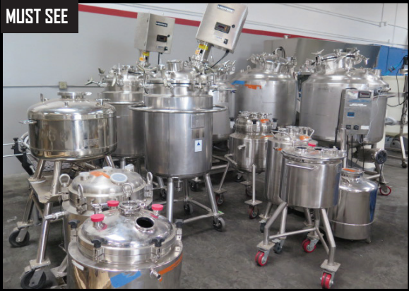
Large Selection of Stainless Steel Kettles / Tanks / and Reactors.

Inspection : Morning of sale from 8:00am to 10:30am. "Live Webcast Online Only - No Onsite Bidding". "Bidding thru Bidspotter.com".