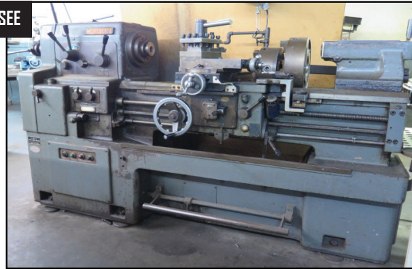
Mori Seiki MS-850 17" x 36" Geared Head - Gap Bed Lathe s/n 10310 w/ 32-1800 RPM, Inch Threading, Tailstock, Steady and Follow Rests, Indexing Tool Post, Trava Dial, 10" 3-Jaw Chuck, 12" 4-Jaw Chuck, 5C Collet Closer, Coolant.