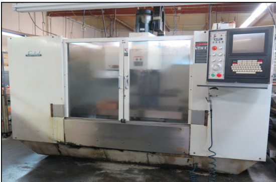
Fadal VMC4020 HT CNC Vertical Machining Center s/n 9312358 w/ Fadal CNC88HS Controls, 21-Station ATC, CAT-40 Taper Spindle, 7500 FPM, High Speed CPU, Graphics, Coolant.