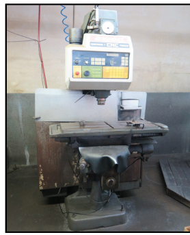
Bridgeport Series 1 R2E3 CNC Vertical Mill w/ Bridgeport CNC Controls, Universal Quick-Switch Taper Spindle, 12 1/2" x 34" Table.