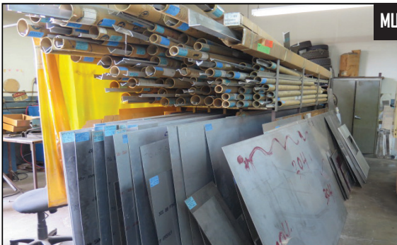
Raw Materials Including Aluminum and Stainless Steels w/ Racks.