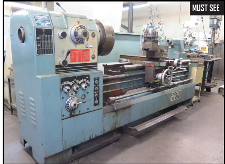
2001 Kingston HD-2660 26" x 60" Geared Head - Gap Bed Lathe s/n CH01002w/ 13-1200 RPM, 4" Thru Spindle Bore, Inch/mm Threading, Tailstock, Trava-Dial, Indexing Tool Post, 15" 3-Jaw Chuck, Coolant.