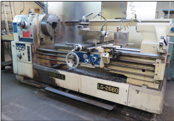
Doringer D-350 Miter Cold Saw s/n 18964 w/ 2-Speeds, Pneumatic Clamping, Coolant, Conveyor.