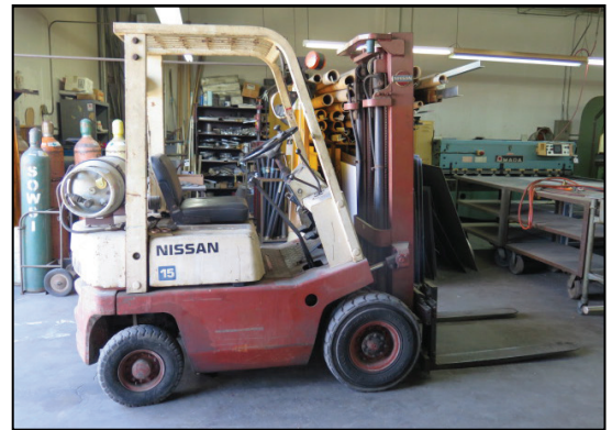
Nissan NF01M15 1500 Lb Cap LPG Forklift s/n NF01-024777 w/ 2-Stage Mast, Side-Shift, Pneumatic Yard Tires. 1500 Lb Cap Shipping Scale.