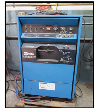
Miller Syncrowave 351 CC-AC/DC Arc Welding Power Source s/n KF893016.

ALL MACHINERY MOVERS MUST BE APPROVED BY THE SELLER PRIOR TO REMOVAL OF EQUIPMENT