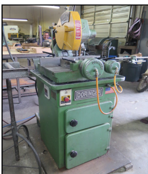
Doringer D-350 Miter Cold Saw s/n 18964 w/ 2-Speeds, Pneumatic Clamping, Coolant, Conveyor.