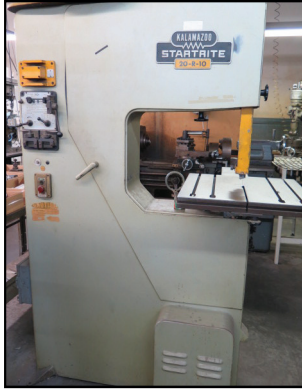
Kalamazoo Startrite 20-R-10 20" Vertical Band Saw s/n 45860 w/ Blade Welder, 20 1/2" x 20 1/2" Table.