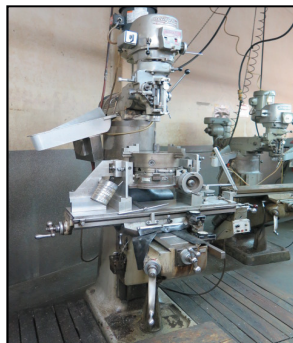
Bridgeport Series 1 - 2Hp Vertical Mill w/ 60-200 Dial Change RPM, Universal Quick-Switch Taper Spindle, (2) 7" Risers, Chrome Ways, Power Feed, 9" x 42" Table.