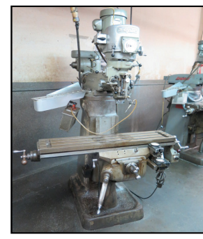
Bridgeport Vertical Mill w/ 1.5Hp Motor, 60-4200 Dial Change RPM, Universal Quick-Switch Taper Spindle, Power Feed, 9" x 42" Table.