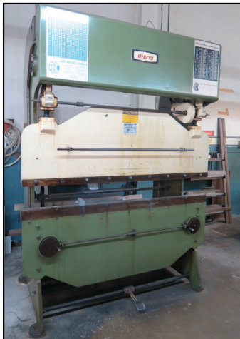
DiAcro 14-72 14GA x 72" Hydrapower Press Brake s/n 6601274122 w/ 72" Bed Length, Manual Back Gauging, 9 1/8" Throat, 62" Between Uprights.