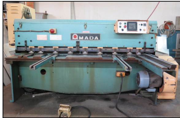
Amada M-2045 78" x 0.177" Power Shear s/n 2401382 w/ Amada Controls and Back Gauging, 43" Squaring Arm, Front Supports.