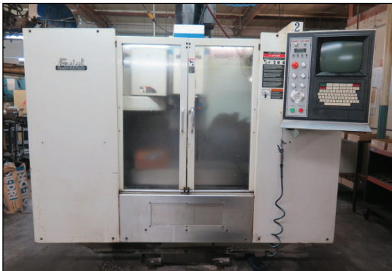
Fadal VMC15 XT CNC Vertical Machining Center s/n 9708738 w/ Fadal CNC88HS Controls, 21-Station ATC, CAT-40 Taper Spindle, 10,000 RPM, Rigid Tapping, 422K Memory Expansion, High Speed CPU, Graphics, Coolant.