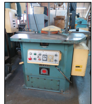
Amada CS-220 8 5/8" x 8 5/8" Power Corner Notcher s/n 543923 w/ Fence System.