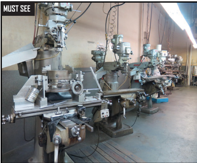
Large Selection of Vertical Milling Machines.