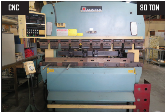
Amada R80 80-Ton x 78" CNC Press Brake s/n 807215 w/ NC9-EX Controls, 78.8" Bed Length, 82.1" Max Bend Length, 59.9" Between Uprights, 15.76" Throat, 3.94" Stroke, 14.58" Open Height.