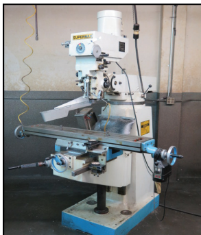
Supermax YCM-16VS Vertical Mill w/ 3Hp Motor, 60-4200 Dial Change RPM, Universal Quick-Switch Taper Spindle, Trava-Dials, Chrome Box Ways, Power Feed, 9" x 49" Table.