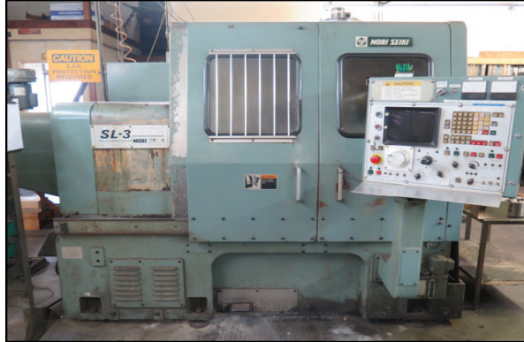
Mori Seiki SL-3 CNC Turning Center s/n 1479 w/ Fanuc Controls, 8-Station Turret, 3000 RPM, Hydraulic Tailstock, 5C Collet Nose, 8" 3-Jaw Power Chuck, Coolant.