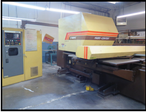
Strippit Fabri-Center FC1000XT 33 Ton 24-Station CNC Turret Punch Press s/n X9038113088C w/ Fanuc GN 6 Series Controls, 24-Station Turret, 29" x 78" Ball-Top Table.