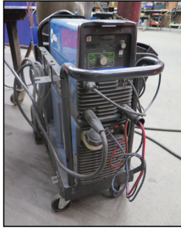
Miller Dynasty 280 Arc Welder