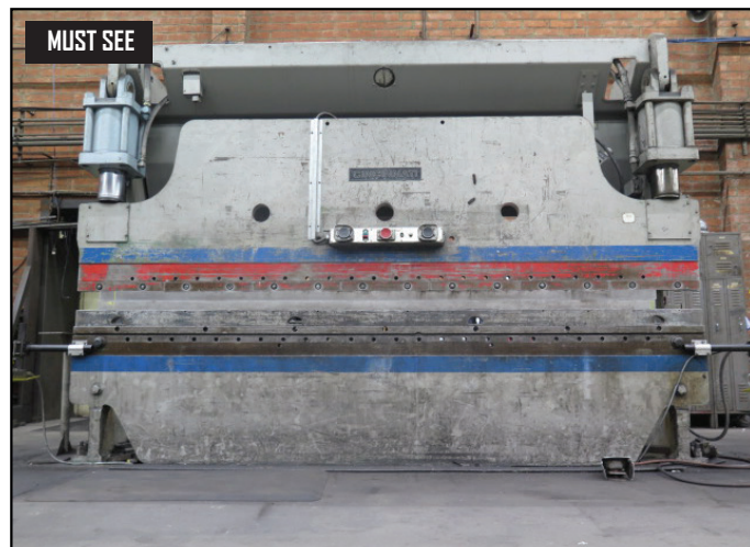
Cincinnati 175 CBx12 175 Ton x 14' Hydraulic Press Brake w/ Manual Back Gauge, 14' Bed Length, 8 1/8" Throat

Miller Spectrum 3080 DC Plasma Cutting Power Source.