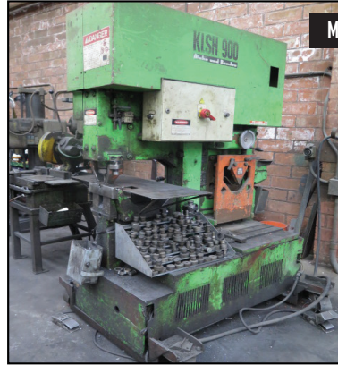
Muhr Bender KLSH900 100-Ton Iron Worker