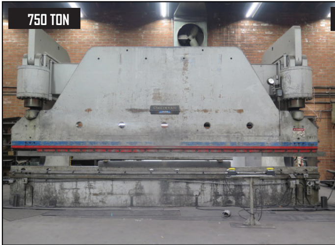
Cincinnati 750H Series x 20' 750 Ton x 24' Hydraulic Press Brake w/ Manual Back Gauging, 24' x 10" Bed, 18" Stroke, 24" Throat, 18" Stroke