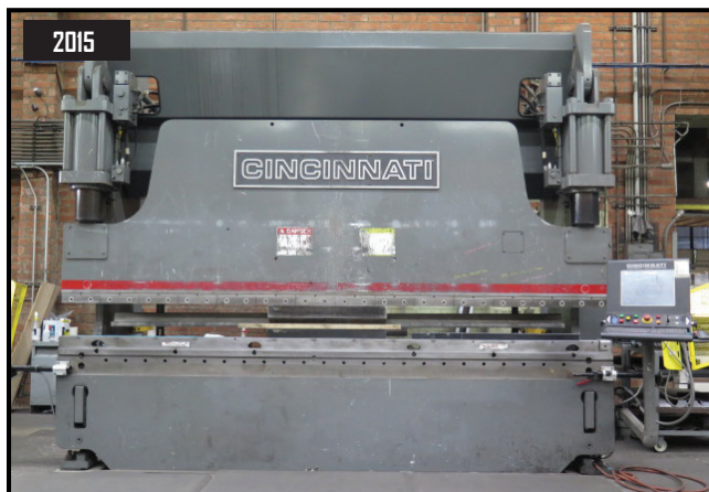
2015 Cincinnati 230PF+12 230 Ton x 14' CNC Hydraulic Press Brake w/ Cincinnati Controls and Back Gauging, 14' Bed Length, 16" Stroke