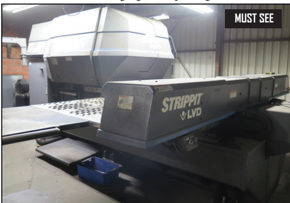
Strippit LVD 1250 H/30 30-Ton CNC Turret Punch Press w/ Fanuc 0-P Controls, 42-Station Turret