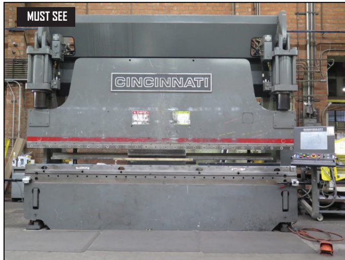
Cincinnati 230PF+12 230 Ton x 14' CNC Hydraulic Press Brake w/ Cincinnati controls and Back Gauging, 14' Bed Length, 16" Stroke