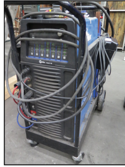
Miller Dynasty 400 Arc Welder