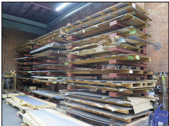
Sheet Stock w/ Racks

Preview: June 10th 2024 from 9:00 a.m. to 3:00 p.m. "On-line bidding thru bidspotter.com"