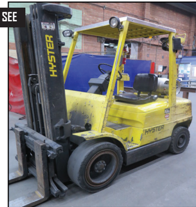
Hyster H60XT 5500 Lb Cap LPG Forklift w/ 3-Stage Mast, 126" Lift Height, Side Shift

ALL MACHINERY MOVERS MUST BE APPROVED BY THE SELLER PRIOR TO REMOVAL OF EQUIPMENT