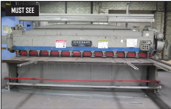
Cincinnati 1812 1/4" x 12' Power Shear w/ Cincinnati Controls and Back Gauging, 84" Squaring Arm