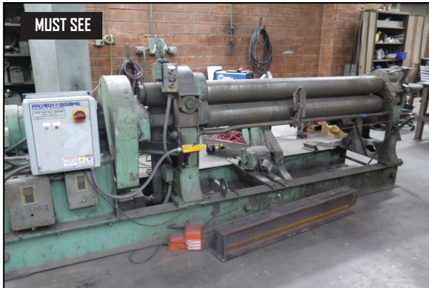
6' Power Roll w/ 7" Tolls