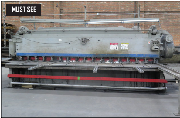
Cincinnati 4316 16' x 3/8" Mechanical Gap Frame Plate Shear w/ Cincinnati Controls and Back Gauging, 36" Shear Gap