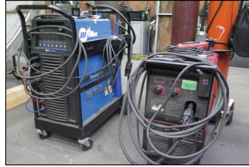
Miller and Lincoln Arc Welders