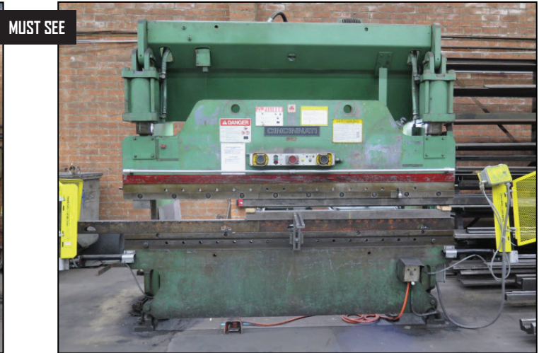
Cincinnati 135 CBx10 135 Ton x 10' Hydraulic Press Brake s/n 44107 w/ Manual Back Gauge, 10' Bed Length, 7 3/8" Throat Depth, Pro-Tech Light Curtain.