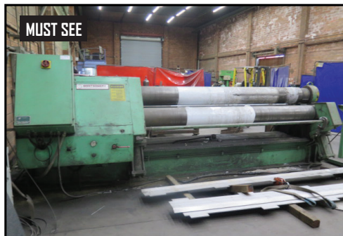
Montgomery 4R12050 4-Roll 10' Power Plate Roll w/ Montgomery Controls, 12" Dia Rolls