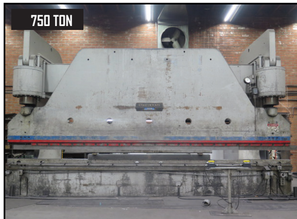
Cincinnati 750H Series x 20' 750 Ton x 24' Hydraulic Press Brake w/ Manual Back Gauging, 24' x 10" Bed, 18" Stroke, 24" Throat, 18" Stroke