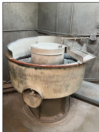
Sweco Vibratory Tumbler