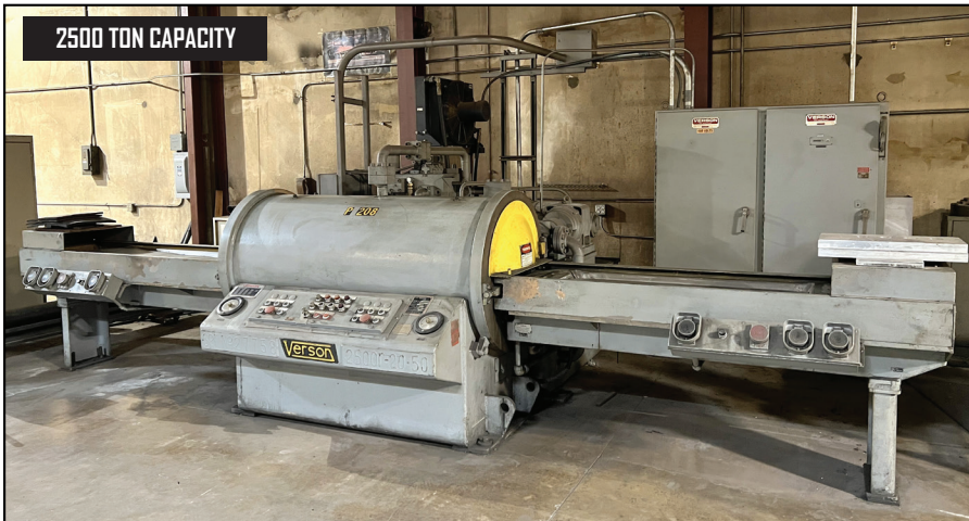
Version 2500R-20-50 2500 Ton Hydraulic Bladder Press s/n 27758 w/ Version Controls, 5000 Max PSI, 20" x 50" Platen Area, 4" Platen Depth.