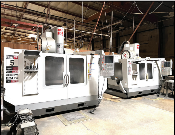
View of Haas Department