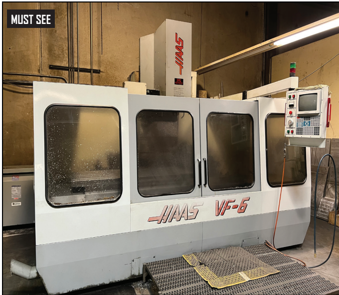
1995 Haas VF-6 4-Axis CNC Vertical Machining Center s/n 5724 w/ Haas Controls, 20-Station ATC, BT-40 Taper Spindle, Programmable Coolant Nozzle, Chip Auger, 28" x 64" Table, Coolant.