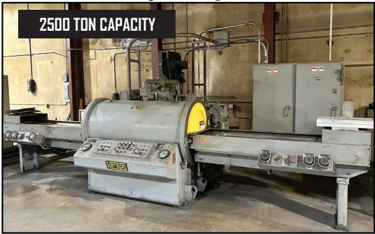
Verson Wheelon 2500R-20-50, 2500 Ton Hydraulic Bladder Press s/n 27758

PRESORTED First-Class Mail U.S. Postage PAID STA CLARITA, CA Permit No. 298