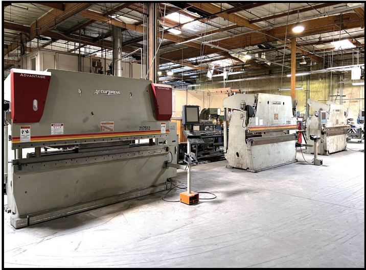
View of Accurpress Forming Department