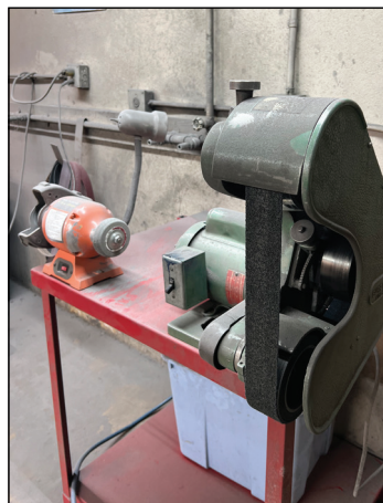
(2) Burr King mdl. 482 2" Belt Sanders