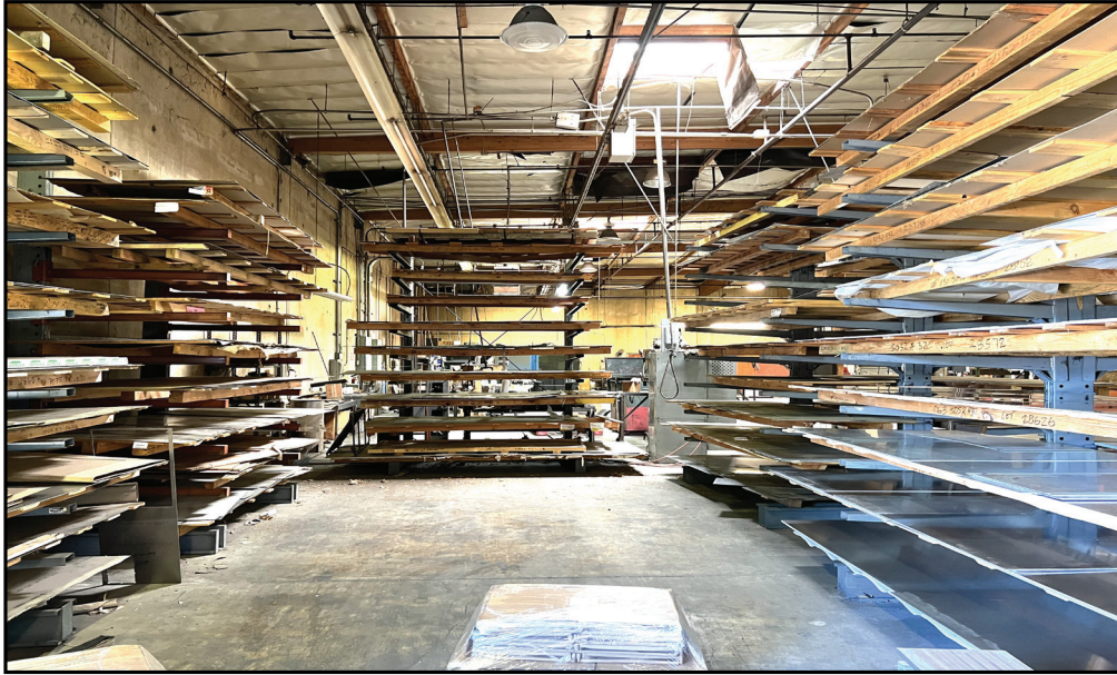
Large Quantity of Sheet Stock Including Aluminum, Stainless, Galvanized and Steel.