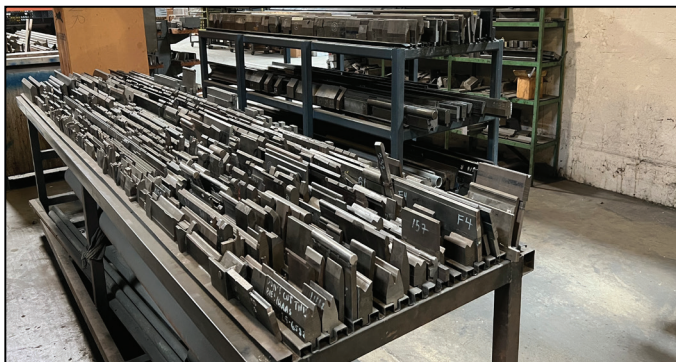
Partial view of forming dies

DiAcro 14-48-2 14GA x 48" Hydrapower Press Brake s/n 6820477132 w/ Dial Back Gauge, 6 3/8" Throat, 36" Between Uprights