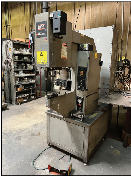
Haeger 824-1L 8 Ton x 24" Hardware Insertion Press s/n 08L00523 w/ Haeger ModularBowl Feeder, Haeger Tool Protection System, Digital Counters.