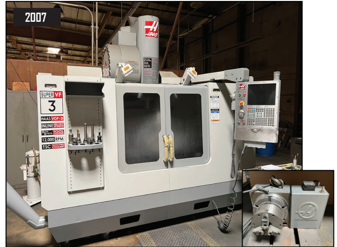
2007 Haas Super VF-3SS 5-Axis CNC Vertical Machining Center s/n 1056899 w/ Haas Controls, Hand Wheel 24-Station Side Mount ATC, CAT-40 Taper Spindle, 12,000 RPM, Haas VOP-D, Inline Direct Drive Spindle, High Speed Tool Changer, TSC Thru Spindle Coolant, High Speed Machining, 16mb Expanded Memory, 208/230V, Brushless "A" and "B" Axes, Rigid Tapping, Coordinate Rotation and Scaling, Macros, M19 Spindle Orientation, Second MOCON Board, VQCPS Probing System, Intuitive Programming System, Chip Auger, Coolant.