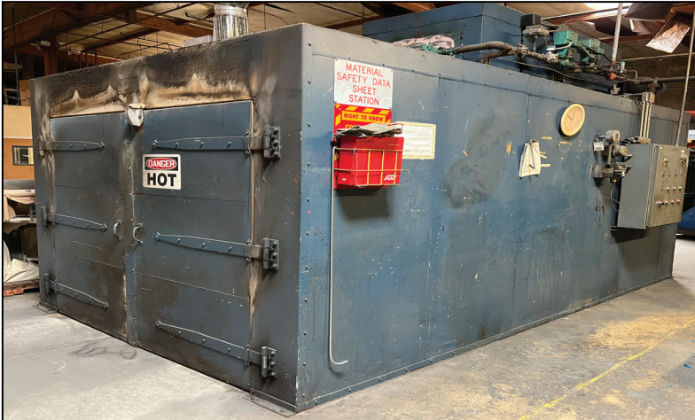
Gas Fired Curing Oven w/ Double Doors.