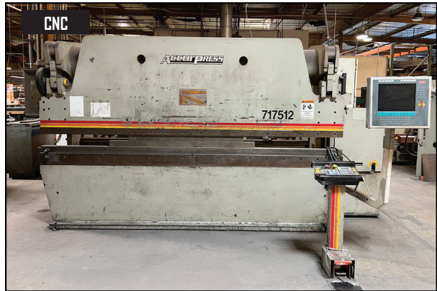
2002 Accurpress 717512 175 Ton x 12' CNC Hydraulic Press Brake s/n 7285 w/ Accurpress Controls and ETS CNC Back Gauging, 10 1/4" Throat.