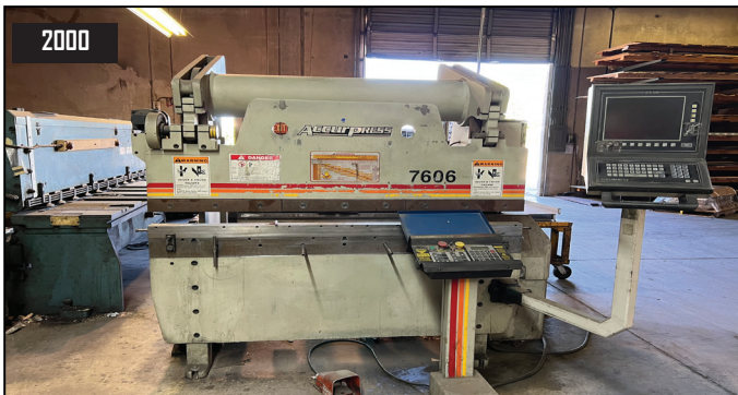
2000 Accurpress 7606 60 Ton x 6' CNC Hydraulic Press Brake s/n 6441 w/ Accurpress ETS 3000 Controls, Accurpress ETS Pendant Control, 8 1/4" Throat.