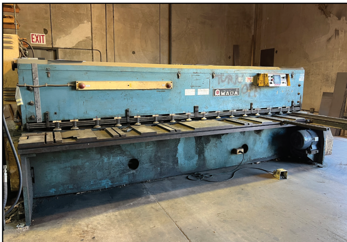
Amada M-4045 3/16" x 157" Gap-Frame Power Shear s/n 4045080 w/ Amada Controls and Back Gauging, 120" Squaring Arm, Front Supports.