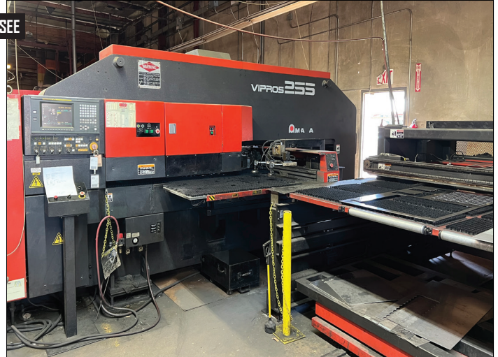
2000 Amada VIPROS 358 KING II 30-Ton 58-Station CNC Turret Punch Press s/n 35840425 w/ Fanuc Series 18-P Controls, (4) Indexing Tool Positions, Brush-Top Table, Amada MP1225NJ Automatic Sheet Loader / Unloader.