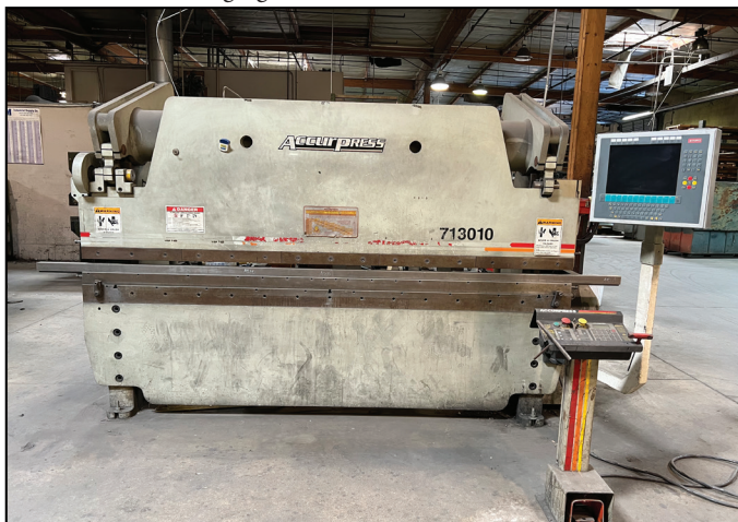
2001 Accurpress 713010 130 Ton x 10' CNC Hydraulic Press Brake s/n 6776 w/ Accurpress Controls and Back Gauging, Accurpress ETS Control, 12 3/4" Throat.