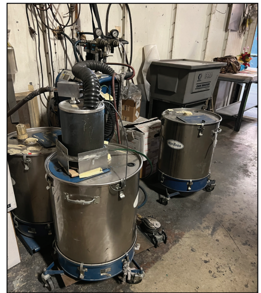
Nordson Powder Paint Spray Units w/Access.