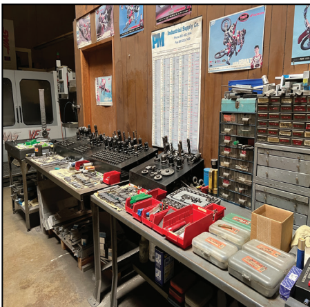
Partial view of tooling