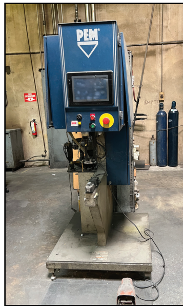
PEM Serter Series 2000A Hardware Insertion Press s/n 2017A-560 w/ Touch-Screen Controls, Bowl Feeder.