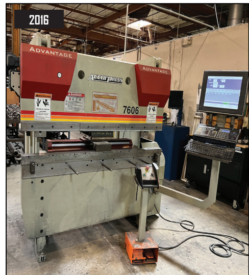
2016 Accurpress Advantage 7606 60 Ton x 6' CNC Hydraulic Press Brake s/n 132575 w/ Accurpress Touch-Screen Controls, Accurpress ETS Control, 8" Throat.