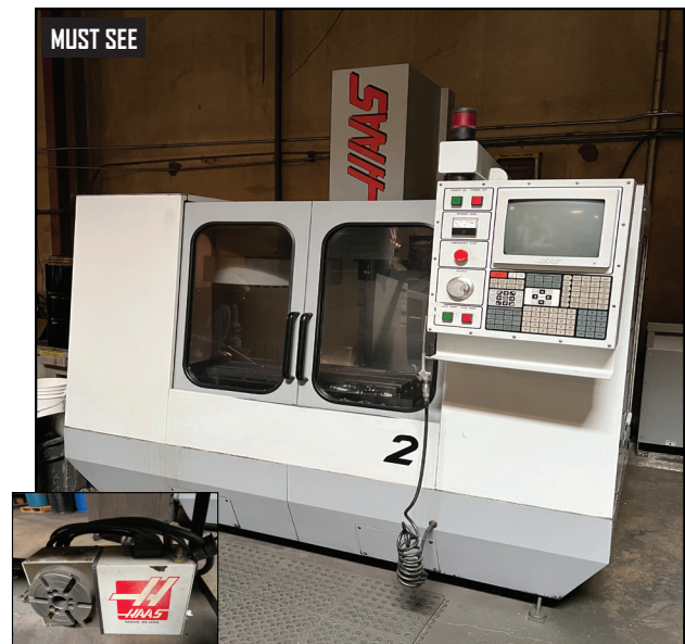
1994 Haas VF-2 4-Axis CNC Vertical Machining Center s/n 3524 w/ Haas Controls, 20-Station ATC, BT-40 Taper Spindle, Programmable Coolant Nozzle, Chip Auger, 14" x 36" Table, Coolant.