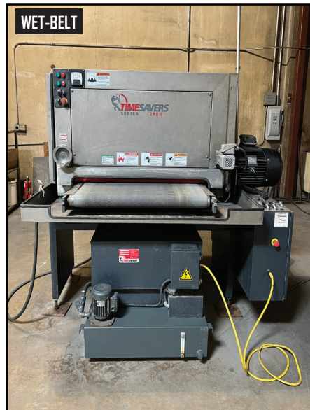
Timesavers 2111-13-0 36" Wet-Belt Grainer s/n SN34194 w/ 36" Belt Feed, Particulate Separation and Filtration System.