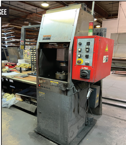
2000 Amada TOGU III Punch and Die Grinder s/n 3020284 w/ 6" 3-Jaw Chuck, Diamond Grinding Wheel, Coolant.