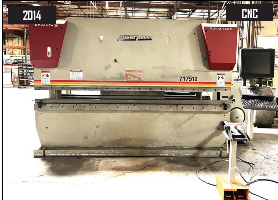
2014 Accurpress Advantage 177512 175 Ton x 12' CNC Hydraulic Press Brake s/n 11867 w/ Accurpress ETS Controls and CNC Back Gauging, 10 3/4" Throat.