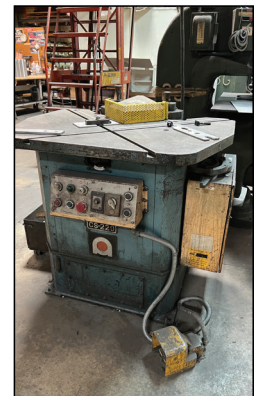
Amada CS-220 8 5/8" x 8 5/8" Hydraulic Corner Notcher.