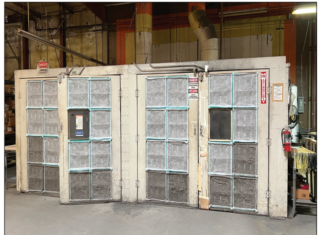
Large Enclosed Dual Station Powder Paint Booth.