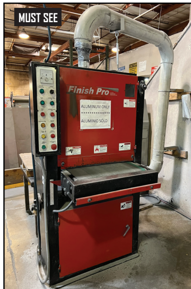
Finish-Pro 24" Belt Grainer w/ 24" Belt Feed, AT Industrial Water-Filtered Dust Collector.