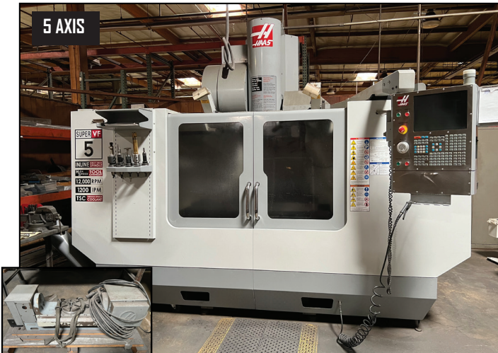
2009 Haas Super VF-5SS 5-Axis CNC Vertical Machining Center s/n 1072767 w/ Haas Controls, Hand Wheel, 24-Station Side Mount ATC, CAT-40 Taper Spindle, 12,000 RPM, Inline Direct Drive Spindle, 1200 IPM, TSC Thru Spindle Coolant, High Speed Machining, 16mb Expanded Memory, Brushless "A" and "B" Axes, Rigid Tapping, Coordinate Rotation and Scaling, Macros, M19 Spindle Orientation, Second MOCON Board, Wireless Intuitive Probing System, Chip Auger, Coolant.