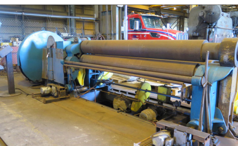
KLING BROTHERS PLATE BENDING ROLL VIEW LOT #6