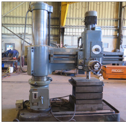
AMERICAN TOOL RADIAL ARM DRILL VIEW LOT #15