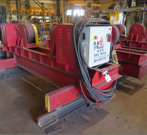
ROMAR PR30/45DM TURNING ROLLS VIEW LOT #4