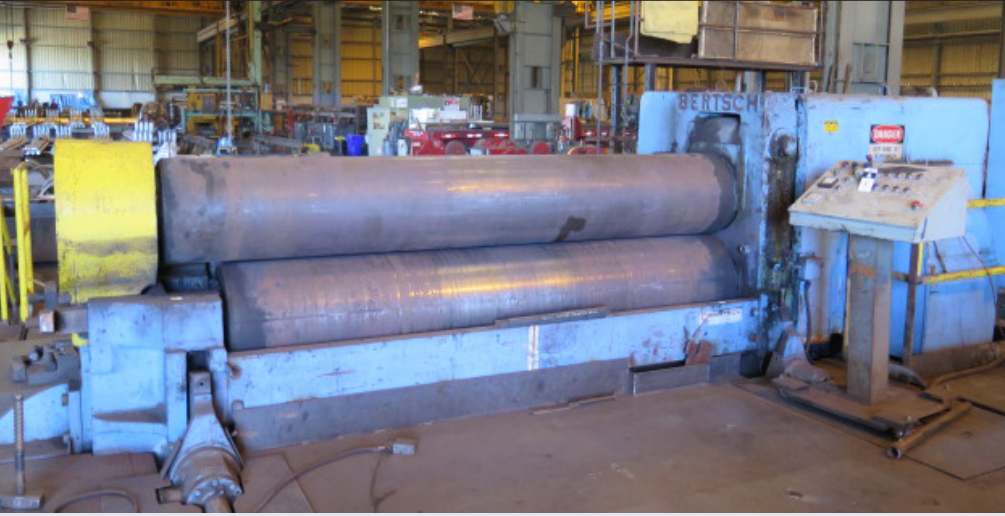
BERTSCH #20 INITIAL PINCH PLATE BENDING ROLL VIEW LOT #5