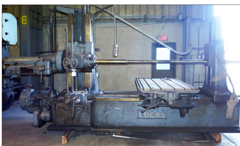
LUCAS NO. 42" PRECISION BORING MILL VIEW LOT #12