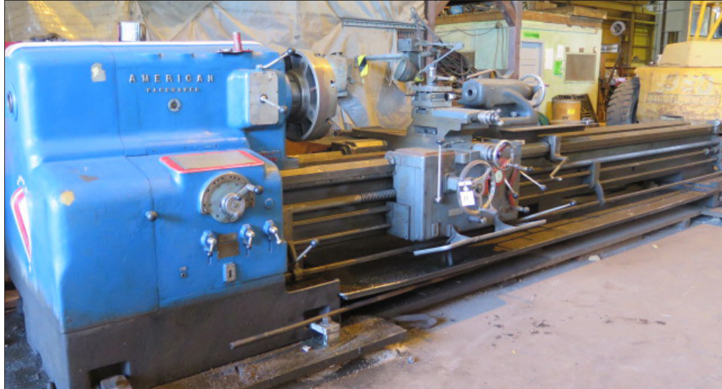
AMERICAN PACEMAKER STYLE "F" ENGINE LATHE VIEW LOT #11