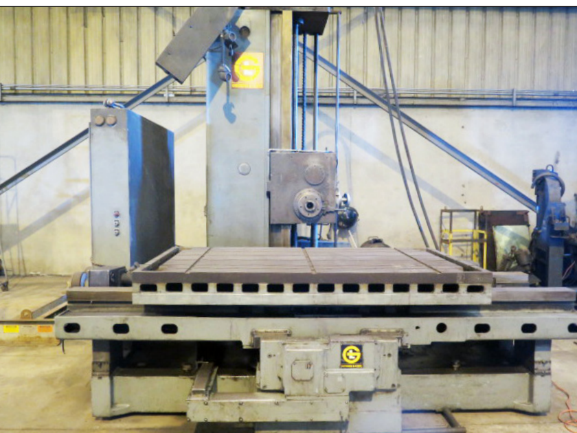
GIDDINGS & LEWIS 70-E4-T HORIZONTAL BORING MILL VIEW LOT #13