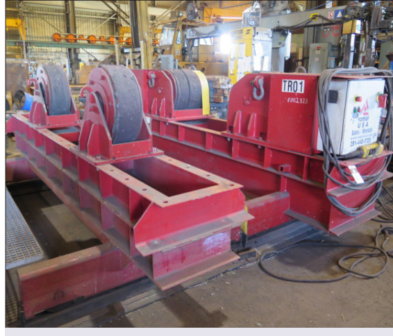
ROMAR PR60/100DM TURNING ROLL VIEW LOT #3