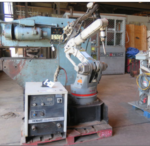
MOTOMAN ROBOTIC WELDING CELL VIEW LOT #9