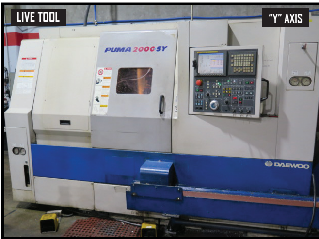
2004 Daewoo PUMA 2000SY Twin Spindle CNC Turning Center w/ Fanuc 18i-TB Controls, Tool Presetter, 12/24-Station Live Turret