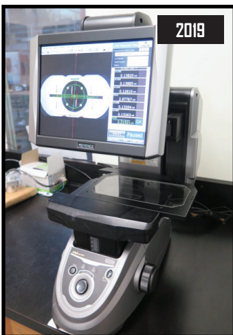
Keyence IM-Series iPass IM-6225 Video CMM Machine

2004 Daewoo PUMA 2000SY Twin Spindle CNC Turning Center s/n P200ST0260 w/ Fanuc 18i-TB Controls, Tool Presetter, 12/24-Station Live Turret, Parts Catcher, and Conveyor, 8" 3-Jaw Main Power Chuck, 6 1/2" 3-Jaw Sub Power Chuck, S-26 Main Spindle Nose, 3J Sub Spindle Nose, Chip Conveyor, Coolant.