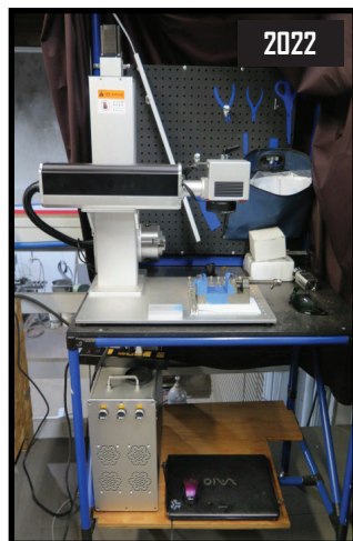
2022 M7 Fiber Laser Engraving Machine w/ JPT MOPA M7 60watt Fiber Laser Source, 4th Axis Head