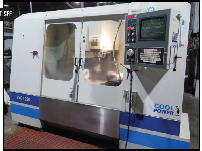
2000 Fadal VMC4020HT 4-Axis CNC VMC w/ Multi Processor CNC Controls, 21-ATC, CAT-40 Spindle, 10,000 RPM