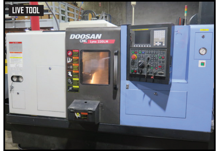
2010 Doosan LYNX 220 LMA Live Turret CNC Turning Center w/ Doosan-Fanuc Controls, Tool Presetter, 12/24-Station Live Turret, Rigid Tapping