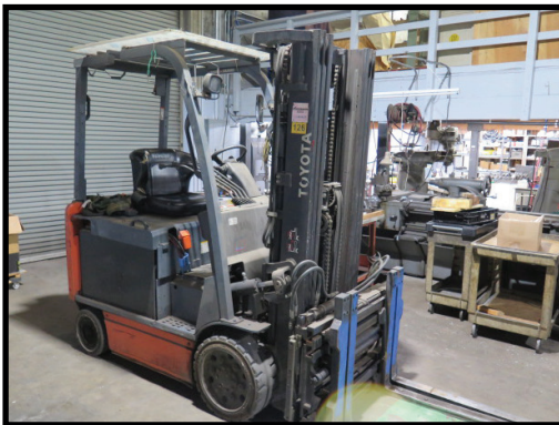
Toyota 8FBCU20 Single-Double Electric Forklift s/n 62017 w/ 3-Stage Mast, 187" Lift Height, Single-Double Forks, Solid Tires, 12,083 Hours, Charger.