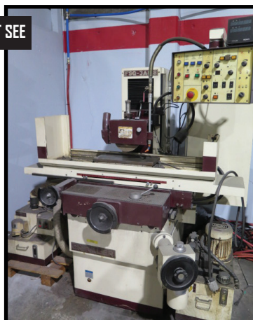
Falcon Chevalier FSG-3A818 8" x 18" Automatic Surface Grinder