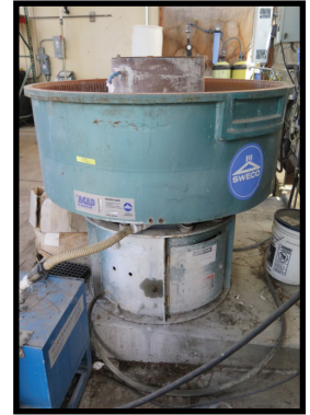
Sweco Media Tumbler