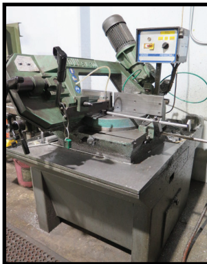
Pedrazzoli SN300 Miter Band Saw