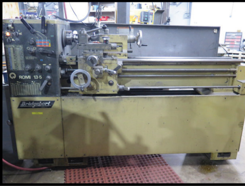
Bridgeport / Romi 13-5 13" x 42" Geared Head Lathe w/ 50-2500 RPM, Inch/mm Threading, Tailstock, 8" Chuck