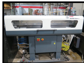
LNS Alpha SL65 Automatic Bar Loader / Feeder