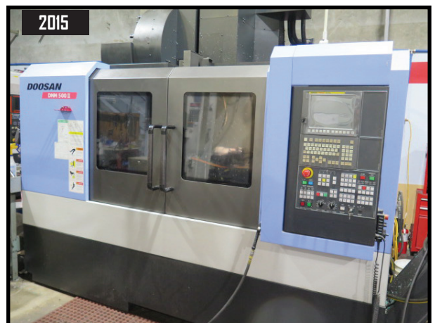
2015 Doosan DNM500 II 4-Axis CNC VMC w/ Doosan- Fanuc I Series Controls, 30-ATC, CAT-40, Renishaw Wireless Tool Setting Probe, CAT-40 Wireless Probe Head, 12,000 RPM