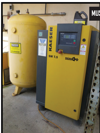
2015 Kaeser SM7.5 7.5Hp Rotary Air Compressor

2022 M7 Fiber Laser Engraving Machine w/ JPT MOPA M7 60watt Fiber Laser Source, 4th Axis Head, (2) Lenses, Access. Pedrazzoli SN300 Miter Band Saw w/ Speed Clamping, Coolant, Conveyor. Grob 4V-18 18" Vertical Band Saw s/n 3603 w/ Blade Welder, Fence, Falcon Chevalier FSG-3A818 8" x 18" Automatic Surface Grinder w/ Sony LH51 DRO, Automatic Cycles, Walker Fine-Line Electromagnetic Chuck, Coolant Filtration and Dust Collection System. Burr King mdl. 760 2" Pedestal Belt Sander. Darex M-Series Precision Drill Sharpener. Accu-Finish Tool Lapper. Dayton Pedestal Grinder. Jet Pedestal Grinder. Demco High Speed Polisher/Grinder. Rockwell 4-Head Gang Drill Press. Ellis M9000 Variable Speed Pedestal Drill Press 90D01081 w/ 17" x 18" Table.