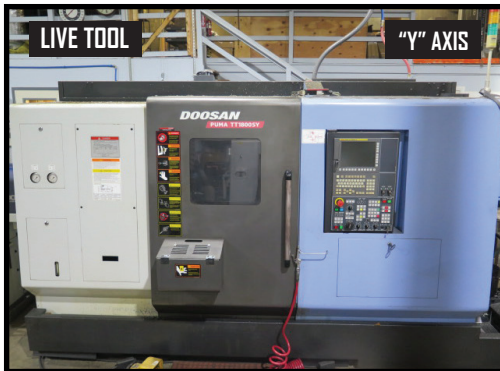
2013 Doosan PUMA TT 1800SY Twin Spindle - Twin Live Turret CNC Turning Center w/ Fanuc 31i-B Controls, Tool Presetter, (2) 12/24-Station Live Turrets, "Y" Axis