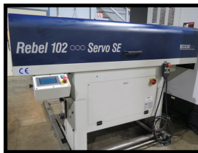
Edge Technologies Rebel 102 Servo SE Automatic Bar Loader / Feeder