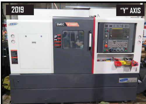
2019 SMEC SL 2000SY Twin Spindle Live Turret CNC Turning Center w/ Fanuc 0i-TF Controls, Tool Presetter, 12/24 Station Live Turret, "Y" Axis