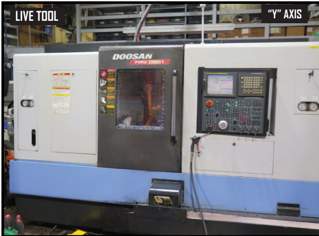
Doosan PUMA 2000SY Twin Spindle CNC Turning Center w/ Fanuc 18i-TB Controls, Tool Presetter, 12/24-Station Live Turret, "Y" Axis