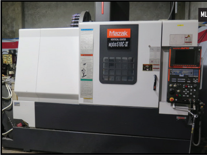
2007 Mazak Nexus 510C-II CNC VMC w/ Mazatrol Matrix Nexus Voice Advisor Controls, 30-ATC, CAT-40, Renishaw Probe System, 12,000 RPM