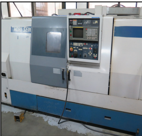
Mori Seiki SL-25B CNC Turning Center w/ Fanuc MF-T6 Controls, 10-Station Turret, Tailstock, 10" Power Chuck