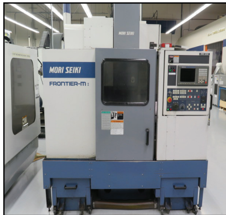
Mori Seiki Frontier-M1 CNC VMC w/ Mori Seiki MSC-521 Controls, 20-Station Side Mount ATC, CAT-40