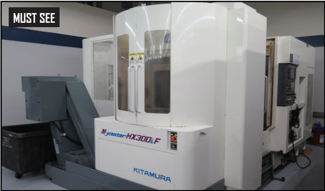
MUST SEE Kitamura Mycenter HX300iF 2-Paller 4-Axis CNC HMC w/ Fanuc 16i-MB Controls, 140-Station Extended ATC, CAT-40, Laser Tool Presetter