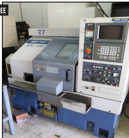
Mori Seiki CL-20B CNC Turning Center w/ MSC-518 Controls, 10-Station Turret, 5C Nose