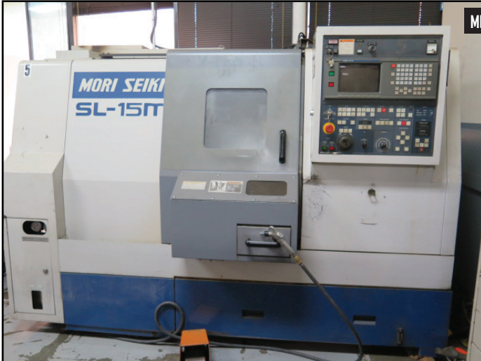
Mori Seiki SL-15 MC Live Turret CNC Turning Center s/n 250827 w/ MSC-516 Controls, Tool Presetter, 12-Station Turret / 6-Live Stations