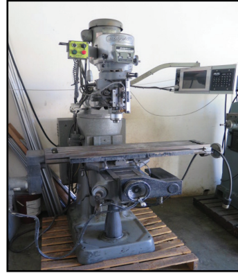
Bridgeport 2-Axis CNC Vertical Mill w/ Bridgeport / EMI CNC Controls