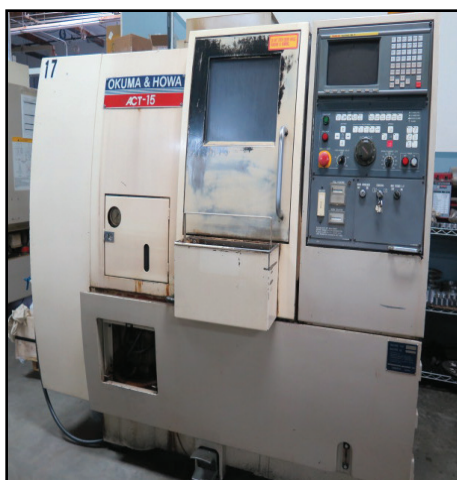
Okuma & Howa ACT-15 CNC Turning Center w/ Fanuc 18-T Controls, 8-Station Turret, Parts Catcher, 16C Nose