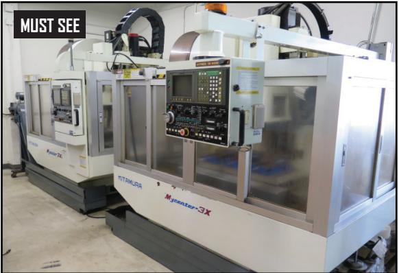
MUST SEE Kitamura Mycenter VMC's