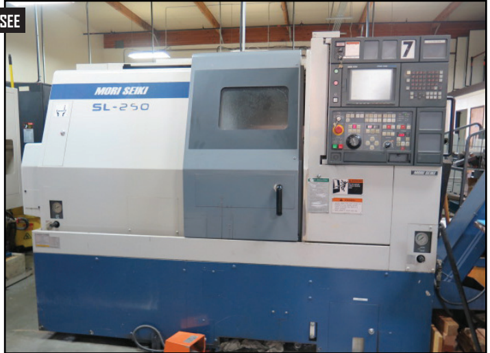
1997 Mori Seiki SL-250B CNC Turning Center w/ MSC-500 Controls, Tool Presetter, 10-Station Turret, Tailstock, 10" Power Chuck