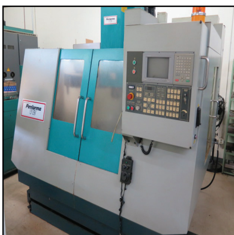
Akira Seiki Performa V2 CNC VMC w/ Mitsubishi Controls, 20-Station ATC, CAT-40