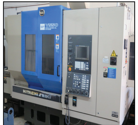
Hitachi Seiki VS50 2-Pallet CNC VMC w/ Secos Σ18M Controls, 30-Station ATC, CAT-40