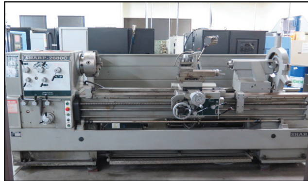
1996 Sharp 2680C 26" x 80" Geared Head – Gap Bed Lathe w/ 15-1500 RPM, 3 1/8" Thru Bore, Inch/mm Threading, Tailstock, 12" Chuck