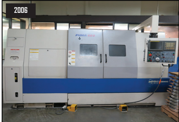
2006 2006 Doosan Daewoo PUMA 400B CNC Turning Center w/ Fanuc 21i-TB Controls, Tool Presetter, 12-Station Turret, Tailstock, 15" Power Chuck