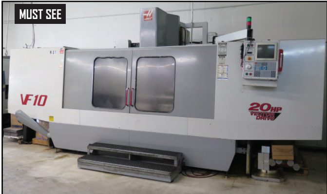
MUST SEE 1999 Haas VF-10 4-Axis CNC VMC w/ Haas Controls, 20-Station ATC, CAT-40, 7500 RPM, Rigid Tapping, 20