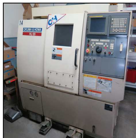
Okuma & Howa HL-20 CNC Turning Center w/ Fanuc 18i-T Controls, 12-Station Turret, Tailstock, 16C Nose