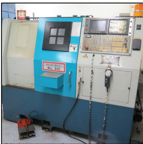
1999 Akira Seiki SL30 CNC Turning Center w/ Fanuc 0-T Controls, Tool Presetter, 12-Station Turret, Tailstock, 6 1/2" Power Chuck