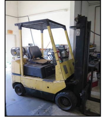
TCM FCG25N5 5000 Lb Cap LPG Forklift