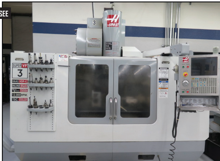
2007 Haas Super VF-3SS CNC VMC w/ Haas Controls, 24-Station Side Mount ATC, CAT-40, 12,000 RPM, Thru Spindle Coolant