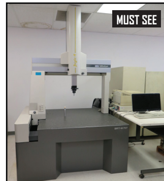
Mitutoyo Bright-M" BTR-M707 CMM Machine

Inspection : Mitutoyo "Bright Apex" mdl. BRT A 1220CMM Machine s/n 1023804 w/ Renishaw PH10M Probe Head, Renishaw PHC10-3 Probe Head Controller, Joystick Controls, PI 200 Probe Interface, Computer. (Machine is complete and professionally prepped for transportation). Mitutoyo "Bright-M" BTR-M707 CMM Machine s/n 0027701 e/ Renishaw MH-8 Probe Head, 27.75" x 27.75" x 23.81" Work Envelope (NEEDS COMPUTER). Sheffield Cordax Discovers D-8 CMM Machines/n P-0424-0799 w/ Renishaw MH8 Probe Head, MRC20 6-Tip Tip Changer, Rolling Base (NO COMPUTER). MicroVu mdl. H-14 14" Optical Comparator s/n 3328 w/ Sargon Gold Index DRO, Surface and Profile Illumination.