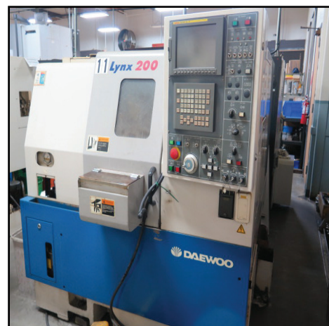
2000 Daewoo LYNX 200B CNC Turning Center w/ Fanuc 21i-T Controls, Tool Presetter, 12-Station Turret, Parts Catcher, 5C Nose