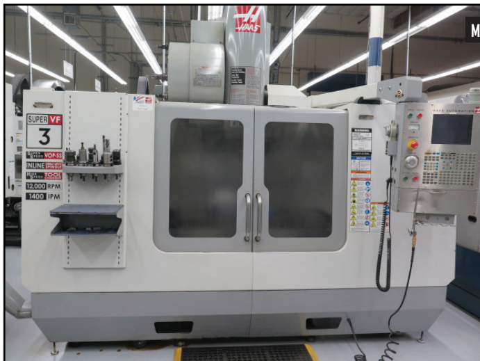
2006 Haas VF-3SS 4-Axis CNC VMC w/ Haas Controls, 24-Station Side Mount ATC, BT-40, 12,000 RPM, Rigid Tapping