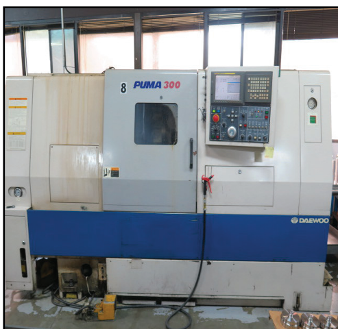
2000 Daewoo PUMA 300B CNC Turning Center w/ Fanuc 18i-T Controls, Tool Presetter, 12-Station Turret, Tailstock, 10" Power Chuck