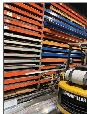
Large selection of Pallet Racking.

ALL MACHINERY MOVERS MUST BE APPROVED BY THE SELLER PRIOR TO REMOVAL OF EQUIPMENT