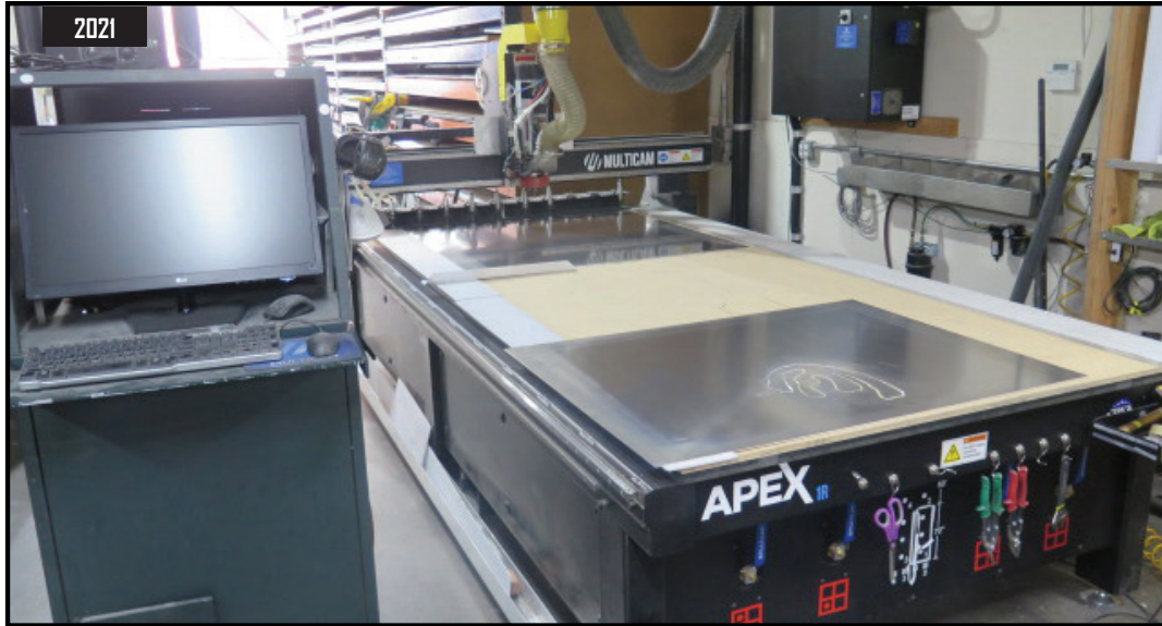
2021 Multicam APEX 1R 4' x 10' CNC Router w/ Hand Controller, 10-Station Tooling Rack, CAT-30 Spindle, 12,000 RPM