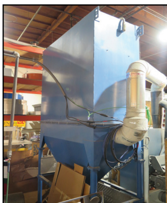
Torit mdl. 120 Dust Collector