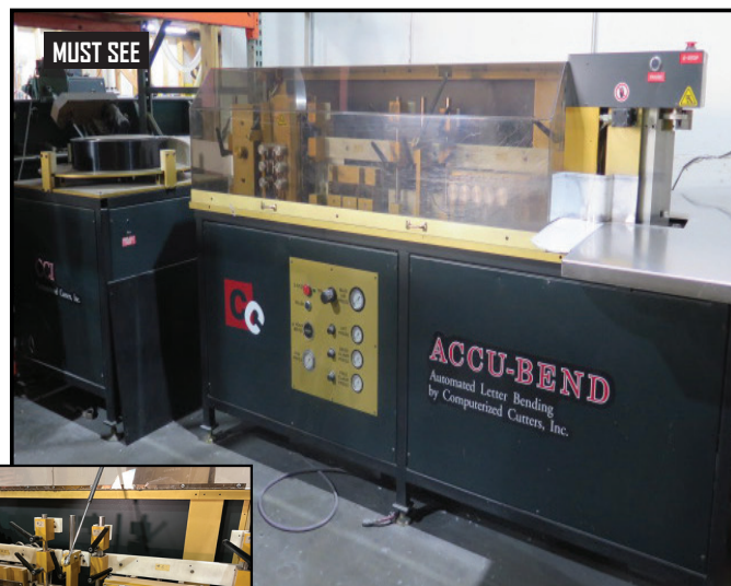
2005 CC "Accu-Bend 410" Automated Letter Bending Machine w/ 1"- 6" Letter Height