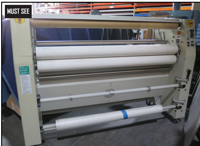
GBC Pro-Tech F-60 60" Laminator