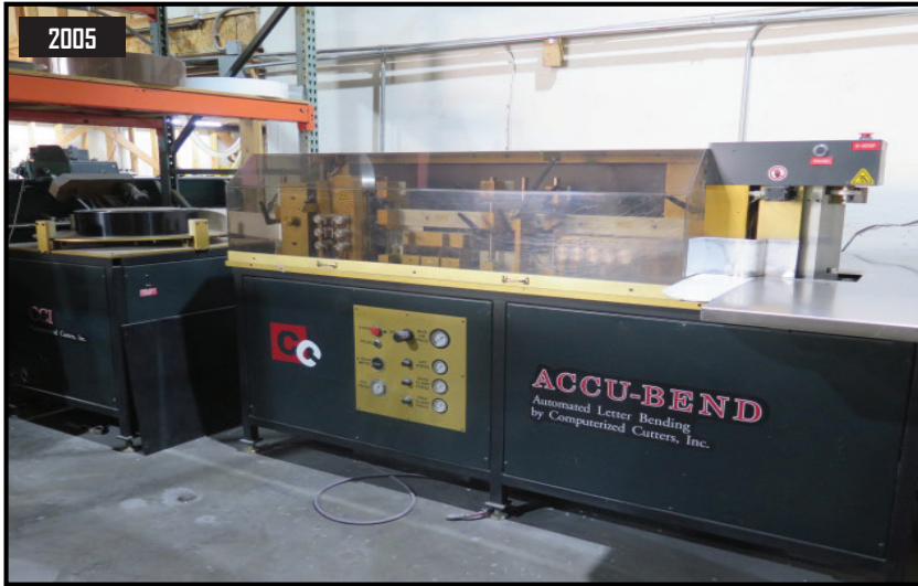
2005 CC "Accu-Bend 410" Automated Letter Bending Machine w/ 1" - 6" Letter Height