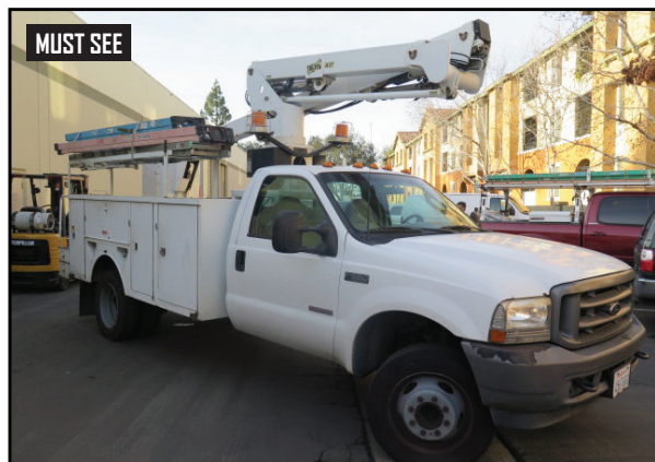
2003 Ford F-550 XL Super Duty Bucket Boom Lift Truck Lisc# 45676G1 w/ Power Stroke V8 Turbo Diesel Engine, Automatic Trans, Telsta A37 Boom Lift Attachment, VIN#1FDAF56P53ED42471.