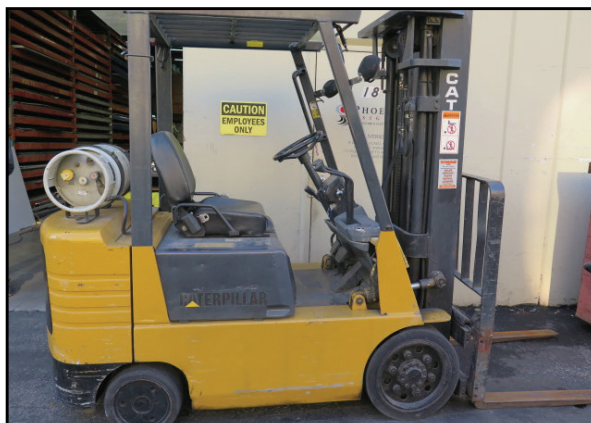
Caterpillar GC25 4700 Lb Cap LPG Forklift