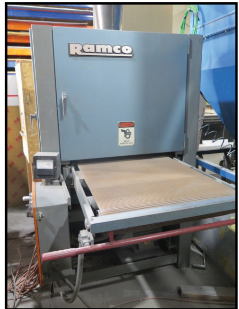
Ramco 25T/60 24" Wide Belt Sander