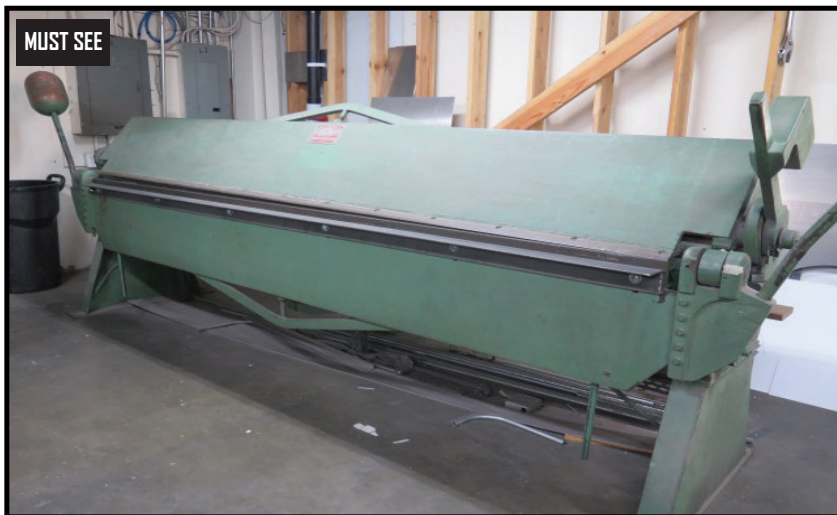
Chicago SO.1016 10' x 16GA Box and Pan Brake