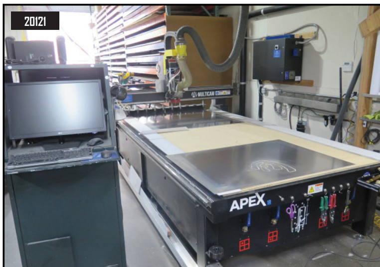
2021 Multicam APEX 1R 4' x 10' CNC Router w/ Hand Controller, 10-Station Tooling Rack, CAT-30 Spindle, 12,000 RPM