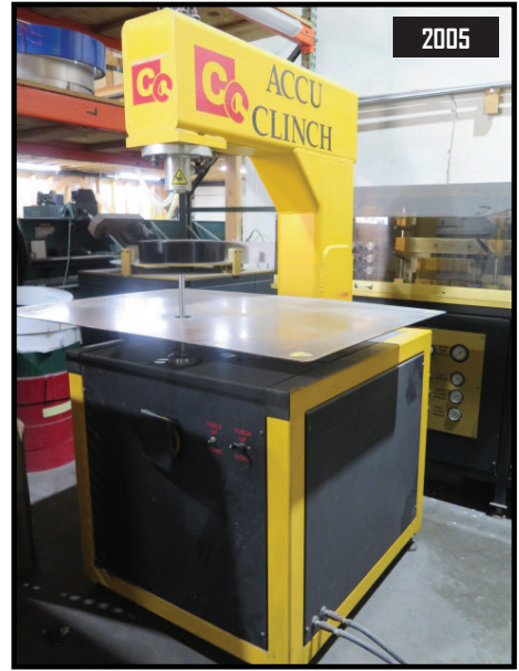
2005 CC "Accu-Clinch 925" Pneumatic Clinch Fastening Machine