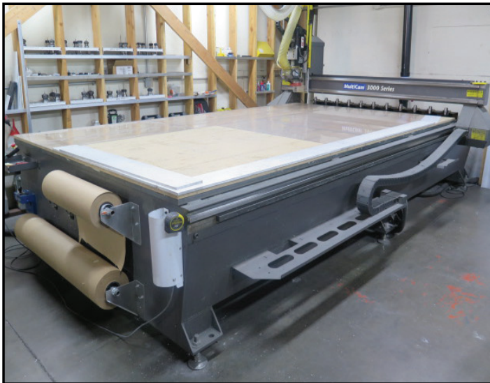
Multicam 3000 Series 6' x 12' CNC Router w/ Hand Controller, 10-Station Tooling Rack, HSK-63 Spindle, 18,000/24,000 RPM