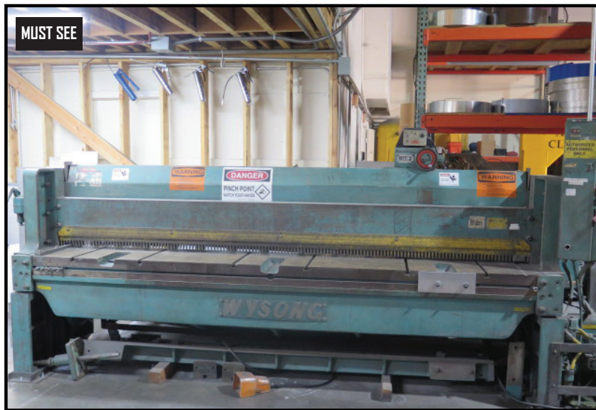
Wysong 1010 10' x 10GA (3/16") Power Shear