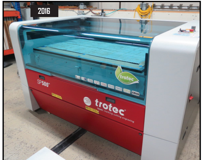
Trotec "Speedy 500" SP500 Laser Marking, Cutting and Engraving System w/ 8" x 49" Working Area