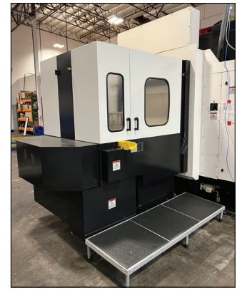
2018 MAZAK VCN 530C CNC VMC WITH PALLET CHANGER, 48 ATC, CAT 40, 41.13" X 20.08" X 20.08 (XYZ), TABLE SIZE 51.18", MEZATROL SMOOTH G CONTROL, MAYFRAM CHIP CONVEYOR, SUPERFLOW V8M-1000 HIGH PRESSURE COOLANT, 12,000 RPM, USED FOR R AND D WITH VERY LOW HOURS, S/N 296516.