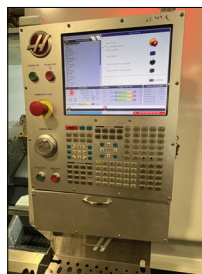
2018 HAAS ST-40 CNC TURNING CENTER, 15" CHUCKS, 34" SWING, 2400 RPM, 44" DISTANCE BETWEEN CENTER, 12 STATION, CHIP CONVEYOR, TAIL STOCK, S/N 3112509.