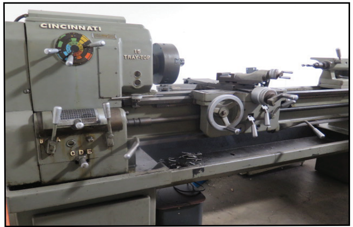
Cincinnati "15 Tray-Top" 15" x 54" Geared Head Lathe w/ 37-1470 RPM, Inch Threading, Tracer Attach, Tailstock