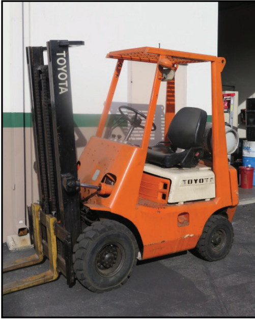
Toyota 3FGH15 3000 Lb Cap LPG Forklift w/ 2-Stage Mast, Pneumatic Yard Tires