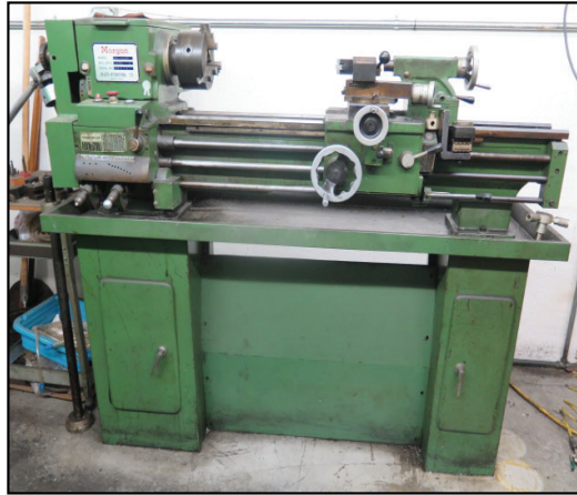
Morgon CBL940 9" x 40" Lathe w/ Inch Threading, Tailstock, Trava-Dial, 5C Collet Closer, 6" 3-Jaw Chuck