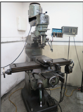
Maxmill Vertical Mill w/ Trak DRO, 80-2720 RPM, Power Feed