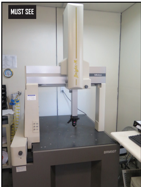
Mitutoyo "Bright-M" BRM507 CMM Machine w/ Renishaw MIP Probe Head, GEOPak GEO Measure Software

5Hp Horizontal Air Compressor w/ 2-Stage Pump, 60 Gallon Tank.