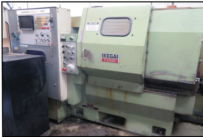
Ikegai FX25N CNC Turning Center w/ Fanuc 6T Controls, 8-Station Turret, 10" 3-Jaw Chuck