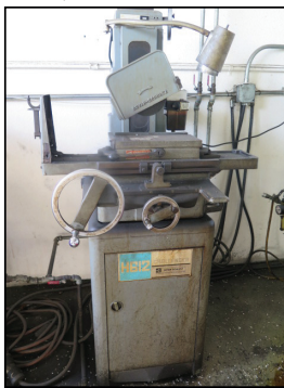
Boyar Schultz Challenger H612 Surface Grinder