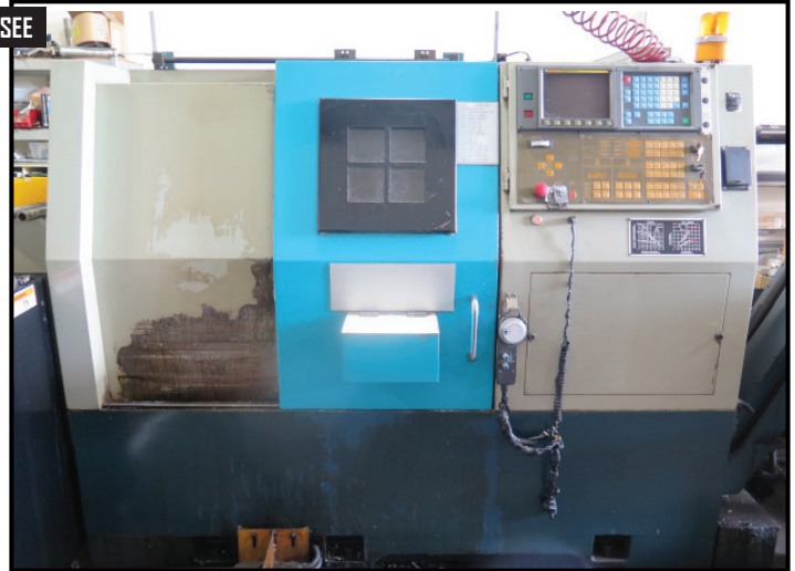
1999 Akira Seiki SL-30 CNC Turning Center w/ Fanuc 0-T Controls, Tool Presetter, 12-Station Turret, Hydraulic Tailstock, 8" 3-Jaw Chuck