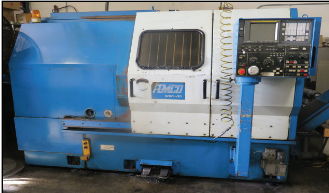
2002 Femco WNCL-30/60 CNC Turning Cener w/ Fanuc 18-T Controls, 12-Station Turret, Hydraulic Tailstock, 10" 3-Jaw Chuck