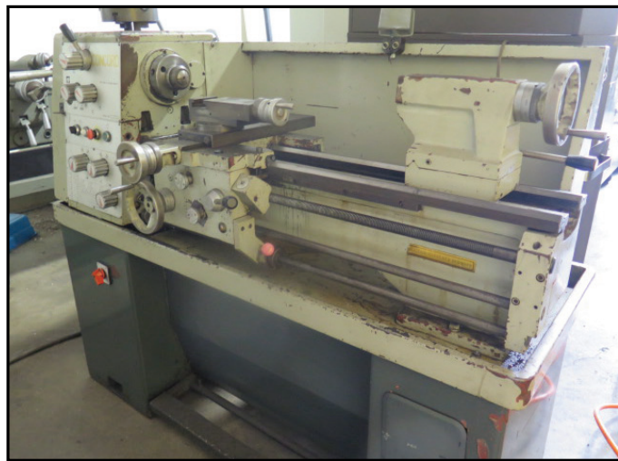
Concord 13" x 30" Lathe w/ 105-2000 RPM, Inch/mm Threading, Tailstock, 5C Collet Closer, 6" 3-Jaw Chuck