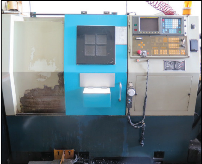
1999 Akira Seiki SL-30 CNC Turning Center w/ Fanuc 0-T Controls, Tool Presetter, 12-Station Turret, Hydraulic Tailstock, 8" 3-Jaw Chuck