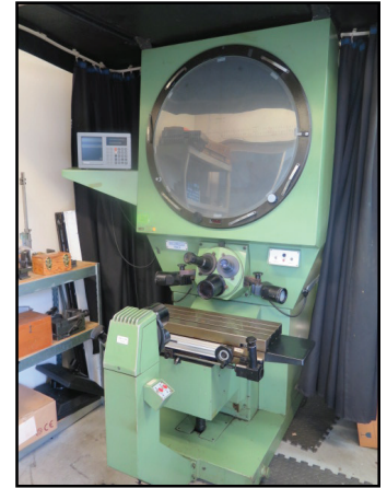
Deltronic 750H Optical Comparator w/ Heidenhain DRO, Digital Angular Readout, 3-Lenses, Surface and Profile Illumination