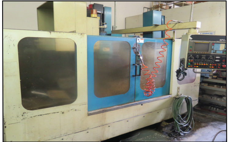
Femco KJV40 CNC VMC w/ Fanuc 0-M Controls, 24-Station Side Mount AYC, BT-40 Spindle