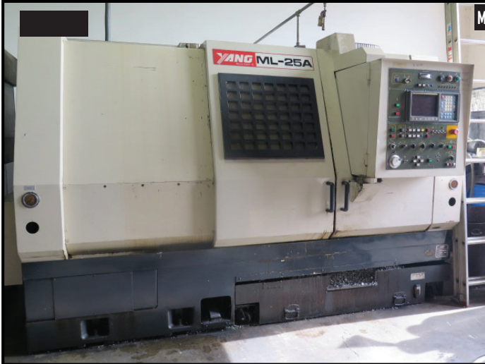
1996 Yang ML-25A CNC Turning Center w/ Fanuc 0-T Controls, 12-Station Turret, Hydraulic Tailstock, 10" 3-Jaw Chuck