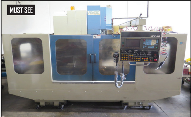
Femtech KFV-40 CNC VMC w/ Fanuc 0-M Controls, 24-Station Side Mount ATC, CAT-40 Spindle