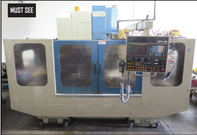
Femtech KJV-40 CNC VMC w/ Fanuc 0-M Controls, 24-Station Side Mount ATC, CAT-40 Spindle