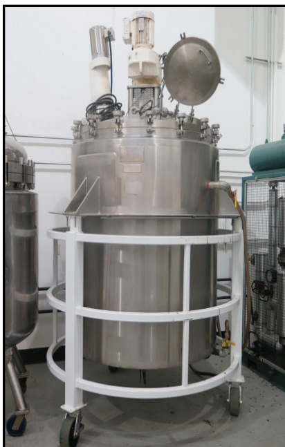
2004 Lee Industries mdl. 325U7S 325 Gallon Stainless Steel Jacketed Pressurized Mixing Tank

2015 COZOLLI RFC-140 Liquid Filling Line, Rated 12-120ML, Labeling Station to Monobloc, Fill Cycle at 50 PPM, Vibratory Sorting System, Cozzoi UT30-981 Descralber. Automated Bottling Line w/ Controls, Single Station Filling, Labeling Station, Out-Feed Turntable, Conveyor, Enclosure Booth with Ventilation