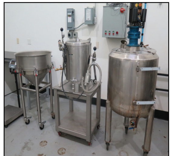
Stainless Steel Mixing Tanks