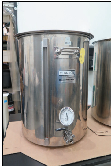
Boiler Maker Engineering 25 Gallon Stainless Steel Tank