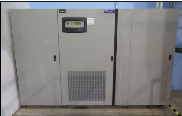
Liebert Npower 80 kVA UPS Power Bank