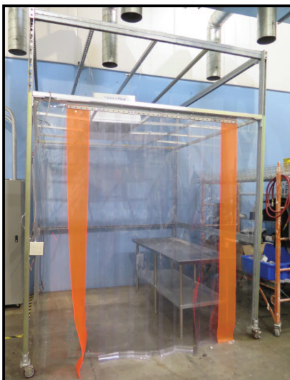
Portable Clean Room