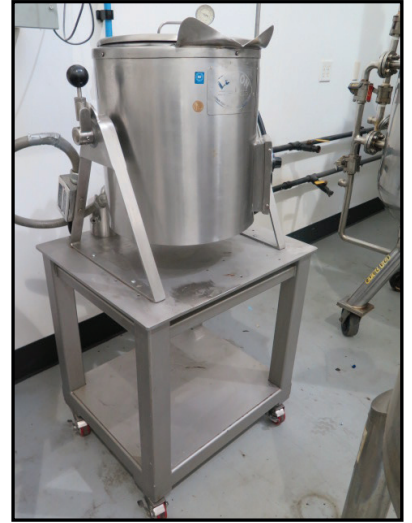
Waynesboro Ind mdl. TEC-20 Stainless Steel Heating Tank w/ 300 Deg F Heat Range (Element Style), Pouring Stand, Rolling Base.