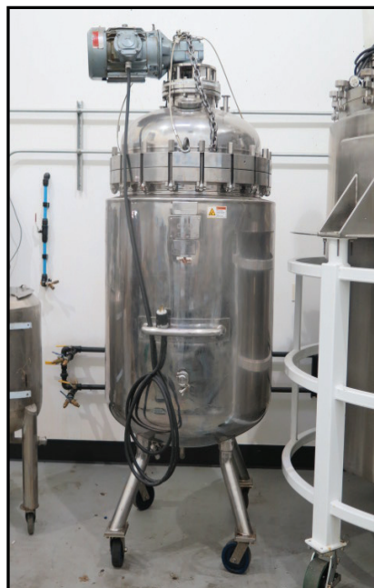
2006 DM Stainless Inc. / Olsa Stainless Steel Jacketed Pressurized Mixing Tank