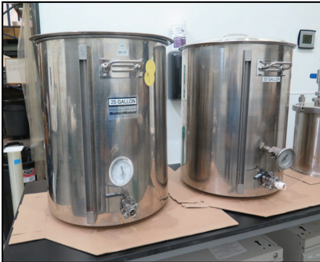
Boiler Maker Engineering 25 Gallon Stainless Steel Tanks