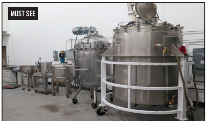
Stainless Steel Mixing Tanks