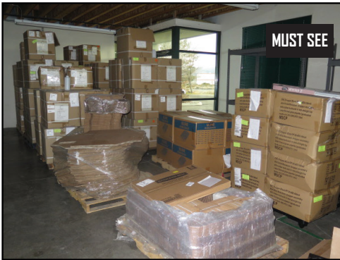
Large Quantity of Glass and Plastic Bottles w/ Caps