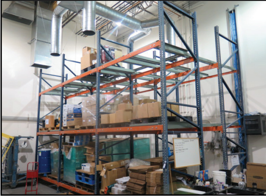
Smith Storage Systems Pallet Storage System (Stacks Horizontally w/ Rollers) 3900 Lb per Pallet x 2-Wide x 3-Deep x 3-Sections High. 54-Pallet Max System