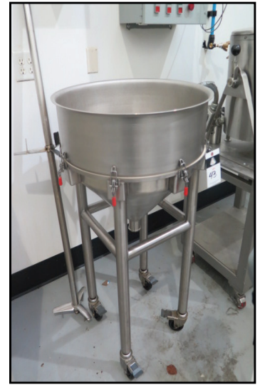
24" Stainless Steel Sieve w/ Rolling Base.