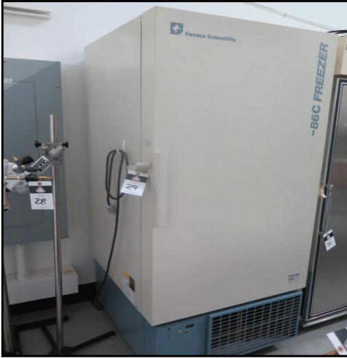
Forma Scientific mdl. 916 -86 Deg C Lab Freezer s/n 49660-1206.