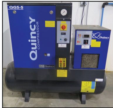
2020 Quincy QGS-5 5Hp Rotary Air Compressor w/ Built-In Dryer, 60 Gallon Tank, 3820 Hours

ALL MACHINERY MOVERS MUST BE APPROVED BY THE SELLER PRIOR TO REMOVAL OF EQUIPMENT