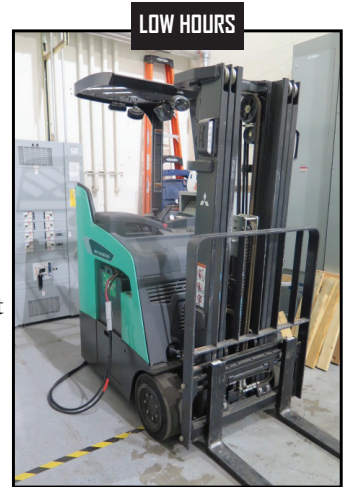
Mitsubishi FBCS16N 3400 Lb Cap Stand-In Electric Pallet Mover ***LATE MODEL -