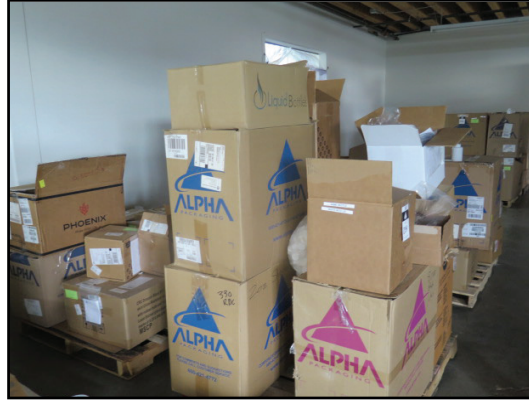
Large Selection of New Bottles and Lab Equipment