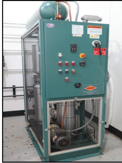
2020 Heat Exchange & Transfer Inc. HOS-EPE-40 40kW 550 Deg F Industrial Thermo Fluid Process Heating System