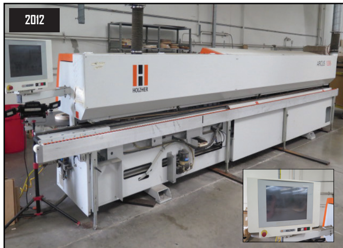
2012 Holzher Arcus 1336 FV2 Edge Bander w/ Holzher Edgecontrol Touch Screen Controls, 0.4-3mm Edge Thickness, 6-60mm Max Workpiece Thickness, GluJet Hybrid Technology