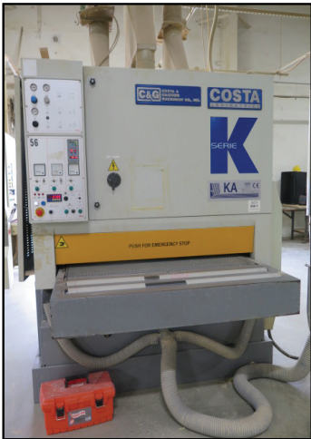
2005 Costa & Grissom KA-CCT 1350 3-Head 52" Wide Belt Sander w/ Costa Controls