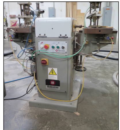
Balestrini "Mirkon" PO2086 2-Slot Mortising Machine