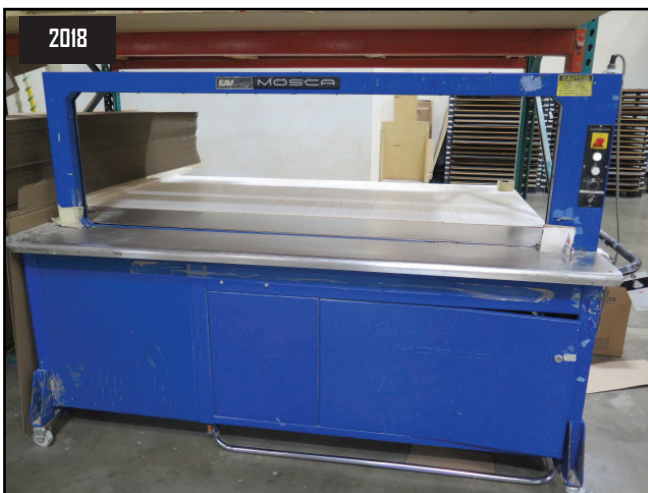
2018 Mosca RO-MP-6T Automatic Strapping Machine w/ 36" x 48" Opening