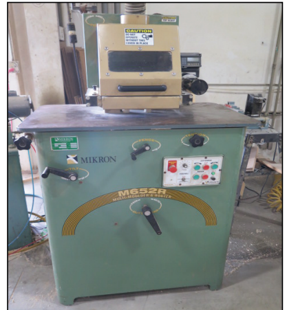
Mirkon M652R Multi-Moulder-Router w/ Curved and Straight Moulding Capab, 0-52 Degree Tilttable Spindle