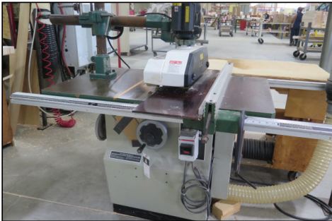
12" Tilting Arbor Table Saw w/ Kufo 4-Roll Power Feeder