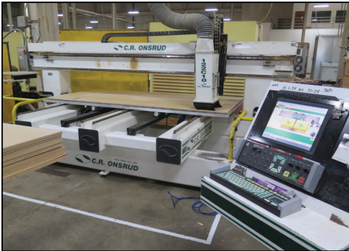
2008 C.R. Onsrud 122C18 CNC Router w/ WinMedia CNC Controls, Oracle VN VirtualBox Software, (2) 12-Station ATC's, HSK63 Taper Spindle, 900-24,000 RPM, 60" x 120" Cap