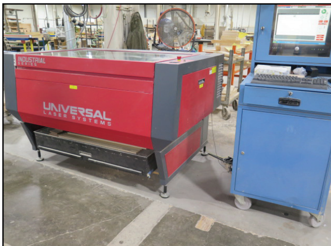
2008 Universal Laser Systems Industrial Series ILS Laser Engraving System