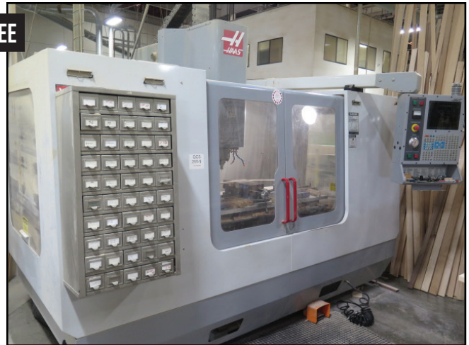
2002 Haas VF-4D CNC VMC w/ Haas Controls, 20-Station ATC, CAT-40 Spindle, 15,000 RPM, Rigid Tapping, Haas Vector Drive, Macros, Quick Code