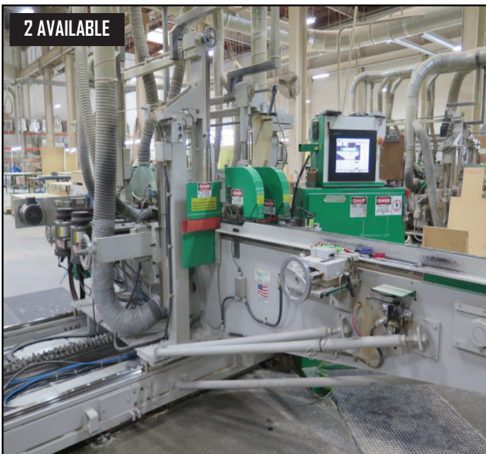
Fletcher Machine Customized FM-210D Double-End Tennoner Machine w/ Fletcher Controls, Side Saws, Shaper Head, Inline Belt Sanding ***2-AVAILABLE***

Marvco Tools / Tops mdl. 45365 16" Radial Arm Saw s/n 6524681 w/ 17" Extended Table. Delta Unisaw 10" Tilting Arbor Table Saw w/ Biesemeyer Fence System and 40" Table Extension.