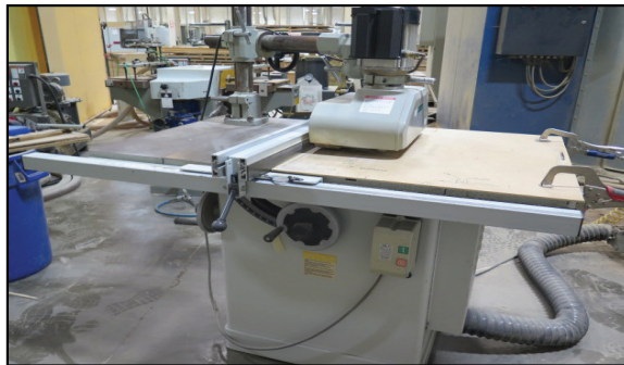
Import Type SK1212TS Tilting Arbor Table Saw w/ -Roll Power Feeder