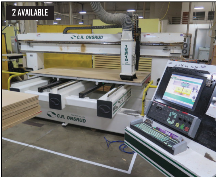
2008 C.R. Onsrud 122C18 CNC Router w/ WinMedia CNC Controls, Oracle VN VirtualBox Software, (2) 12-Station ATC's, HSK63 Taper Spindle, 900-24,000 RPM, 60" x 120" Cap