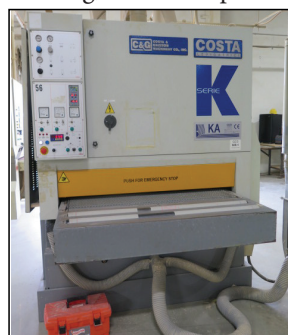
2005 Costa & Grissom KA-CCT 1350 3-Head 52" Wide Belt Sander w/ Costa Controls