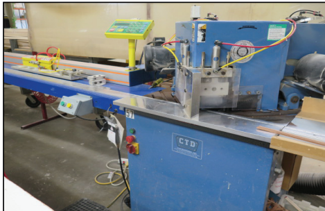
CTD D45X Double Cut Miter Saw w/ TigerStop 10' Programmable Stop System