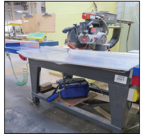
Marvco Tool / Tops 16" Radial Arm Saw w/ TigerStop 10' Programmable Stop System