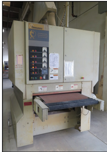
Timesavers mdl. 237-41C 4-Head 37" Wide Belt Sander