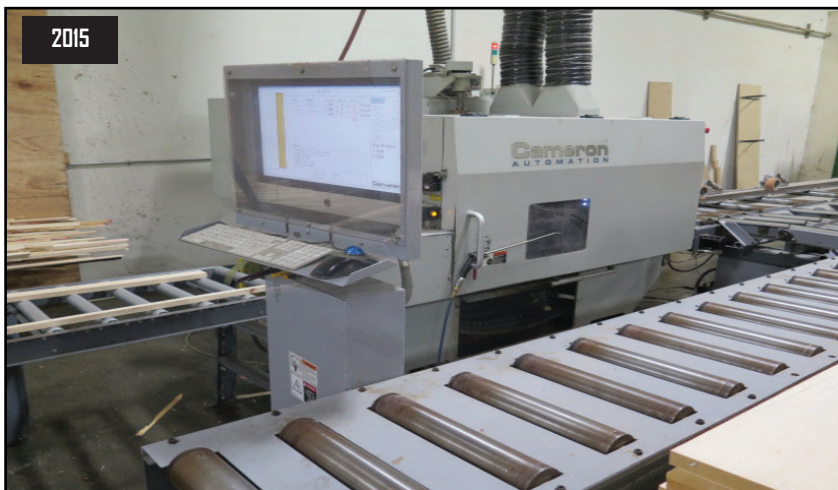
2015 Cameron Automation mdl. MRS-450M3 CNC Video Line Rip Saw w/ Opti-Rip Video System, Ver. 9.25 Software, 50Hp, Controlled Multi-Blade Video Sizing