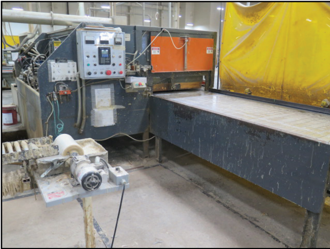
Rosenquist SB-700-H 36" Pass-Thru Radio Frequency Glue Curing Machine w/ Allen Bradley PanelView 300 PLC Controls