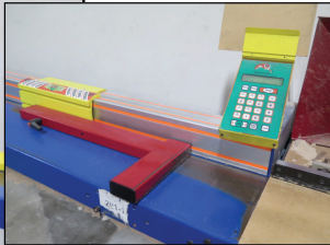
Omega 14" Radial Arm Saw w/ TigerStop 10' Programmable Stop System