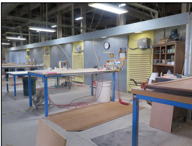
Custom 57' approx. W x 7 1/2' H x 5 1/2' D 4-Station UCB Filtered Sanding Booth