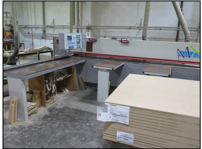
2000 Casadei LINEA/MX 12' CNC Beam Saw w/ CNC iPC400 CNC Controls and Back Gauging, 109" Squaring Arm, Front Supports