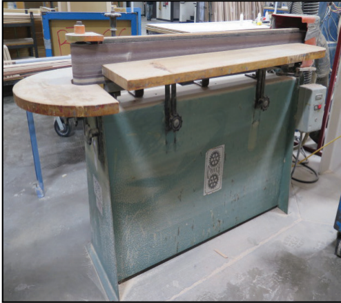
Croach mdl. 87-70 6" Edge Belt Sander Croach mdl. 87-70 6" Edge Belt Sander