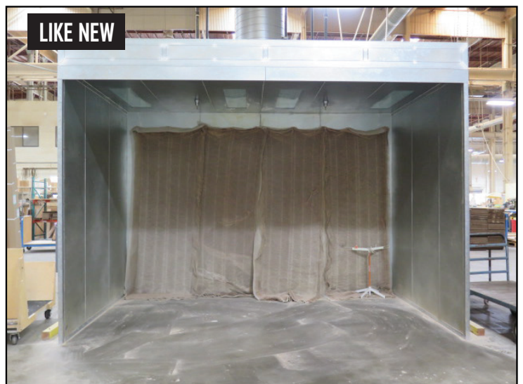
New Paint Booth 14' 8" W x 9'6" H X 8'6" D w/ Blower and Lights