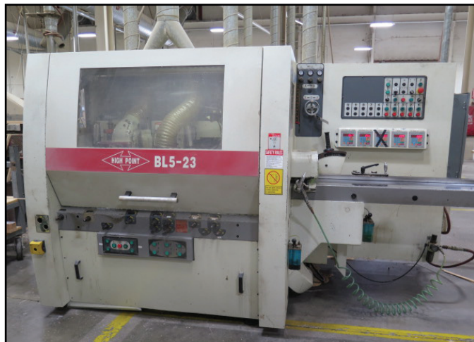
High Point BL6-12 Moulding Machine s/n 06A1060 w/ Controls