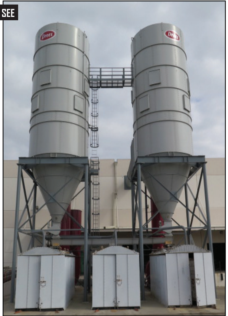
Ecogate Star-Delta Surfstart Dust Collection System w/ Controls, (3) Discharge Bays