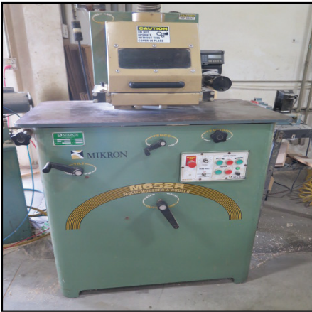
Mirkon M652R Multi-Moulder-Router w/ Curved and Straight Moulding Capab, 0-52 Degree Tilttable Spindle