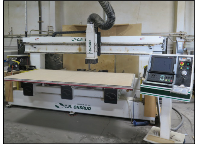
2006 C.R. Onsrud 122C16 CNC Router w/ WinMedia CNC Controls, Oracle VN VirtualBox Software, (2) 12-Station ATC's, HSK63 Taper Spindle, 60" x 120" Cap