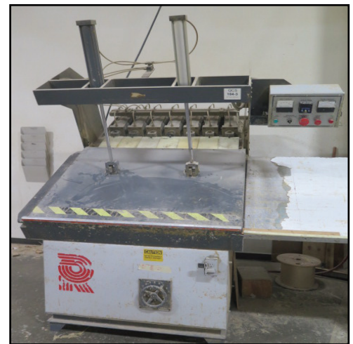
Rosenquist EG400A Radio Frequency Glue Curing Machine w/ RF Controls, Pneumatic Clamping