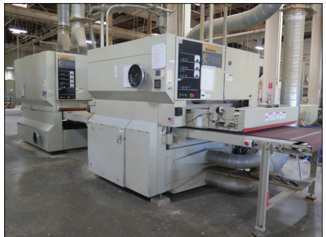
Timesavers 252-71 CBT 7-Head Top and Bottom 52" Bide Belt Sander w/ Timesavers Controls, 3-Head Bottom Sanding, 4-Head Top Sanding