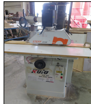
2012 Kufo SP-30 Spindle Shaper w/ Steff 2038 3-Roll Power Feeder

ALL MACHINERY MOVERS MUST BE APPROVED BY THE SELLER PRIOR TO REMOVAL OF EQUIPMENT