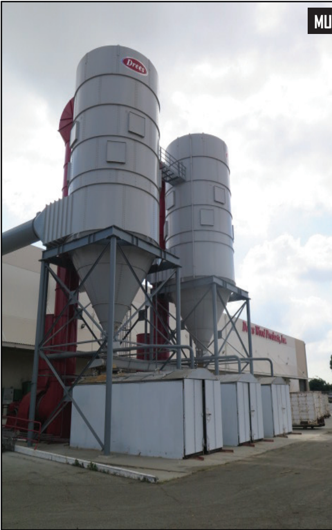
Ecogate Star-Delta Surfstart Dust Collection System w/ Controls, (3) Discharge Bays