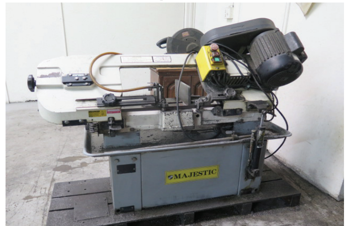
Majestic 7" Horizontal Band Saw