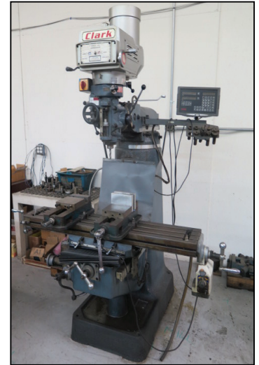
Clark Vertical Mill w/ Contour SDS2MS DRO, 3Hp Motor, 60-4200 Dial RPM, R8, Chrome