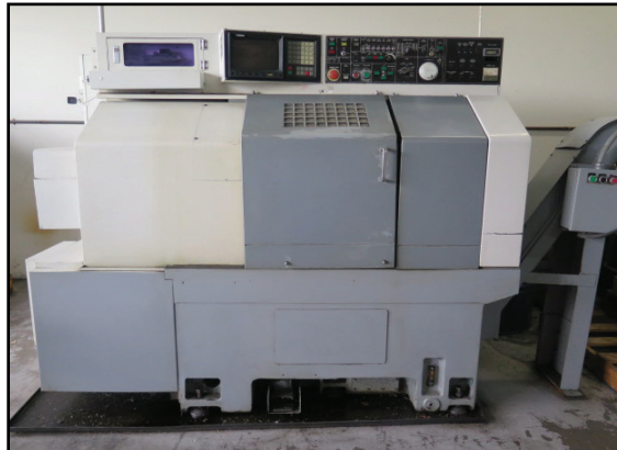
Nakamura Tome S-Jr CNC Turning Center w/ GMF / Fanuc Controls, 10-Station Turret, 3J Spindle Nose

Inspection : 2016 VeriSurfX "Master 3D Gage" Portable CMM Arm s/n 7312-5709-UC w/ 1.2m (4') Measuring Volume, 0.00039" Probing Size Error, 0.00096" Volumetric Accuracy, Wireless Communication, Standard Probe Set, Magnetic Mounting Kit, Travel Case. Ex-Cell-O mdl. 14-5 14" Optical Comparator s/n 8140066 w/ Anilam Wizard DRO, Surface Illumination. Sunstrand 6" x 12" Bench Center. Mitutoyo 12" Digital and Dial Height Gages. Fowler Bore Gage Setting Master. Gage Block Sets. Thread Ring and Plug Gages. Mitutoyo 0-1" Digital OD Mic. SPI 0-1" x 6" Deep Throat OD Mic. Import 0-1", 1"-2" and 2"-3" Thread Pitch Mics. Import 2"-6" Dial Bore Gage. Mitutoyo .7"-1.4" and 1.4"-2.4" Dial Bore Gages. SPI Dial Chamfer Gages. Fowler 24" and 12" Digital Calipers. Mitutoyo 8" Digital Caliper. Aerospace 12" Dial Caliper. Mitutoyo 6" Dial Caliper. Mitutoyo, Starrett and Import OD Mics to 6". Starrett 0-6" Depth Mic. Mitutoyo 0-4" Depth Mic.