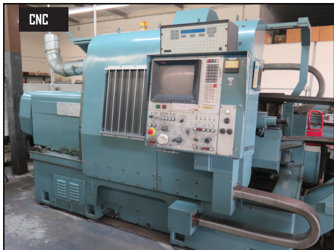
Mori Seiki SL-5B CNC Turning Center w/ Fanuc 10TE-F Controls, Memory Expansion System, 10-Station Turret, Hydraulic Tailstock, 12" 3-Jaw Chuck