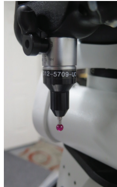
2016 VeriSurfX "Master 3D Gage" Portable CMM Arm w/ 1.2m (4') Measuring Volume, Acces