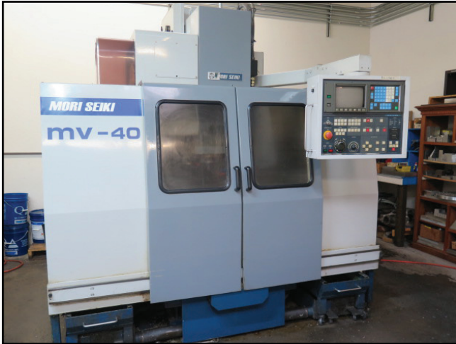
Mori Seiki MV-40 CNC VMC w/ Fanuc Controls, 20-Station ATC, BT-40 Spindle, 8000 RPM Hitachi Seiki HiTec-Turn HT20 CNC Turning Center w/ Yasnac Controls, Tool Presetter, 10-Station Turret, Hydraulic Tailstock, 8" 3-Jaw Chuck