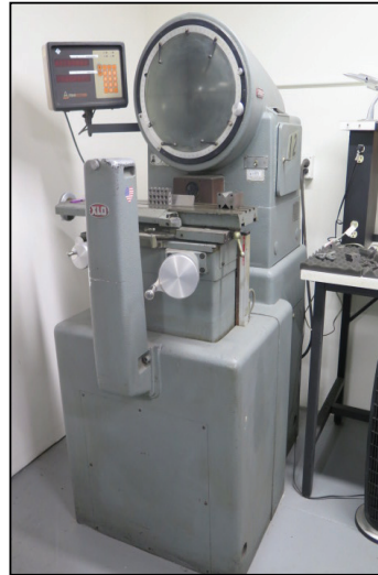
Ex-Cell-O mdl. 14-5 14" Optical Comparator w/ Anilam Wizard DRO