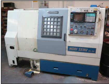
Mori Seiki SL-20 CNC Turning Center w/ Yasnac Controls, 10-Station Turret, Hydraulic Tailstock, 8"3-Jaw Chuck, 3] Spindle Nose

PRESORTED First-Class Mail U.S. Postage PAID STA CLARITA, CA Permit No. 298