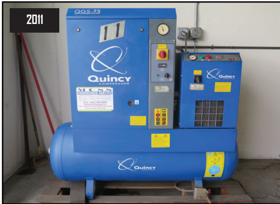
2011 Quincy QGS-7.5 7.5Hp Rotary Air Compressor w/ Built-In Dryer