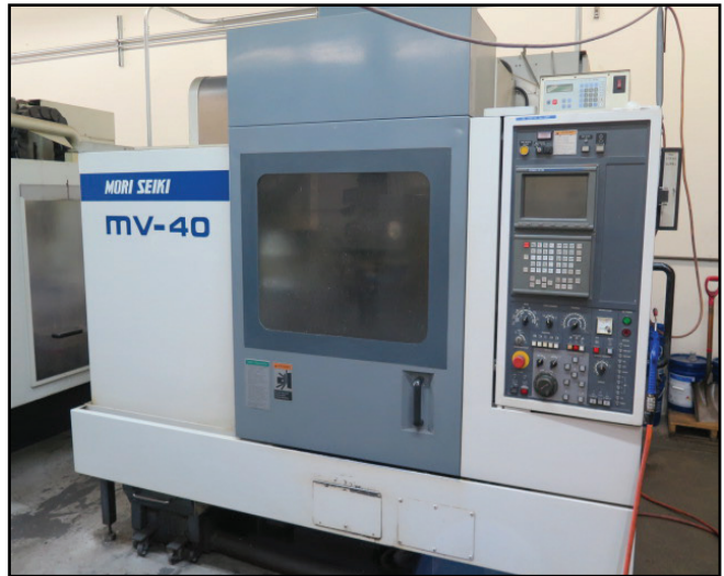
Mori Seiki MV-40/40 CNC VMC w/ MSC-516 Controls, 20-Station ATC, BT-40 Spindle, 8,000 RPM, Extended Memory