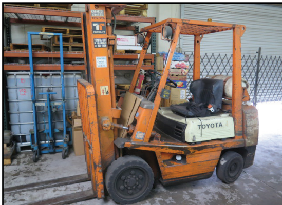
Toyota 42-4FGCU25 4700 Lb Cap LPG Forklift