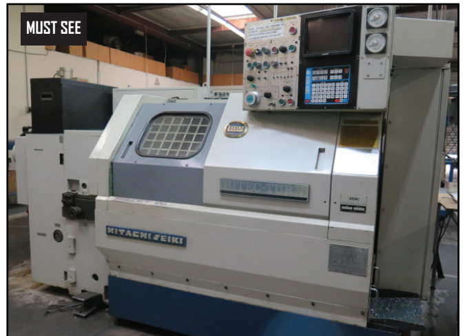
Hitachi Seiki HiTec-Turn HT20 CNC Turning Center w/ Yasnac Controls, Tool Presetter, 10-Station Turret, Hydraulic Tailstock, 8" 3-Jaw Chuck