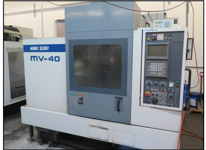
Mori Seiki MV-40/40 CNC VMC w/ MSC-516 Controls, 20-Station ATC, BT-40 Spindle, 8,000 RPM, Extended Memory