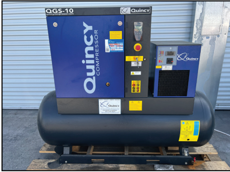
QUINCY QGS-10, 10HP ROTARY AIR COMPRESSOR W/ DRYER.