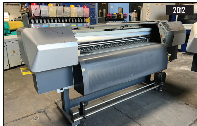
2012, 2013, 2014 MIMAKI JV5-160S, LARGE FORMAT SOLVENT INK JET PRINTER.