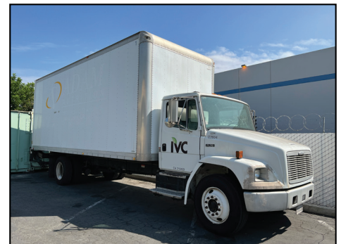
2002 FREIGHTLINER BOX VAN WITH LIFT GATE, DIESEL, MODEL FL70 MACHINE TOOL

ALL MACHINERY MOVERS MUST BE APPROVED BY THE SELLER PRIOR TO REMOVAL OF EQUIPMENT