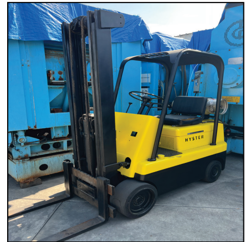
HYSTER 5000 LB LPG FORKLIFT, 2 STAGE MAST, S/N C2D-13291S.