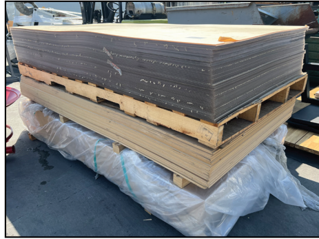
LARGE SELECTION OF PLEXI GLASS MATERIAL.