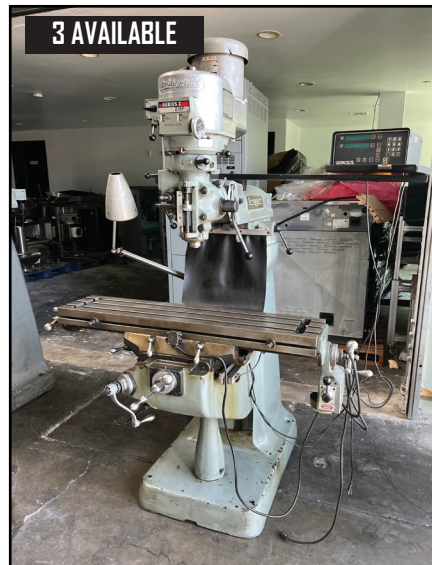
3) BRIDGEPORT VERTICAL MILLING MACHINES, W/ P.E. TABLE AND DRO.