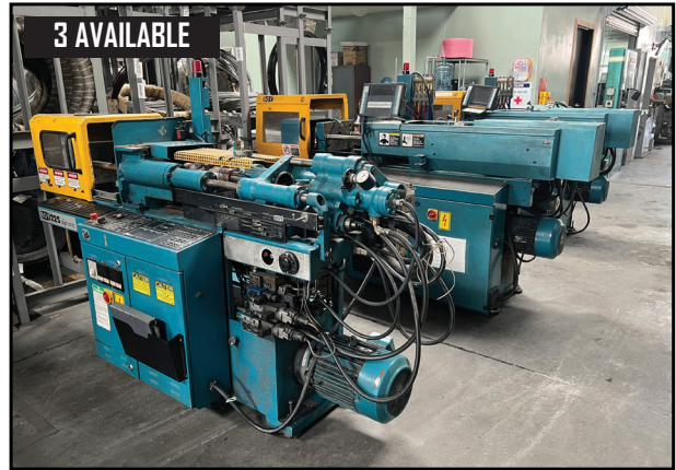
3) BOY 22S, 22 TON PLASTIC INJECTION MOLDING MACHINES.