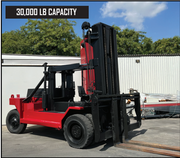
TAYLOR MODEL Y-30-WO, 30,000 LB CAPACITY DIESEL FORKLIFT, S/N 5468.