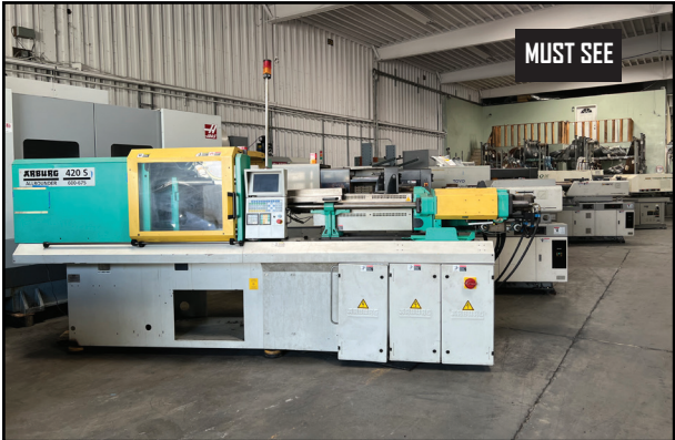
PLASTIC INJECTION MOLDING DEPARTMENT.