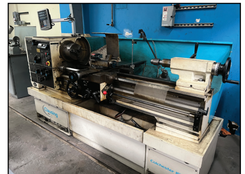
CLAUSING COLCHESTER 15"VS, 15" ENGINE LATHE, IN/MM THREADING, DRO.