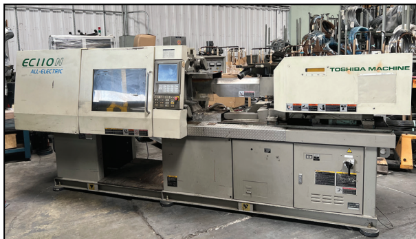
TOSHIBA EC110N, ALL ELECTRIC 110 TON PLASTIC INJECTION MOLDING MACHINE. MODLE