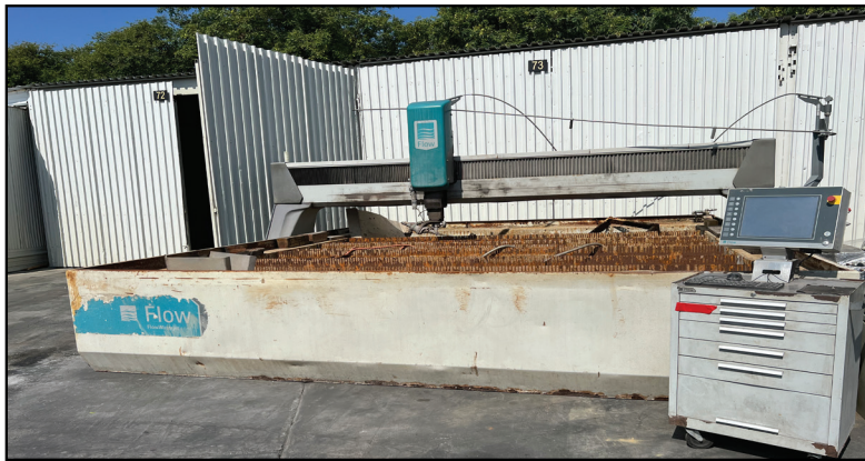
FLOW MACH 4, 4050C WATERJET SYSTEM, W/ FLOW HYPERJET 500 WMC PUMP, AND CONTROLS.