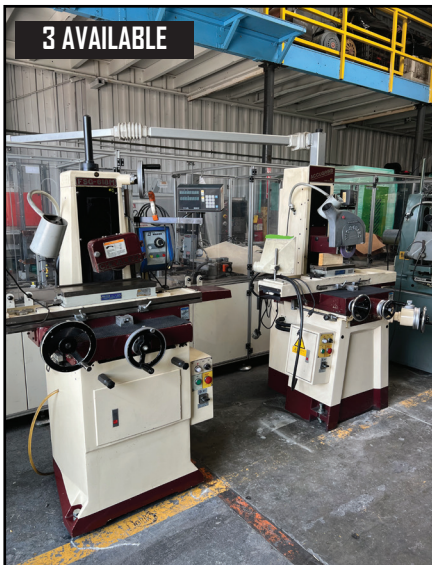
3) CHEVALIER FSG-618M, 6 X 18 SURFACE GRINDER.