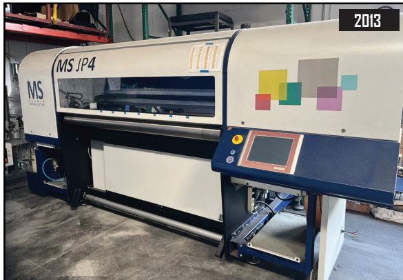
2013 MS-JP4 DIGITAL TEXTILE PRINER FOR SUBLIMATION.