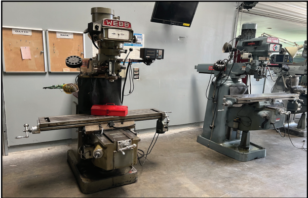
WEBB VERTICAL MILL, VAR SPEED, DRO, P.F. TABLE.