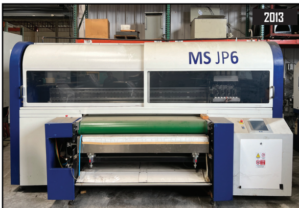
2013 MS-JP6 DIGITAL TEXTILE PRINTER FOR SUBLIMATION.

FLOW MACH 4, 4050C WATERJET SYSTEM, W/ FLOW HYPERJET 500 WMC PUMP, AND CONTROLS.