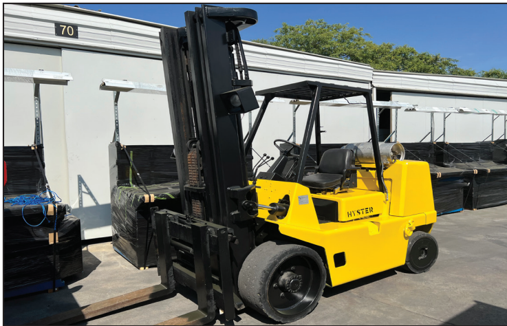
HYSTER S155XL2, 15,000 LB LPG FORKLIFT, 3 STAGE, S/N B024D07026V.