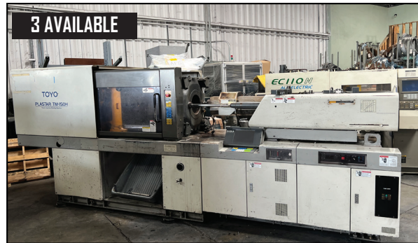
3) TOYO PLASTAR TM-150H, 150 TON PLASTIC INJECTION MOLDING MACHINE.