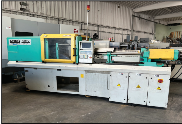
ARBURG ALL ROUNDER 420S, 110 TON PLASTIC INJECTION MOLDING MACHINE.