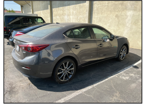
2017 MAZDA 3 SKYACTIV 4 DOOR CAR, "NEEDS FRONT END BODY WORK".