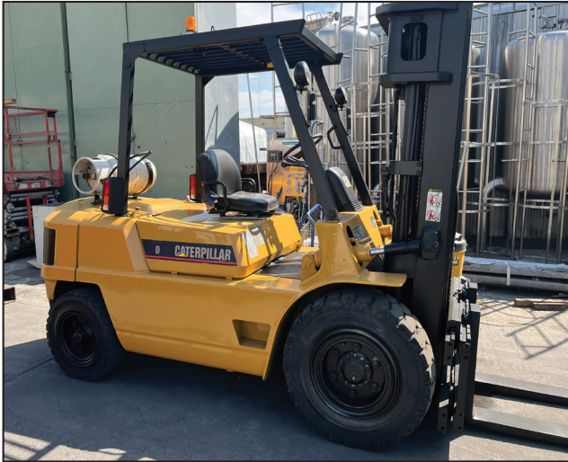
CATERPILLAR 8000 LB LPG FORKLIFT, 3 STAGE, 4042 HOURS, HARD PNEUMATIC.