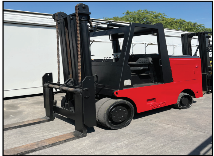
OTEK 20,000 LB LPG FORKLIFT.