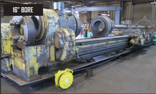
16" BORE LeBlond Model 5GR-10A-25-S Hollow Spindle 36" x 288" Lathe w/ 16" Thru Spindle Bore, 5-250 RPM, 16" Hollow Spindle, Steady Rest, Steady Rest, 29" 4-Jaw Chuck.