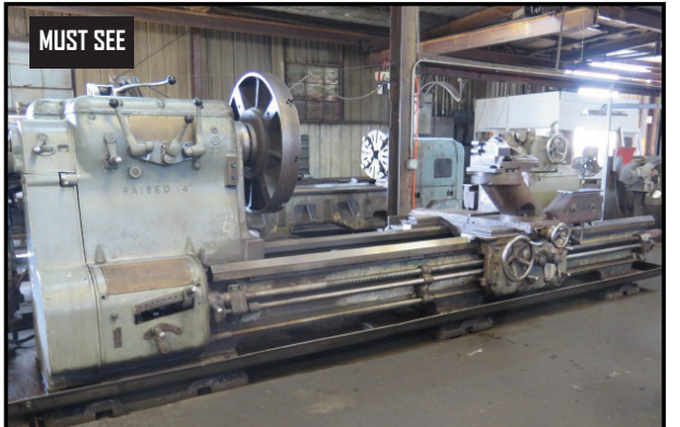
MUST SEE Axelson 25 25" x 120" Gered Head Lathe s/n 2778 w/ 6-555 RPM, Inch Threading, Tailstock, Steady Rest, Tool Post, 2 1/4" Thru Spindle Bore, 16' Bed Length, 120" Between Centers.