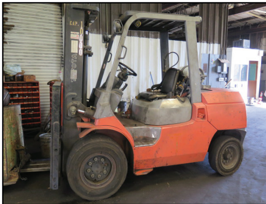
Toyota 7FGCU32 6000 Lb Cap LPG Forklift s/n 62161 w/ 3-Stage Mast, 189" Lift Height, Solid YardTires, 9330 Hours.