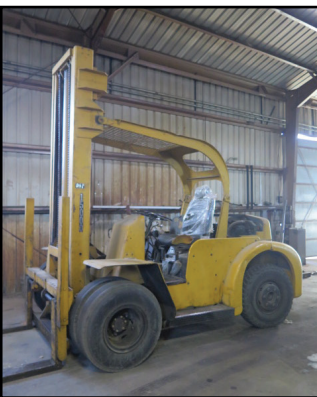
Hyster 15,000 lb Forklift