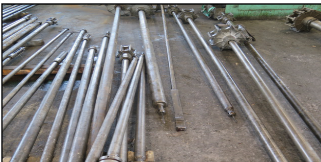
Large Selection of Honing Mandrels.