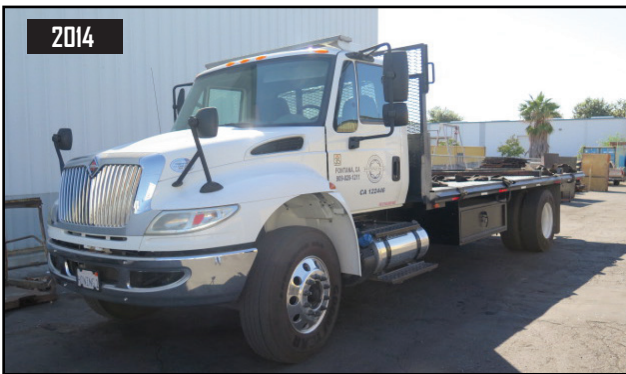
2014 2014 International 20' Stake-Bed Truck Lisc# HONING1 w/ California Emissions Compliant Diesel Engine, Automatic Trans, 6 th Gear, Air Brakes, 195,976 Miles, VIN# 1HTMMMMN5FH710687.