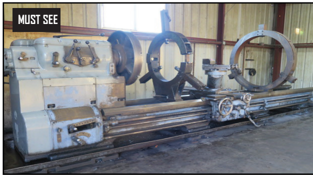
MUST SEE Axelson 32 48" x 168" Geared Head Lathe s/n 1644 w/ 16" Extension, 6-555 RPM, Inch Threading, Tailstock, Steady Rest, KDK Tool Post, 2 3/8" Thru Spindle Bore, 36" 4-Jaw Chuck. Threading, Tailstock, Steady Rest, 4" Thru Spindle Bore, Aloris Tool Post, 24" 4-Jaw Chuck.