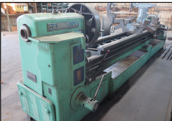
Cazeneuve HB725 26" x 154" Geared Head Gap Bed Lathe w/ 3 1/8" Thru Spindle Bore, Inch/mm Threading, Tailstock (2) Steady Rests, Tool Post, 24" 4-Jaw Chuck, 15" 3-Jaw Chuck.