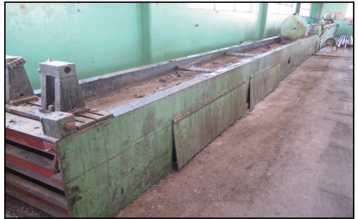
Custom Built Horizontal Honing Machines w/ 12' Power Stroke, 1.5" to 14" Hone Cap, Coolant.