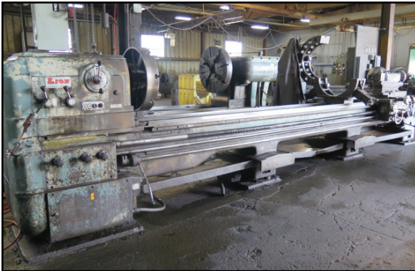
Lion C13/MB 32" x 230" Geared Head Lathe s/n 13MH-5000-80039 w/ 6-1000 RPM, Inch/mm Threading, Tailstock, Steady Rest, 4" Thru Spindle Bore, Aloris Tool Post, 24" 4-Jaw Chuck.