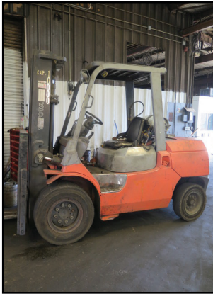
Toyota 7FGCO45 10,000 Lb Cap LPG Forklift s/n 60176 w/ 2-Stage Mast, 132" Lift Height, Pneumatic Yard Tires.