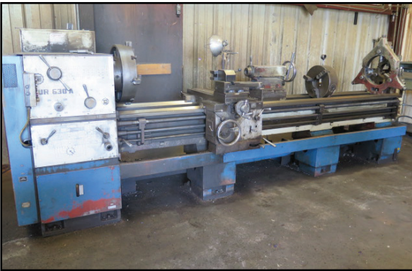
TUR 630A Big Bore Geared Head Lathe s/n 60006 w/ 5 7/16" Thru Spindle Bore, 15-1400 RPM, Inch/mm Threading, Tailstock, (2) Steady Rests, KDK Tool Post, 19" 4-Jaw Chuck, 15 1/2" 3-Jaw Chuck.