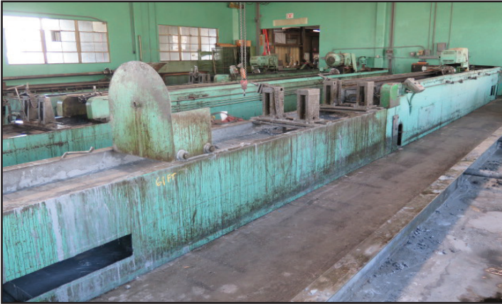
Custom Built Horizontal Honing Machines w/ 13' Power Stroke, 1.5" to 36" Hone Cap, Coolant