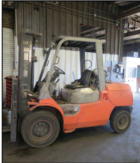
Toyota 7FGCO45 10,000 Lb Cap LPG Forklift s/n 60176 w/ 2-Stage Mast, 132" Lift Height, Pneumatic Yard Tires.

PRESORTED First-Class Mail U.S. Postage PAID STA CLARITA, CA Permit No. 298