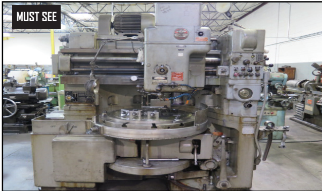
MUST SEE Fellows Type 36 Vertical Gear Shaper w/ 36" Table w/ Rack Cutting Attachment