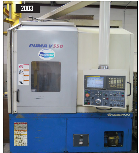
2003 Daewoo Doosan PUMA V550 CNC Vertical Turning Center w/ Fanuc 18i-TB Controls, 10-Station Turret, 2000 RPM, 36" Swing, 24" 3-Jaw Chuck