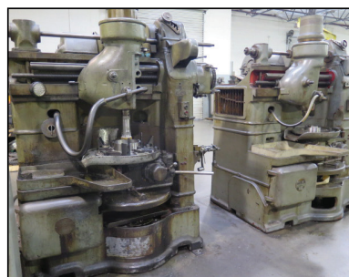
Fellows Type 6A Gear Shapers