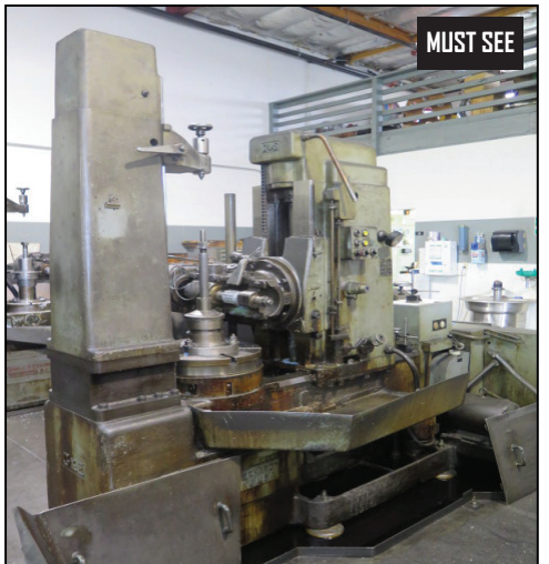
Goule & Eberhardt 24H Universal Gear Hobbing Machine w/ 18" Table and 12" Riser Differential 24" & 36", Qty: 1/ Each