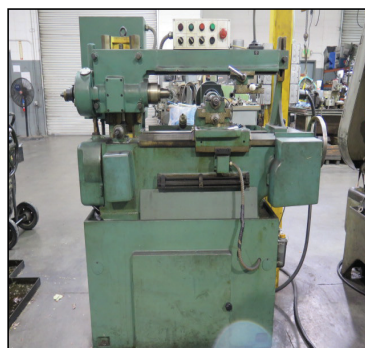
Ad-Tech No. 616 Gear Hobbing Machine