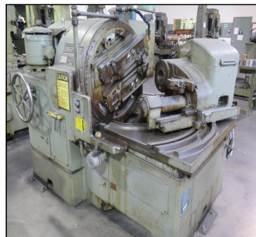
Gleason G14W Coniflex Bevel Generator