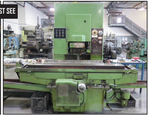
W.E. Sykes VR-72 Rack Shaper w/ 10" x 80" Table