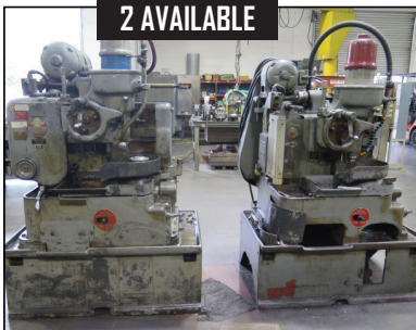
Fellows Type 7A High Speed Gear Shapers **2-AVAILABLE**

Material Handling : 2006 Ford F-250 XLT Super Duty Pickup Truck Lic# 7T60257 w/ 5.4L Gas Engine, Automatic Trans, AC, AM/FM/CD, 255,654 Miles VIN# 1FTNF20526ED00890. Toyota 7FGCU25 5000 Lb Cap LPG Forklift s/n 86636 w/ 3-Stage Mast, 189" Lift Height, Side Shift, 4 th Actuator Lever, Solid Yard Tires, 9317 Hours. 1 Ton Floor Mounted Jib Crane w/ Electric Hoist. Gorbel 1/2 Ton Floor Mounted Jib Crane w/ Electric Hoist. Abell-Howe 1/4 Ton Floor Mounted Jib Crane w/ Electric Hoist. (2) 1/4 Ton Floor Mounted Jib Crane w/ Electric Hoist.