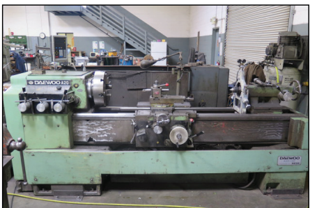
Daewoo A20 20" x 60" Gap Bed Lathe w/ Newall C80 DRO, 4-3000 Dial RPM, Inch/mm Threading, Tailstock, Steady Rest, 3" Thru Spindle