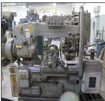
Barber Colman 16-16 Gear Hobbing Machine