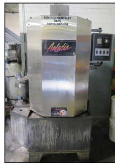
Aladin mdl. 2085E Heated Rotary Parts Washer

Material Handling : 2006 Ford F-250 XLT Super Duty Pickup Truck Lic# 7T60257 w/ 5.4L Gas Engine, Automatic Trans, AC, AM/FM/CD, 255,654 Miles VIN# 1FTNF20526ED00890. Toyota 7FGCU25 5000 Lb Cap LPG Forklift s/n 86636 w/ 3-Stage Mast, 189" Lift Height, Side Shift, 4 th Actuator Lever, Solid Yard Tires, 9317 Hours. 1 Ton Floor Mounted Jib Crane w/ Electric Hoist. Gorbel 1/2 Ton Floor Mounted Jib Crane w/ Electric Hoist. Abell-Howe 1/4 Ton Floor Mounted Jib Crane w/ Electric Hoist. (2) 1/4 Ton Floor Mounted Jib Crane w/ Electric Hoist.