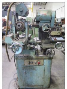
Cincinnati Milacron Monoset Tool and Cutter Grinder