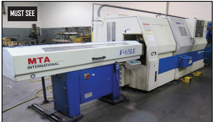
MUST SEE 2006 Daewoo PUMA240B CNC Turning Center w/ Fanuc 21i-TB Controls, Tool Presetter, 12-Station Turret, Hydraulic Tailstock, Parts Catcher, 8" 3-Jaw Chuck