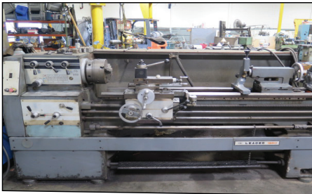
Leader 1560 15" x 60" Gear-Gap Lathe w/ 40-1600 RPM, Inch/mm Threading, Tail, Steady and Follow Rests, Trava-Dial, 3 1/8" Thru Spindle