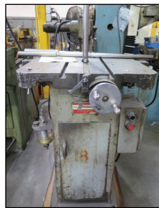
Morrison mdl. K Key Slotter Machine