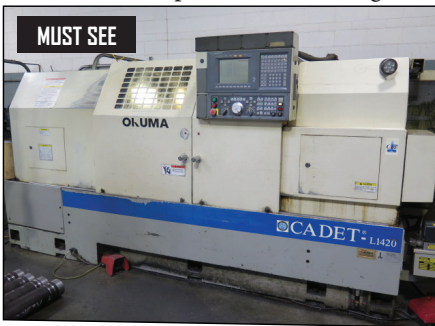
MUST SEE Okuma Cadet L1420 CNC Turning Center w/ OSP700L Controls, 12-Station Turret, Hydraulic Tailstock, 12" 3-Jaw Chuck, Schmidt "RIP" Steady Rest