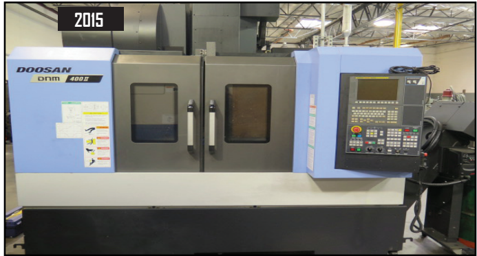
2015 2015 Doosan DNM400 II 5-Axis Capable CNC VMC w/ Fanuc I Series Controls, 30-Side Mount ATC, CAT-40, 12,000 RPM, Thru Spindle Coolant, Rigid, Renishaw Probe System