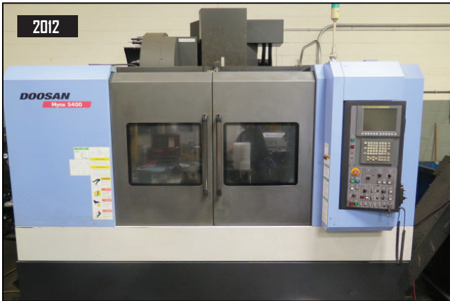
2012 Doosan Mynx 5400/40 CNC VMC w/ Fanuc I Series Controls, 30-ATC, CAT-40, Thru Spindle Coolant, Rigid Tapping