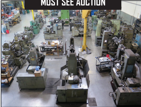
Overall View of Gear Department