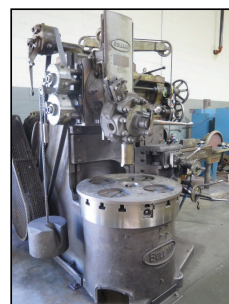
Bullard 34" Vertical Turret Lathe w/ 12-200 RPM, 39" Swing

Tooling : (60) CAT-40 Taper Tooling. Huot Toolscoot 40-Taper Tooling Cart. (2) Kurt 6" Angle-Lock Vises. 4" Universal Compound Vise. 8" 3-Jaw Rotary Chuck w/ Mill Center. Yuasa 13" Rotary Table. Insert Milling, Turning and Boring Tooling. Gear Shaper and Hobbing Tooling.