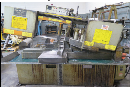
HEM Saw H90A-B/F 12" Automatic Hydraulic Horizontal Band Saw s/n 453895 w/ HEM Controls, Hydraulic Clamping and Feed