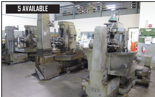
5 AVAILABLE G & E Vertical Gear Hobbers **5-AVAILABLE**