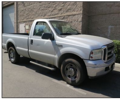
2006 Ford F-250 XLT Super Duty Pickup Truck w/ 5.4L Gas Engine, Auto Trans, AC, AM/FM/CD, 255,654 Miles