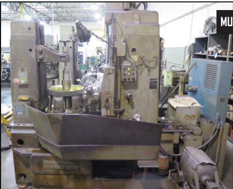
Goule & Eberhardt 36H Universal Gear Hobbing Machine w/ 26" Table