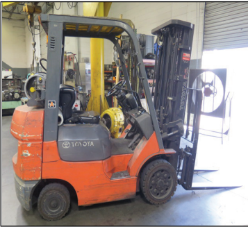
Toyota 7FGCU25 5000 Lb Cap LPG Forklift w/ 3-Stage Mast, 189" Lift Height, Side Shift, 4 th Actuator Lever