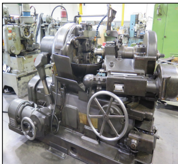
Gleason No. 12 Bevel Generator