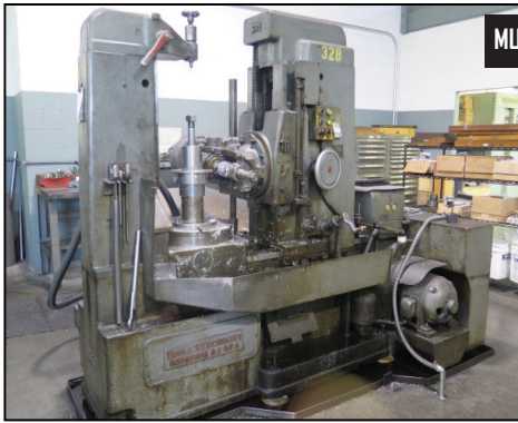
Goule & Eberhardt 24H Universal Gear Hobbing Machine w/ 18" Table