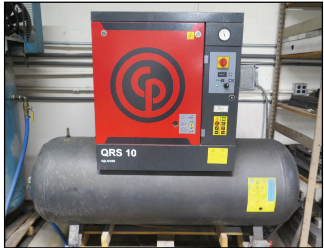
2015 Chicago Pneumatic QRS-10 10Hp Rotary Air Compressor