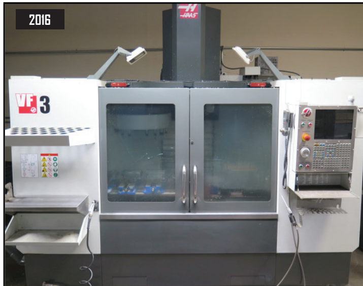
2016 Haas VF-3 CNC VMC w/ Haas Controls, 20-ATC, CAT-40, 8100 RPM, Rigid Tapping, Macros, Coord Rotation and Scaling, M19, High