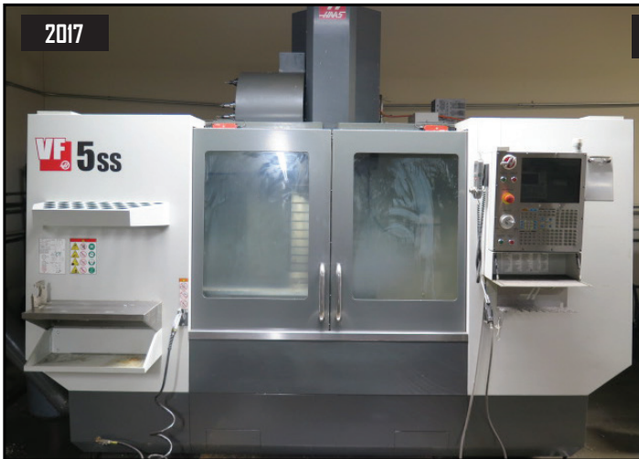
2017 Haas VF-5SS 4-Axis CNC VMC w/ Haas Controls, 24-Station Side Mount ATC, CAT-40, 12,000 RPM, Renishaw Probe System, Rigid Tapping, Macros, Coord Rotation and Scaling, M19, VPS Editing, 1GB Memory