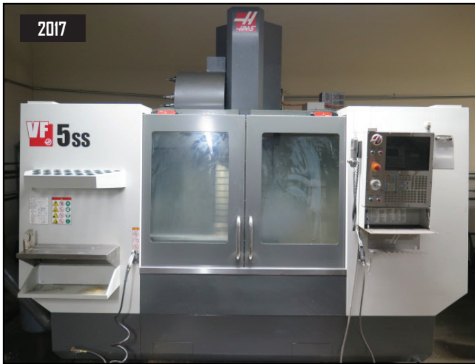
2017 Haas VF-5SS 4-Axis CNC VMC w/ Haas Controls, 24-Station Side Mount ATC, CAT-40, 12,000 RPM, Renishaw Probe System, Rigid Tapping, Macros, Coord Rotation and Scaling, M19, VPS Editing, 1GB Memory