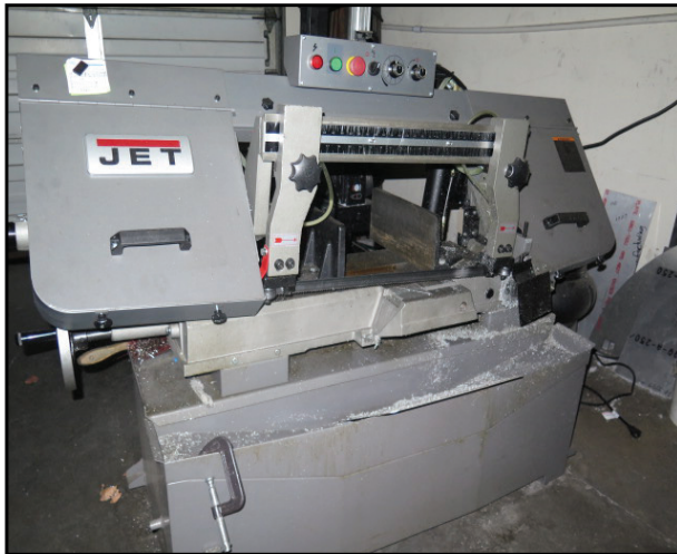
Jet HBS-1018 10" Horizontal Band Saw