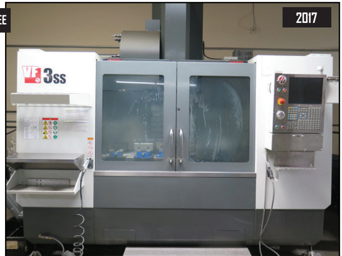
2017 Haas VF-3SS Super Speed CNC VMC w/ Haas Controls, 24-Station Side Mounted ATC, CAT-40, 12,000 RPM, Rigid Tapping, 1GB Memory, Comp Tables, Programmable Coolant