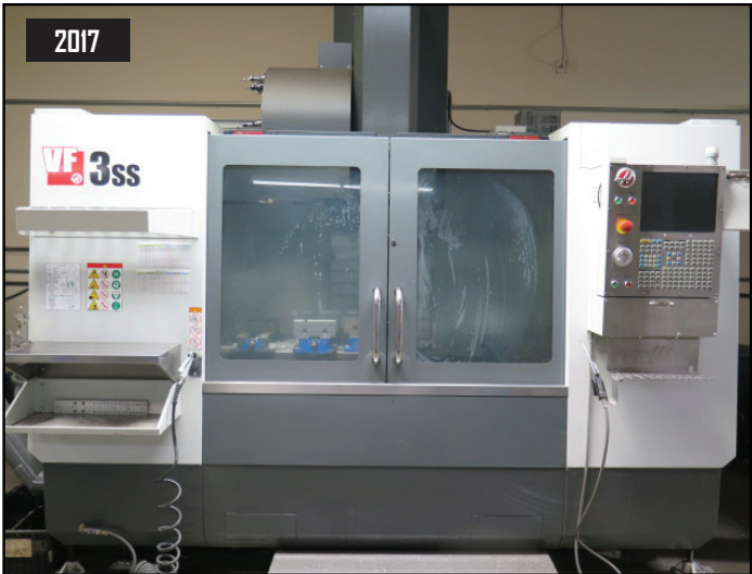
2017 Haas VF-3SS Super Speed CNC VMC w/ Haas Controls, 24-Station Side Mounted ATC, CAT-40, 12,000 RPM, Rigid Tapping, 1GB Memory, Comp Tables, Programmable Coolant