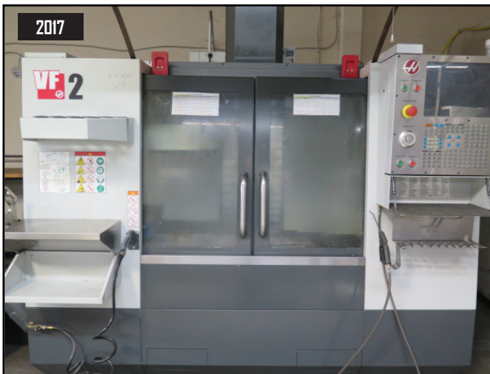
2017 Haas VF-2 CNC VMC w/ Haas Controls, 20-ATC, CAT-40, 8100 RPM, Programmable Coolant Nozzle, Rigid Tapping, 1GB Memory, Comp Tables

2017 Hwa Cheon VESTA 1000 High Production CNC Vertical Machining Center s/n M281365H3NA w/Hwa Cheon - Fanuc I Series Controls, Hand Wheel, 24-Station Side Mounted ATC, CAT-40 Taper Spindle, 12,000 RPM, 19 3/4" x 43 1/2" Table, Chip Auger, GSA Refrigerated Air Dryer, Coolant.