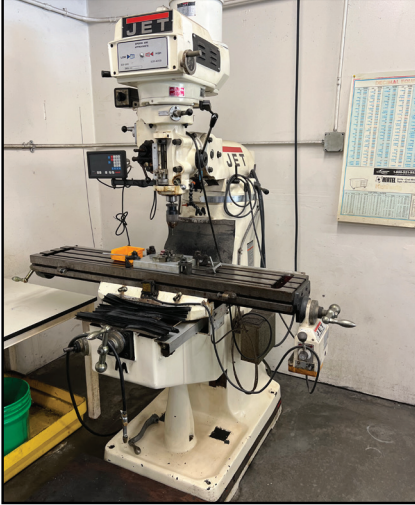
JET JTM-4VS VERTICAL MILLING MACHINE, W/DRO AND POWER FEED TABLE, VAR SPEED.