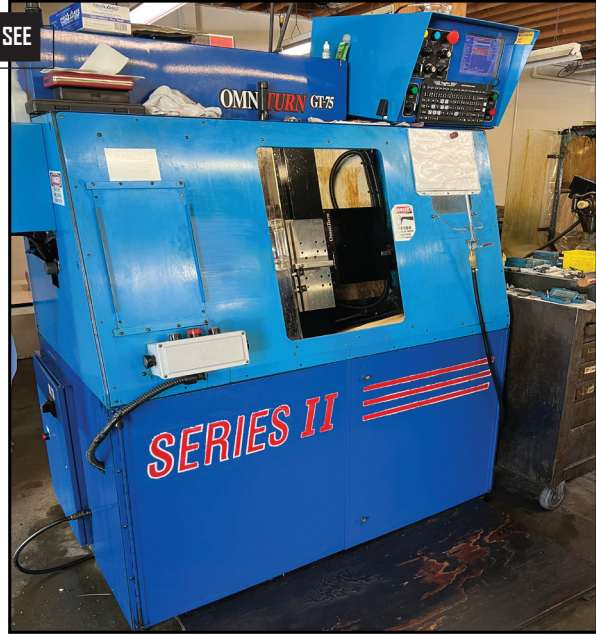
OMNITURN GT-75, MODEL OT-CNC4 CNC GANG TOOL LATHE, S/N 529964.