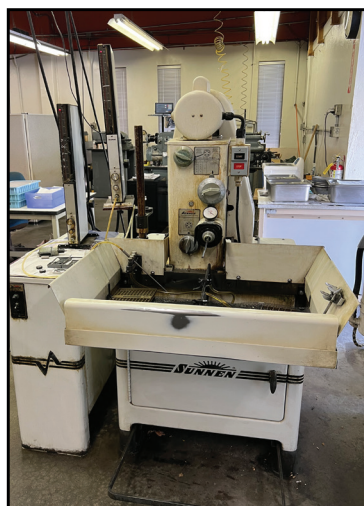
1 OF 2 SUNNEN MBB-1660 PRECISION HONING MACHINE, UP TO 6.5" DIAMETER CAPACITY.