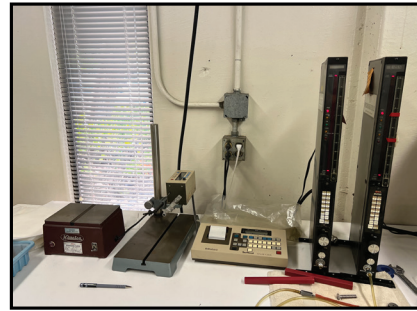
LARGE SELECTION OF INSPECTION TOOLS, MICROSCOPES, AND GAGES.

ALL MACHINERY MOVERS MUST BE APPROVED BY THE SELLER PRIOR TO REMOVAL OF EQUIPMENT