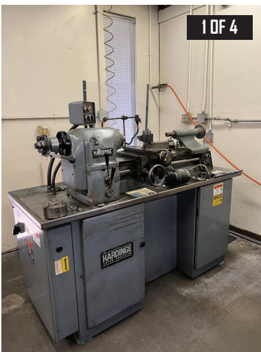
HARDINGE TFB-H TOOL ROOM LATHE.