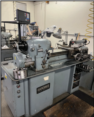
HARDINGE HLV-H TOOL ROOM LATHE WITH DRO

PRESORTED First-Class Mail U.S. Postage PAID STA CLARITA, CA Permit No. 298