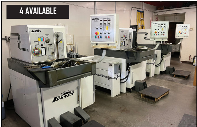
4) SUNNEN HONE ML-2000-DF PRECISION HONING MACHINES W/ POWER STROKER.