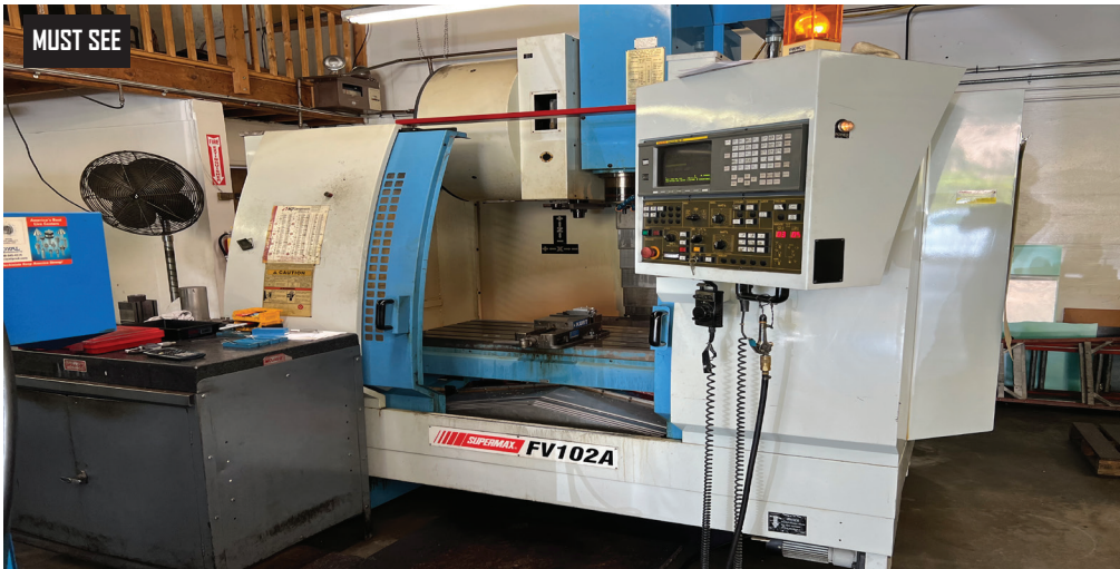
SUPERMAX FV102A CNC VMC, W/ FANUC 18-M CONTROL, 40 TAPER, SIDE MOUNT TOOL