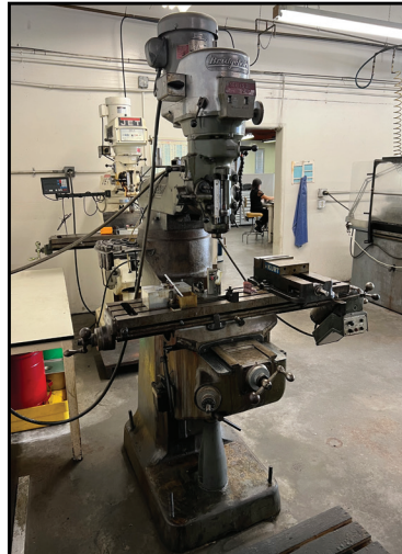
BRIDGEPORT VERTICAL MILLING MACHINE, W/ POWER FEED TABLE, VAR SPEED, ZHP.