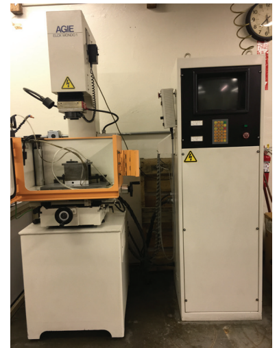
Agie Elox Mondo Sinker EDM