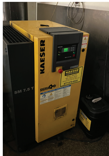
KAESER MODEL SM 7.5T, 7.5 ROTARY AIR COMPRESSOR WITH AIR DRYER AND TANK.