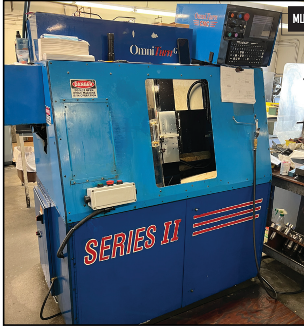
OMNITURN GT-75, MODEL OI-CNC GANG TOOL LATHE, S/N 4084-635AHM.