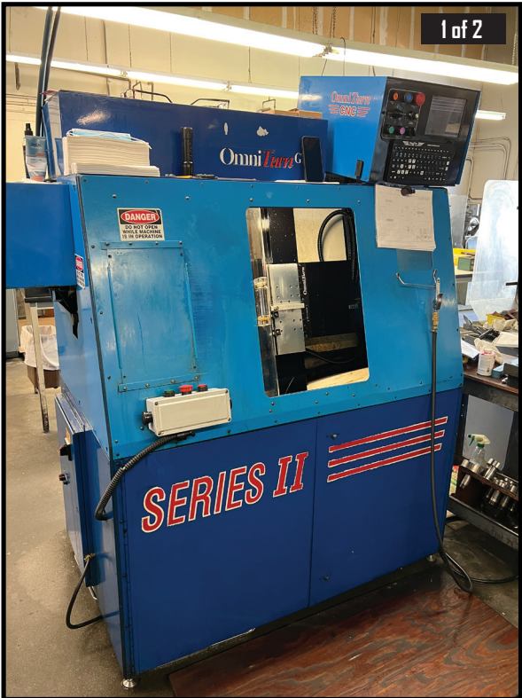
OMNITURN GT-75, MODEL 01-CNC GANG TOOL LATHE, S/N 4084-635AHM.