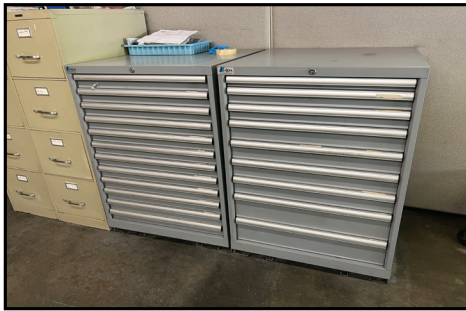
LISTA CABINETS WITH LARGE SELECTION OF INSPECTION TOOLING.