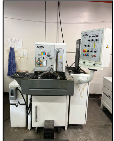
4 SUNNEN HONE ML-2000-DF HONING MACHINE W/ STROKER, 6.7" STROKE, VARIABLE STROKE RATE.