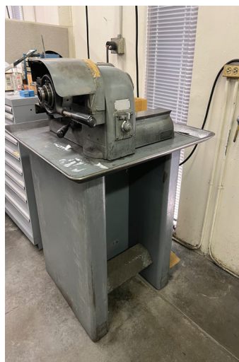
HARDINGE SPEED LATHE