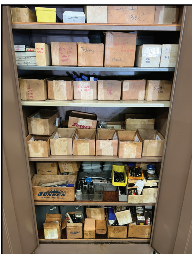
LARGE SELECTION OF SUNNEN STONES AND MANDRELS.