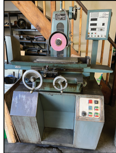
HARIG 618W, 6 X 18 SURFACE GRINDER.