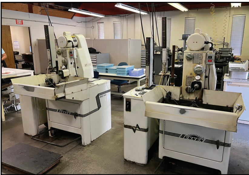
SUNNEN MBB-1660 PRECISION HONING MACHINES, UP TO 6.5" DIAMETER CAPACITY.