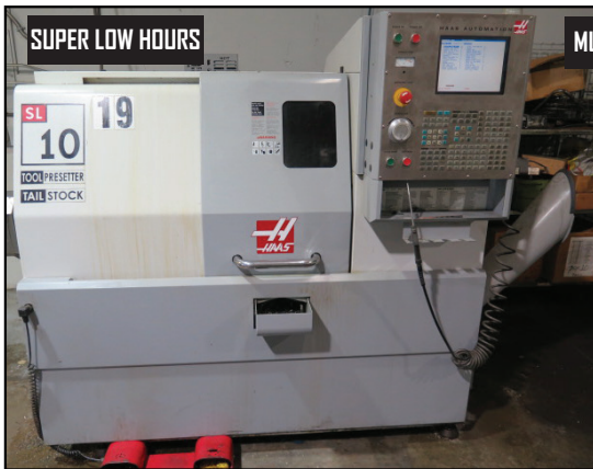
2006 Haas SL-10T CNC Turning Center w/ Tool Presetter, 12-Turret, Tailstock, 6000 RPM, Parts Catcher, Rigid Tapping. Super Low Hours.