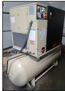
Ingersoll Rand UP6-15cTAS-125 W/D 15Hp Rotary Air Compressor