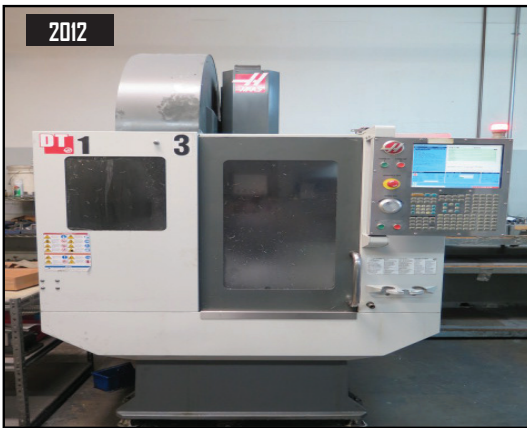
2012 2012 Haas DT-1 CNC VMC w/ 20-ATC, CAT-40, 12,000 RPM, Advanced Tool Management, Programmable Coolant, Rigid Tapping