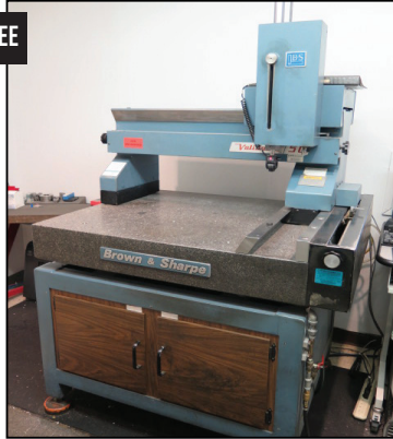
Brown Sharpe "Validator 50" CMM Machine w/ Renishaw MIP Probe, 24" x 24" x 8" Work Envelope, 3D Workshop Software