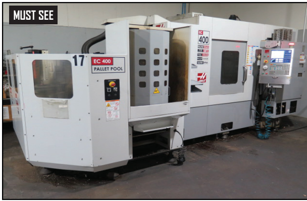
MUST SEE 2008 Haas EC-400PP 6-Pallet "Pallet Pool" CNC HMC w/ 70-ATC, CAT-40, 12,000 RPM, Renishaw Tool Presetter, 4 th Axis Thru Pallets, Rigid Tapping, Programmable Coolant