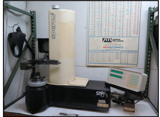
2005 Speroni STP34 Tool Presetter