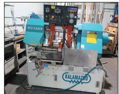
Clausing Kalamazoo KC12AX 12" Automatic Horizontal Band Saw