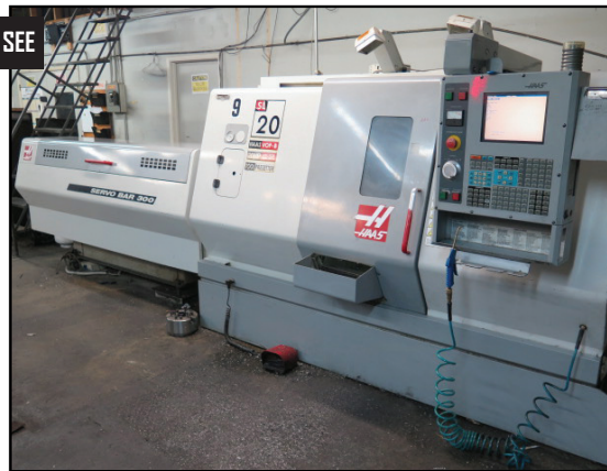
2004 Haas SL-20 CNC Turning Center w/ Tool Presetter, 10-Station Turret, 20Hp, 8" Power Chuck, Haas ServoBar 300 Automatic Bar Feeder