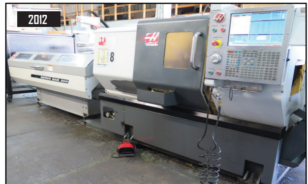
2012 Haas ST-10 Live Turret CNC Turning Center w/ Tool Presetter, 12-Station Live Turret, Live Tooling 8" Power Chuck, Haas ServoBar 300 Automatic Bar Loader / Feeder & Parts Catcher