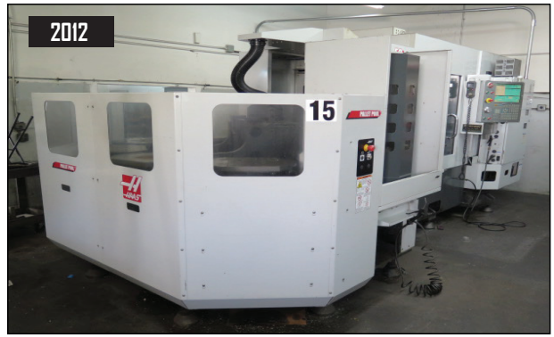
2012 2012 Haas EC-400PP 6-Pallet "Pallet Pool" CNC HMC w/ 70-ATC, CAT-40, 12,000 RPM, Renishaw Tool Presetter, Intuitive Probing System, Full 4 th Axis, Rigid Tapping, Programmable Coolant