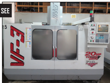
1997 Haas VF-3 4-Axis CNC VMC w/ 20-ATC, CAT-40, 7500 RPM, 20Hp, Rigid Tapping