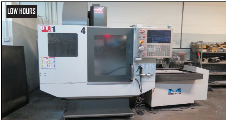
LOW HOURS 2014 Haas DT-1 2-Pallet CNC VMC w/ Midaco Pallet Changer, 20-Station ATC, CAT-40, 15,000 RPM, Rigid Tapping, Intuitive Probing System, High Speed Machining, Advanced Tool Management

2000 Fanuc Robodrill α-T14iBL 2-Pallet CNC Drilling Center s/n P00XTM101 w/ Fanuc Series 16i-M