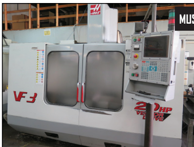
MUST SEE 2000 Haas VF-3 4-Axis CNC VMC w/ 20-ATC, CAT-40, 20Hp, 7500 RPM, Programmable Coolant, Rigid Tapping