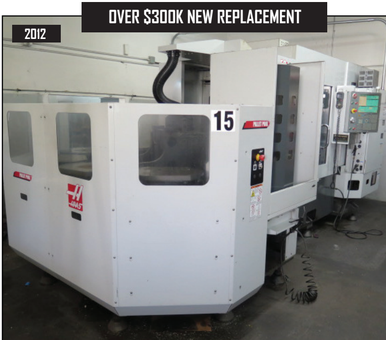
2012 Haas EC-400PP 6-Pallet "Pallet Pool" CNC HMC w/ 70-ATC, CAT-40, 12,000 RPM, Renishaw Tool Presetter, Intuitive Probing System, Full 4 th Axis, Rigid Tapping, Programmable Coolant