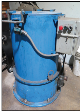
Nobles mdl. 40373.2 Chip Spinner