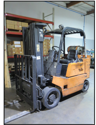
Yale GLC060LCJSBE083BCS 6000 Lb Cap LPG Forklift

ALL MACHINERY MOVERS MUST BE APPROVED BY THE SELLER PRIOR TO REMOVAL OF EQUIPMENT