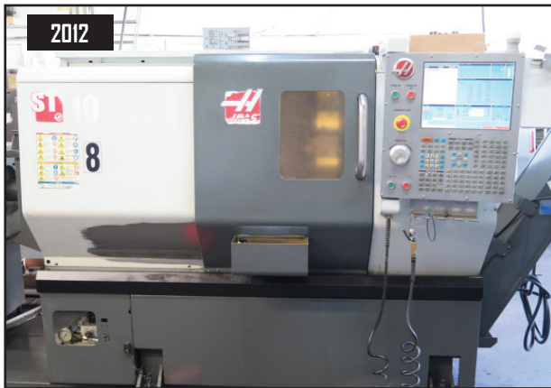
2012 Haas ST-10 Live Turret CNC Turning Center w/ Tool Presetter, 12-Station Live Turret, (5) Live Tooling, 8" Power Chuck, 5C and 16C Noses