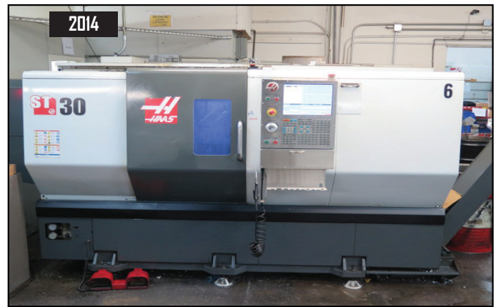
2014 Haas ST-30 CNC Turning Center w/ 12-Station Turret, Tailstock, 10" Power Chuck, Chip Conveyor