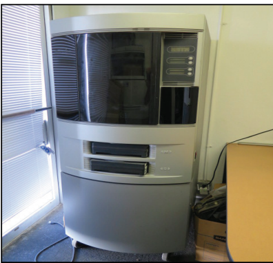
Dimension Elite 3-D Printer With Desolve Tank