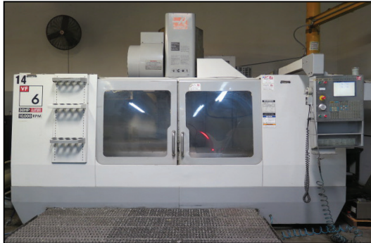
2005 Haas VF-6B/40 CNC VMC w/ 24-Station Side Mount ATC, CAT-40, 10,000 RPM, 30Hp, 2-Speed Gear Drive, Rigid Tapping, Floating Point Co-Processor, Advanced Tool Management, New Gear Box 07/2023

PRESORTED First-Class Mail U.S. Postage PAID STA CLARITA, CA Permit No. 298