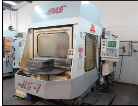
1996 Haas HS-1 2-Pallet CNC HMC w/ 24-ATC, CAT-40, 7500 RPM, 4 th Axis Thru Pallets, Renishaw Wireless Probing System, Rigid Tapping