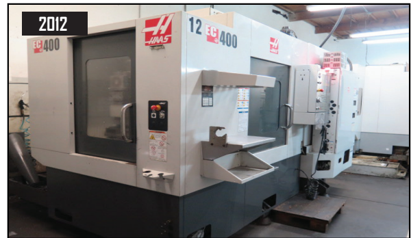
2012 Haas EC-400 2-Pallet CNC HMC w/ 40-ATC, CAT-40, 12,000 RPM, Intuitive Probing System, Renishaw Wireless Probing System, 1 Degree 4 th Axis, Rigid Tapping, High Speed Machining