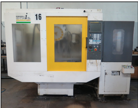
2000 Fanuc Robodrive α-T14iBL 2-Pallet CNC Drilling Center w/ Fanuc 16i-M Controls, 14-ATC, BT-30, (2) 15" x 27 1/2" Tables works perfect.