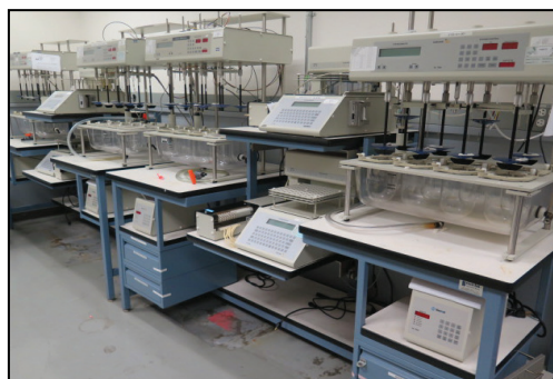
Varian and VanKel Dissolution Sampling Systems w/ VK8000, VK7000, VK750D, VK810