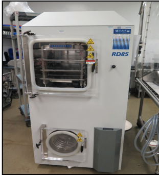
Millrock Technology RD85 Freeze Dryer w/ PC/PLC Control System, 12" x 24" Shelves

PRESORTED First-Class Mail U.S. Postage PAID STA CLARITA, CA Permit No. 298