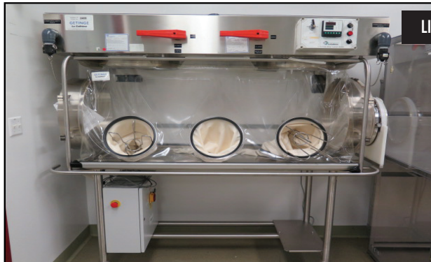
Getinge mdl. 2498 3-Glove Transfer Isolator w/ Sanitizing Agent Ports, Digital Pressure Isolator