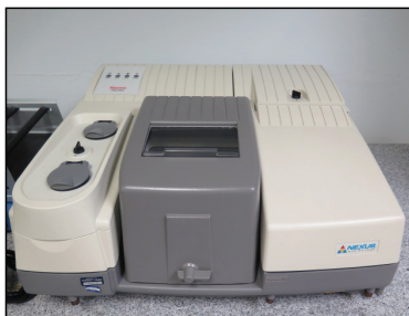
Thermo Nicolet "Nexus 470 TF-IR ESP" FT-IR Spectrometer