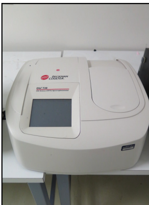
Beckman Coulter A23616 / Life Science DU730 UV/ VIS Spectrophotometer