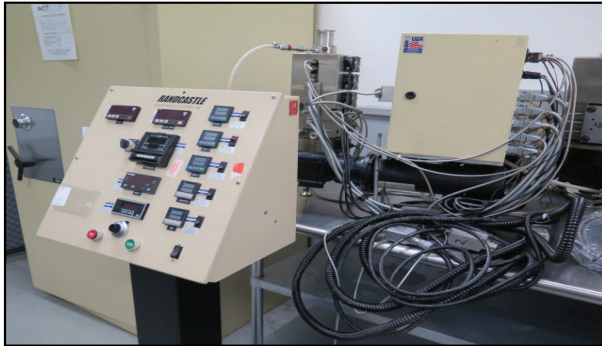
Randcastle RCP-0375 3/8" Single Screw Extruder w/ Randcastle Controls