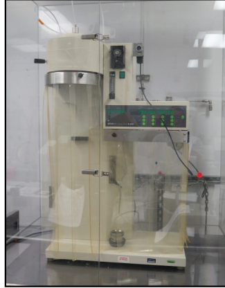
Buchi Type B290 Mini Spray Dryer w/ Stainless Table and Enclosure