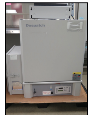
Despatch LAC1-38A-5 Lab Oven w/Chart Recorder/w Hepa Filter

ALL MACHINERY MOVERS MUST BE APPROVED BY THE SELLER PRIOR TO REMOVAL OF EQUIPMENT