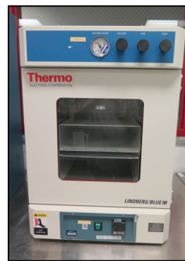
Thermo Electron Lindberg / BlueM mdl. V01218A Vacuum Oven