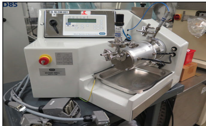
WAB (Willy A Bachofer) "Dyno-Mill Multi Lab" Ball Mill w/ Digital Controls with Peristaltic Pump