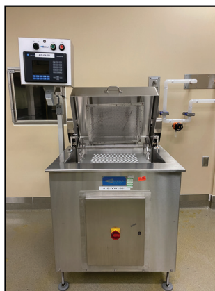
Cozzoli Vial Washing Machine w/ Allen Bradley PanelView 600 PLC Controls