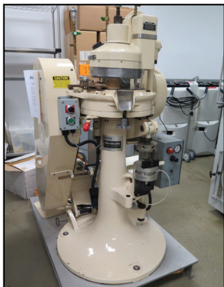
Stokes mdl. 512-1 Tablet Machine