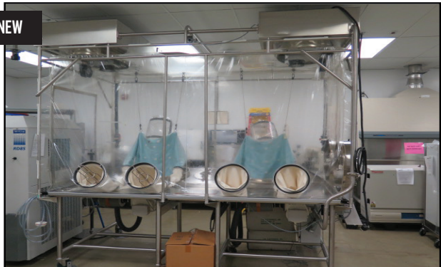
2006 Getinge / La Calhene mdl. S2HP-30097 Work Station Isolator Booth w/ (2) Half-Suits, (2)Gloves, (3) Isolated Loading Chambers