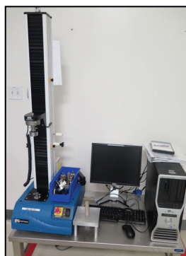
Instron mdl. 3343 - System # 3343Q9374 Tensile Tester