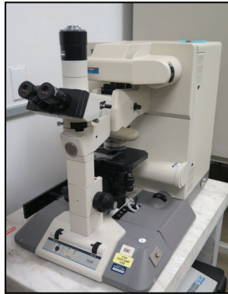
Nicolet "Nic-Plan" Infrared Microscope w/ Access