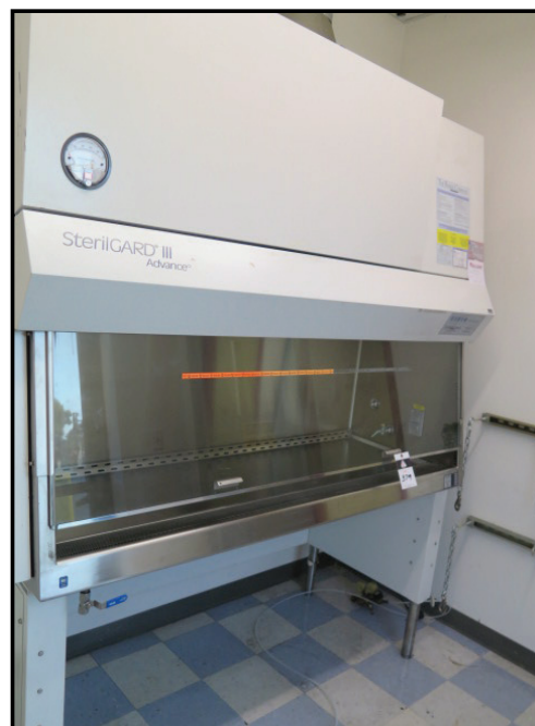
Baker Co & SterilGARD III Advance, mdl. SG603 Flow Hood