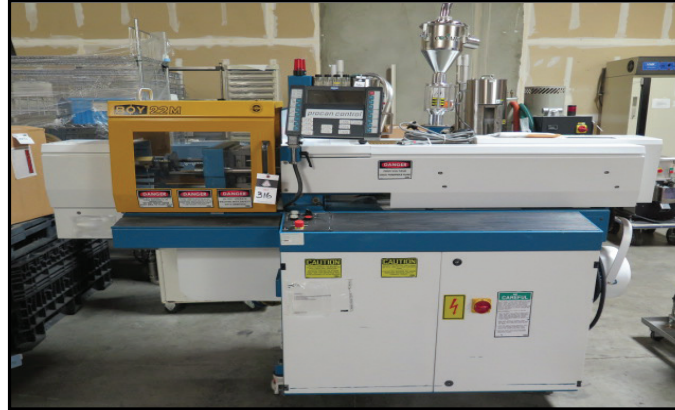
BOY 22M 24 Ton CNC Plastic Injection Molding Machine w/ Procan Controls