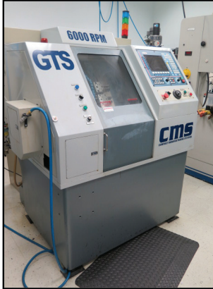
CMS mdl. GTD CNC Cross Slide Lathe w/ Fagor CNC Controls, 6000 RPM, 5C