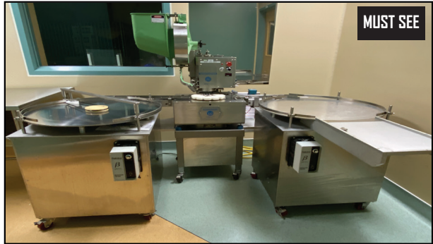
West Coast Inc. Type NPW-500 Vial Capping Machine w/ Controls