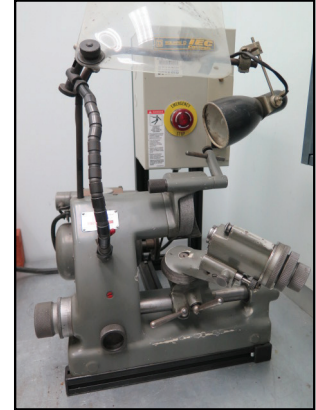
Deckel SO Single Lip Tool Grinder