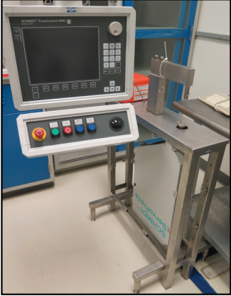
Schmidt ServoPress 415 1kN CNC Press w/ Schmdt 4000 CNC Controls