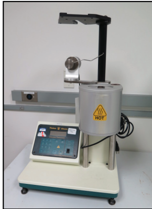
Tinus Olson MP600M Extrusion Plastometer