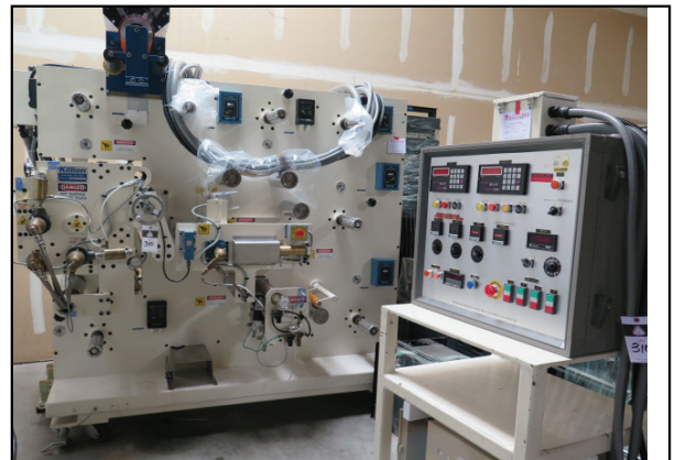
Killion Patch Machine (IE Nicotine Patches) w/ Controls, Corotec Narrow Web 7& Corona Treatment System