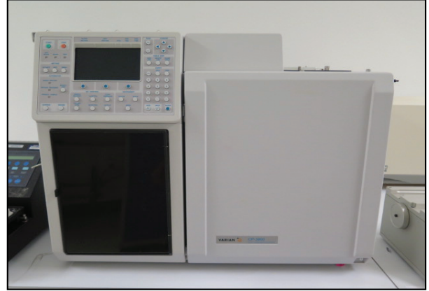
Varian CP-3800/3380 Gas Chromatograph