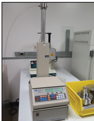
Teledyne Isco D-Series Syringe Pump