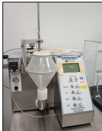
Caleva "Mini Coater / Dryer2" Small Batch Tablet Pellet Coater / Mini Coater Dryer