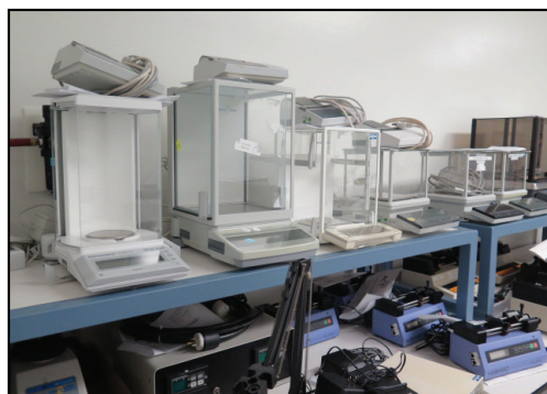
Mettler Toledo Digital Balance Scales

w/ Randcastle Controls, Cone Drive, 3/4 Hp Motor.