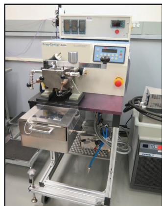
Brabender Prep-Center Type 08-13-000 Extruder w/ R.E.O.-6/2 Measuring Head