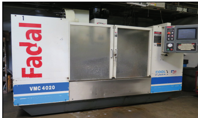
2002 Fadal VMC 3016HT 4-Axis CNC VMC w/ Fadal CNC88HS Flat-Screen Controls, 21-Station ATC, BT-40 Spindle, 10,000 RPM