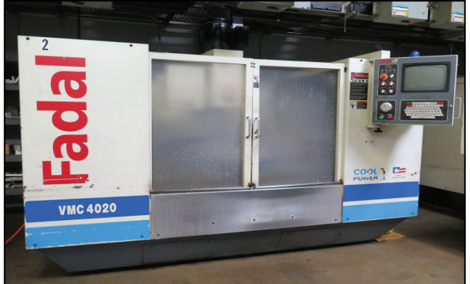
2000 Fadal VMC 4020HT CNC VMC w/ Fadal Multi Processor CNC Controls, 21-Station ATC, BT-40Spindle, 10,000 RPM