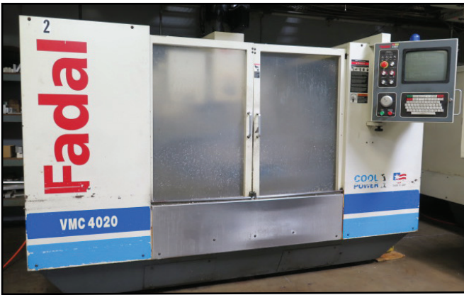
2000 Fadal VMC 4020HT CNC VMC w/ Fadal Multi Processor CNC Controls, 21-Station ATC, BT-40 Spindle, 10,000 RPM