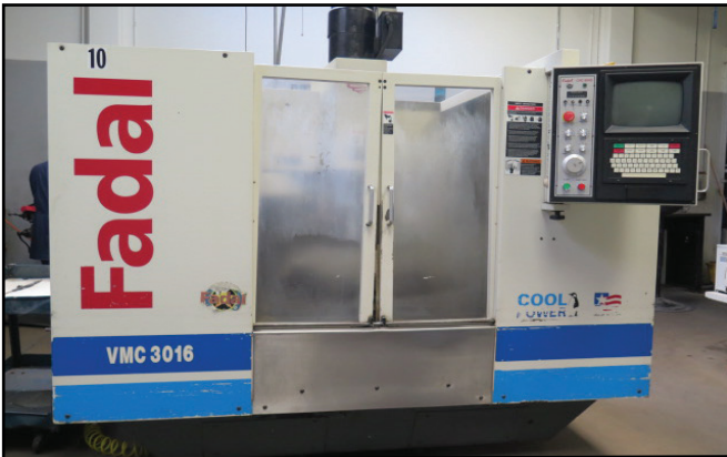
2001 Fadal VMC 3016HT 4-Axis CNC VMC w/ Fadal CNC88HS Controls, 21-Station ATC, BT-40 Spindle, 10,000 RPM, Rigid Tapping, High Speed CPU, Graphics