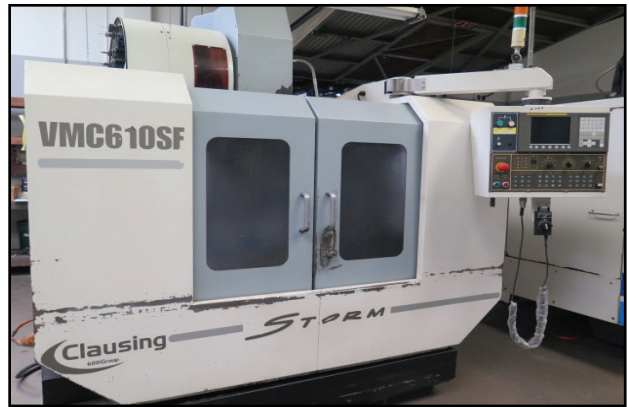
Clausing "Storm" VMC 610SF CNC VMC w/ Fanuc 0i-MC Controls, 24-Station Side Mount ATC, CAT-40 Spindle, 10,000 RPM, Rigid Tapping