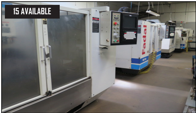
Fadal CNC Machining Centers **15-AVAILABLE**