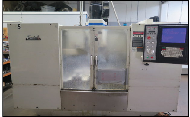
Fadal VMC 3016HT CNC VMC w/ Fadal CNC88HS Controls, 21-Station ATC, BT-40 Spindle, 10,000