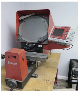
Starrett HE350 14" Optical Comparator w/ Quadra-Chek 200 DRO, Digital Angular Readout, Shadow Detector