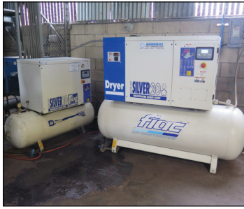
Late Model Fiac Silver 20 and Silver 10 Rotary Air Compressors