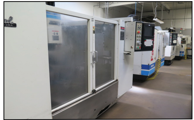
Partial View of Fadal Vertical Mill