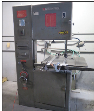
Powermatic mdl. 87 20" Vertical Band Saw