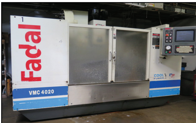
2002 Fadal VMC 3016HT 4-Axis CNC VMC w/ Fadal CNC88HS Flat-Screen Controls, 21-Station ATC, BT-40 Spindle, 10,000 RPM