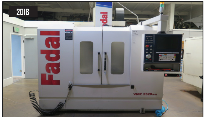
2018 Fadal VMC 2520 R-II CNC VMC w/ Fadal 64MP Controls, 24-Station Side Mount ATC, BT-40Spindle, 10,000 RPM, Rigid Tapping, Oil Cooler