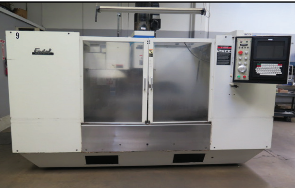
Fadal VMC 4020HT CNC VMC w/ Fadal CNC88HS Flat-Screen Controls, 21-Station ATC, BT-40 Spindle, 10,000 RPM, Rigid Tapping, High Speed CPU, Graphics