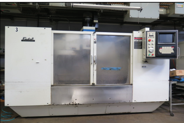
Fadal VMC 5020AHT CNC VMC w/ Fadal CNC88HS Controls, 21-Station ATC, BT-40 Spindle, 10,000 RPM, High Speed CPU, Graphics

Ryobi 4" Belt / 6" Disc Sander w/ Stand.