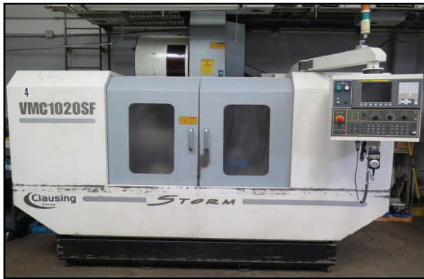
Clausing "Storm" VMC 1020SF CNC VMC w/ Fanuc 0i-MC Controls, 24-Station Side Mounted ATC, CAT-40 Spindle, 10,000 RPM, Rigid Tapping