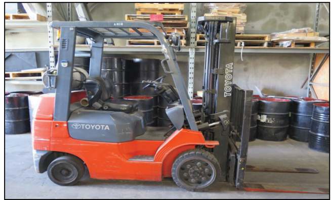
Toyota 7FGCU25 4900 Lb Cap LPG Forklift w/ 3-Stage Mast, 189" Lift Height, Side Shift, 7882 Hours

ALL MACHINERY MOVERS MUST BE APPROVED BY THE SELLER PRIOR TO REMOVAL OF EQUIPMENT