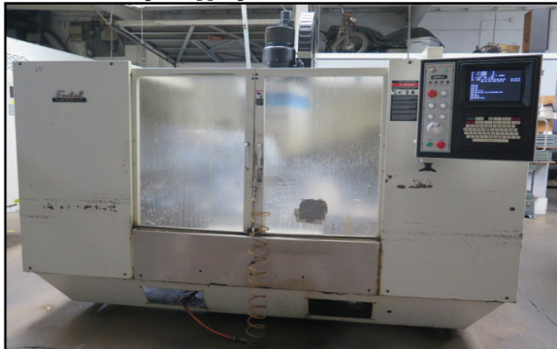
Fadal VMC 4020HT CNC VMC w/ Fadal CNC88HS Controls, 21-Station ATC, BT-40 Spindle, 10,000 RPM