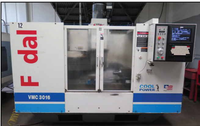
2002 Fadal VMC 3016HT 4-Axis CNC VMC w/ Fadal CNC88HS Flat-Screen Controls, 21-Station ATC, BT-40 Spindle, 10,000 RPM