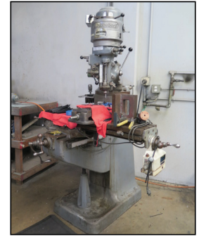
Kondia "Powermill" Vertical Mill w/ Mitutoyo DRO, 85-3000 RPM, Power Feed