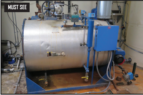
MUST SEE 2014 General Boiler mdl. GBSM3SMLN25 Steam Boiler s/n 2546 w/ Natural Gas Fired, 24Hp,999(1000)BTU, (2) 1500 Gallon Plastic Reserve Storage Tanks. 2014 General Boiler mdl. GBSM3SMLN25 Steam Boiler s/n 2546 w/ Natural Gas Fired, 24Hp,999(1000)BTU, (2) 1500 Gallon Plastic Reserve Storage Tanks.