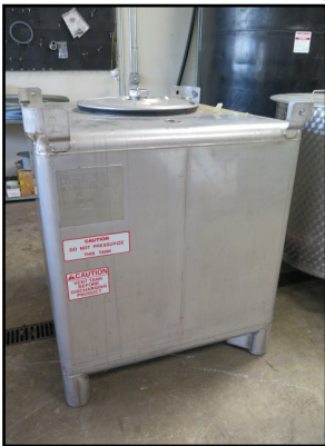
2007 G.W. Kent type 31A 1325 Liter (350 Gallon) Stainless Steel Stackable Storage Tank s/n DCLE-GW-026.