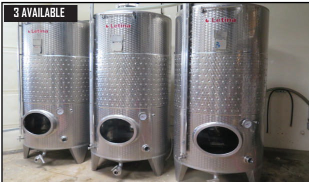
3 AVAILABLE (3) 2014 Letina type Z2000HV11 2000 Liter Jacketed Closed Storage Tanks s/n's 051014/4, 051014/3, 051014/2. Column, Column Framework, Pumps.