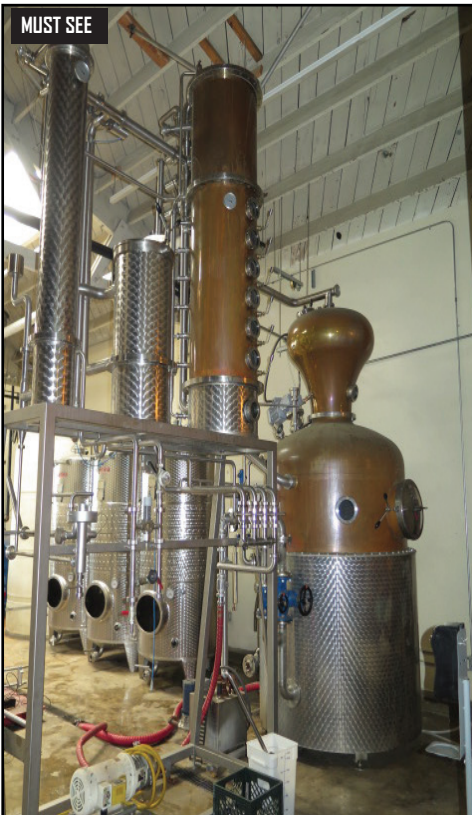
Carl Artesian Small Batch Distillery Still w/ Timers and Controls, 600 Liter Charge Cap, Collection Helmet, Tall Column, Cooling Column, Column Framework, Pumps.