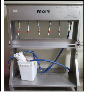
2016 Mori type Ri6MA 6-Station Wine Bottle Filling Machine w/ 720 Lt/h Cap.