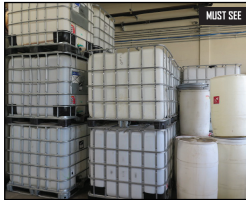
MUST SEE (16) 1000 Liter (250 Gallon) Stackable Plastic Storage Tanks.