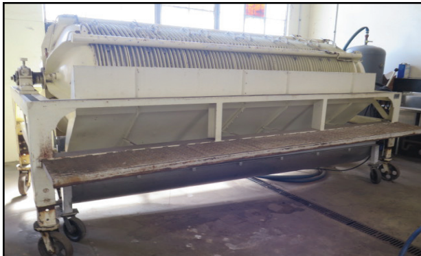
Willmes Presser Type 2300-1700 2300 Liter Press s/n 23079.