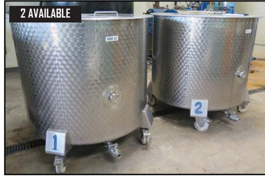
2 AVAILABLE (2) 1000 Liter Stainless Steel Rolling Transfer Tanks w/ Lids. 2015 Letina type PZ1000S10 1000 Liter Rolling Storage Tank s/n 006715/6.