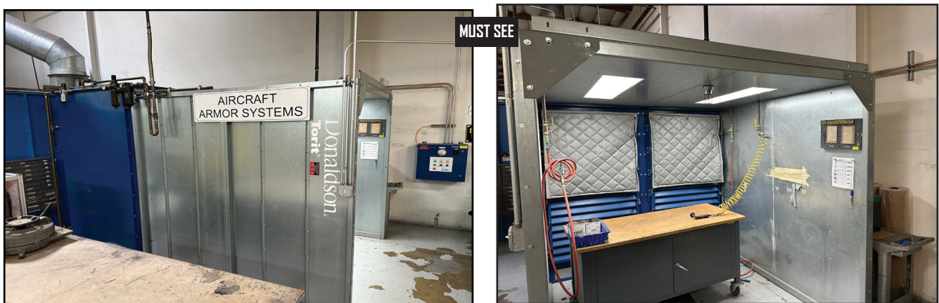
DONALDSON DEBURRING STATION WITH DUST COLLECTION AND FILTER

LARGE SELECTION OF SHELVES, RACKS BENCHES, LADDERS AND TABLES. LARGE SELECTION OF INDUSTRIAL FUME HOODS, AIR CONDITIONER UNIT, GRIND BOOTHS, AND CABINETS. ATLAS COPCO 5HP AIR COMPRESSOR.