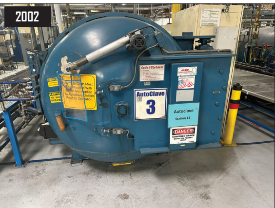
2002 SPALLINGER 5FT X 20FT AUTOCLAVE, REFURBISHED, TOUCH PAD CONTROLS, MAX ALLOWABLE WORKING PRESSURE 125 PSI AT 450 F, MINIMUM DESIGN MATERIAL TEMPERATURE 40F AT 125 PSI, S/N 02-0832.