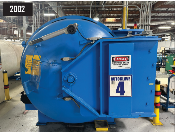
2002 SPALLINGER 5FT X 20FT AUTOCLAVE, REFURBISHED, TOUCH PAD CONTROLS, MAX ALLOWABLE WORKING PRESSURE 125 PSI AT 450 F, MINIMUM DESIGN MATERIAL TEMPERATURE 40F AT 125 PSI, S/N 02-0832.