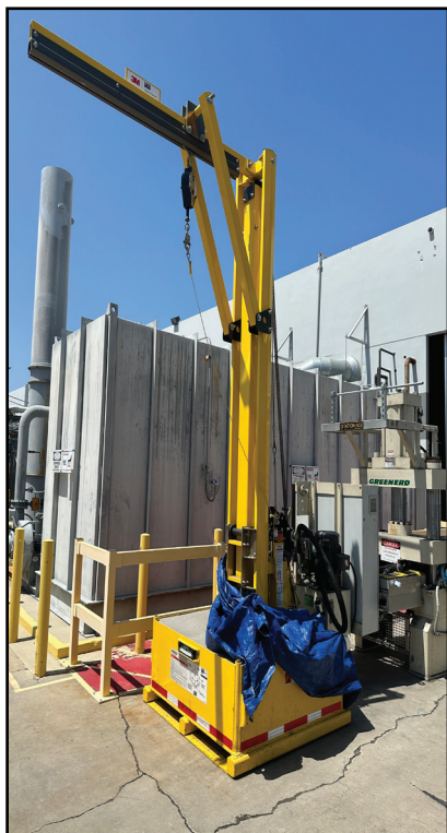
DBI-SALA MODEL 8530558 FLEXI GUARD EMU ADJUSTABLE MOBILE JIB CRANE.