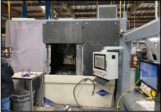
WARDJET WATERJET SYSTEM,

PREVIEW: BY APPOINTMENT ONLY WITH VALID DOCUMENTATIONS "On-line bidding thru bidspotter.com"