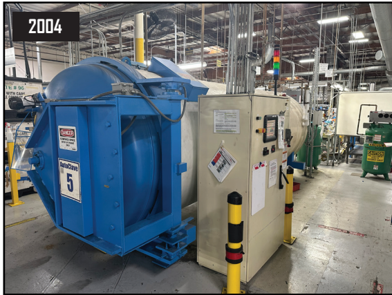
2004 SPALLINGER 6FT X 20FT AUTOCLAVE, REFURBISHED, TOUCH PAD CONTROLS, MAX ALLOWABLE WORKING PRESSURE 125 PSI AT 450 F, MINIMUM DESIGN MATERIAL TEMPERATURE 40 F AT 125 PSI, S/N 04-0258.