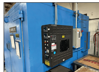
GRIEVE WALK IN OVEN, ELECTRIC FIRED, MODEL MODIFIED, MAX 500