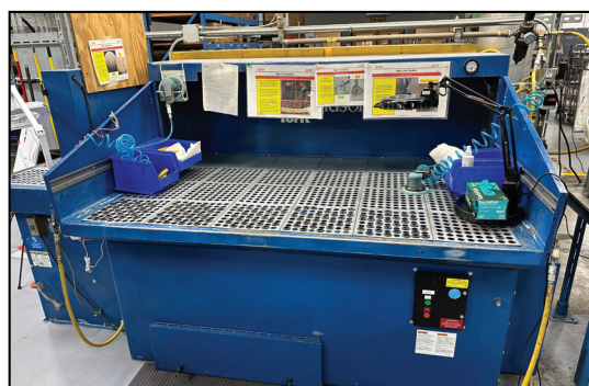
Donaldson Downdraft Table

ALL MACHINERY MOVERS MUST BE APPROVED BY THE SELLER PRIOR TO REMOVAL OF EQUIPMENT