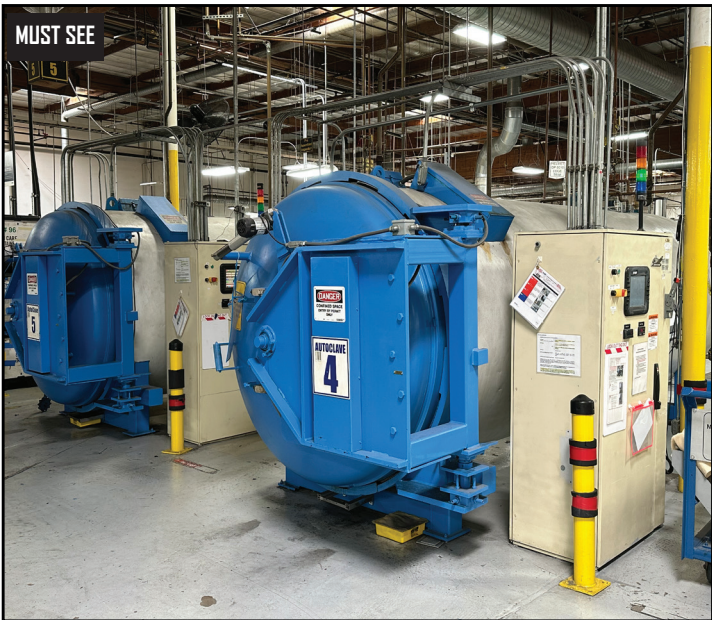
VIEW OF AUTOCLAVE DEPARTMENT

PREVIEW: BY APPOINTMENT ONLY WITH VALID DOCUMENTATIONS