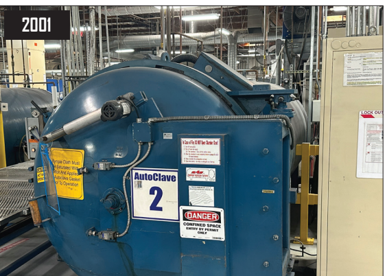
2001 SPALLINGER 5FT X 20FT AUTOCLAVE, REFURBISHED, TOUCH PAD CONTROLS, MAX ALLOWABLE WORKING PRESSURE 125 PSI AT 350 F, MINIMUM DESIGN MATERIAL TEMPERATURE 40 F AT 125 PSI, S/N 01-0960.