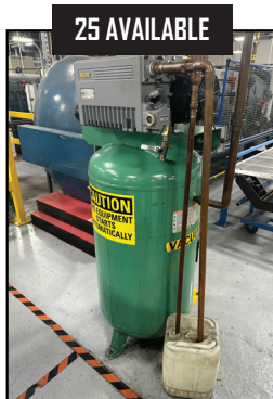
1 OF 25) GARDNER DENVER 55553014 WITH BUSCH VACUUM SYSTEM AND 80 GALLON TANK.