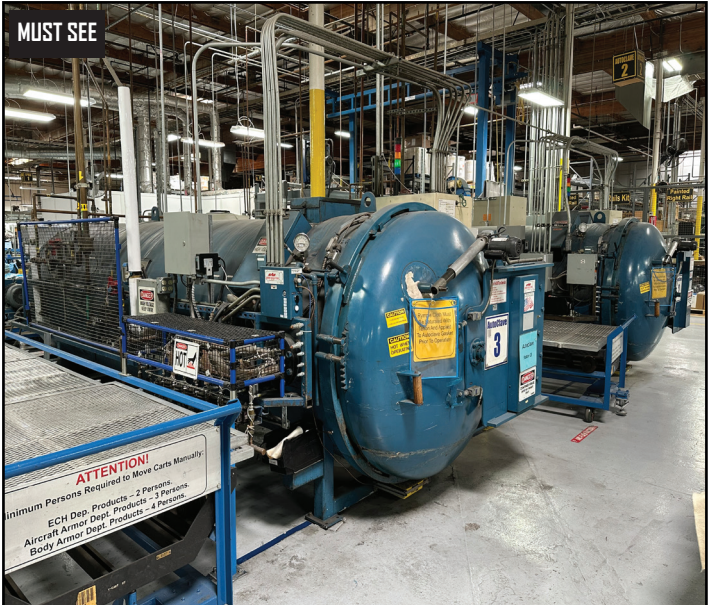
VIEW OF AUTOCLAVE DEPARTMENT

NOTE: ITEMS MAY BE SOLD PRIOR TO AUCTION REMOVAL: ALL ITEMS WILL HAVE DIFFERENT PICK UP LOCATION IRVINE OR LA MIRADA, CALIFORNIA