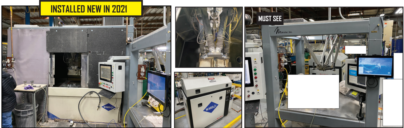
WARDJET WATERJET SYSTEM, W/ HYPER THERM P-75S PUMP, PRAB PAPER BED FILTER, SOFT WATER SYSTEM, SMART REMOVE SYSTEM, MIKROLAR 6 AXIS MEASURING SYSTEM FOR RAPID SIZING AND TRANSFER.