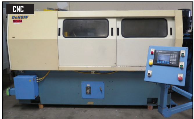
DeHoff 1536 CNC Gun Drilling Machine w/ Allen Bradley PanelView 550 Controls