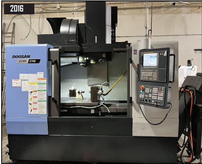
2016 Doosan DNM 5700 4-Axis CNC Vertical Machining Center s/n MV0091-000413 w/ Doosan-Fanuc iSeries Controls, Hand Wheel, "Easy Operation Package", 30-Station ATC, 40-Taper Spindle