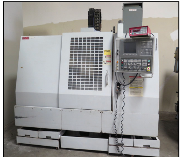
Okuma CadetMate CNC VMC w/ OSP700M Controls, 20-Station ATC, 40-Taper Spindle 6128 2016 Doosan DNM 5700 4-Axis CNC VMC w/ Fanuc iSeries Controls, "Easy Operation Package", 30-Station ATC, 40-Taper Spindle