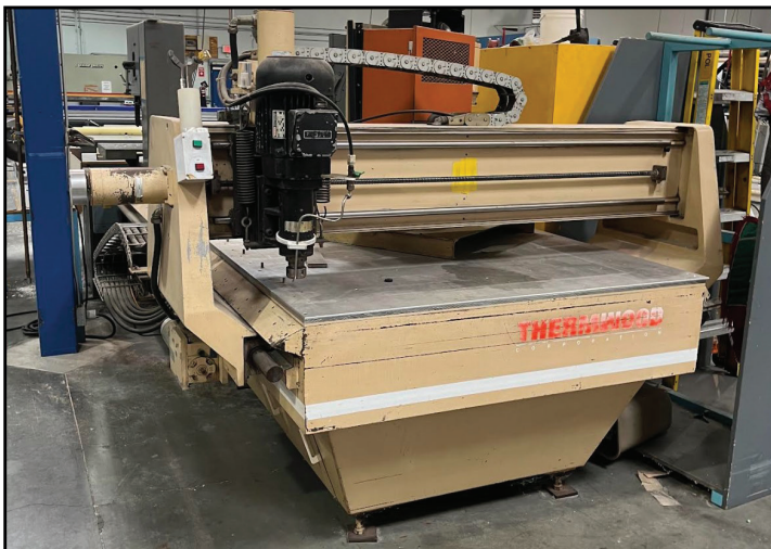
Thermwood 3 Axis Router.