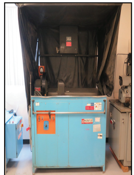
Magnaflux mdl. 11-700 Magnetic Particle Inspection Devise w/ 12" Coil ID, 54" Max Length,