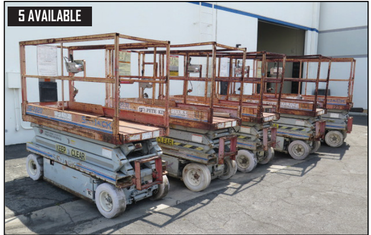
Skyjack SJIII 3220 20' Electric Scissor Platform Lifts **5-AVAILABLE**