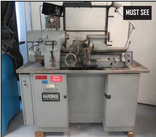
Hardinge HLV-H Wide Bed Tool Room Lathe w/ Sony LH52 DRO, 125-3000 RPM, Inch Threading, Power Feeds