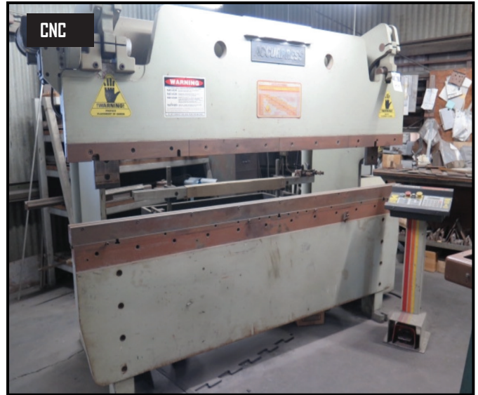
1997 Accupress model 7608, 8ft x 60 Ton CNC Press Brake,, S/N 4314.