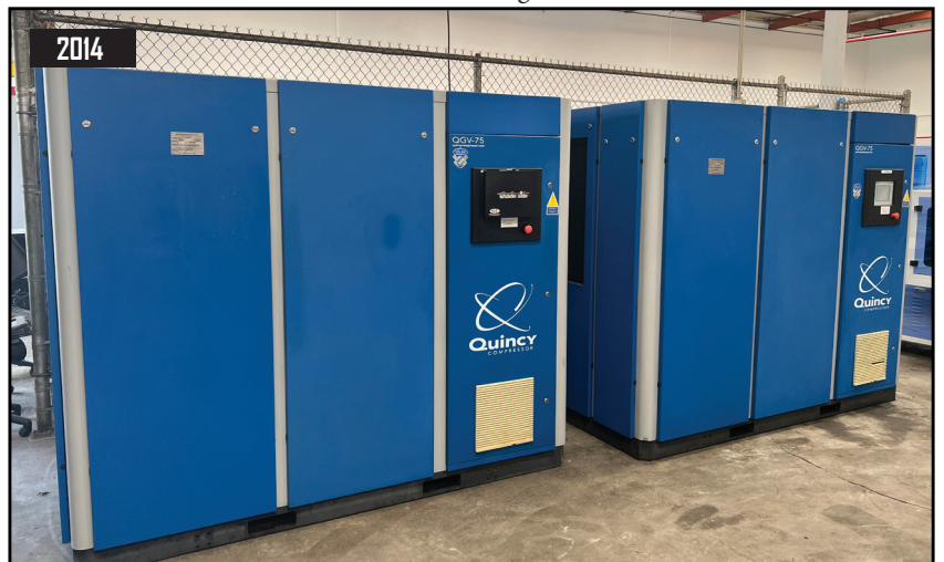
2) 2014 Quincy QGV-75, 75 HP Rotary Air Compressors w/ Siemens Touch Panel Control.