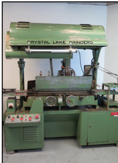
Cryatal Lakes 9" x 18" Cylindrical Grinder