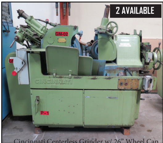
Cincinnati Centerless Grinder w/ 26" Wheel Cap, Hydraulic Wheel Dresser **2-AVAILABLE**