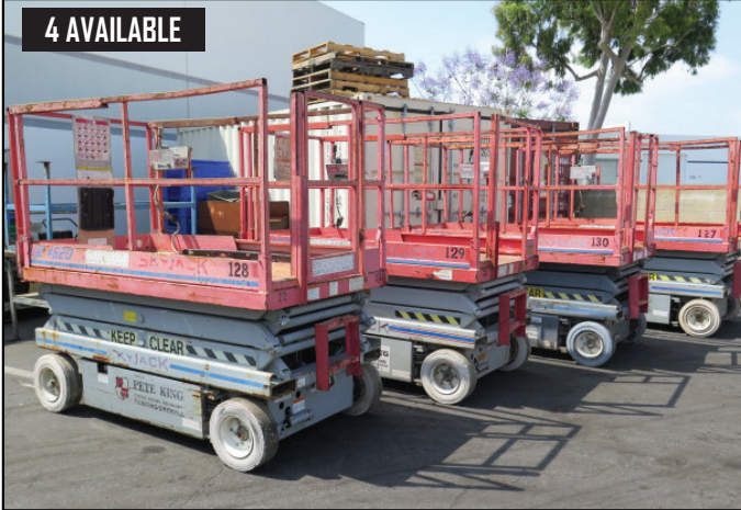
Skyjack SJII 4620 20' Electric Scissor Platform Lifts **4-AVAILABLE**