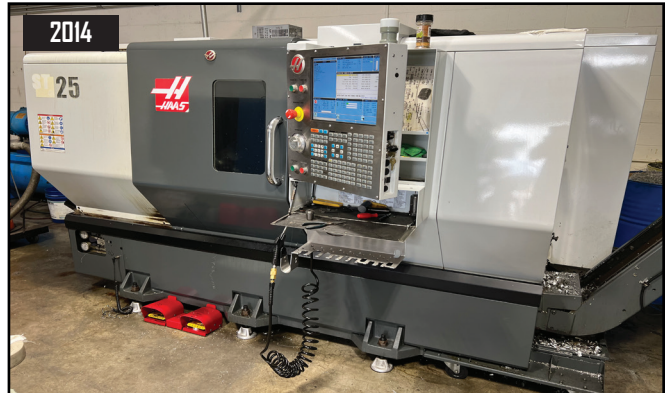
2014 Haas Model ST-25 CNC Lathe, w/ Tail Stock, Chip Conveyor, 10" Chuck, 12 Station Turret, 3400 RPM.