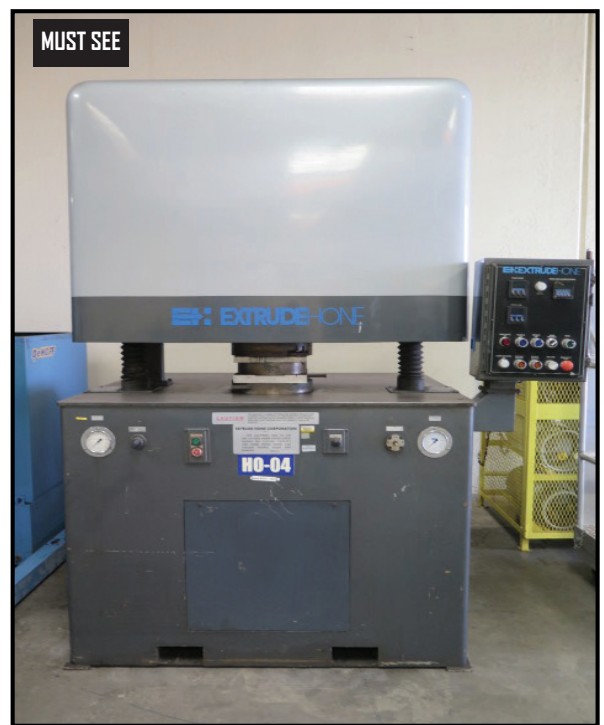
Extrude Hone "Spectrum VIII" Media Honing Machine w/ Extrude Hone Controls