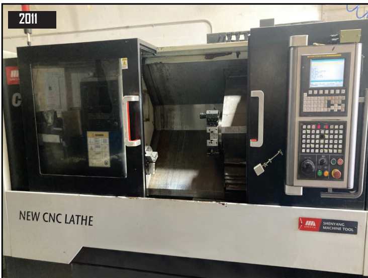
2011 SMTCL Shenyang CAK365, CNC Lathe, w/ Fanuc Oi Controla, 8 Position Turret, 2000 RPM, 16" Swing, S/N A31010027