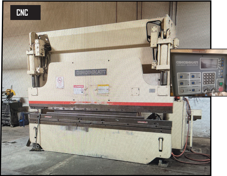
1996 Cincinnati CBII 90 x 10, 12FT x 90 Ton CNC Hydraulic Press Brake, w/ Cincinnati CNC Controls, s/n 52261 Location City of Industry, CA