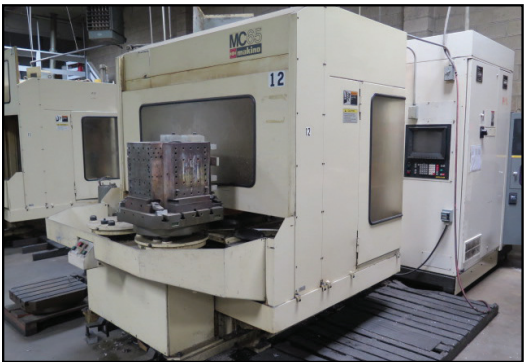
LeBlond Makino MC65-A60 2-Pallet CNC HMC w/ Fanuc 6M Controls, 60-ATC, CAT-50, 4th Axis Thru Pallets

LeBlond Makino FNC128-A30 4-Axis CNC Vertical Machining Center s/n A58-370 w/ Fanuc System 6M Controls, Hand Wheel, 30-Station ATC, CAT-50 Taper Spindle, Oilmatic Oil Cooler, 31 1/2" x 71" Table, Coolant.