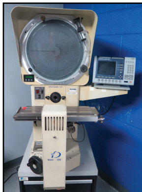
Dorsey "Benchmark 16H" 16" Optical Comparator w/ Quadra-Chek 200 DRO, Digital Angular Readout, Shadow Detector