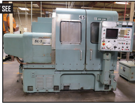
Mori Seiki SL-3A CNC Turning Center w/ Fanuc 6T Controls, 12-Station Turret, Tailstock, 8" Chuck