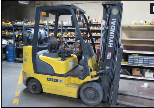
Hyundai 25-7 Forklift