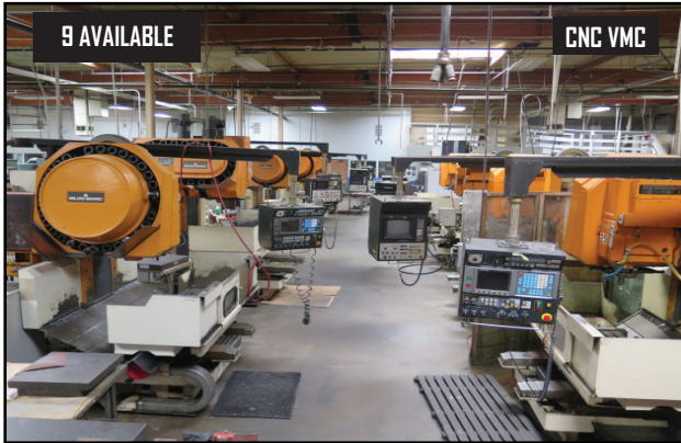
LeBlond Makino FNC-74/A30 4-Axis CNC VMC's w/ Fanuc, 11M and 0M Controls, 30-ATC, BT-40 ***9 AVAILABLE***