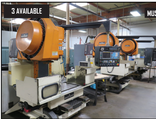
LeBlond Makino FNC128-A30 4-Axis CNC VMC w/ Fanuc 6M Controls, 30-ATC, CAT-50 ***3 AVAILABLE***