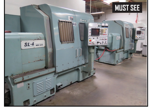
Mori Seiki SL-4 CNC Turning Centers