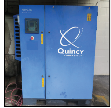
Quincy QGS-50 Air Compressor