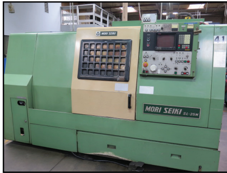
Mori Seiki SL-25MC5 CNC Turning Center w/ Fanuc 10T Controls, 12-Station Turret, Tailstock, 8" Chuck