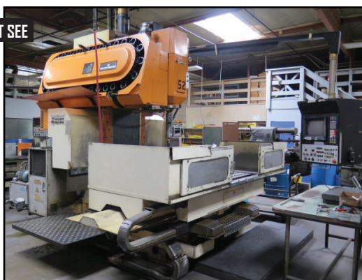
LeBlond Makino FNC128-A30 4-Axis CNC VMC w/ Fanuc 6M Controls, 30-ATC, CAT-50