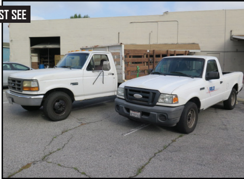
2005 Ford Ranger and 1997 Ford F350