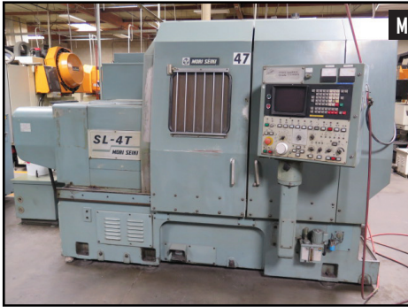
Mori Seiki SL-4T CNC Turning Center w/ Fanuc 6T Controls, 12-Station Turret, Tailstock, 10" Chuck