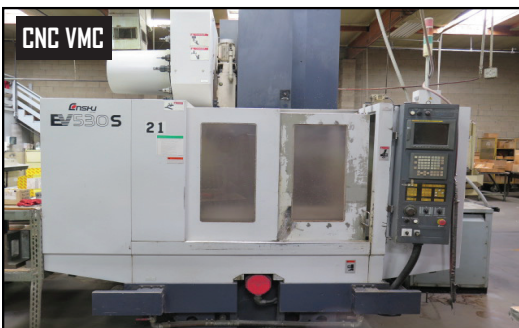
Enshu EV530S CNC VMC w/ Fanuc 18i-M Controls, 30-ATC, CAT-40, 12,000 RPM, Chip Augers

LeBlond Makino VNC-106-A20 4-Axis CNC Vertical Machining Center s/n A57-614 w/ Fanuc System 6M Controls, Hand Wheel, 20-Station ATC, CAT-50 Taper Spindle, Oilmatic Oil Cooler, 24" x 55" Table, Coolant.