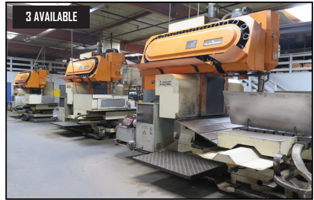
LeBlond Makino FNC128-A30 4-Axis CNC VMC w/ Fanuc 6M Controls, 30-ATC, CAT-50 ***3 AVAILABLE***