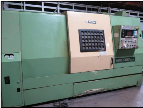
Mori Seiki SL-35A CNC Turning Center w/ Fanuc 10T Controls, 12-Station Turret, Tailstock, 11" Chuck