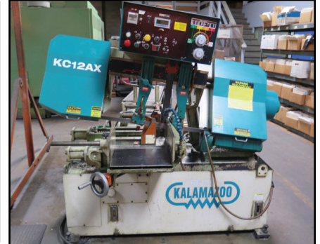
Kalamazoo 2010 Saw

ALL MACHINERY MOVERS MUST BE APPROVED BY THE SELLER PRIOR TO REMOVAL OF EQUIPMENT