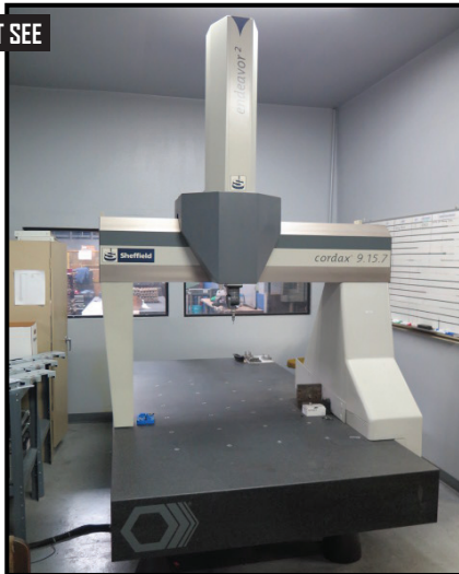
Sheffield "Endeavor 2" Cordax 9.15.7 CMM Machine w/ Tesastar 111 Probe, PC-DMIS Software