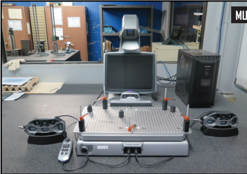
Keyence XM Series XM-C1000 Hand-Held CMM System w/ (2) XM-P200 Hand-Held Probes