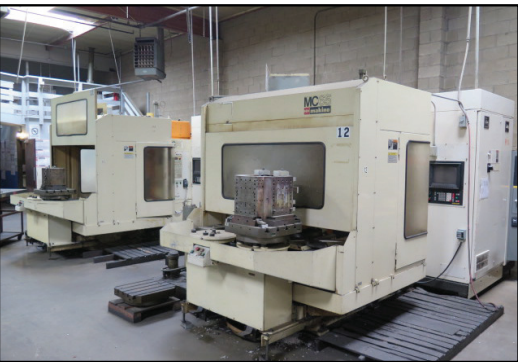
LeBlond Makino MC65-A40 2-Pallet CNC HMC's w/ Fanuc 11M and 6M Controls, 40-ATC, CAT-50