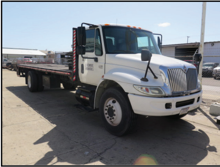
2005 International 4300 DT466 24' Stake Bed Truck w/ 7.6L Diesel Engine, Automatic Trans, AC, Maxon Lift Gate, 314,463 Miles