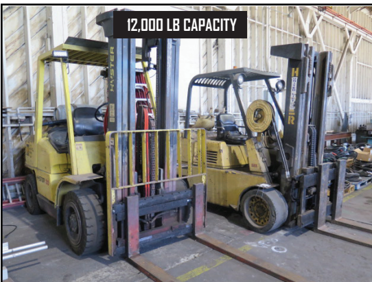
Hyster 8,000 Lb and 12,000 Lb Cap LPG Forklifts