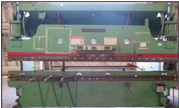
Cincinnati 90CBx10 90 Ton x 12' Hydraulic Press Brake w/ Cincinnati Controls, Manual Back Gauge, 12' Bed Length, 7 3/16" Throat