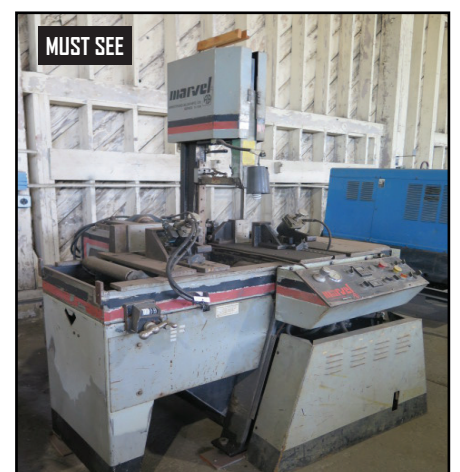
Marvel Series V-10A Miter Vertical Band Saw w/ Marvel Controls, Hydraulic Clamping