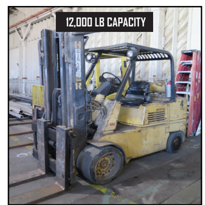
Hyster S120E 12,000 Lb Cap LPG Forklift w/ 3-Stage Mast, 179" Lift Height, Side Shift, Cushion Tires