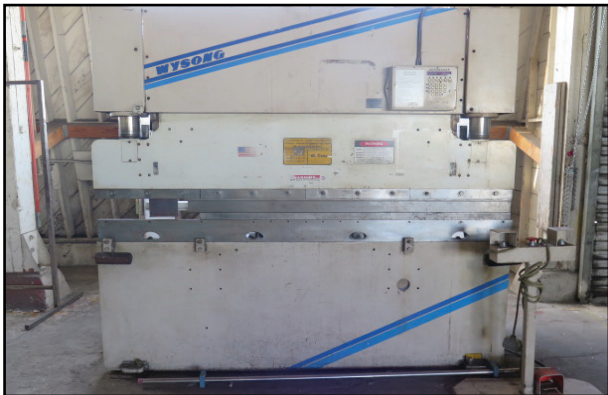
Wysong MTH 60-98 CNC 60 Ton x 98" Hydraulic Press Brake w/ Autogauge CNC99 Controls, 6" Stroke, 5 7/8" Throat, 13" Die Space