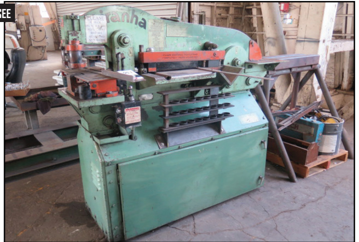
Piranha P50 Hydraulic