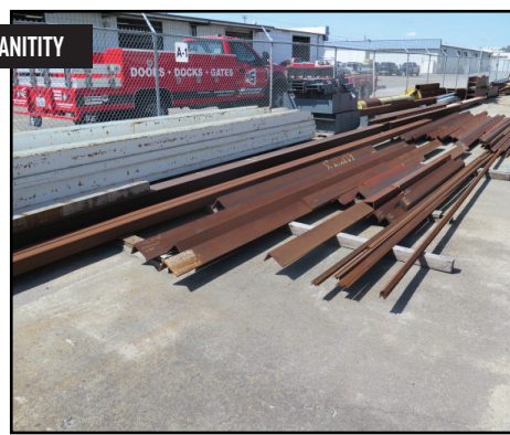
I-Beam, H-Beam, Channel and Angle Iron, Metal Sheet Stock, Round and Square Tube Stock