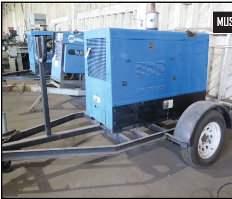
Miller Towable Welder / Generators