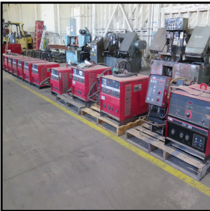
Lincoln Arc Welders