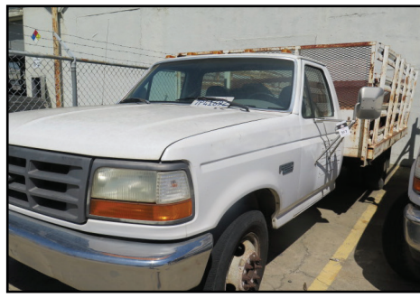
1996 Ford F-350XL Stake Bed Truck w/ Gas Engine, Automatic Trans