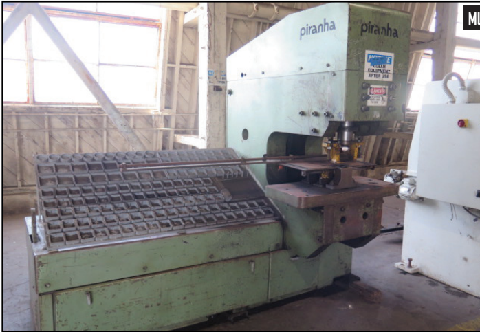
Piranha SEP-140 140 Ton Hydraulic Punch Press w/ 1 3/4" thru 1", 1 3/8" thru 1 1/4" Cap, 20" Throat, Punch Tooling