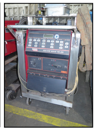
Lincoln Square Wave TIG 255 AC/DC Arc Welder