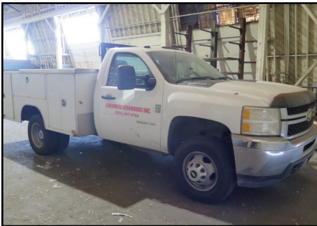
2011 Chevrolet Silverado 3500HD Service Truck w/ Vortec 8-Cylinder Gas Engine, Automatic Trans, Dual Tanks, AC