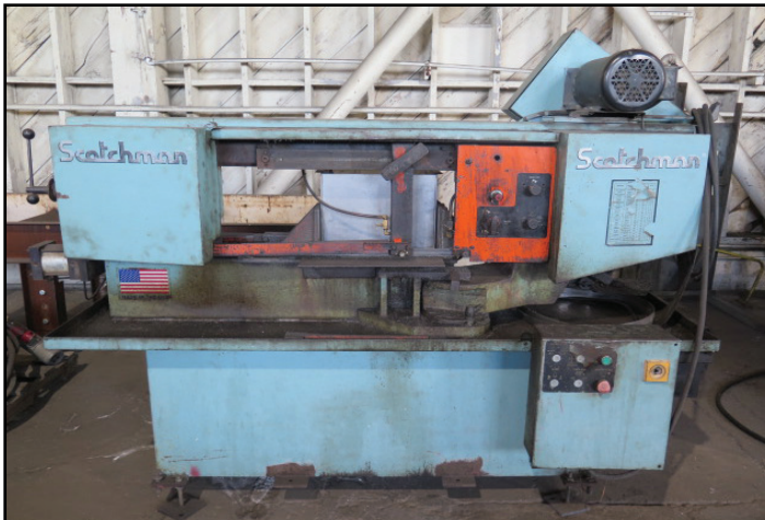
Scotchman 12" Miter Horizontal Band Saw