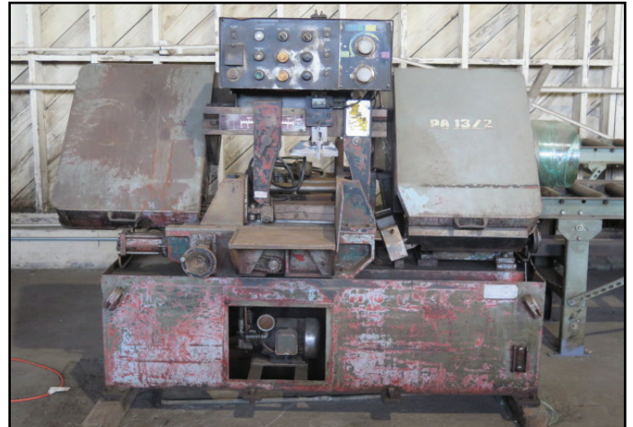
Marvel Spartan PA13/3 Automatic Horizontal Band Saw w/ Marvel Controls, Hydraulic Clamping and Feed, Bundling Attachment