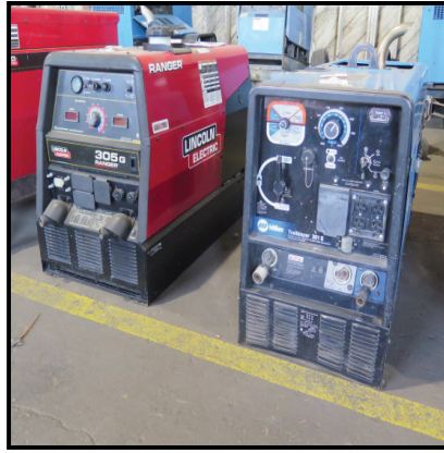
Miller and Lincoln Welding Generators