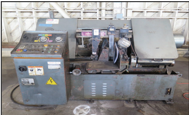
Marvel Spartan PA13/3 Automatic Horizontal Band Saw w/ Marvel Controls and Hydraulic Clamping and Feed