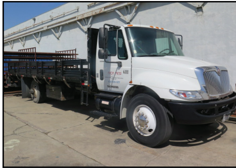
2005 International 4300 DT466 24' Stake Bed Truck w/ 7.6L Diesel Engine, Automatic Trans, AC, Air Brakes, Maxon Lift Gate