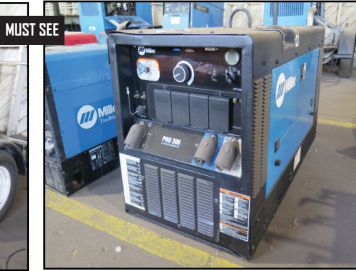
Miller Pro 300 Diesel Powered Welding Generator w/ Cat 21.7Hp Diesel Engine