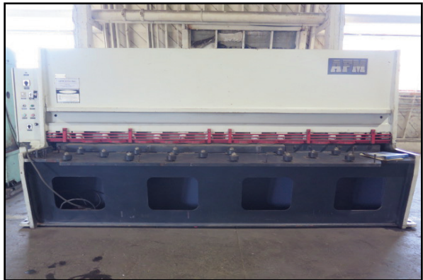
AEM MK6-31 MK Series Hydraulic Auto Shear w/ Power Back Gauge, 78" Squaring Arm, Front Supports