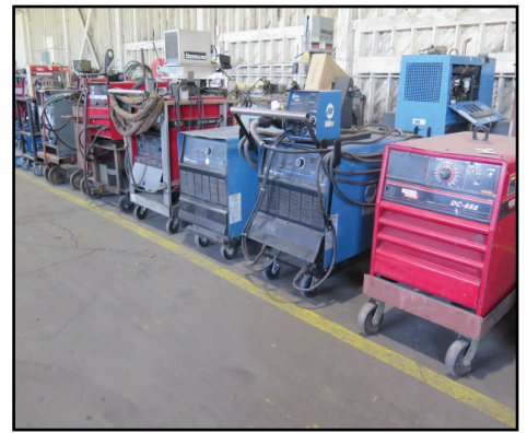
Miller and Lincoln Arc Welders