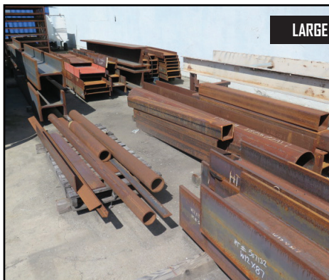
Large Quantity of Raw Materials Including I-Beam, H-Beam