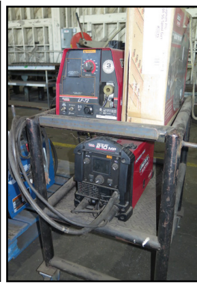
Lincoln Wire Feed Welder