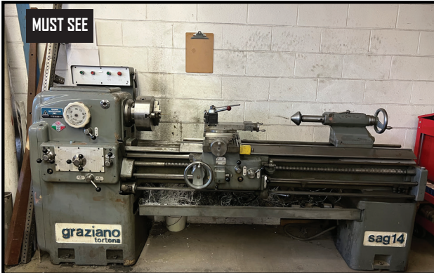
GRAZIANO SAG 14 ENGINE LATHE, 17" X 60", 3 JAW CHUCK, VARIABLE SPEED 40 - 1500 RPM.