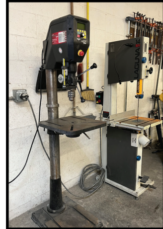
LAGUNA SUV 14 BAND SAW AND NOVA 58000 VOYAGER DVR VARIABLE SPEED DRILL PRESS.