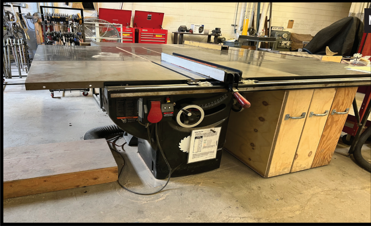
SAWSTOP TABLE SAW, PROFESSIONAL, 3.0 HP.