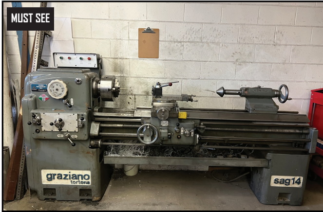
GRAZIANO SAG 14 ENGINE LATHE, 17" X 60", 3 JAW CHUCK, VARIABLE SPEED 40 – 1500 RPM.