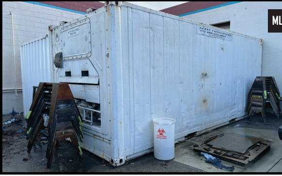
20 FT SHIPPING CONTAINERS.