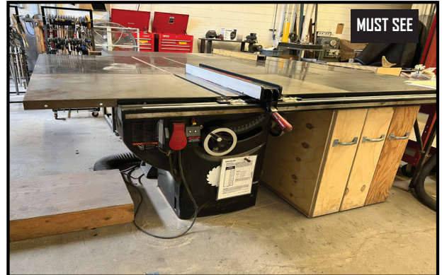
SAWSTOP TABLE SAW, PROFESSIONAL, 3.0 HP.