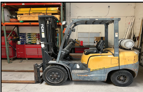
TCM 5000LB FORKLIFT LPG, 3 STAGE