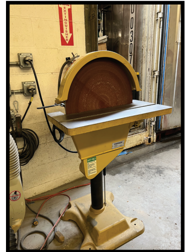
POWERMATIC DS-20-3, 20" DISC SANDER.