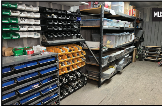
LARGE SELECTION OF HARDWARE AND RACKS.