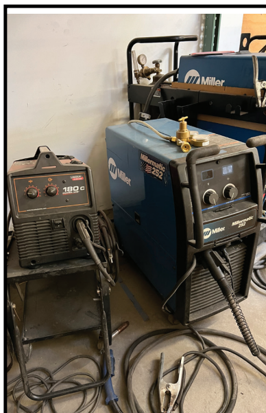
MILLER AND LINCOLN TIG AND MIG WELDERS.