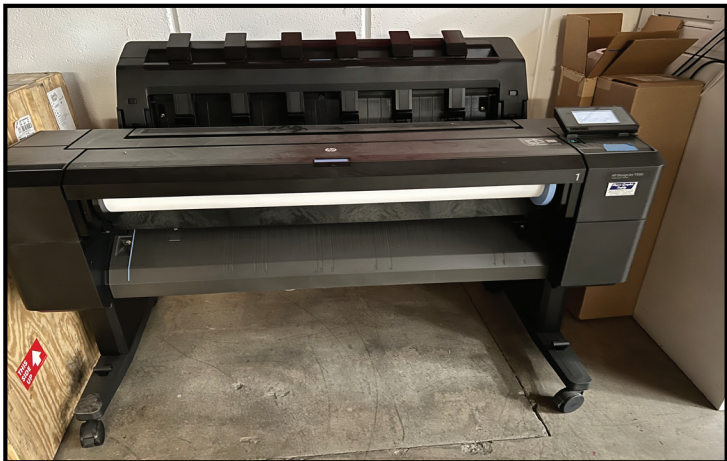
HP DESKJET T930 PLOTTER.