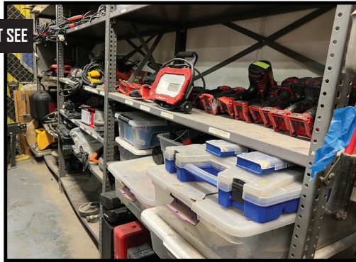
LARGE SELECTION OF MILWAUKEE POWER TOOLS, MAKITA POWER TOOLS AND MAG DRILLS.

ALL MACHINERY MOVERS MUST BE APPROVED BY THE SELLER PRIOR TO REMOVAL OF EQUIPMENT