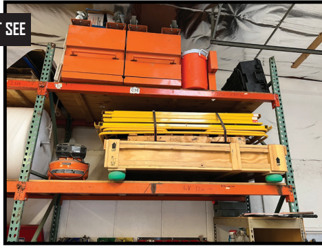
JOB BOXES AND SUPPORT.