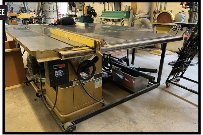
POWERMATIC III MODEL 66 TABLE SAW.