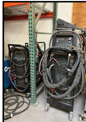
MILLER DYNASTY MODEL 700 AND 350 TIG WELDERS