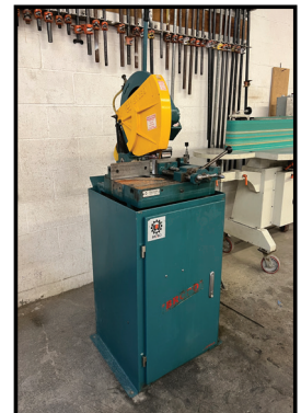
BROBO S400 B METAL CUTTING COLD SAW, S/N 31180 D.