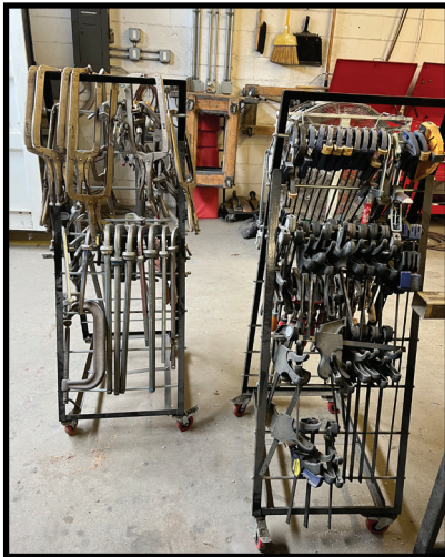
LARGE SELECTION OF CLAMPS AND C CLAMPS.