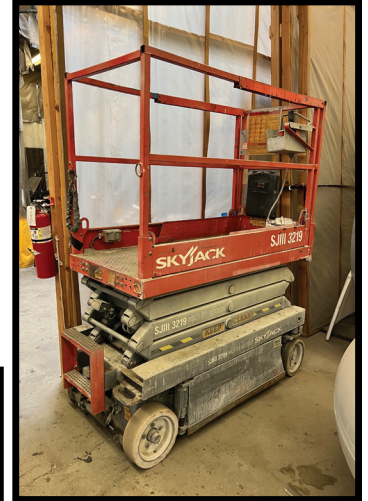
SKYJACK SJ III 3219 ELECTRIC SCISSOR LIFT.