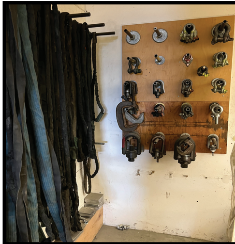
LARGE SELECTION OF SLINGS AND HOOKS.