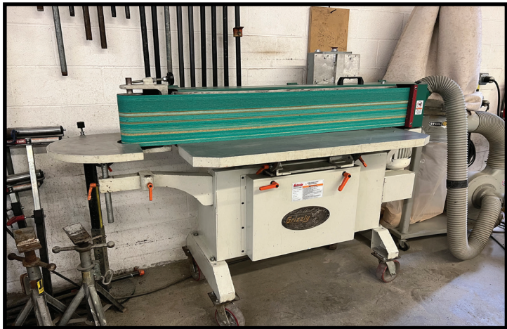
2010 GRIZZLY G9985 OSCILLATING EDGE SANDER W/ STEEL CITY DUST COLLECTOR.