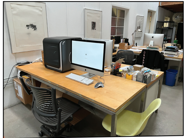
LARGE SELECTION OF APPLE COMPUTERS AND AFINIA 3D PRINTER.