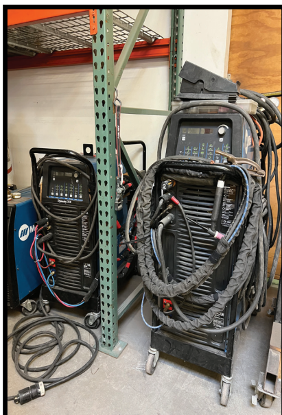
MILLER DYNASTY MODEL 700 AND 350 TIG WELDERS.