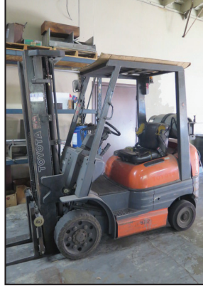
Toyota 42-6FGCU20 4400 Lb Cap LPG Forklift w/ 3-Stage Mast, 189" Lift