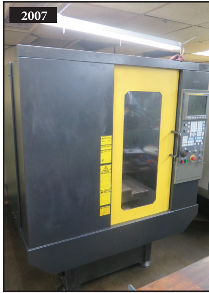
2007 Fanuc Robodrive MATE CNC Drilling Center Fanuc 0i-MC Controls, 14-Station ATC, BT-30 Spindle