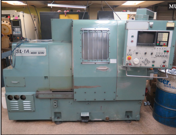
Mori Seiki SL-1A CNC Turning Center w/ Fanuc 10T Controls, 12-Station Turret, Hydraulic Tailstock, 6" 3-Jaw Power Chuck, 5C Spindle Nose