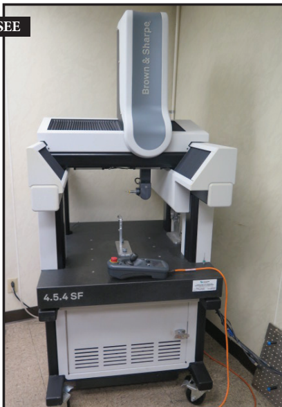
2014 Hexagon Metrology / Brown & Sharpe 4.5.4 CMM w/ Tesa Motorized Probe Head, Hand-Held Joystick Controller, PC-DMIS Software