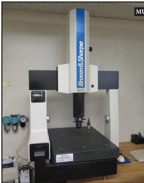
Brown & Sharpe MicroVal 363 CMM w/ Renishaw MIP Probe, 12" x 16" x 12" Work Envelope, Micro Measure 3 Software