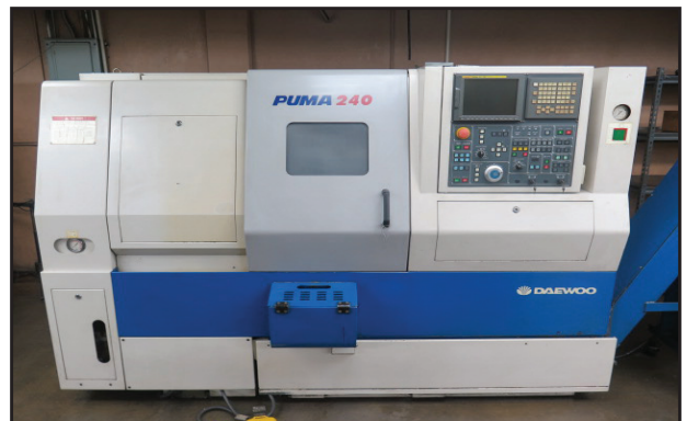
2004 Daewoo PUMA 240A CNC Turning Center w/ Fanuc 21i-TB Controls, Tool Presetter, 12-Station Turret, Hydraulic Tailstock, Parts Catcher, 6" 3-Jaw Power Chuck