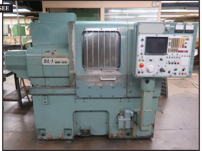
Mori Seiki SL-1H CNC Turning Center w/ Fanuc 6T Controls, 8-Station Turret, Hydraulic Tailstock, 6" 3-Jaw Power Chuck, 5C Spindle Nose