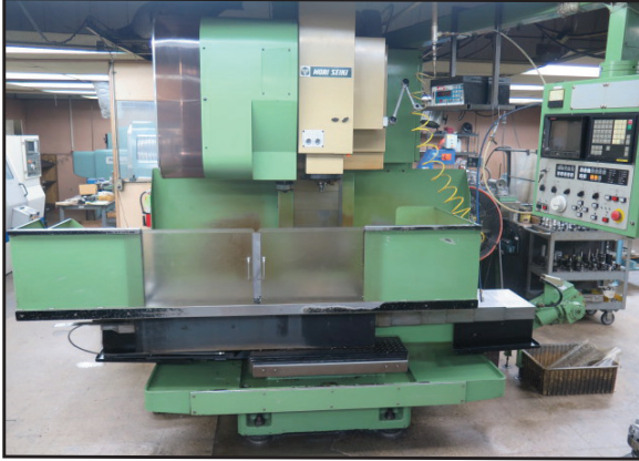
Mori Seiki MV-35/40 CNC VMC w/ Fanuc 11M Controls, 20-Station ATC, BT-40 Spindle