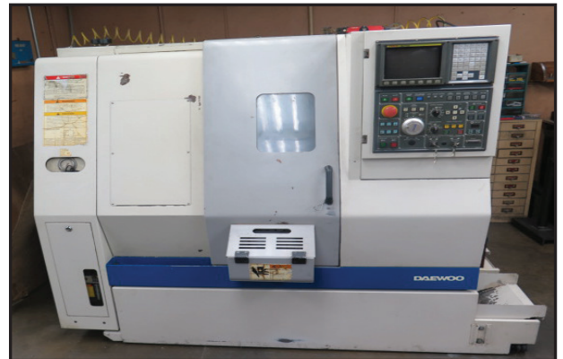
2005 Daewoo LYNX 220A CNC Turning Center w/ Fancu I Series Controls, Tool Presetter, 12-Station Turret, Parts Catcher, 6" 3-Jaw Power Chuck 8" 3-Jaw Power Chuck