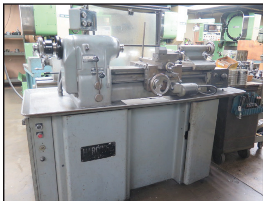
Hardinge TFB-H Wide Bed Second OP Lathe w/ 125-3000 RPM, Tailstock, Power Feeds, 5C Spindle

Mori Seiki SL-1H CNC Turning Center s/n 1168 w/ Fanuc System 6T Controls, 8-Station Turret, Hydraulic Tailstock, 6" 3-Jaw Power Chuck, 5C Spindle Nose, Coolant.