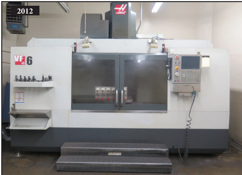
2012 Haas VF-6/40 4-Axis CNC VMC w/ Haas Controls, 40-ATC, BT-40, 8100 RPM, Rigid Tapping, Advanced Tool Management, 34-Position Coolant Spigot