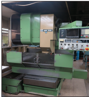
Mori Seiki MV Junior CNC VMC w/ Fanuc 10M Controls, 30-ATC, BT-40 Spindle **2-AVAILABLE**