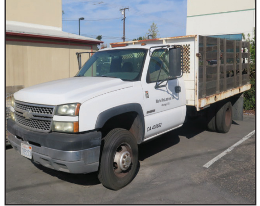
Chevrolet Silverado 3500 12' Stake-Bed Truck w/ Gas Engine, Auto Trans, Dual Gas Tanks