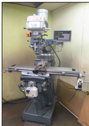
2015 Clark B3V Vertical Mill w/ Sino SDS6-2V DRO, 3Hp, 60-4200 RPM, R8, Chrome Ways, Power "X" and "Y" Feeds