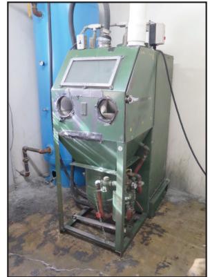
Kelco CH24C Dry Blast Cabinet w/ Dust Collector

ALL MACHINERY MOVERS MUST BE APPROVED BY THE SELLER PRIOR TO REMOVAL OF EQUIPMENT