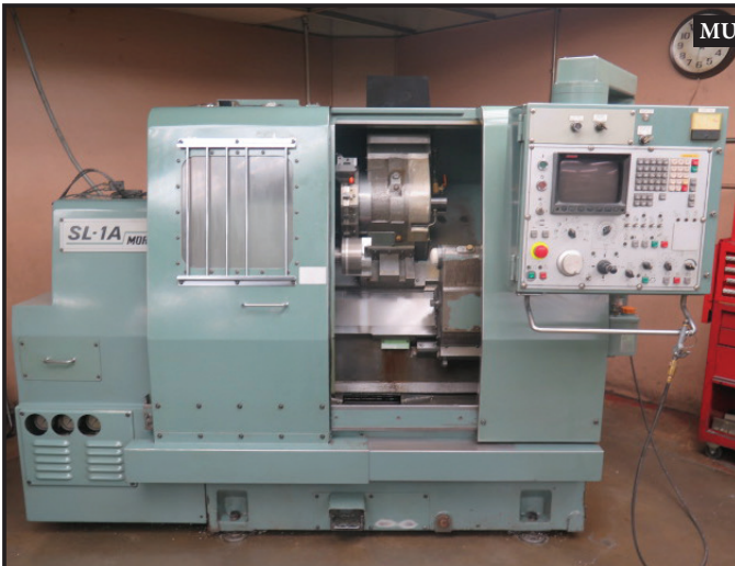
Mori Seiki SL-1A CNC Turning Center w/ Fanuc 11M Controls, 12-Station Turret, Hydraulic Tailstock, 6" 3-Jaw Power Chuck, Northfield 5" 3-Jaw Chuck