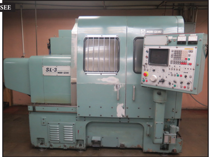
Mori Seiki SL-3A CNC Turning Center w/ Fanuc 6T Controls, 12-Station Turret, Hydraulic Tailstock,