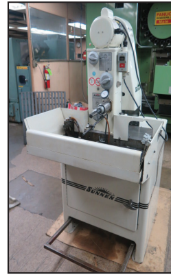
Sunnen MBB-1660-K Precision Honing Machine