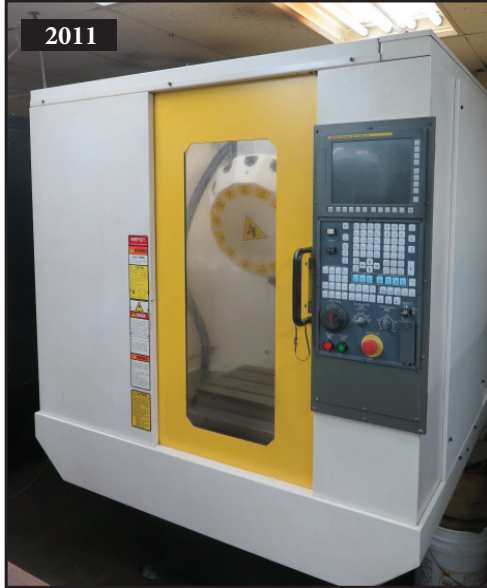
2011 Fanuc Robodrive α-14iF CNC Drilling Center w/ Fanuc 31i-MODEL A5 Controls, 14-Station ATC, T-30 Spindle, 80-8000 RPM