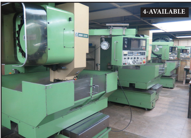
Mori Seiki MV Junior CNC VMC w/ Fanuc 10M Controls, 30-ATC and 20-ATC, BT-40 Spindle ***4-AVAILABLE***