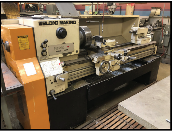
LE BLOND MAKINO 19" X 60" ENGINE LATHE, SERVO SHIFT, IN/MM THREADING.

(5) TREE 2UVR &2UVG VERTICAL MILLING MACHINES , W/ DRO.