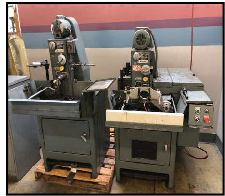
SUNNEN MODEL MBB 1660 & amp; MBB 1801 HONING MACHINES, ONE WITH STROKER.