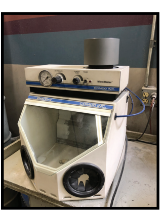
COMCO MICRO BLAST UNIT.