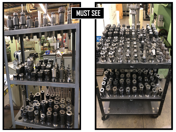
LARGE SELECTION OF VISES, COLLETS, CUTTING TOOLS, CARBIDE TOOLS, DRILL, REAMERS, AND SUPPORT TOOLS.