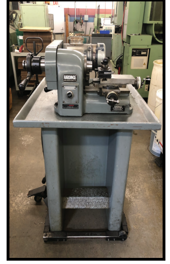
OKUMA MODEL MC-4VA VMC, 32 ATC, OSP 5000M-G CONTROL. TSUDAKOMA 5 TH AXIS ROTARY TABLE