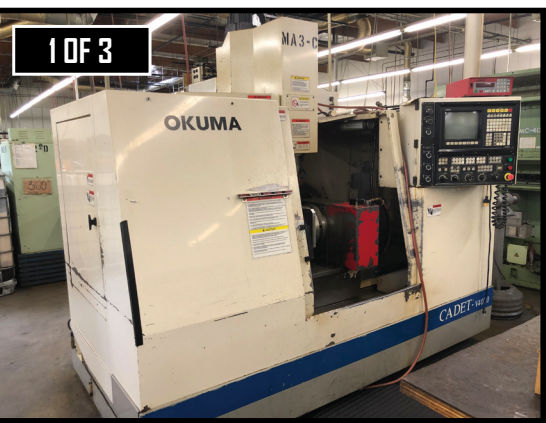
(3) OKUMA MODEL MC-40H CNC HMC'S, 3 PALLET SYSTEM, OKUMA SOP 5000M CONTROLS, 30 ATC.

OKUMA CADET CNC LATHE, 12" CHUCK, TAIL STOCK, 3.5" SPINDLE BORE, OKUMA OSP-700L CONTROL, S/N 0267.