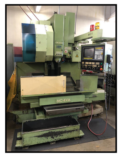
(2) OKIMA MODEL MC-4VAE VMC'S, 20 ATC, OKUMA 5020M CONTROL OKUMA MODEL MC-4VA VMC, 32 ATC, OSP 5000M-G CONTROL.