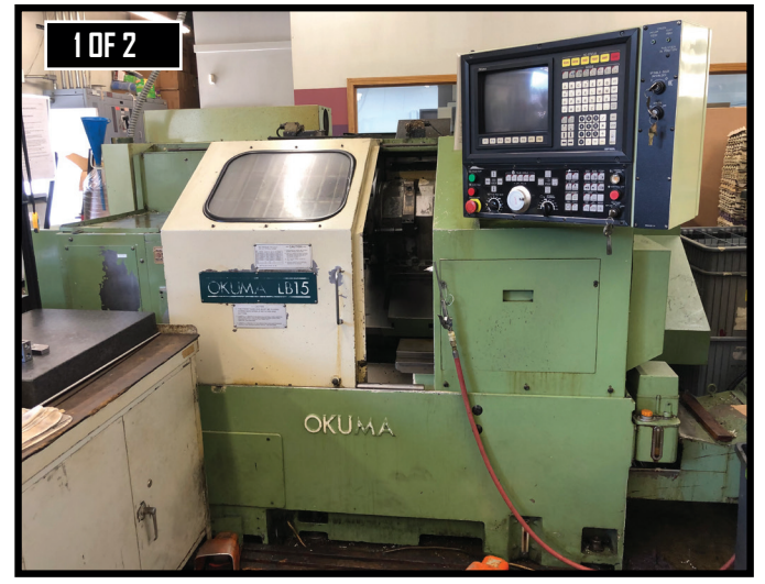
(1 OF 2) OKUMA LB15 CNC LATHES, W/ TAILSTOCK, OKKUMA OSP 5020L & 5000L CONTROLS, 10 STATION TURRET.