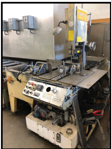
MARVEL MODEL V-10A VERTICAL IN FEED BAND SAW, PNEUMATIC CLAMPING, CONVEYOR. MARVEL MODEL V-10A VERTICAL