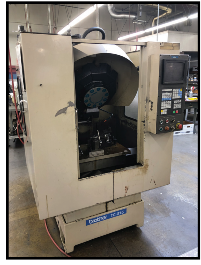
BROTHER MODEL TC-215 CNC DRILL AND TAPPING CENTER, 10 ATC. BROTHER MODEL TC-221 DRILL AND TAP CENTER, 10 ATC, BROTHER CONTROL.