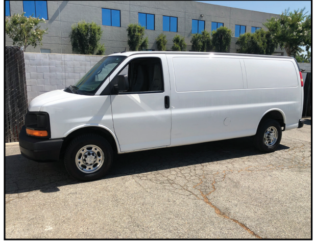
2014 CHEVY VAN, A/C 2 CAPTAIN CHAIRS, 195,300 MILES, GAS ENGINE