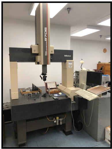
MITUTOYO MODEL B706 CMM, 36" X 50' TABLE, RENISHAW MIH PROBE.