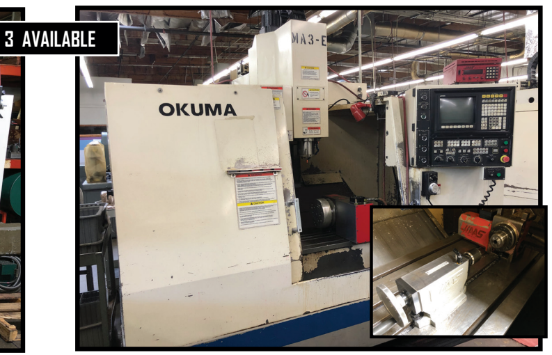
(3) OKUMA CADET-V4020 CNC VMC'S, 40" X 20" X 20" (XYZ), OKUMA 5020M CONTROL.