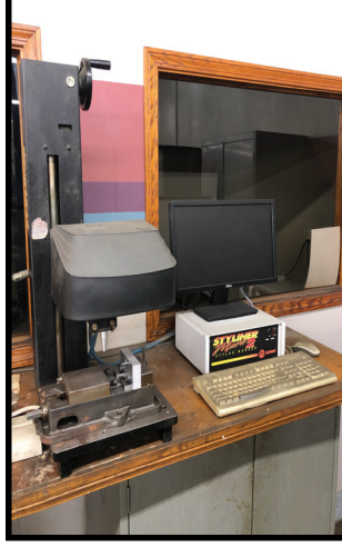
SCHMIDT STYLINER MODEL 2 STYLUS MARKER.