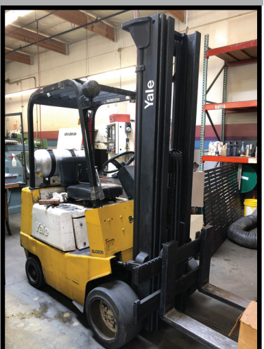
MARVEL MODEL V-10A VERTICAL IN FEED BAND SAW, PNEUMATIC CLAMPING, CONVEYOR.