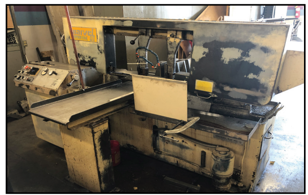
MARVEL MODEL 13-A AUTO FEED HORIZONTAL BAND SAW, MULTI CYCLE, PIECE COUNTER,1832 COMCO MICRO BLAST UNIT.