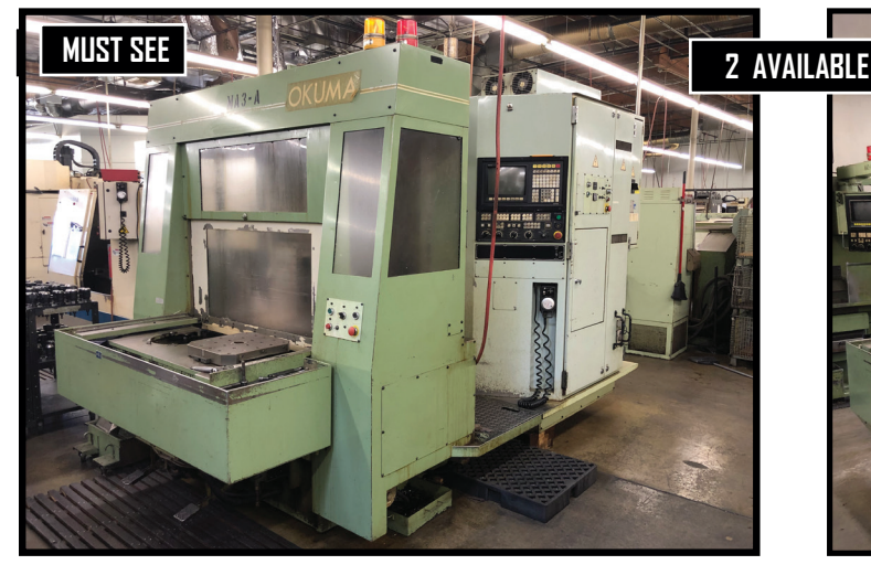
(2) OKUMA MODEL MC-40H CNC HMC'S, 3 PALLET SYSTEM, OKUMA SOP 5000M CONTROLS, 30 ATC.