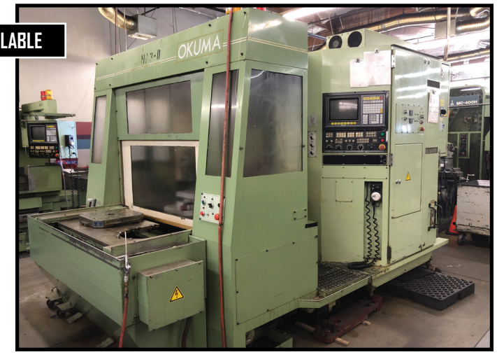
(2) OKUMA MODEL MC-40H CNC HMC'S, 3 PALLET SYSTEM, OKUMA SOP 5000M CONTROLS, 30 ATC.