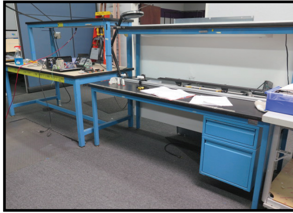
Bench-Tek and Fourth Dimension Lab Tables