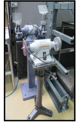
Baldor and Dayton Pedestal Grinders