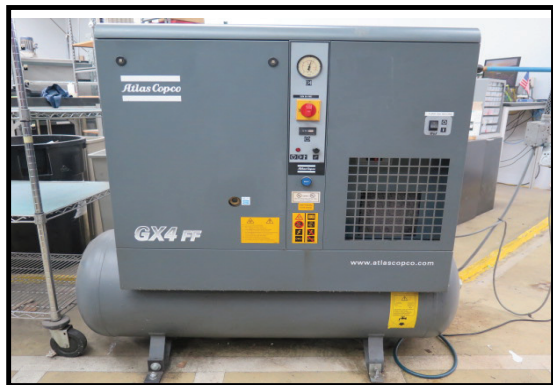
2004 Atlas Copco GX4 FF CSA/UL 5Hp Rotary Air Compressor w/ Built-In Air Dryer