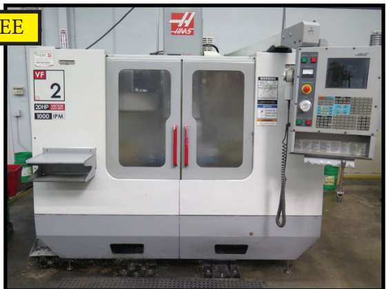
2004 Haas VF-2D CNC Vertical Machining Center w/ Haas Controls, 20-ATC, CAT-40, 7500 RPM, 20Hp, Rigid Tapping