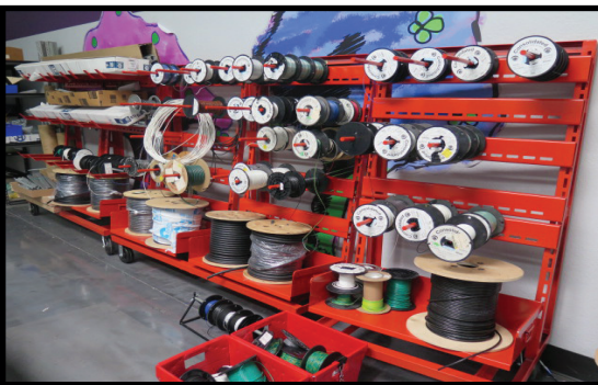
Electrical Spool Carts and Racks