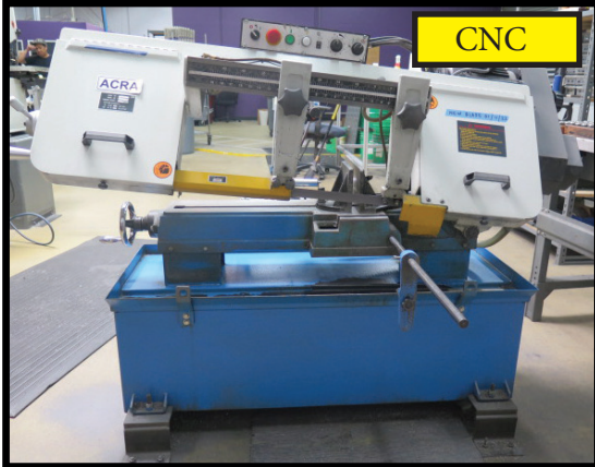
Acra RF-1018SV 10" Horizontal Miter Band Saw