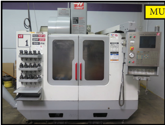
2005 Haas VF-1D CNC Vertical Machining Center w/ Haas Controls, 24-Side-Mount ATC, CAT-40, 7500 RPM, 20Hp, Haas VOP-D, Rigid Tapping