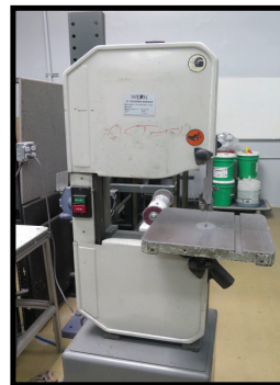
Wilton 14" "Tradesman" Vertical Band Saw