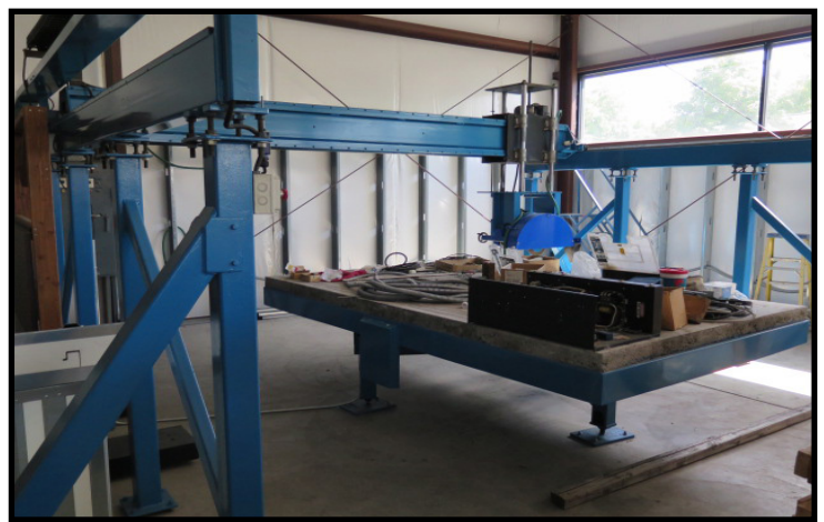
LARGE GRANITE AND MARBLE GANTRY SAW.