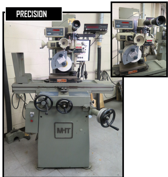
MHT MITSUI HIGH TEC SUPER PRECISION SURFACE GRINDER, MODEL MSG-200MH WITH DRESSING SYSTEM WITH OPTICAL AND DIGITAL CONTROLS.