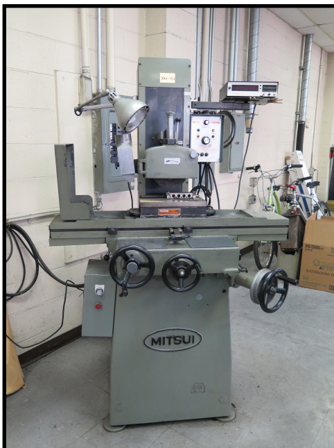
MHT MITSUI MODEL MSG-200MH, MANUAL SURFACE GRINDER W/ ELECTRO MAGNETIC CHUCK, DRO.