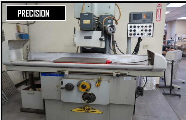
ELB SCHLIFF MODEL STAR 1426 VA AUTOMATIC SURFACE GRINDER WITH DRO.