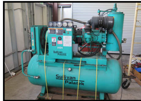
SULLIVAN ROTARY AIR COMPRESSOR.

ALL MACHINERY MOVERS MUST BE APPROVED BY THE SELLER PRIOR TO REMOVAL OF EQUIPMENT