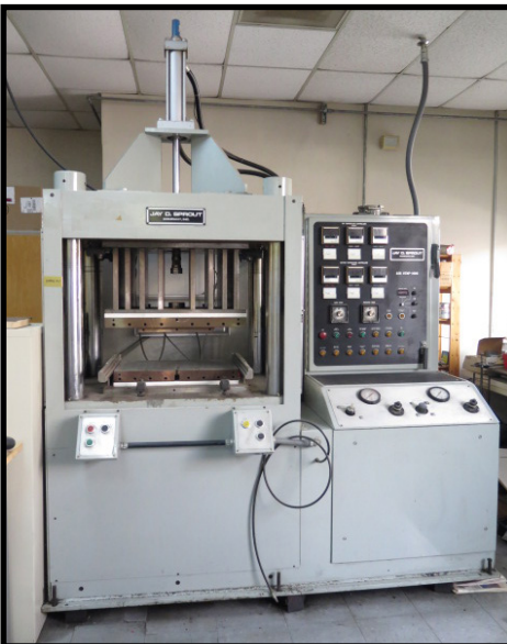
JAY D. SPROUT MODEL 225 HTMP-1000, 220 TON TRANSFER MOLD PRESS.