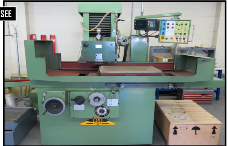
ELB MODEL SPA 2030, 20" X 30" PRECISION SURFACE GRINDER W/ DRO, HYDRAULIC.