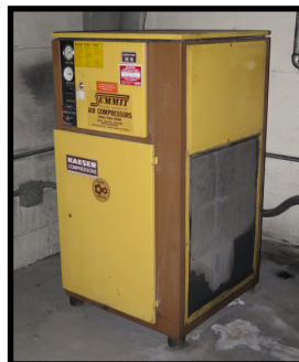
KAESER ROTARY AIR COMPRESSOR.