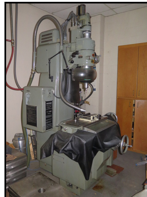
MOORE MODEL G18 JIG GRINDER.