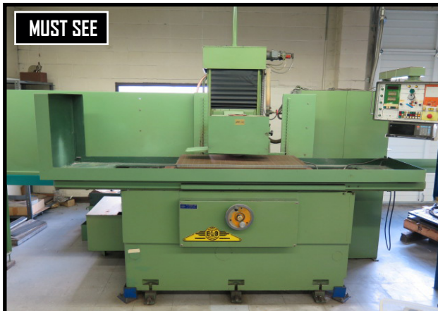
ELB SCHLIFF MODEL SPA 2040-ND HIGH PRECISION SURFACE GRINDER, 20 X 40 MAG PLATE, CONTROLS.

PRECISION SEMICONDUCTOR TOOLING & MOLD MFG FACILITY