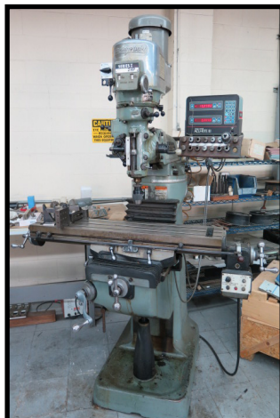
BRIDGEPORT VERTICAL MILL, 2HP, VAR SPEED, POWER FEED, DRO, 9 X 42 TABLE.