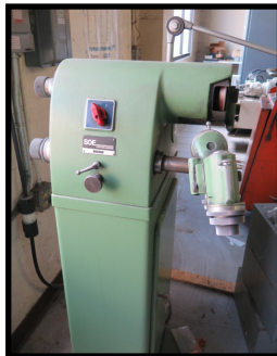
DECKEL MODEL SOE TOOL LIP GRINDER.