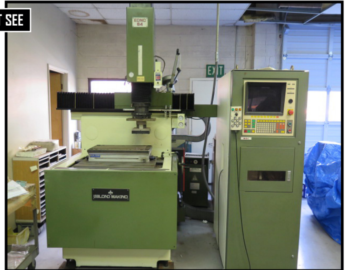
LEBLOND MAKINO EDNC64 CNC SINKER EDM, w/ MGC 3 LS42 CONTROL, LS44 TEMP SENSOR.