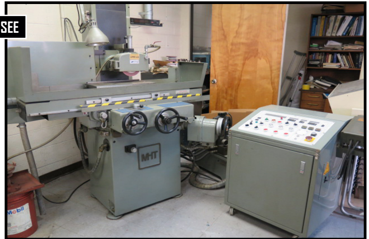
MHT MITSUI HIGH TEC MODEL MSG-250SE HYDRAULIC AUTO SURFACE GRINDER WITH MITSUI PROGRAMMABLE CONTROLS.