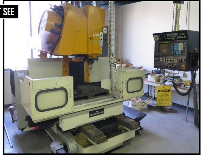
LEBLOND MAKINO FNC 74-AEO CNC VMC, W/ FANUC CONTROL, 30 ATC, 35" X 18" TABLE, 40 TAPER TOOLING.