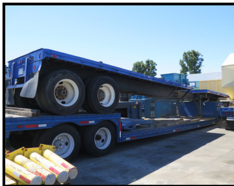
Double-Drop and Expandable Trailers