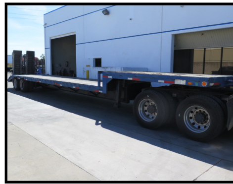
Drop-Deck Trailer w/ Hydraulic Ramps