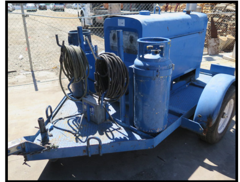
Lincoln SA-200 F-163 Towable LPG Welder