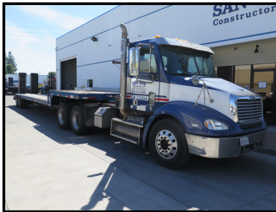
Semi Tractors and Trailers

MAJOR MACHINERY MOVING AND RIGGING FACILITY