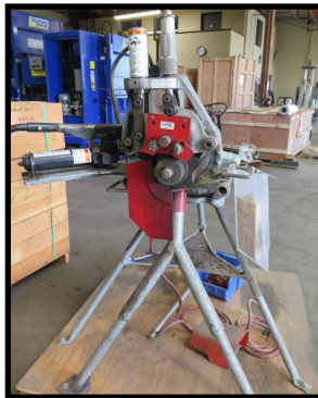
Victaulic RP-171FS Roll Grooving Machine