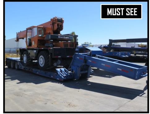
3-Axel Hydraulic Detachable Trailer w/ Front Ramps