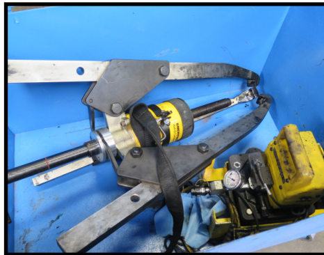
Enerpac Hydraulic Puller w/Holl-O-Cylinder Ram

Machine Shop : Wysong 1010-RD 10' x 10GA Power Shear. Pandova JS-200 Lathe w/ Tailstock, KDK Tool Post, 10" 3-Jaw Chuck. Induma Vertical Mill w/ 1Hp Motor, 80-2713 RPM, 8-Speeds, 6" Angle-Lock Vise. Covel 10" x 15" Automatic Surface Grinder w/ Electromagnetic Chuck, Coolant. Victaulic RP-171FS Power Roll Grooving Machine w/ Stand. Enerpac Hydraulic Puller w/Holl-O-Cylinder Ram, Electric Hydraulic Power Unit. Heavy Capacity Hydraulic Rams w/ Hydraulic Power Units. 20" Vertical Band Saw. Kysor Johnson mdl. J Horizontal Band Saw.