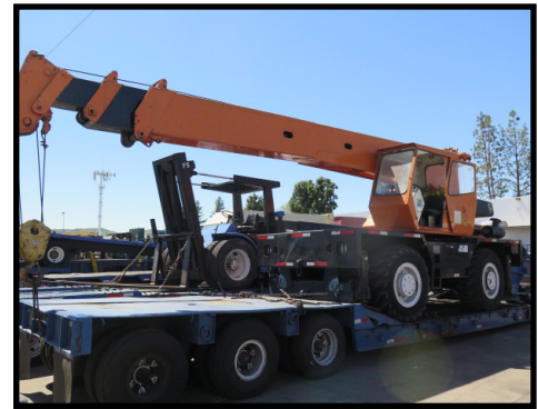
3-Axel Hydraulic Detachable Trailer w/ Front Ramps