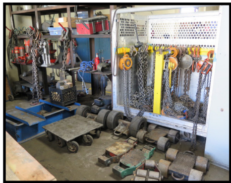
Rigging Skates, Jacks, Hoists and Support