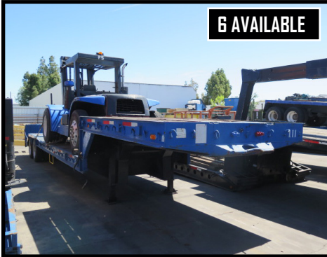
Drop-Deck Trailer ***6-AVAILABLE***