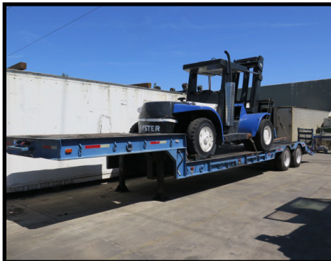
Drop-Deck Trailer w/ Spring-Assist Ramps