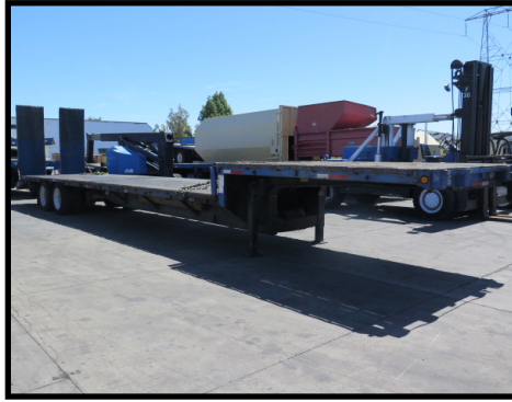
Drop-Deck Trailer w/ Hydraulic Ramps