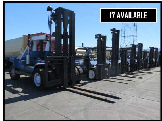
Hyster Forklifts ***17-AVAILABLE***