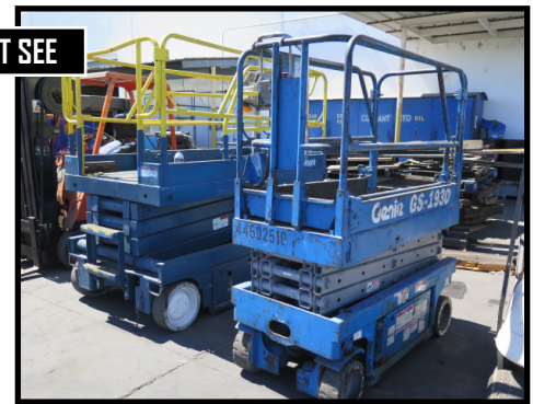
Genie and Upright Scissor Platform Lifts