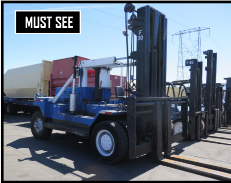
Hyster H200E 26,800 Lb Cap Diesel Forklift