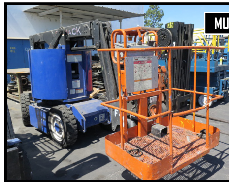
Skyjack SJKB33N 33' Platform Boom Lift