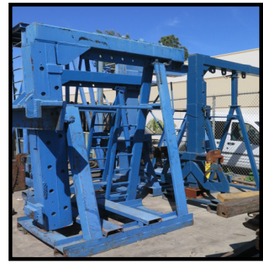
Forklift Boom Attachments