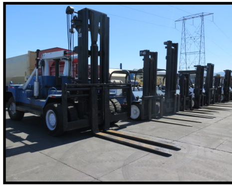
Partial View of Available Forklifts