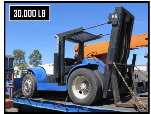
Hyster H300A 30,000 Lb Cap Diesel Forklift