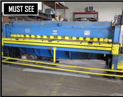
Wysong 1010-RD 10' x 10GA Power Shear