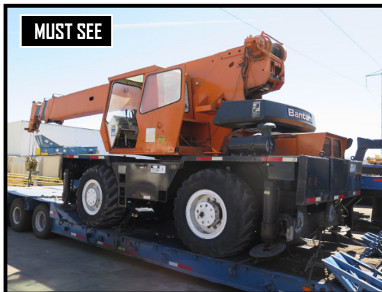
Bantam S-628 18 Ton Rough Terrain Boom Truck