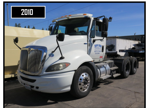
2010 International Semi Truck w/ MaxxForce Diesel Engine