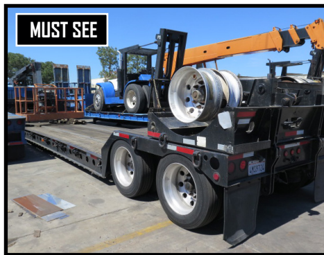
Double-Drop Front Detatch Trailer w/ Flip Rear Axel