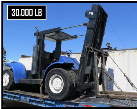
Taylor Y-30-WO 30,000 Lb Cap Diesel Forklift