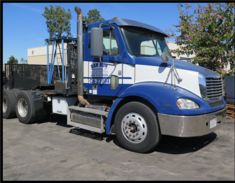
2008 Freightliner Semi Truck w/ Mercedes Diesel Engine

PRESORTED First-Class Mail U.S. Postage PAID STA CLARITA, CA Permit No. 298