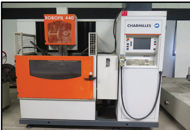
2002 Charmilles Robofil 440 CNC Wire EDM Machine w/ Charmilles Controls

Hardinge Cobra 42 CNC Turning Center s/n C-314 w/ Fanuc Series 21-T Controls, 12-Station Turret, Kennametal KM32 Loc-Block Turret Tooling, 16C Collet Nose, Coolant.