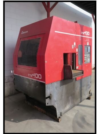
1997 Amada CTB-400 CNC Vertical Band Saw w/ Amada CNC Controls, Hydraulic Clamping and Feeds