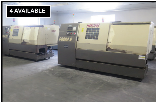
Hardinge Cobra 65 Turning Center s w/ Fanuc 21-T Controls, Cool-Jet 70-30 Coolant System ***4- AVAILABLE***