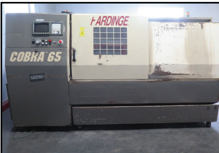
Hardinge Cobra 65 CNC Turning Center w/ Fanuc 21-T Controls, 12-Turret, CoolJet 70-30 Coolant System