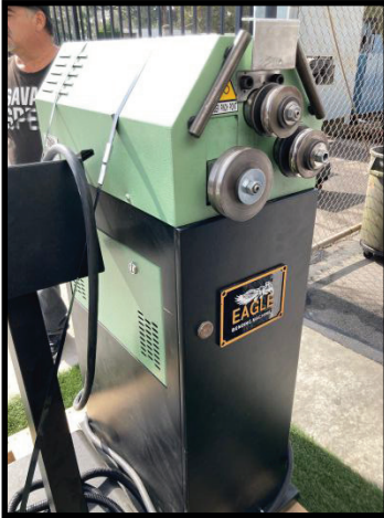
2012 Eagle CPS20 Power Angle Roll w/ Pendant Controls