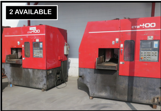
1997 Amada CTB-400 CNC Vertical Band Saws w/ Amada CNC Controls ***2-AVAILABLE***

PRESORTED First-Class Mail U.S. Postage PAID STA CLARITA, CA Permit No. 298