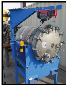
Sterilization System w/ Binks mdl. 83-5785 Tank, Electric Hoist