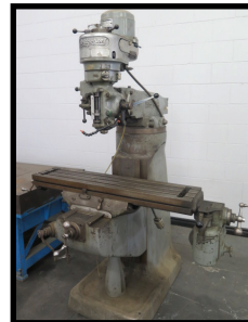
Bridgeport Vertical Mill