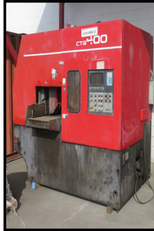
1997 Amada CTB-400 CNC Vertical Band Saw w/ Amada CNC Controls, Hydraulic Clamping