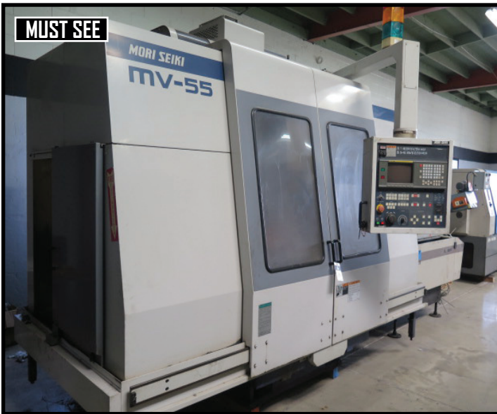
MUST SEE Mori Seiki MV-55/50 2-Shuttle Pallet CNC VMC w/ Fanuc MF-M6 Controls, 30-Station ATC, 50-Taper Spindle