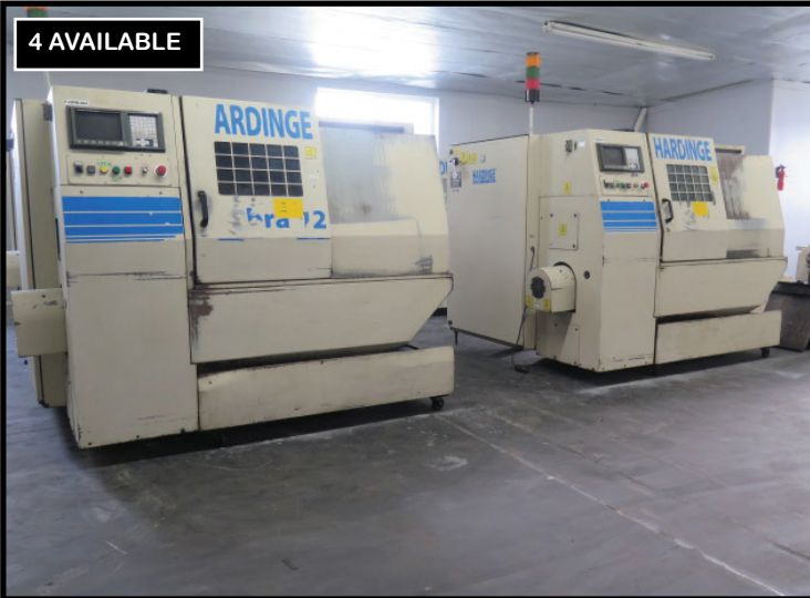
Hardinge Cobra 42 CNC Turning Center w/ Fanuc 21-T Controls, 12-Turret, Kennametal KM32 Loc-Block Turret Tooling ***4-AVAILABLE***