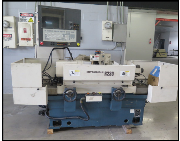
2001 Mitsubishi R230-35A CNC Cylindrical Grinder w/ Mitsubishi Controls