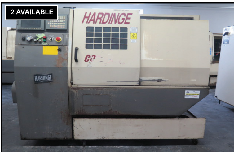
2 AVAILABLE Hardinge Cobra 42 CNC Turning Center w/ Fanuc 21i-T Controls, 12-Turret, Kennametal KM32 Loc-Block Turret Tooling ***2-AVAILABLE***

Rutland mdl. DS-20 20" Pedestal Disc Sander s/n 3090006.