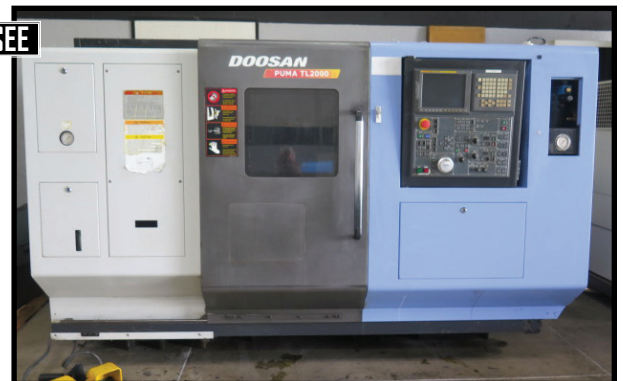
2007 Daewoo PUMA TL2000 Twin Turret CNC Turning Center w/ Fanuc 18i-TB Controls, Tool Presetter, 12-Station Upper Turret, 8-Station Lower Turret, 5000 RPM, 3" Thru Spindle Bore, Kennametal KM-LOC II Turret Tooling