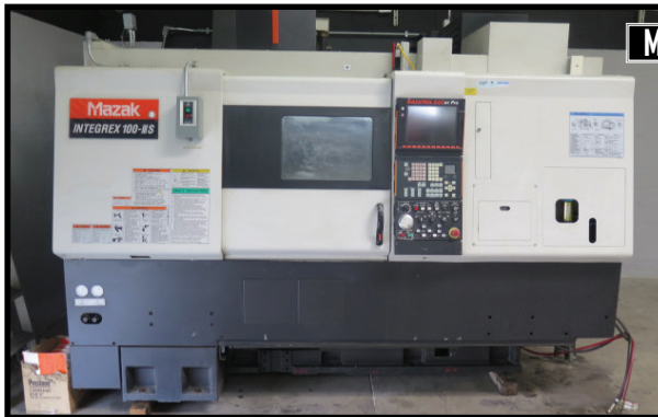
2009 Mazak INTEGREX 100-III S 6-Axis Twin Spindle Machining Center w/ Mazatrol 640 MT ProControls, Tool Presetter, 40-Station Tool Changer, KM63 Taper Milling Spindle, 6000 RPM on Main and ub Spindles, 12,000 RPM on Milling Spindle