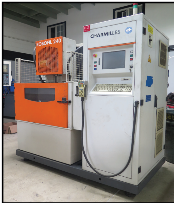
2001 Charmilles Robofil 240 CNC Wire EDM Machine s/n 920369 w/ Charmilles Controls, Hand-Held Controller, Coolant Filtration System.