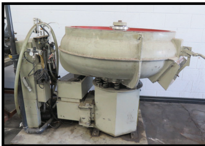
Almco OR-10V 48" Media Tumbler