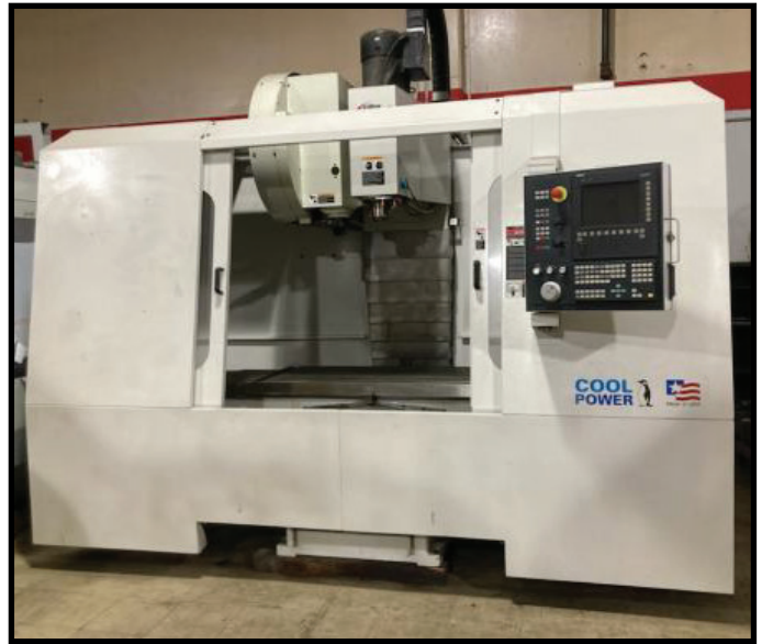
2003 Fadal VMC4525HT CNC VMC w/ Siemens Sinumerik 840 Controls, 24-Station Side Mounted ATC, 40-Taper Spindle