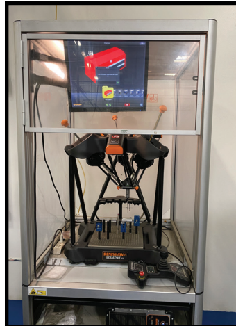
Renishaw EQUATOR 300 CMM Machine