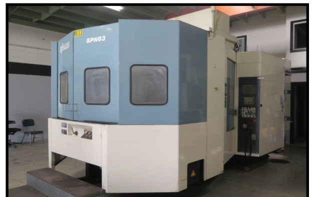
Nigata SPN66 2-Pallet 4-Axis CNC HMC w/ Fanuc 16i-M Controls, 60-ATC, 50-Taper, Renishaw Touchless Prob System (NO PROBE), 4th Axis Thru Pallets