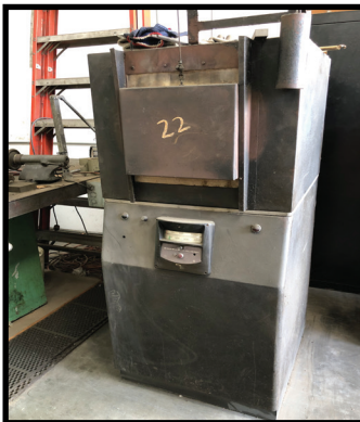
K.H. HUPPERT TYPE ST, HEAT TREAT OVEN, S/N 1348.