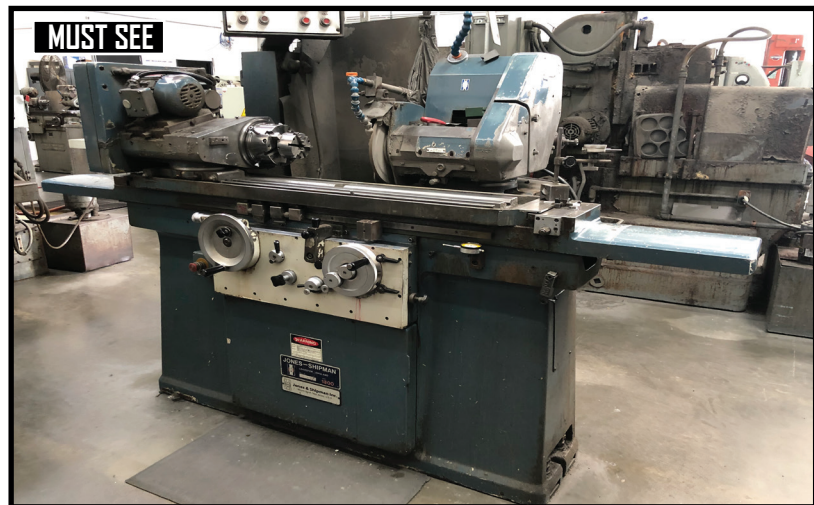
JONES & SHIPMAN MODEL 1300 O.D. GRINDER, S/N BO 14145.