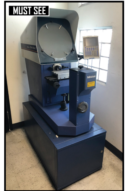
MITUTOYO MODEL PH-A14, 14" OPTICAL COMPARATOR W/ QM DATA 200 CONTROLLER.

ALL MACHINERY MOVERS MUST BE APPROVED BY THE SELLER PRIOR TO REMOVAL OF EQUIPMENT