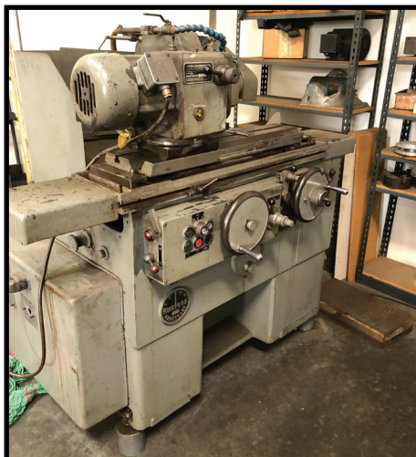
KARSTENS STUTTGARD PRECISION O.D. GRINDER, S/N 2205