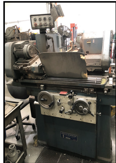
JONES & SHIPMAN MODEL 1311 PRECISION O.D. GRINDER.

LAPMASTER 48, 48" SINGLE SIDED LAPPING AND POLISHING MACHINE. LAPMASTER 36, 36" SINGLE SIDED LAPPING AND POLISHING MACHINE. LAPMASTER 36, 36" SINGLE SIDED LAPPING AND POLISHING MACHINE. LAPMASTER 36" AND 48" LAPPING MACHINES. MYFORD PRECISION O.D. GRINDER, S/N SM 143370. MITUTOYO MODEL PH-A14, 14" OPTICAL COMPARATOR W/ QM DATA 200 CONTROLLER. RONG KUANG MODEL 120 CENTERLESS GRINDING MACHINE. KARRSTENS STUTTGARD PRECISION O.D. GRINDER. JONES & SHIPMAN MODEL 1311 PRECISION O.D. GRINDER. BLANCHARD MODEL 11D20 20" ROTARY SURFACE GRINDER, S/N B23-5-277. BLANCHARD NO. 11 ROTARY SURFACE GRINDER, S/N 9700. 2001 SUPERTEC G36P-100C 14" X 40" UNIVERSAL O.D./I.D. GRINDER W/ SONY DRO, S/N G40005. 1 OF 3) HEALD MODEL 273A UNIVERSAL I.D. GRINDER, S/N 43605. HEALD MODEL 273A UNIVERSAL I.D. GRINDER. PARTIAL VIEW OF RED HEAD GRINDING ATTACHMENTS.