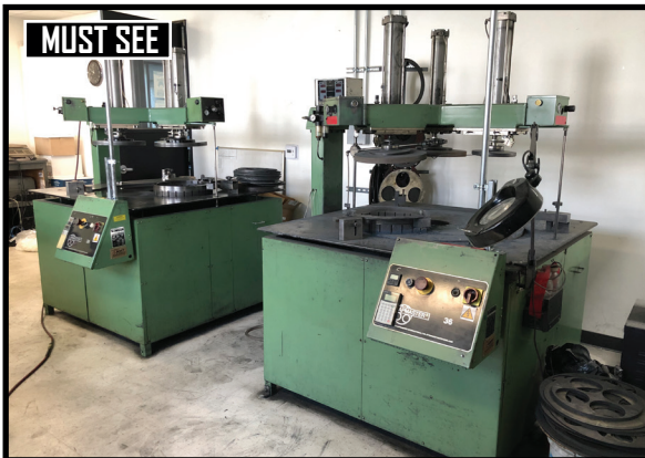
LAPMASTER 36" AND 48" LAPPING MACHINES.