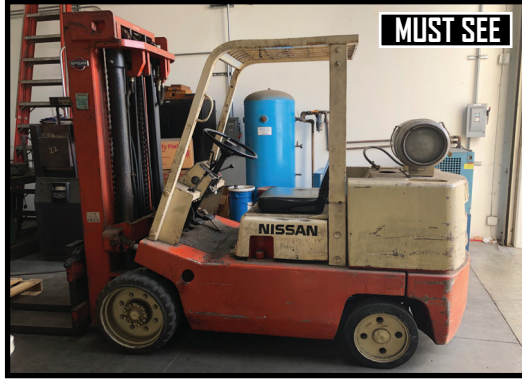
NISSAN CHF03A35V, 3000 LB LPG FORKLIFT.