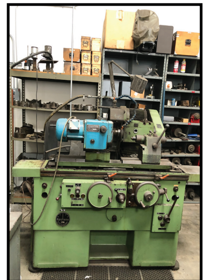
KARRSTENS STUTTGARD PRECISION O.D. GRINDER.