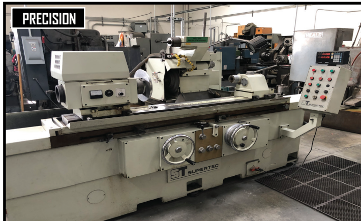
2001 SUPERTEC G36P-100C 14" X 40" UNIVERSAL O.D./I.D. GRINDER W/ SONY DRO, S/N G40005.