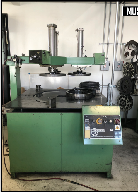
LAPMASTER 36, 36" SINGLE SIDED LAPPING AND POLISHING MACHINE.