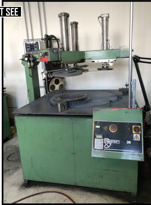
LAPMASTER 36, 36" SINGLE SIDED LAPPING AND POLISHING MACHINE.