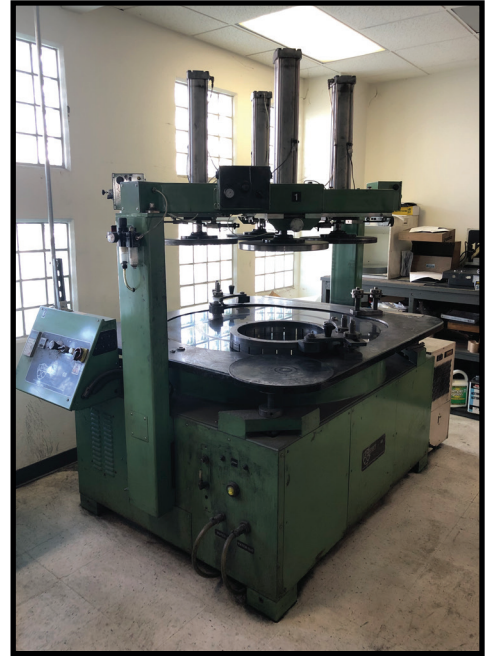
LAPMASTER 48, 48" SINGLE SIDED LAPPING AND POLISHING MACHINE.