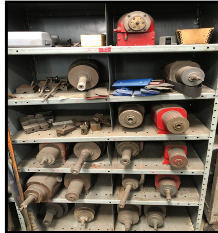
PARTIAL VIEW OF RED HEAD GRINDING ATTACHMENTS.