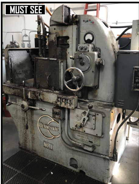
BLANCHARD NO. 11 ROTARY SURFACE GRINDER, S/N 9700.