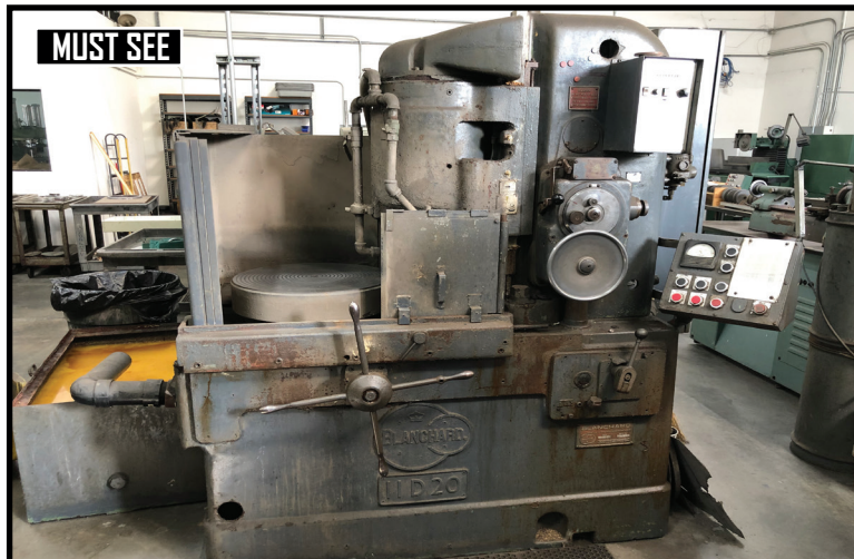
BLANCHARD MODEL 11D20 20" ROTARY SURFACE GRINDER, S/N B23-5-277.