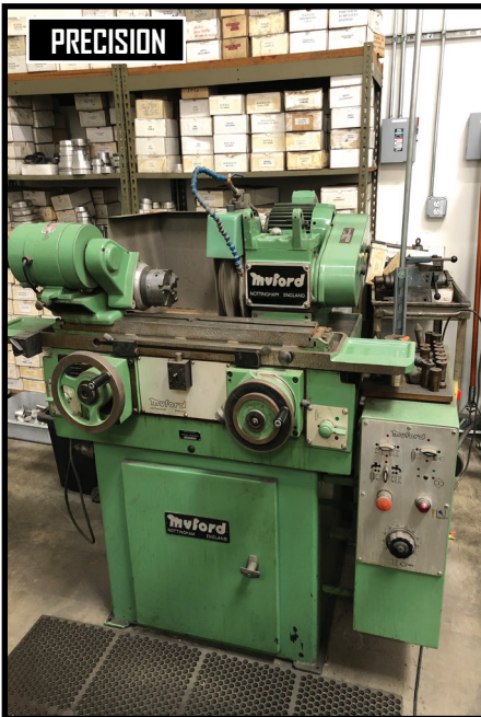
MYFORD PRECISION O.D. GRINDER, S/N SM 143370.