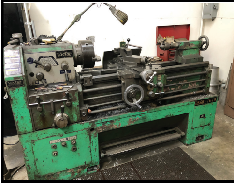
VICTOR 1640, 16" X 40" ENGINE LATHE, W/ 3 JAW CHUCK.