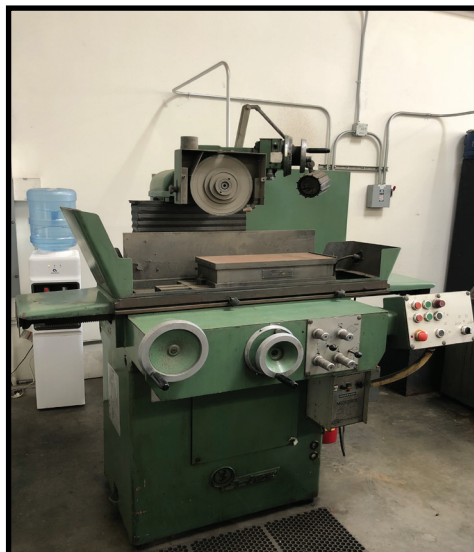
JOTES SPC-20D 6 X 18 SURFACE GRINDER W/ ELECTROMAGNETIC CHUCK, S/N 9200.