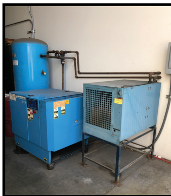
BOGE S15, 15 HP ROTARY AIR COMPRESSOR WITH DRYER AND TANK.