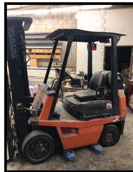
TOYOTA MODEL 42-FGC20, 4000 LB LPG FORKLIFT.