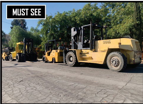
LARGE SELECTION OF RIGGING EQUIPMENT, MACHINERY MOVING SKATES