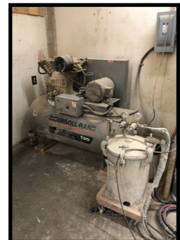
IR MODEL T30 10 HP AIR COMPRESSOR.

ALL MACHINERY MOVERS MUST BE APPROVED BY THE SELLER PRIOR TO REMOVAL OF EQUIPMENT