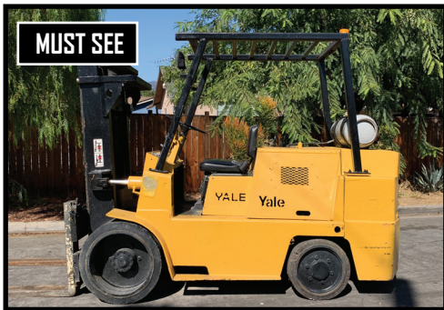
YALE 15,000 LB LPG FORKLIFT, 2 STAGE.