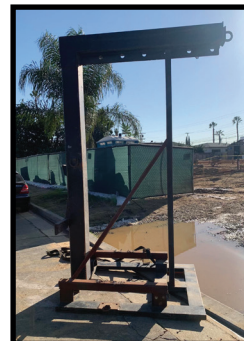
LARGE SELECTION OF BOOMS FOR MACHINERY MOVING.