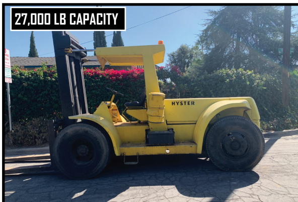
HYSTER 27,000 DIESEL POWERED FORKLIFT, 2 STAGE.