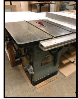
DELTA UNISAW 10" TILTING ARBOR TABLE SAW.