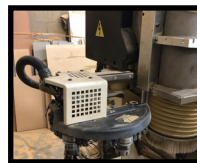
SCMI ROUTECH RECORD 130 CNC FLAT BED ROUTER W/ 12 ATC, 2 VACUUM PUMPS, , 4FT X 10FT TABLE, PC FRONT END WITH XILOG PLUS WINDOWS CONTROL.