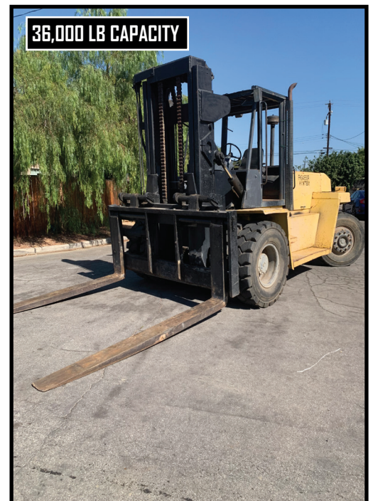
HYSTER MODEL 360XL 36,000 LB CAPACITY DIESEL FORKLIFT, 2 STAGE.