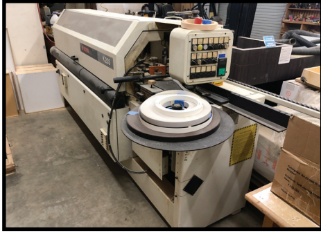
2000 SCMI MODEL K203 EX EDGEBANDER.