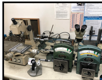
LARGE SELECTION OF SUNNEN HOLE GAGES AND INSPECTION TOOLS.