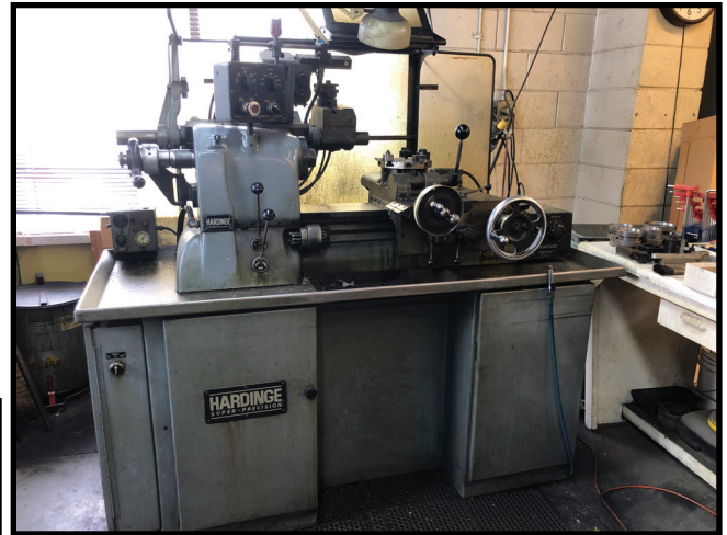
HARDINGE HC CHUCKER, WITH THREADING ATTACHMENT.