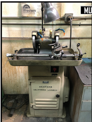
AGATHON MODEL 175-A DIAMOND TOOL GRINDER.