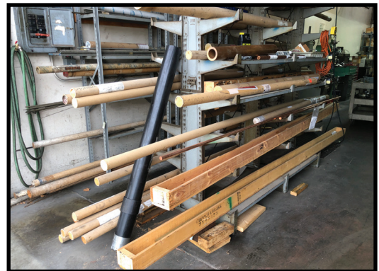
MATERIAL AND RACK.