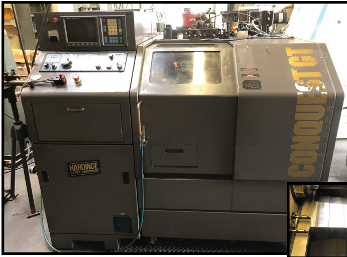
HARDINGE MODEL CS-GT GT GANG TOOL CNC LATHE, W/ FANUC OT CONTROL, 6" CHUCK, 1.06" BAR CAPACITY, 2 AXIS, S/N GT-394.