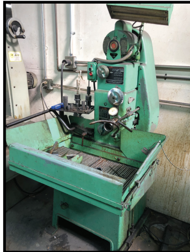
SUNNEN MBB-1600 HONING MACHINE.