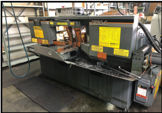
HEM MODEL H90A-1, AUTO HORIZONTAL BAND SAW, 12.75" CUTTING CAPACITY, VARIABLE SPEED

Preview : Morning of sale from 8:00am to 11:00 a.m. "On-line bidding thru bidspotter.com".