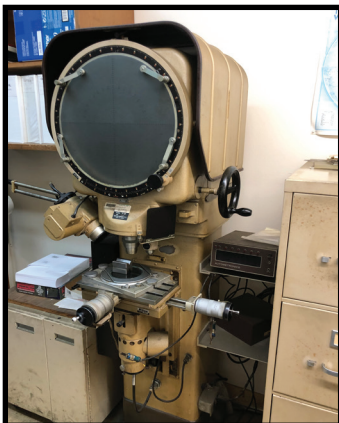
NIKON V-14, 14" OPTICAL COMPARATOR.

HARDINGE MODEL CS-GT GANG TOOL CNC LATHE, W/ FANUC OT CONTROL, 6" CHUCK, 1.06" BAR CAPACITY, 2 AXIS, W/ HARDINGE HAR MATIC BAR FEEDER, S/ GT-245. HARDINGE HC CHUCKER, WITH THREADING ATTACHMENT. BRIDGEPORT VERTICAL MILL WITH 2HP, VAR SPEED, ACURITE DRO. HARDINGE MODEL CONQUEST T42 CNC LATHE, WITH LIVE TOOLING, FANUC 18 T CONTROL, 6" CHUCK, 3 AXIS, S/N SG-944-B. ) HARDINGE ELITE II-6/42 CNC LATHE, W/ FANUC 21i-TB CONTROL, 6" CHUCK, TAIL STOCK, 1.65" BAR CAPACITY, 12 STATION TURRET, S/N ML-431. HARDINGE MODEL CS-GT GT GANG TOOL CNC LATHE, W/ FANUC OT CONTROL, 6" CHUCK, 1.06" BAR CAPACITY, 2 AXIS, S/N GT-394. IR SSR-EP10, 10 HP ROTARY AIR COMPRESSOR. HARDINGE 2 ND OPERATIONAL LATHE WITH TURRET AND CROSS SLIDE. NIKON V-14, 14" OPTICAL COMPARATOR. AGATHON 175-A DIAMOND TOOL SHARPENER. LARGE SELECTION OF SUNNEN HOLE GAGES AND INSPECTION TOOLS. YUASA 4 TH AXIS INDEXER WITH CONTROL BOX. OVER 500 5C COLLETS. YALE ELECTRIC MR O30L 3000 LB FORKLIFT. MATERIAL AND RACK. SELECT 612-SG, 6 X 12 SURFACE GRINDER. AGATHON MODEL 175-A DIAMOND TOOL GRINDER. SUNNEN MBB-1600 HONING MACHINE. HARDINGE COBRA-42 CNC TURNING CENTER, W/ FANUC 21-T CONTROL, 12 STATION TURRET, 1.625" BAR CAPACITY, NO TAIL STOCK, 2 AXIS, S/N C-754.. ALEXANDER 2CGC TOOL LIP GRINDER. HEM MODEL H90A-1, AUTO HORIZONTAL BAND SAW, 12.75" CUTTING CAPACITY, VARIABLE SPEED CUTTING, AND CONTROLS, S/N 878804. LARGE SELECTION OF GRINDERS, DRILL PRESSES AND SUPPORT. INSPECTION TOOLS, GAGES, PIN GAGES AND MICROMETERS.