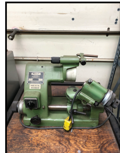
ALEXANDER 2CGC TOOL LIP GRINDER.