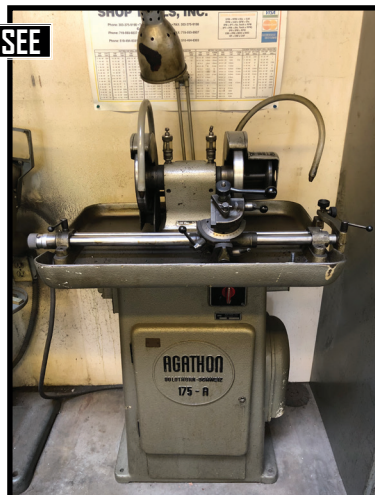
AGATHON 175-A DIAMOND TOOL SHARPENER.