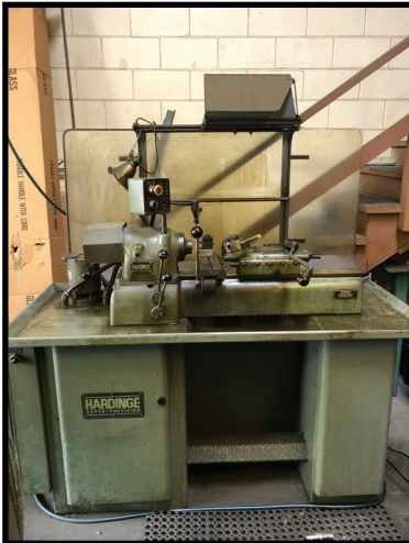
HARDINGE 2 ND OPERATIONAL LATHE WITH TURRET AND CROSS SLIDE.