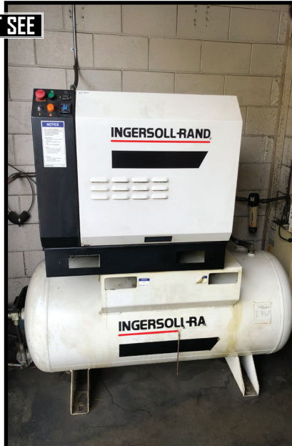
IR SSR-EP10, 10 HP ROTARY AIR COMPRESSOR.