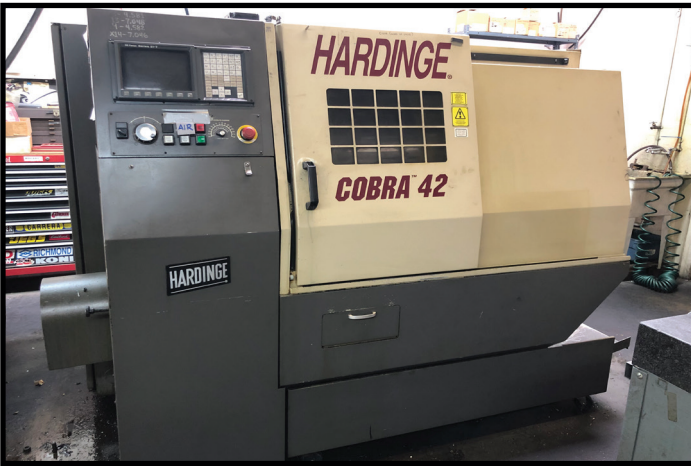
HARDINGE COBRA-42 CNC TURNING CENTER, W/ FANUC 21-T CONTROL, 12 STATION TURRET, 1.625" BAR CAPACITY, NO TAIL STOCK, 2 AXIS, S/N C-754