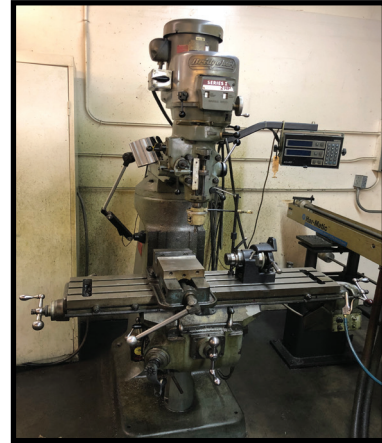
BRIDGEPORT VERTICAL MILL WITH 2HP, VAR SPEED, ACURITE DRO.