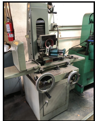
SELECT 612-SG, 6 X 12 SURFACE GRINDER.