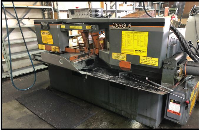
HEM MODEL H90A-1, AUTO HORIZONTAL BAND SAW, 12.75" CUTTING CAPACITY, VARIABLE SPEED