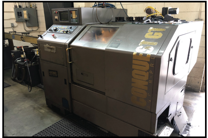
HARDINGE MODEL CS-GT GANG TOOL CNC LATHE, W/ FANUC OT CONTROL, 6" CHUCK, 1.06" BAR CAPACITY, 2 AXIS, W/ HARDINGE HAR MATIC BAR FEEDER, S/ GT-245.