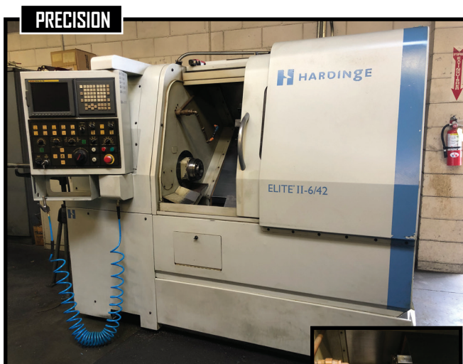
HARDINGE ELITE II-6/42 CNC LATHE, W/ FANUC 21i-TB CONTROL, 6" CHUCK, TAIL STOCK, 1.65" BAR CAPACITY, 12 STATION TURRET, S/N ML-431.

HARDINGE MICRO PRECISION CNC MACHINING FACILITY