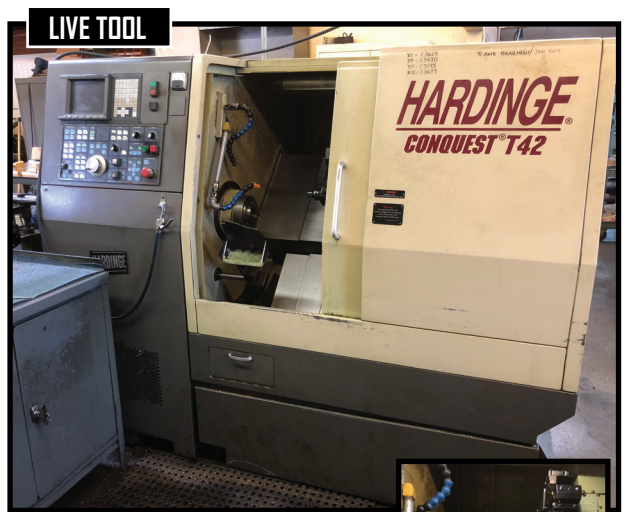
HARDINGE MODEL CONQUEST T42 CNC LATHE, WITH LIVE TOOLING, FANUC 18 T CONTROL, 6" CHUCK, 3 AXIS, S/N SG-944-B.