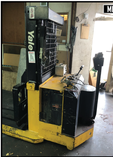
YALE ELECTRIC MR O30L 3000 LB FORKLIFT