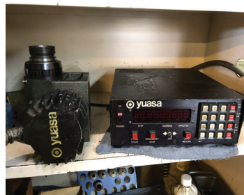
YUASA 4 TH AXIS INDEXER WITH CONTROL BOX.