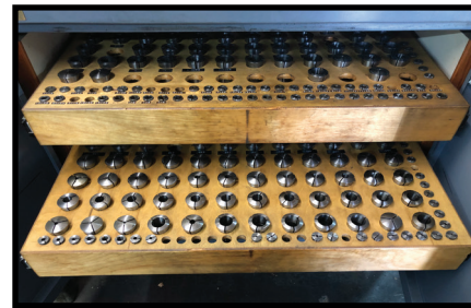
OVER 500 5C COLLETS.