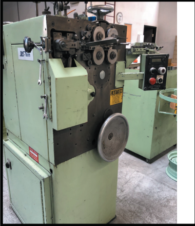
BHS-TORIN PRECISION SPRING COILER.

PRESORTED First-Class Mail U.S. Postage PAID STA CLARITA, CA Permit No. 298