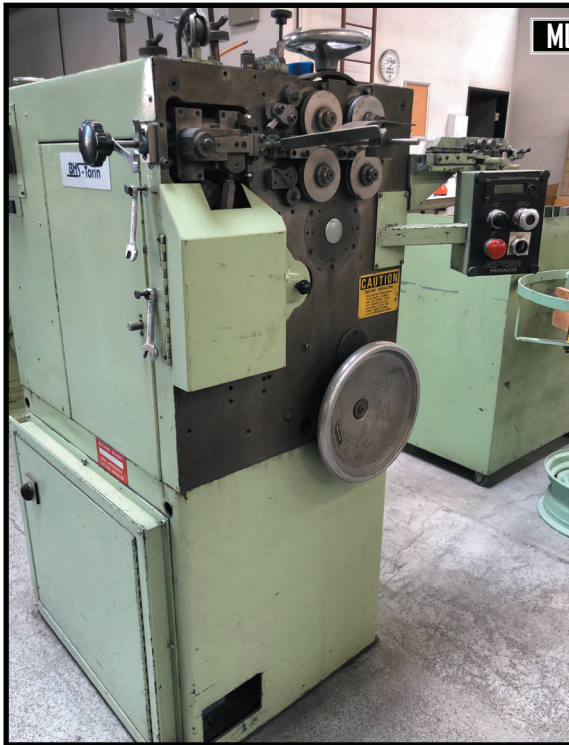
BHS-TORIN PRECISION SPRING COILER.