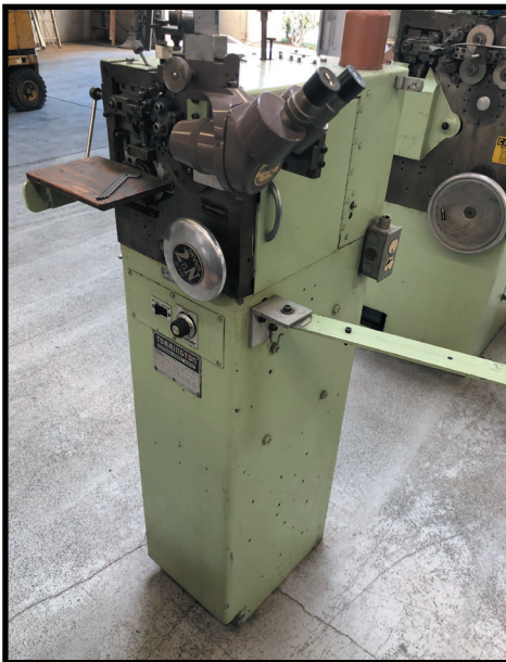
TORRINGTON W-100-1 SPRING COILER WITH SCOPE.