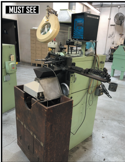
TORRINGTON PRECISION SPRING COILER WITH LARSON TIGER GAGE.