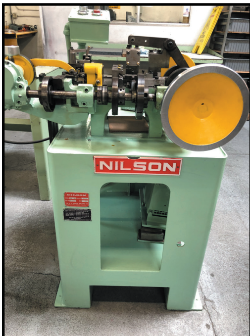
NILSON FOUR SLIDE MACHINE.