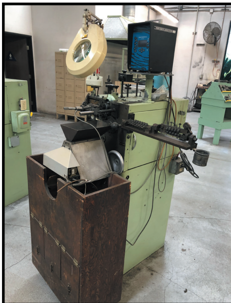
TORRINGTON PRECISION SPRING COILER WITH LARSON TIGER GAGE.