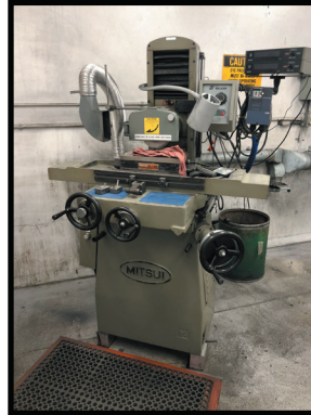
MITSUBI 6 X12 SURFACE GRINDER W/ ELECTRO MAGNETIC CHUCK, AND DRO.