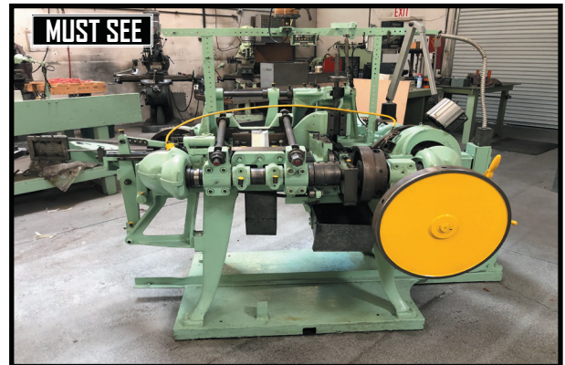
NILSON S-2-F FOUR SLIDE MACHINE.