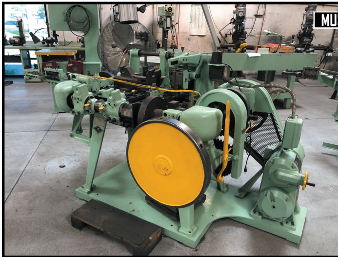
NILSON MODLE 2-F FOUR SLIDE MACHINE, 1/8" CAPACITY.