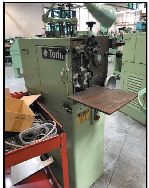
TORRINGTON PRECISION SPRING COILER