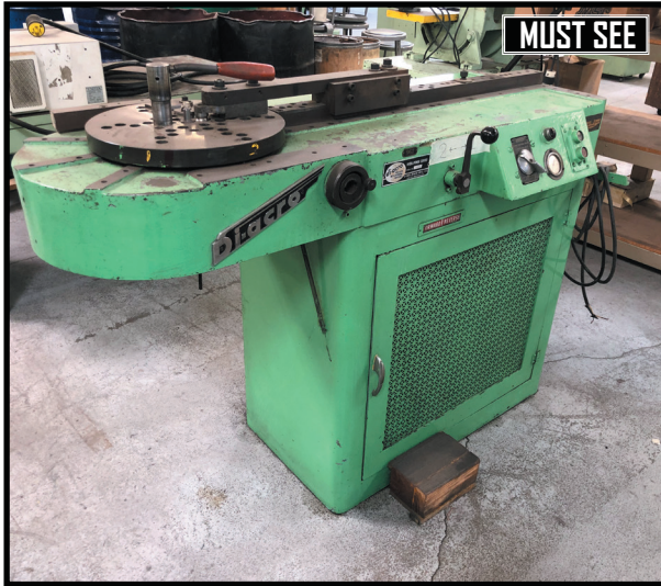
DI ACRO HYDRAULIC BENDER.