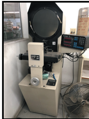
MICRO VU 14" OPTICAL COMPARATOR WITH DRO.