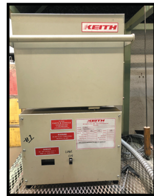
KEITH K-659-B KILN

ALL MACHINERY MOVERS MUST BE APPROVED BY THE SELLER PRIOR TO REMOVAL OF EQUIPMENT