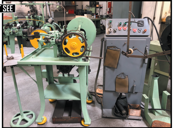
NILSON FOUR SLIDE MACHINE.