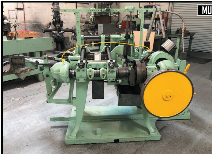
NILSON S-2-F FOUR SLIDE MACHINE.