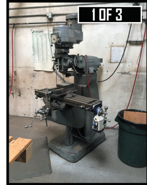
1 OF 3 BRIDGEPORT VERTICAL MILLING MACHINES