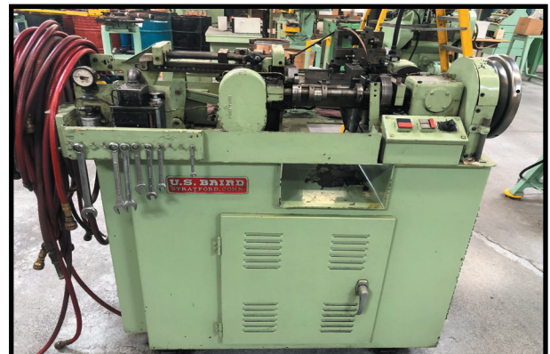
US BAIRD FOUR SLIDE MACHINE.

PRECISION SPRING MFG & FOUR SLIDE FACILITY