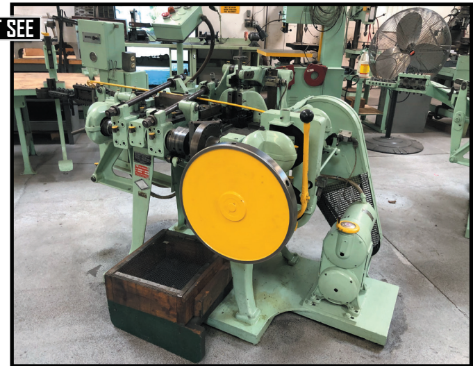
NILSON 0-F FOUR SLIDE MACHINE, 3/32" CAPACITY.