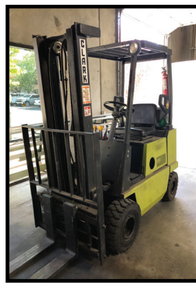
CLARK LPG FORKLIFT, 2 STAGE, SIDE SHIFT, SOLID TIRE