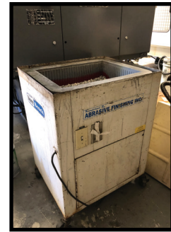
ABRASIVE FINISHING VIBRATORY TUMBLER.

ALL MACHINERY MOVERS MUST BE APPROVED BY THE SELLER PRIOR TO REMOVAL OF EQUIPMENT