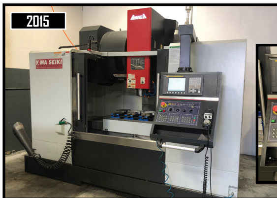
2015 YAMA SEIKI AWEA AV-1060 CNC VMC, W/ 15,000 RPM, CAT 40, 30 ATC, FANUC Oi-MF CONTROL, 2455 RUN TIME, 3 AXIS, (XYZ) 41.7" X 23.6" X 23.6", S/N 1060-15059.