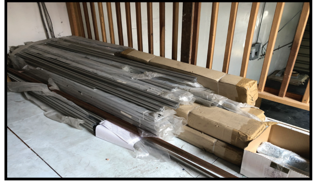
LARGE SELECTION OF ALUMINIUM EXTRUSION MATERIAL