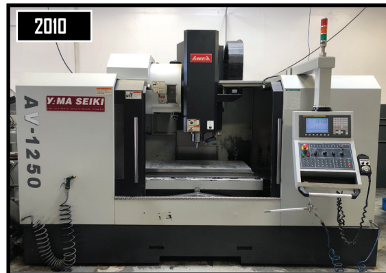
2010 YAMA SEIKI AWEA AV-1250 CNC VMC, W/ 10,000 RPM, CAT 40, 24 ATC, FANUC Oi-MD CONTROL, (XYZ) 49.2" X 24.4" X 24.4", S/N 1250-10006.