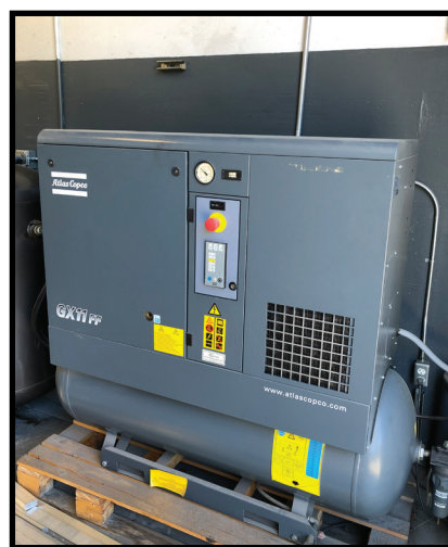
ATLAS COPCO GX11FF 15 HP ROTARY AIR COMPRESSOR.