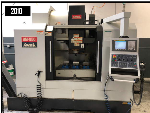
2010 AWEA BM-850 CNC VMC, W/ 8000 RPM, 2 SPEED GEAR BOX, 36 ATC, CAT 40, CHIP CONVEYOR, FANUC Oi-MC CONTROL, (XYZ) 33.6" X 23.6" X 23.6", S/N 850-9006.

2006 YCM XV-1020A CNC VMC, W/ 10,000 RPM, 24 ATC, CAT 40, FANUC MXP-200iCONTROL, (XYZ) 40.0" X 20.4" X 21.2", S/N 1194.