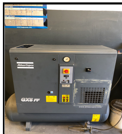
ATLAS COPCO GX5 FF5 HP ROTARY AIR COMPRESSOR.