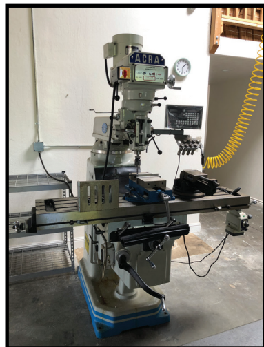
ACRA AM3VVV, VERTICAL MILL, P.F. TABLE, DRO, VAR