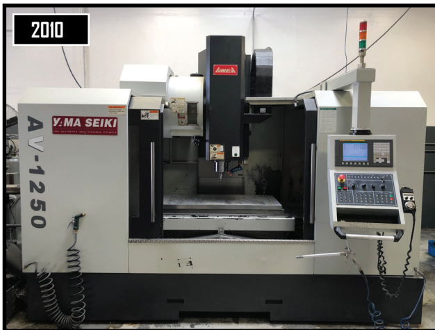
2010 YAMA SEIKI AWEA AV-1250 CNC VMC, W/ 10,000 RPM, CAT 40, 24 ATC, FANUC Oi-MD CONTROL, (XYZ) 49.2" X 24.4" X 24.4", S/N 1250-10006.