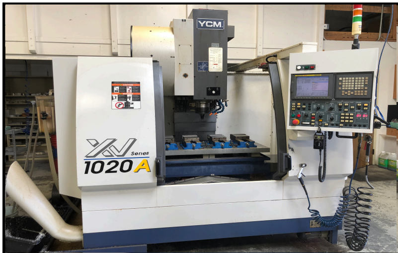
2006 YCM XV-1020A CNC VMC, W/ 10,000 RPM, 24 ATC, CAT 40, FANUC MXP-200i, CONTROL, (XYZ) 40.0" X 20.4" X 21.2", S/N 1240.