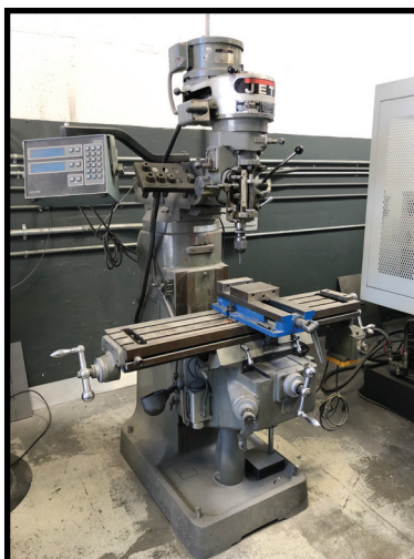
JET VERTICAL MILL, P.F. TABLE, ACCURITE DRO, 9X42 TABLE.