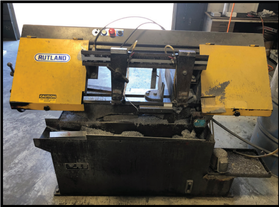
RUTLAND 9" HORIZONTAL BAND SAW.