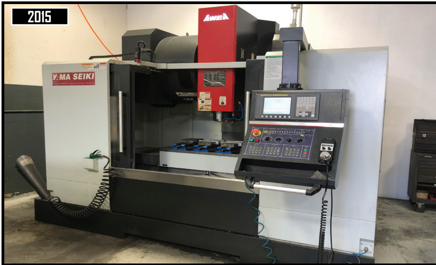
2015 YAMA SEIKI AWEA AV-1060 CNC VMC, W/ 15,000 RPM, CAT 40, 30 ATC, FANUC Oi-MF CONTROL, 2455 RUN TIME, 3 AXIS, (XYZ) 41.7" X 23.6" X 23.6", S/N 1060-15059.