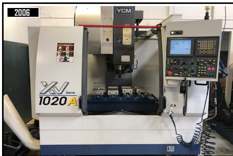
2006 YCM XV-1020A CNC VMC, W/ 10,000 RPM, 24 ATC, CAT 40, FANUC MXP-200i CONTROL, (XYZ) 40.0" X 20.4" X 21.2", S/N 1194.