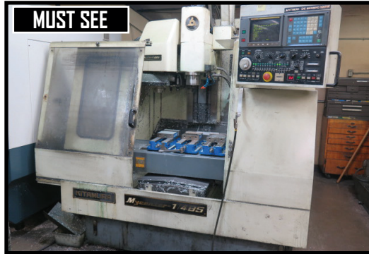
MUST SEE Kitamura Mycenter-1/485 CNC Vertical Machining Center w/ Yasnac Controls, 20-ATC, BT-35