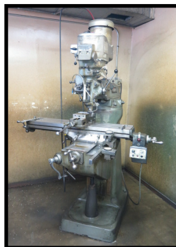
Bridgeport Series 1 - 2Hp Vertical Mill w/ 60-4200 RPM, Power Feed ***2-AVAILABLE***