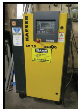
Kaiser SM 7.5 7.5Hp Rotary Air Compressor w/ Kaiser Sigma Controls