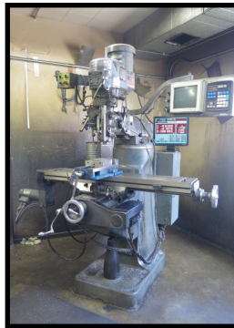
Bridgeport / EZ Trak 2-Axis CNC Vertical Mill w/ EZ Trak SX Controls, 60-4200 Dial RPM, 9" x 48" Table ***2-AVAILABLE***