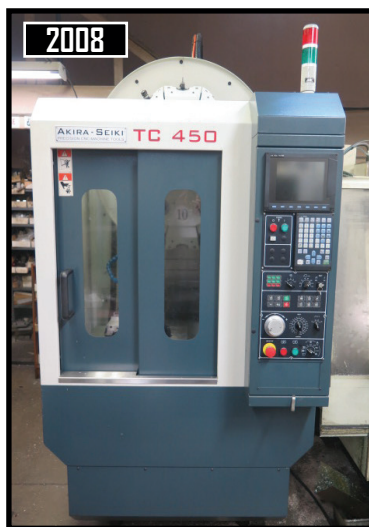
2008 Akira Seiki TC450 CNC Drilling and Tapping Center w/ Akira Mi645 Controls, 12-Station ATC, BT-30 Spindles