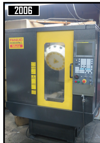
2006 Fanuc Robodrill MATE CNC Drilling and Tapping Center w/ Fanuc 0i-MC Controls, 14-ATC, BT-30 Spindles