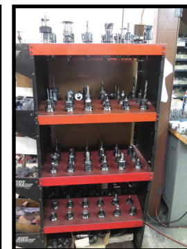
PARTIAL VIEW OF TOOLING