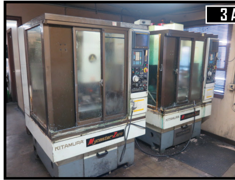
3 AVAILABLE Kitamura Mycenter-Zero CNC Vertical Machining Center w/ Fanuc 0-Mate M Controls, 16-ATC, BT-30