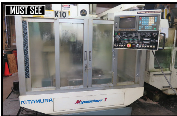
Kitamura Mycenter-1 CNC Vertical Machining Center w/ Fanuc 0-M Controls, 26-ATC, BT-35, 13,000 RPM 7654 Kitamura Mycenter-0 CNC Vertical Machining Center w/ Yasnac