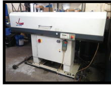
LNS Eco-Load Automatic Bar Loader/Feeder