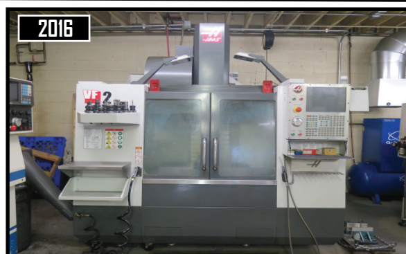
Haas VF-2 4-Axis CNC VMC w/ 24-Station Side Mount ATC, CAT-40, 8100 RPM, High Speed Machining, High Speed Tool Changer, Media Display, Rigid Tapping, 1GB Expanded Memory, Wireless Networking, Compensation Tables, Chip Auger, 3161 ON Hours, 1495 Start Hours, 1198 Cut Hours