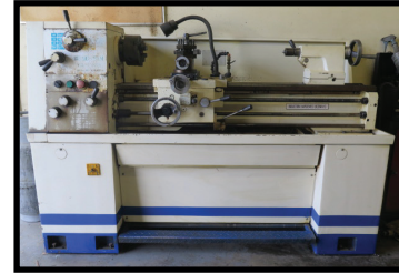
2001 Birmingham YCL-1440GH 14" x 40" Gear-Gap Lathe w/ 45-1800 RPM, Threading, Tailstock, Steady and Follow Rests, Indexing Tool Post