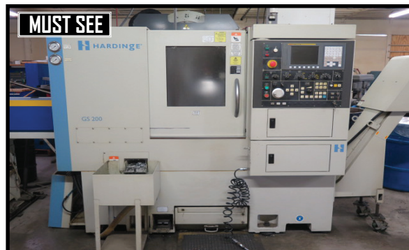
2012 Hardinge GS200 CNC Turning Center w/ Fanuc Series 0i-TD Controls, 12-Station Turret, 5000 PM, Tailstock, Parts Catcher, 8" 3-Jaw Power Chuck, S-20 Collet Pad Nose, Mist-Away Mist Collector, Chip Conveyor, (2014) Integrity SB-565 Automatic Bar Loader/Feeder s/n SB201403