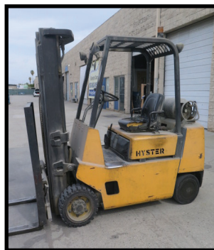
Hyster S50XL 5000 Lb Cap LPG Forklift w/ 3-Stage Mast, 187" Lift Height, Motrol Trans, Side Shift, Solid Tires