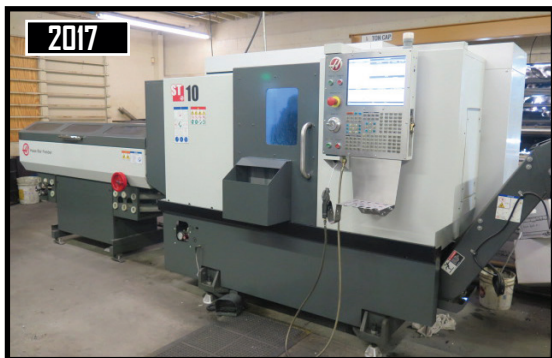
Haas SL-10 CNC Turning Center w/ 12-Station Turret, VDI Holders, 6000 RPM, Rigid Tapping, M19 Spindle Orientation, 1GB Expanded Memory, Media Display, Compensation Tables, Auto-Door, 8" 3-Jaw Power Chuck, 16C Nose, Chip Conveyor, 4162 ON Hours, 2481 Start Hours, 1309 Cut Hours