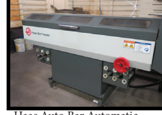
Haas Auto Bar Automatic Bar Loader/Feeder