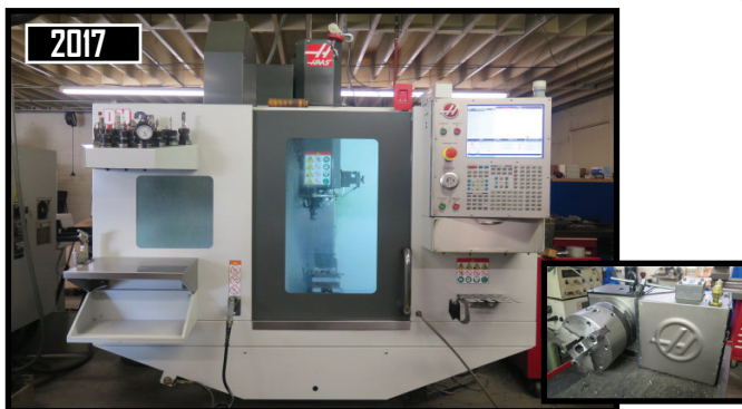
Haas DM-2 4-Axis CNC VMC w/ 18-Station Side Mount ATC, CAT-40, 15,000 RPM, 4 th Axis and Indexer Drive Boards, Media Display, 1GB Expanded Memory, 2400 IPM, Rigid Tapping, Compensation Tables, USB, Dual Chip Augers, 1277 ON Hours