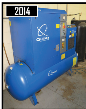
2014 Quincy QGS-10 D CSA/UL 10Hp Rotary Air Compressor w/ Built-In Refrigerated Air Dryer, 120 Gallon Tank, 9701 Hours