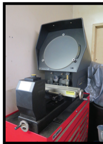
Suburban "Master View" MV-14 14" Optical Comparator w/ Mitutoyo Digital Scales, Surface and Profile Illumination