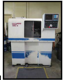
AmeriTech / Leadwell SBC-6 CNC Cross Slide Lathe w/ HUST Controls, 5C, Tooling