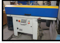
(2014) Integrity SB-565 Automatic Bar Loader/Feeder s/n SB201403